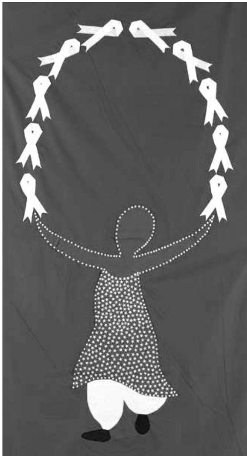
Stories of Mothers Lost in Childbirth, fabric art, White Ribbon Alliance, Pakistan, 2010.

Jeremiah 20:7-13 O LORD, you have enticed me, and I was enticed; you have overpowered me, and you have prevailed. I have become a laughingstock all day long; everyone mocks me. For whenever I speak, I must cry out, I must shout, "Violence and destruction!" For the word of the LORD has become for me a reproach and derision all day long. If I say, "I will not mention him, or speak any more in his name," then within me there is something like a burning fire shut up in my bones; I am weary with holding it in, and I cannot. For I hear many whispering: "Terror is all around! Denounce him! Let us denounce him!" All my close friends are watching for me to stumble. "Perhaps he can be enticed, and we can prevail against him, and take our revenge on him." But the LORD is with me like a dread warrior; therefore my persecutors will stumble, and they will not prevail. They will be greatly shamed, for they will not succeed. Their eternal dishonor will never be forgotten. O LORD of hosts, you test the righteous, you see the heart and the