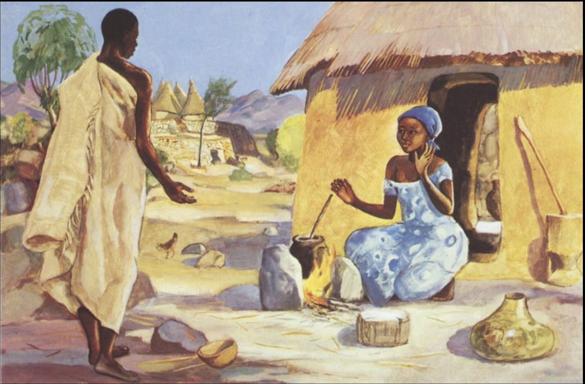
Annunciation -- JESUS MAFA, Cameroon