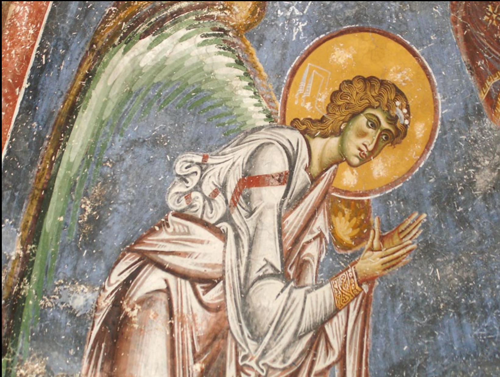
Gabriel -- St. George Church, Kurbinovo, Macedonia