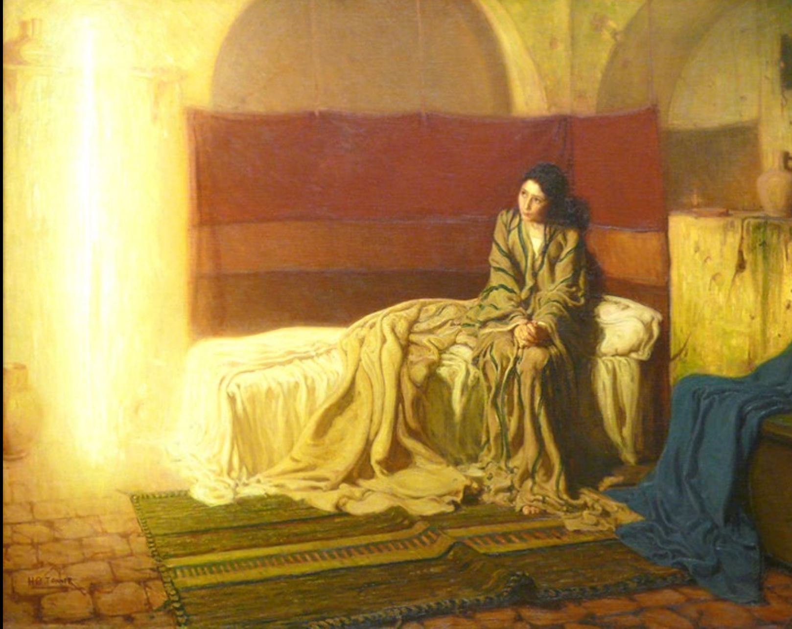
Annunciation -- Henry Ossawa Tanner, Philadelphia Museum of Art, Philadelphia, PA