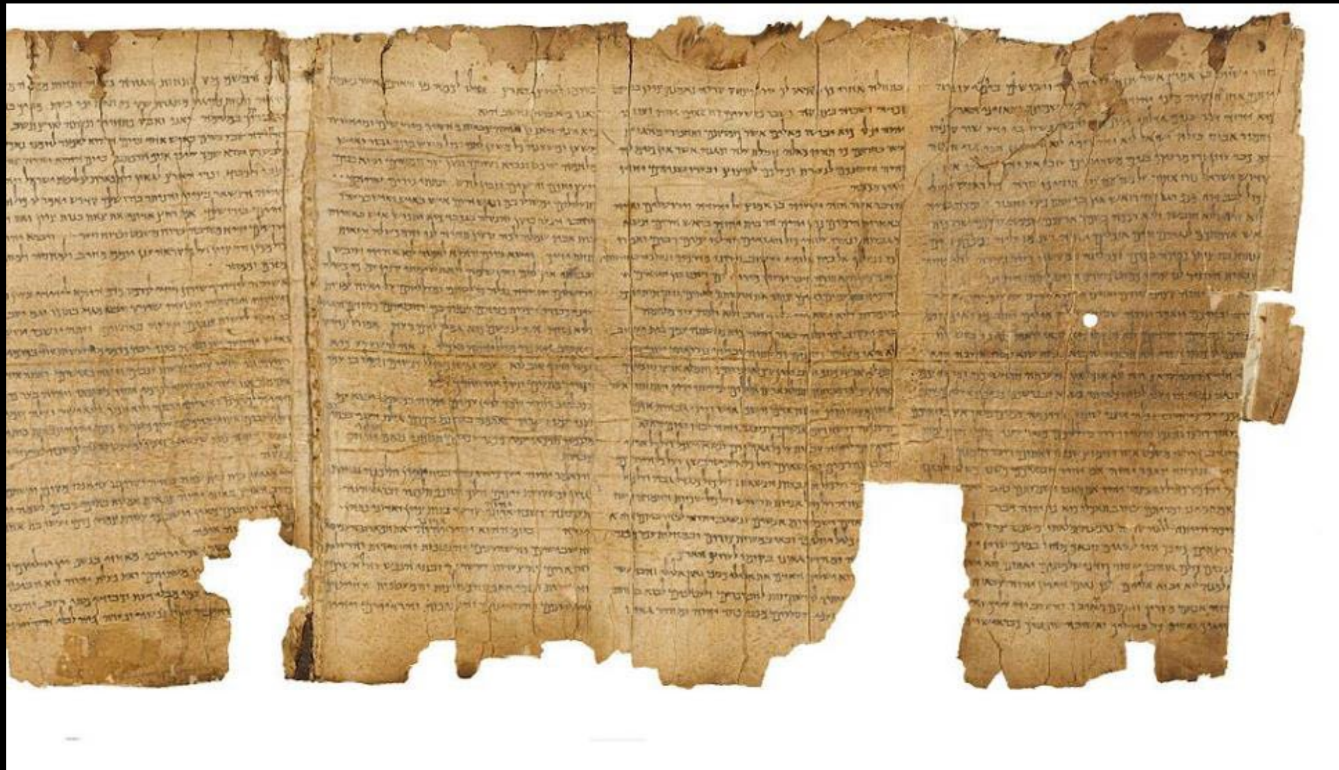
Great Isaiah Scroll -- Qumran, Israel Museum, Jerusalem, Israel