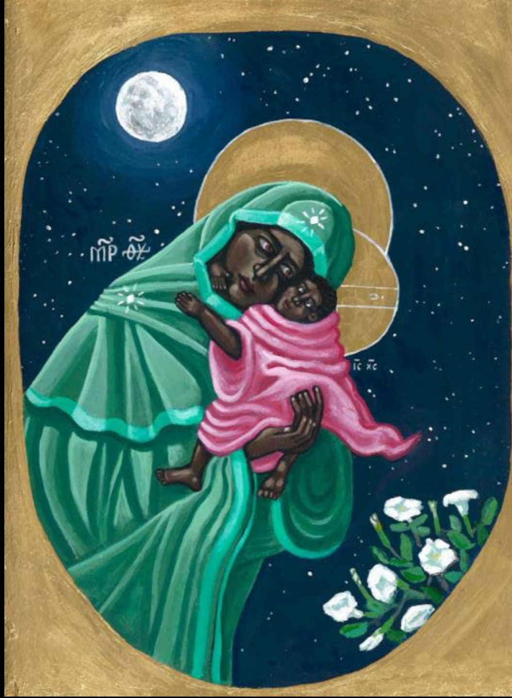
Madonna and Child