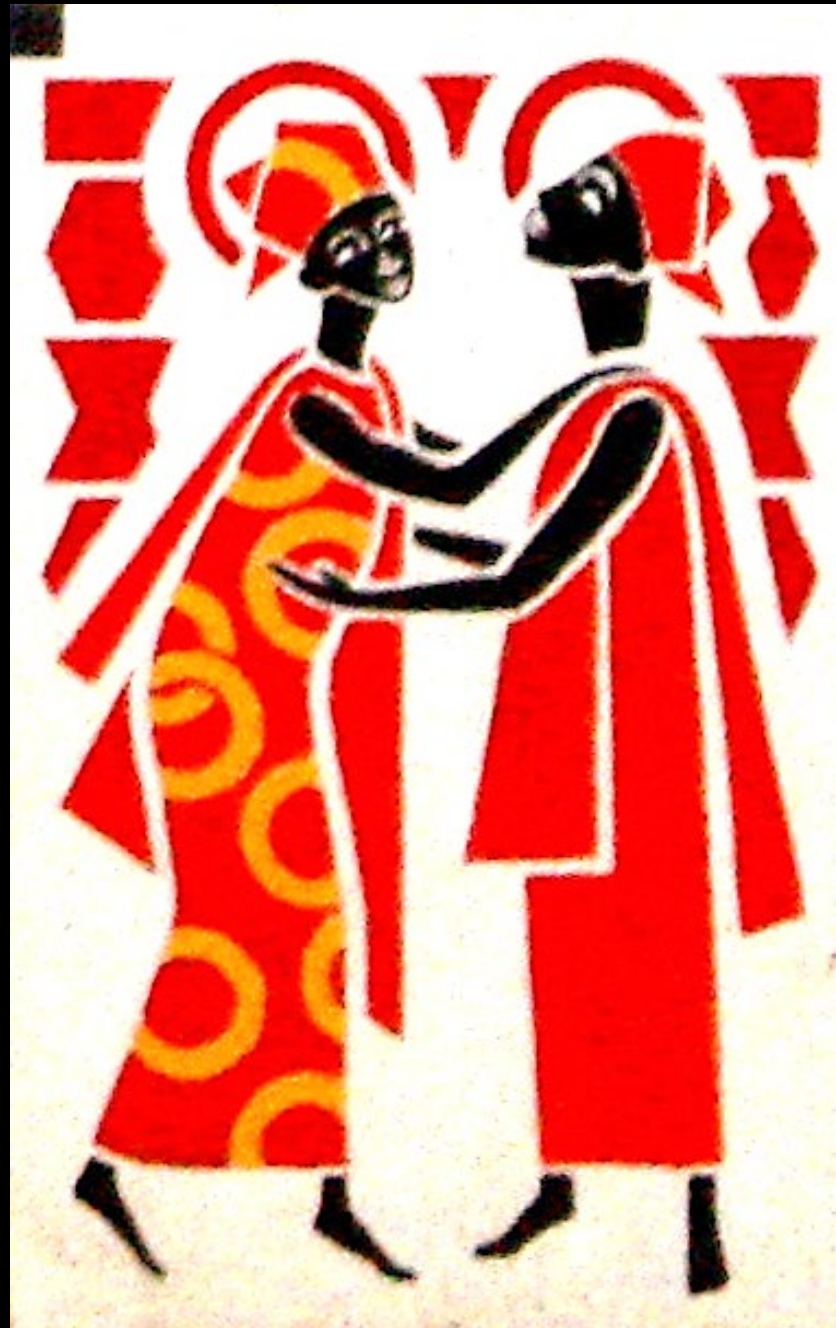
Visit of Mary to Elizabeth Keur Moussa Abbey Senegal