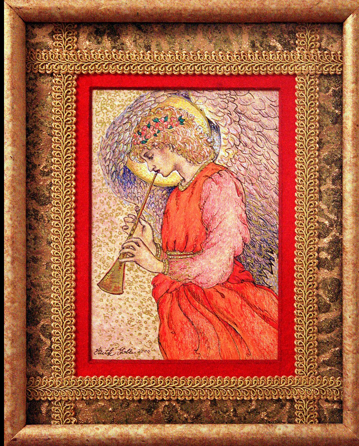
Angel Playing a Flageolet