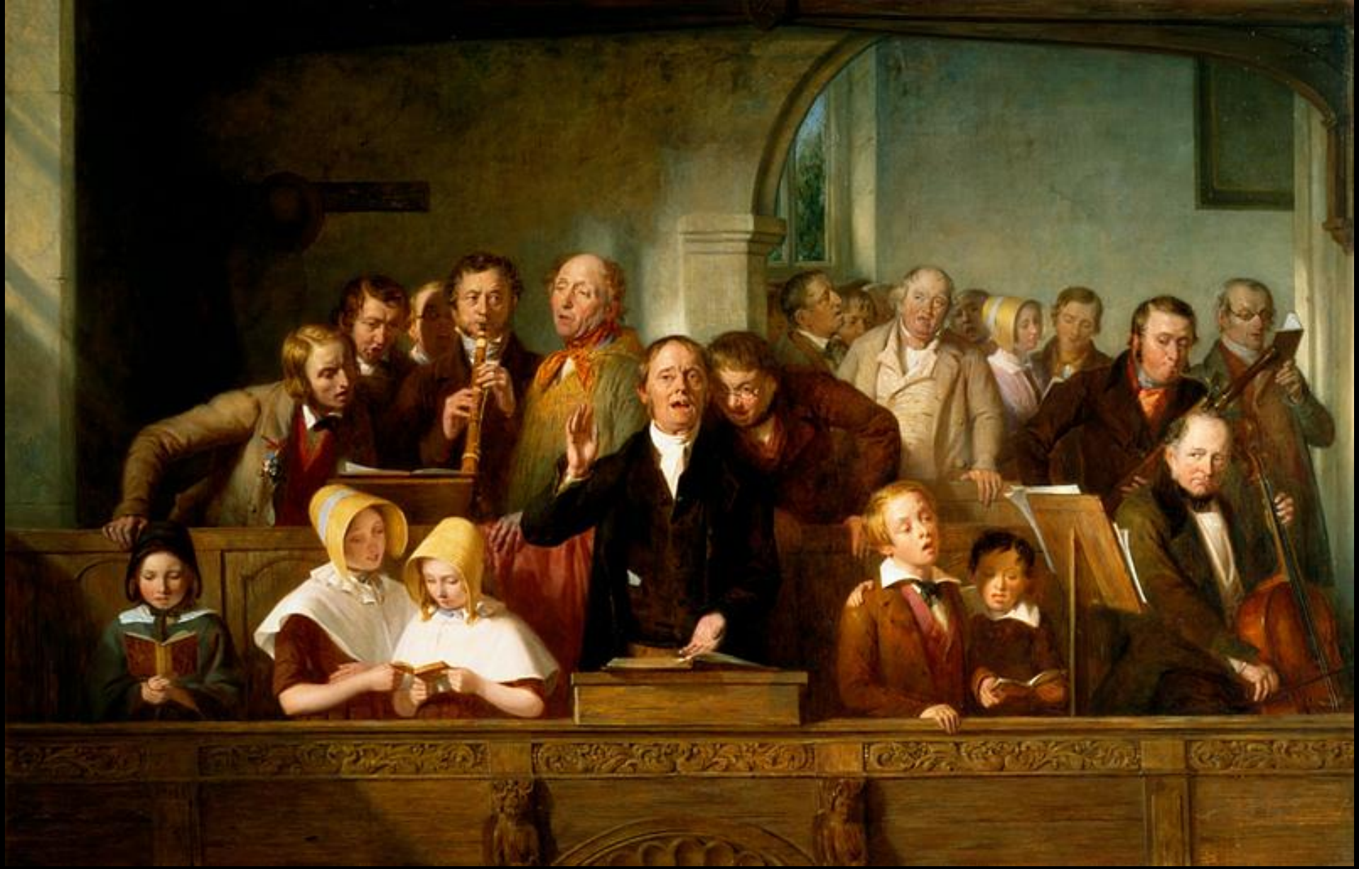
A Village Choir -- Thomas Webster, Victoria and Albert Museum, London