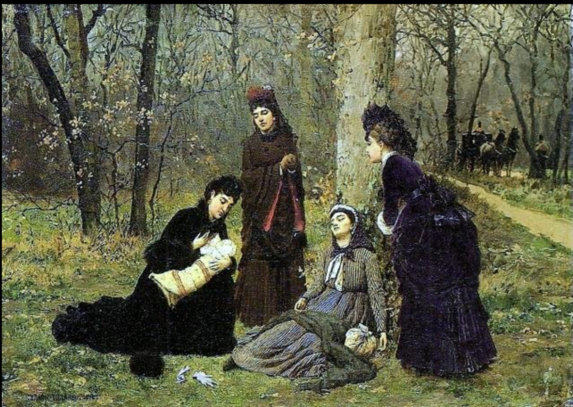
Charity -- Marie-Francois Firmin-Girard, Museu Nacional de Belas Artes, Rio de Janeiro, Brazil