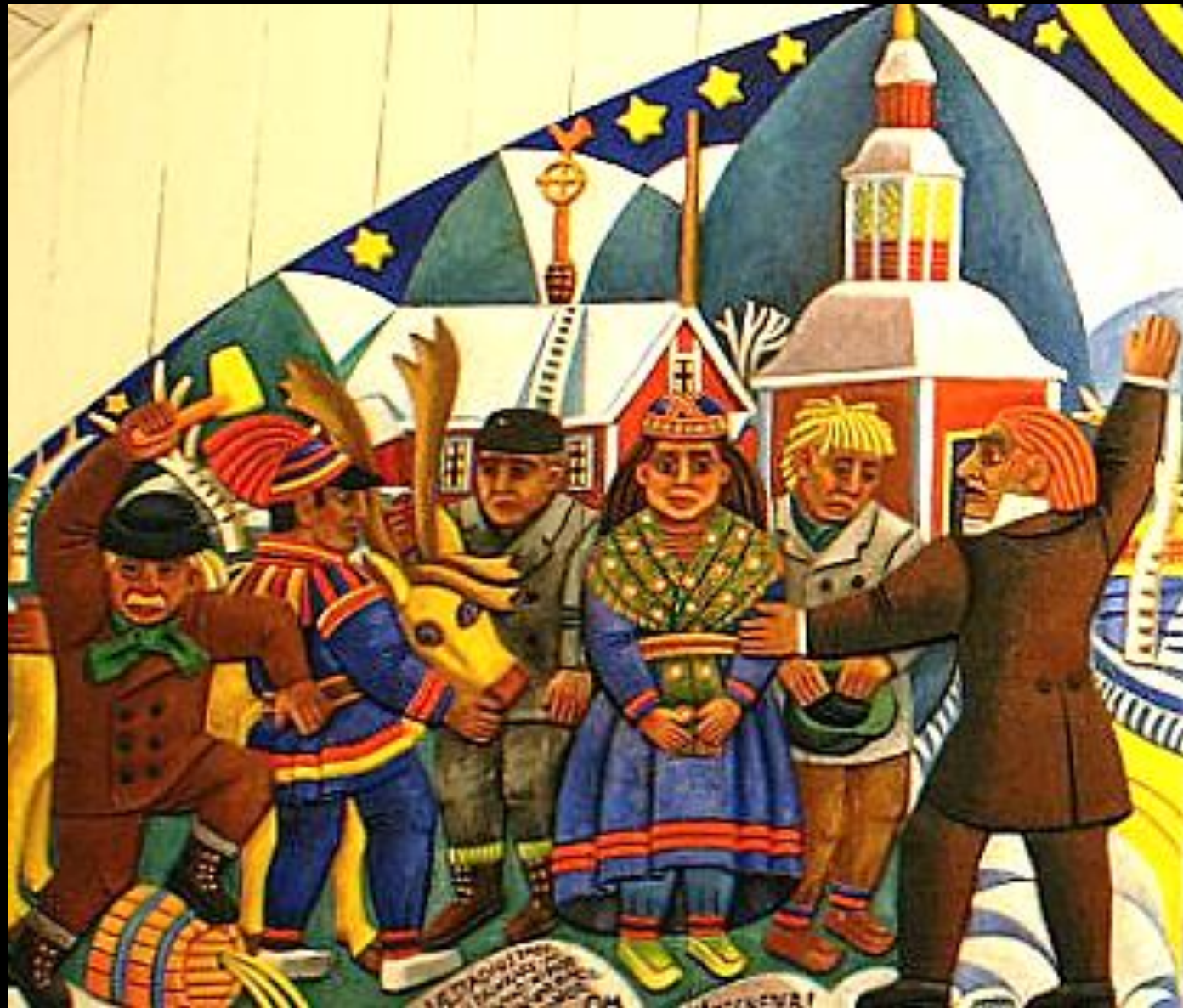
Repentance Altarpiece -- Bror Hjorth, Jukkasjarvi Church, Jukkasjarvi, Sweden