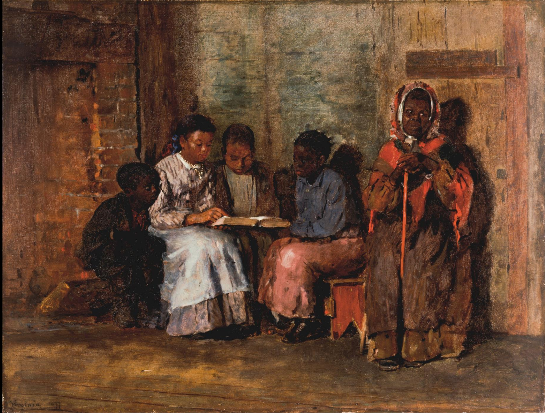
Sunday Morning in Virginia -- Winslow Homer, Cincinnati Art Museum