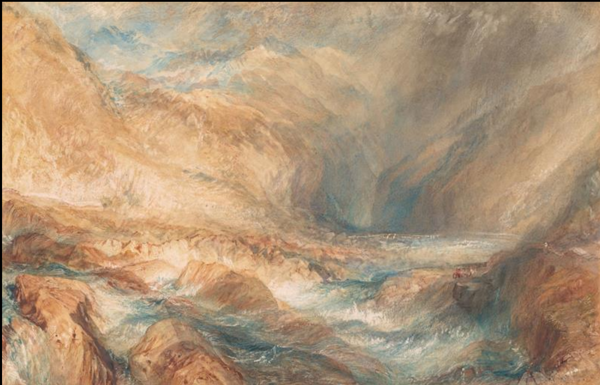
Pass at Faido -- J. M. W. Turner, Morgan Library, New York City