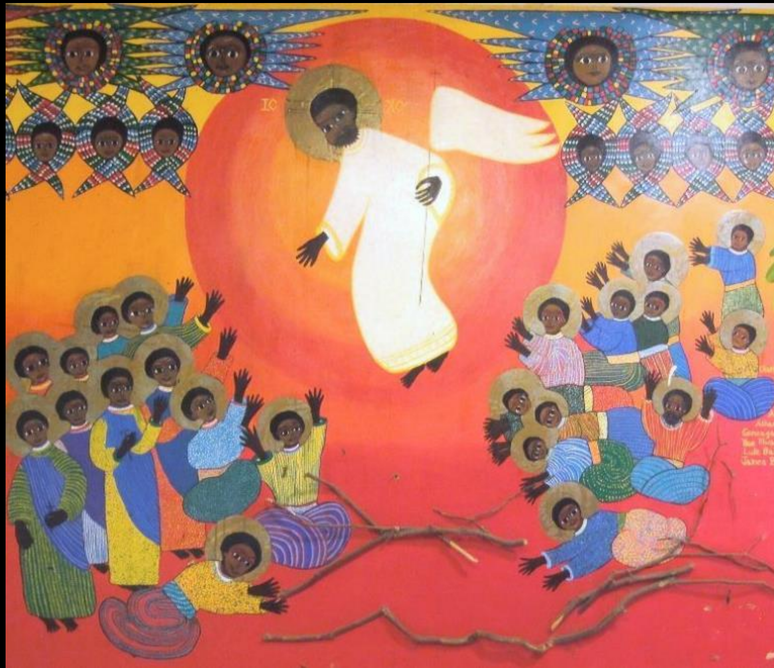
Emmaus House – Martyrs of Uganda, Kamapala, Uganda