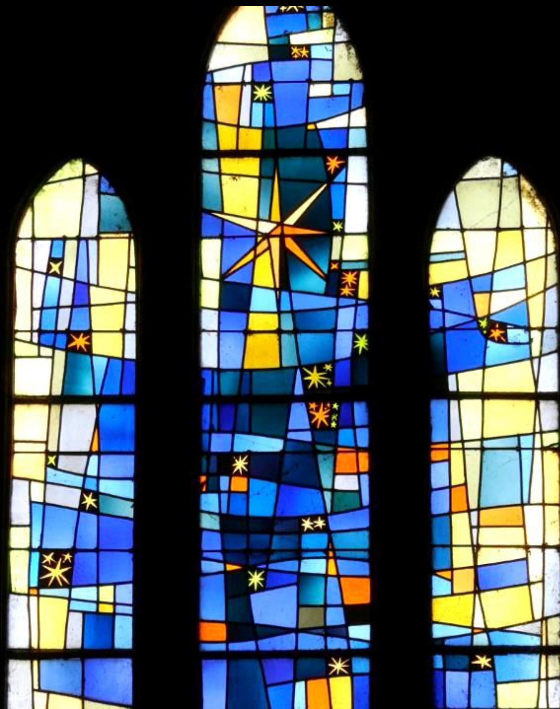
Heavenly Star Chapelle Notre Dame de Grace Villeneuve-sur-Lot, France