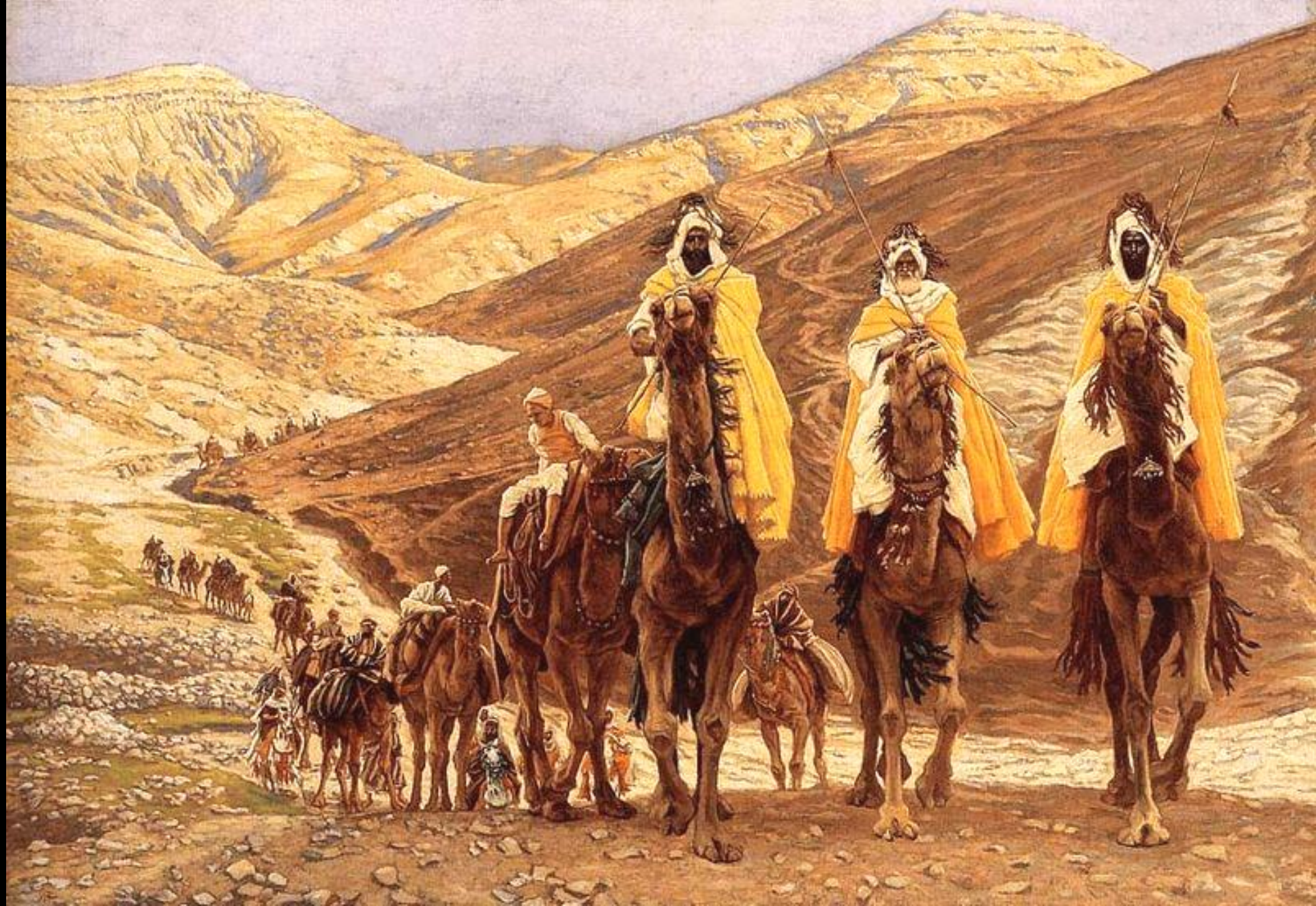
Journey of the Magi -- James Tissot, Minneapolis Institute of Art