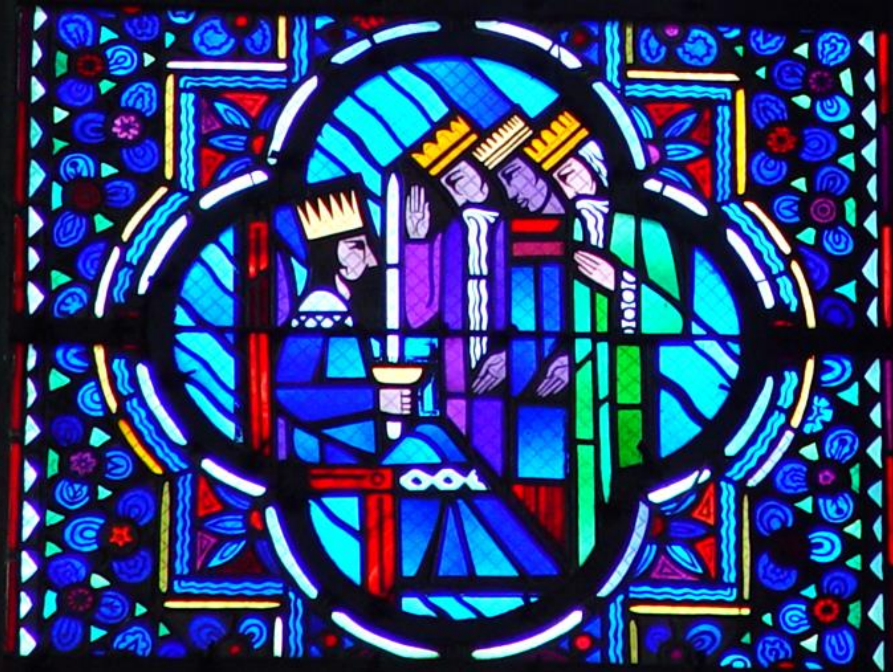
Wise Men Visit Herod -- Le Breton/Gaudin, Amiens Cathedral