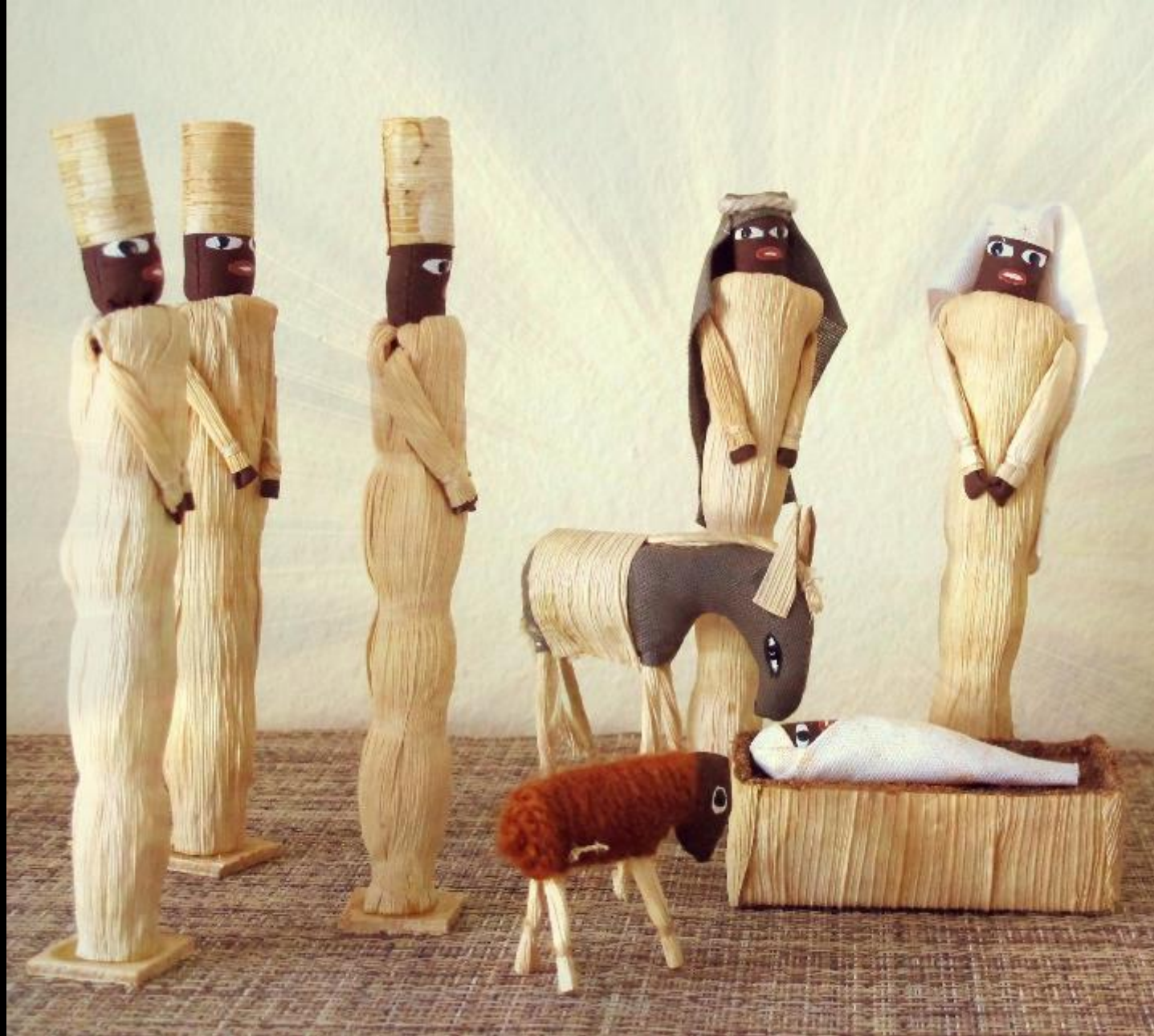
Krismasi Njema! -- Kenyan Nativity