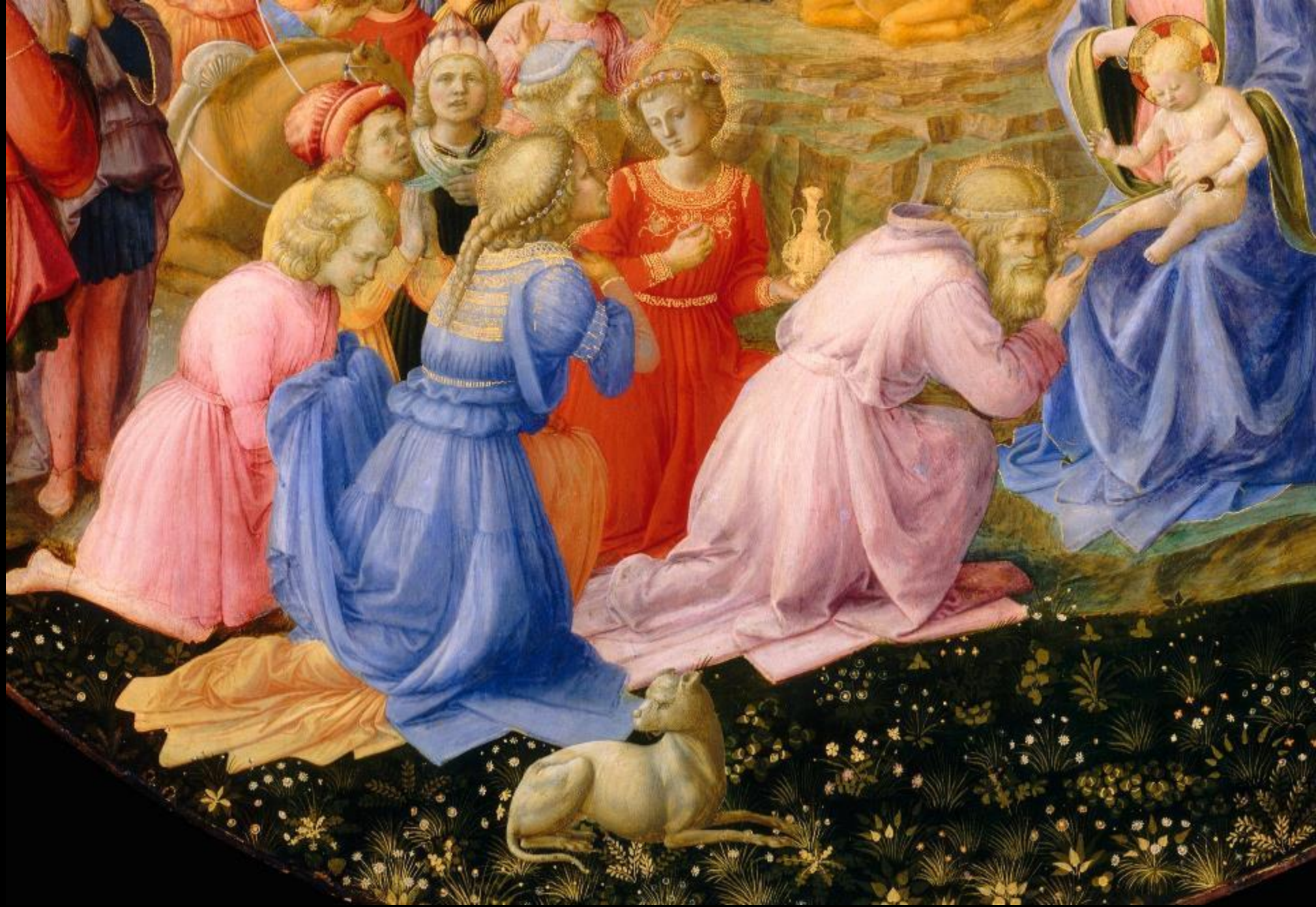
Adoration of the Magi -- Fra Angelico and Filippo Lippi, National Gallery of Art, Washington, DC