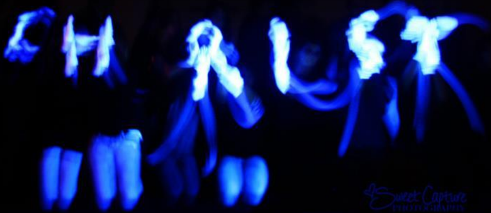
Light of the World -- Presentation by church youth with gloves in dark space