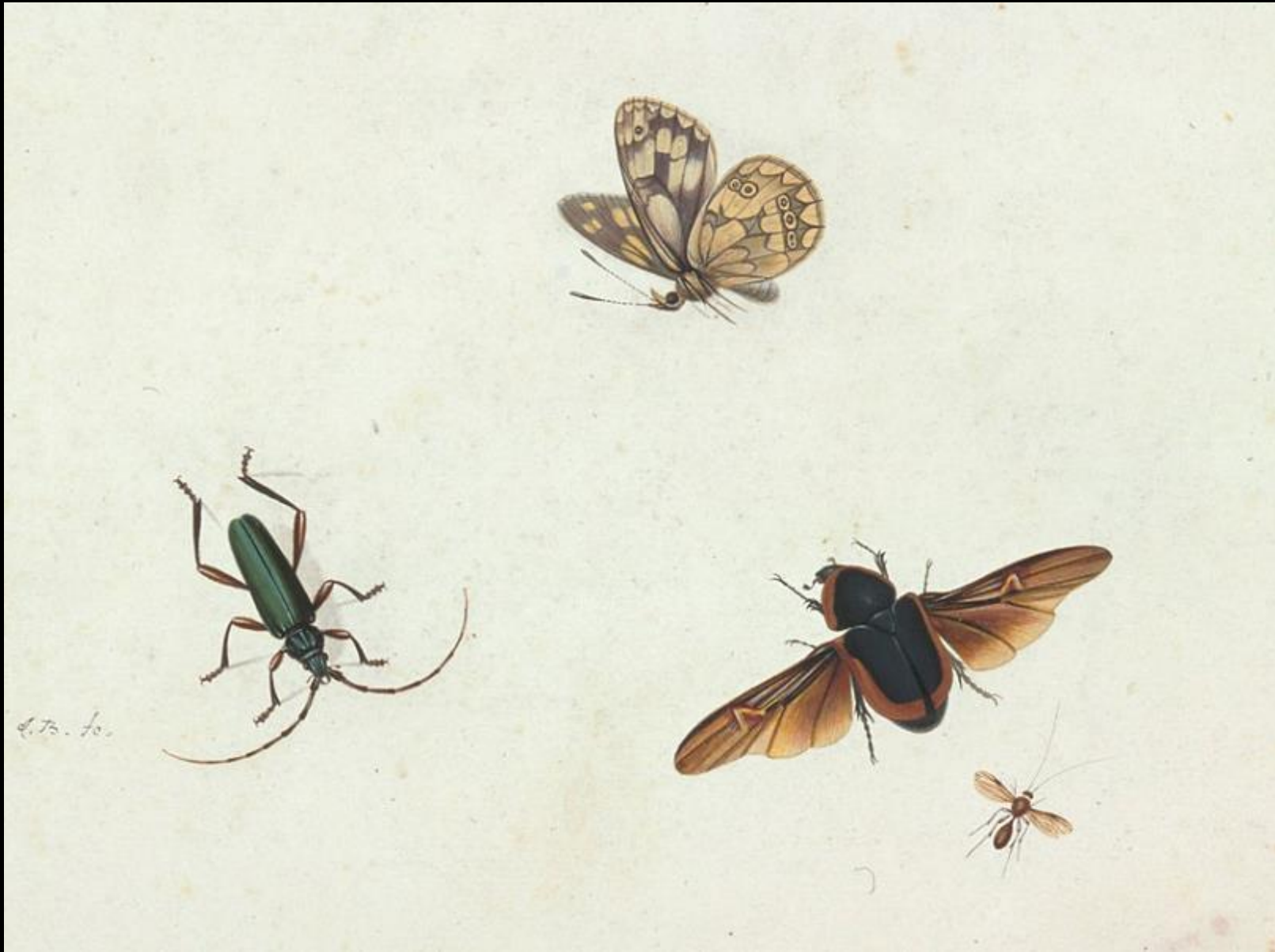
Four Insects -- Johannes Bronkhorst, Centraal Museum, Utrecht, Netherlands