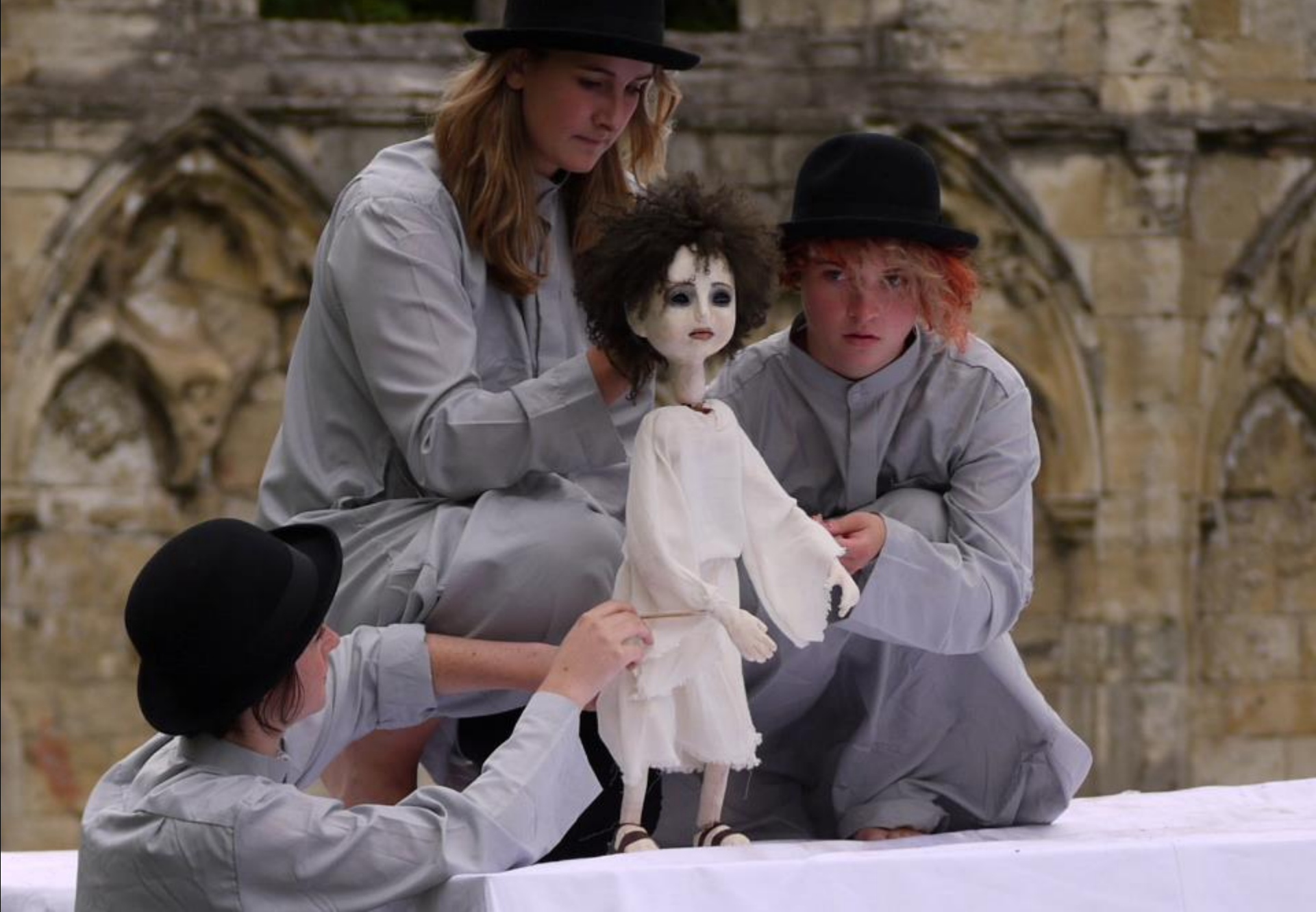
Massacre of the Innocents, a Mystery Play -- York Cathedral, York, England