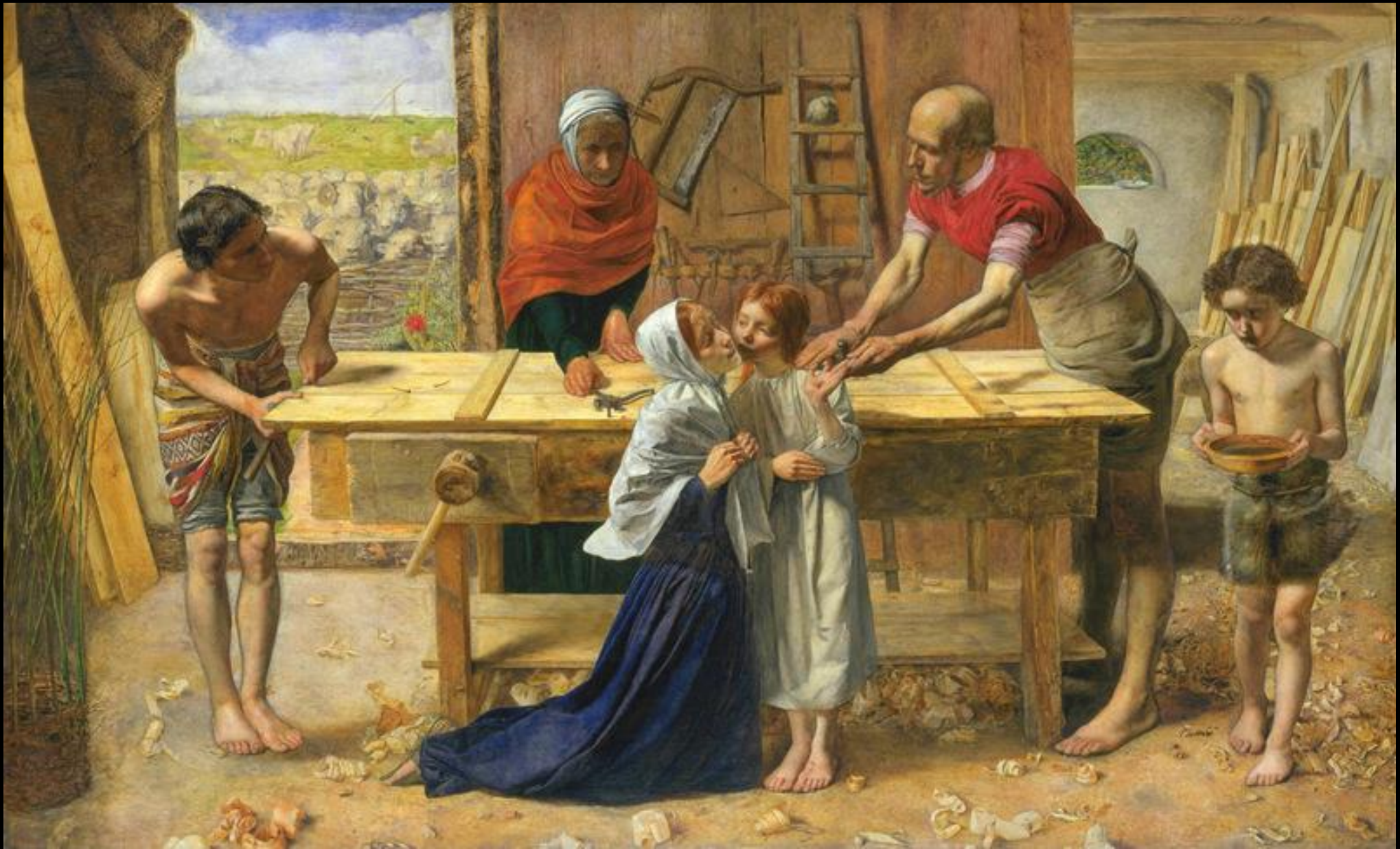
Christ in the House of His Parents -- John Everett Millais, Tate Britain, London