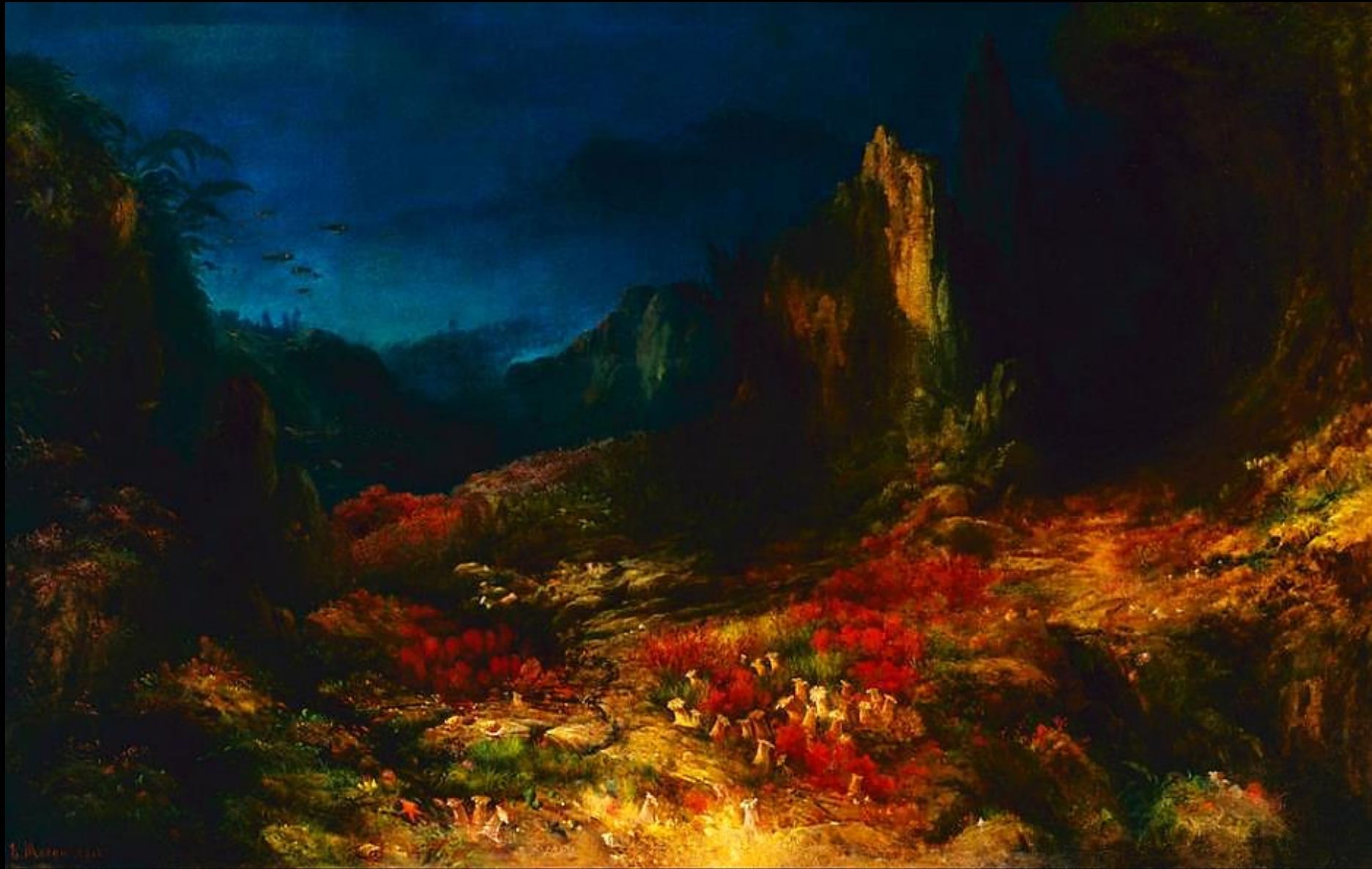
The Valley in the Sea (1862) -- Edward Moran, Indianapolis Museum of Art