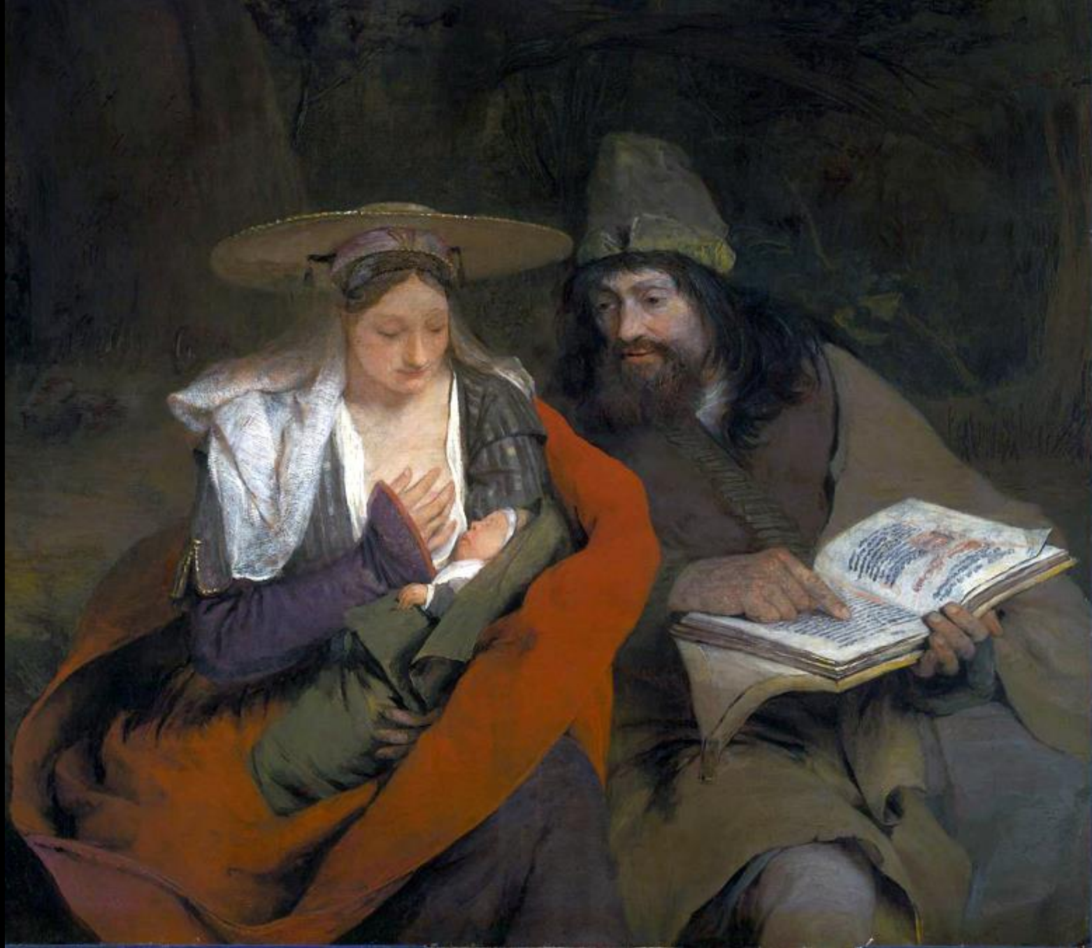
Rest on the Flight into Egypt -- Aert de Gelder, MFA, Boston