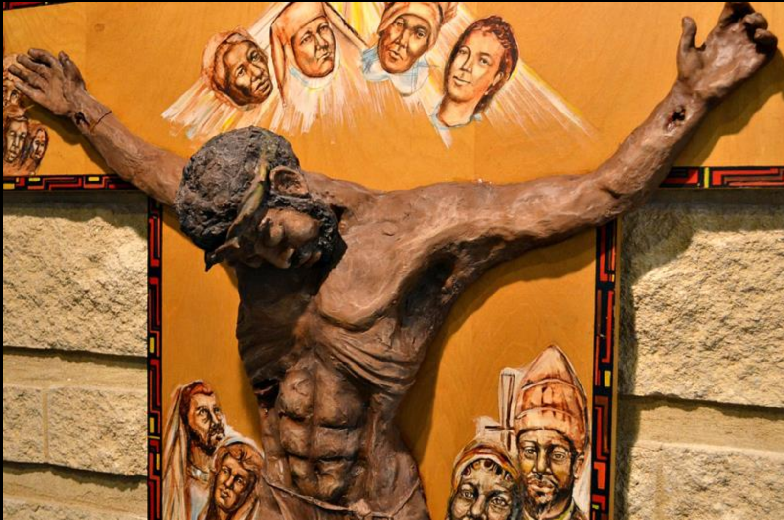
Crucifixion -- St. Benedict the African Church, Chicago, IL