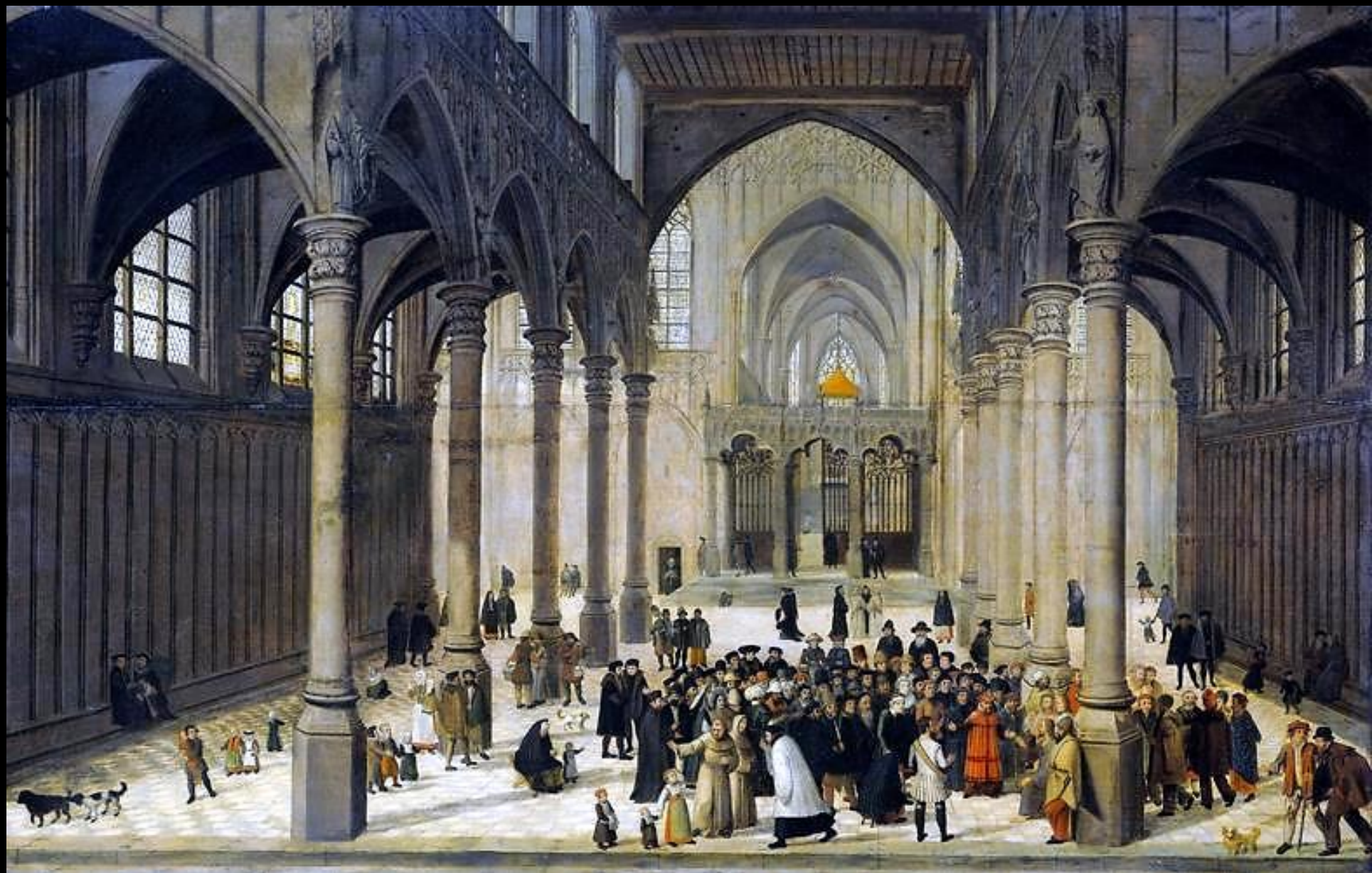
Christ Preaching to a Crowd -- Cornelis van Dalem and Jan van Wechelen, Rijksmuseum, Amsterdam