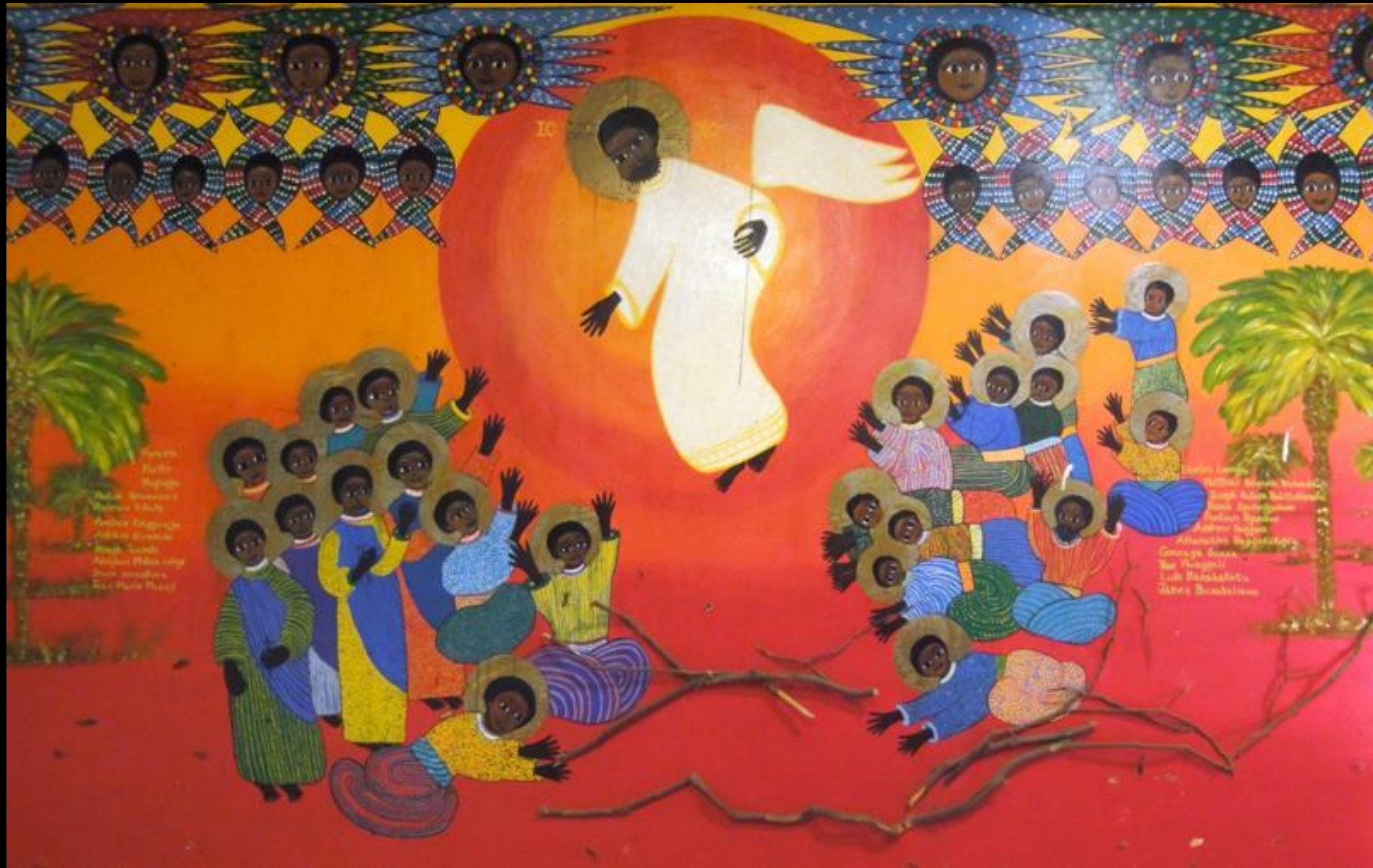
Martyrs of Uganda -- Emmaus House, Kampala, Uganda