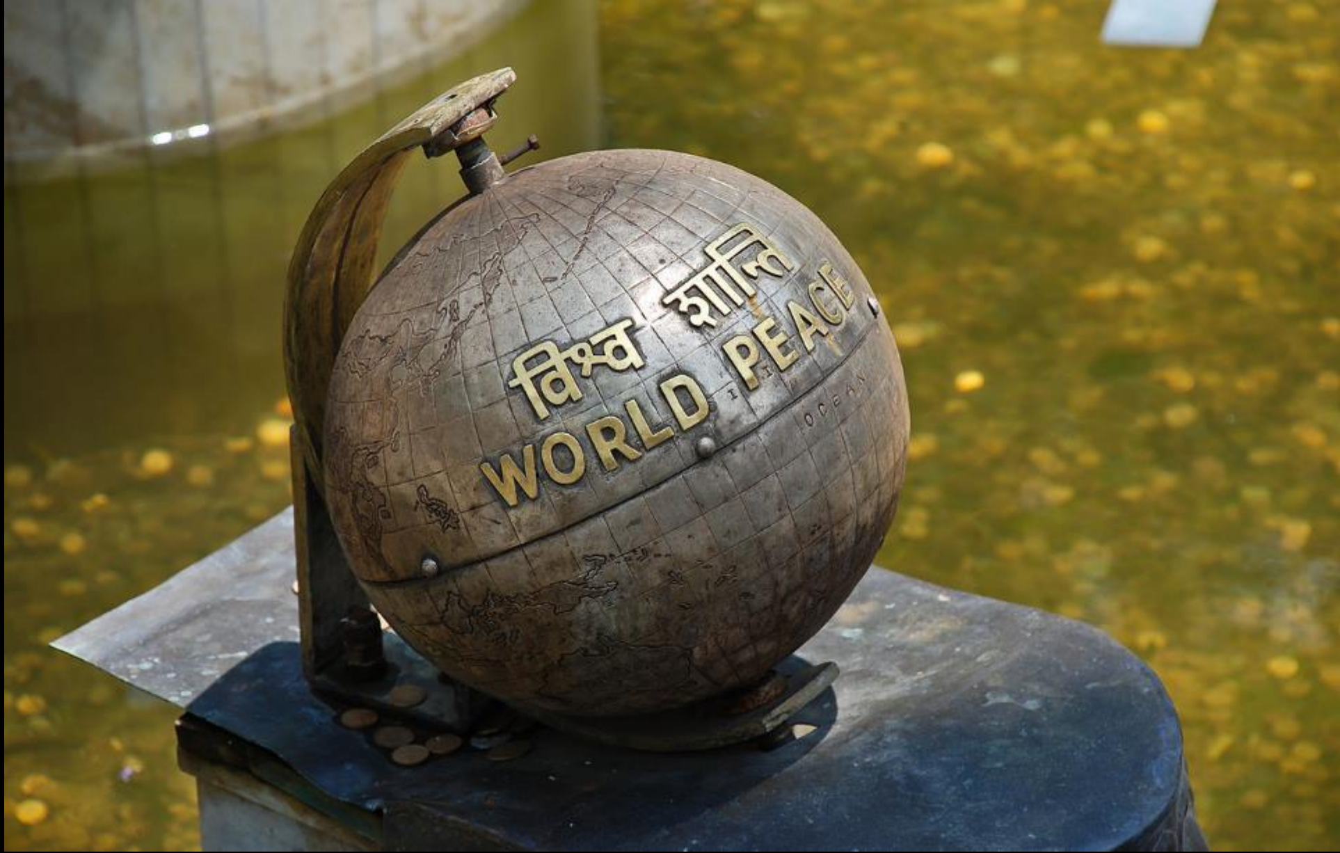
World Peace Monument -- Swayambhunath Temple Garden, Kathmandu, Nepal