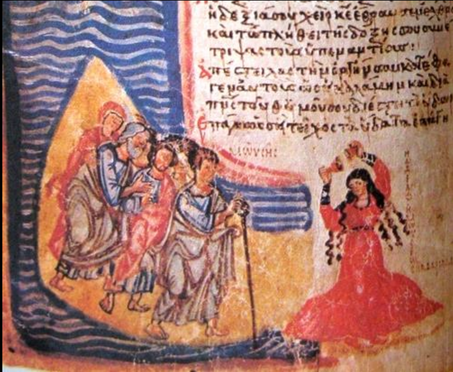
Dance of Miriam upon Crossing the Red Sea -- Chludov Psalter, State Hist. Museum, Moscow