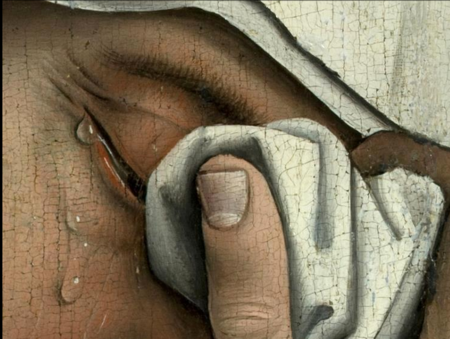
Mary's Tears, detail from Descent from the Cross-- Rogier van der Weyden, Prado, Madrid