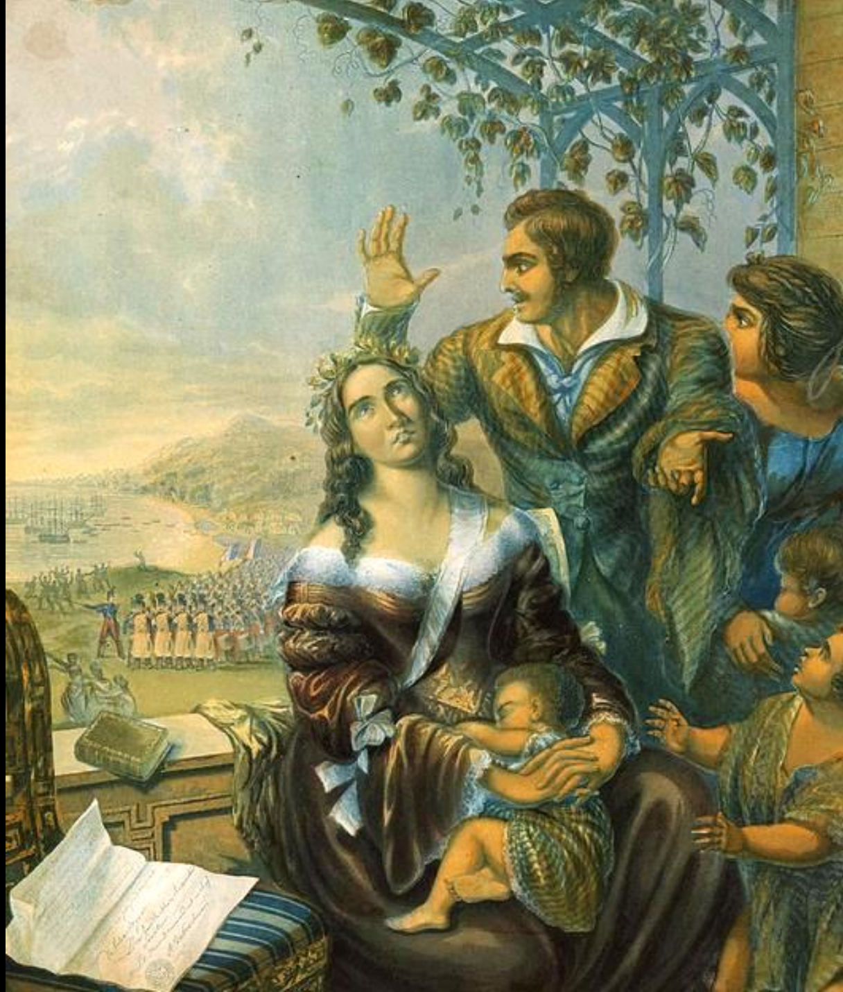
Pomare, Queen of Tahiti, Persecuted for her Faith