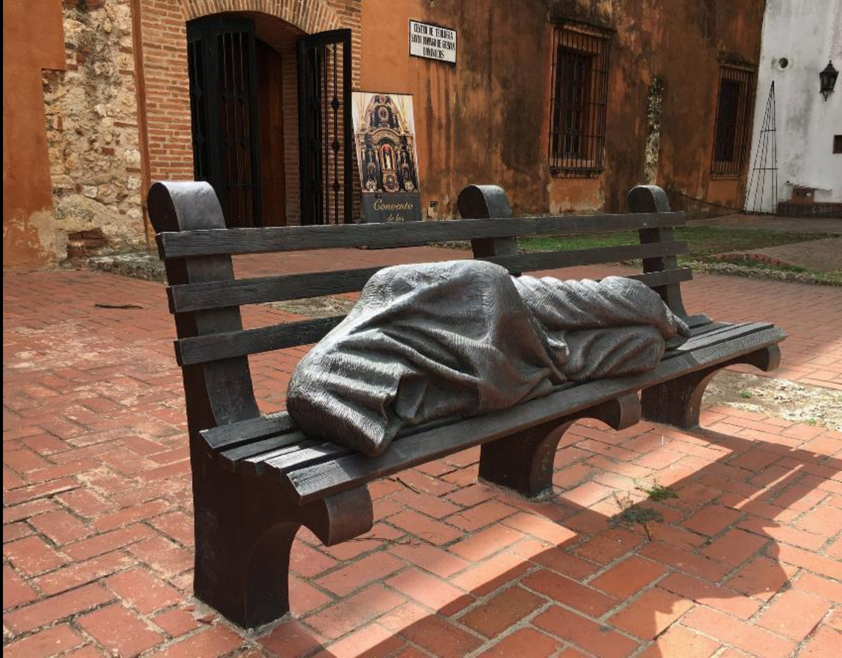
Homeless Jesus -- Timothy Schmalz, Dominican Convent, Santo Domingo, Dominican Republic