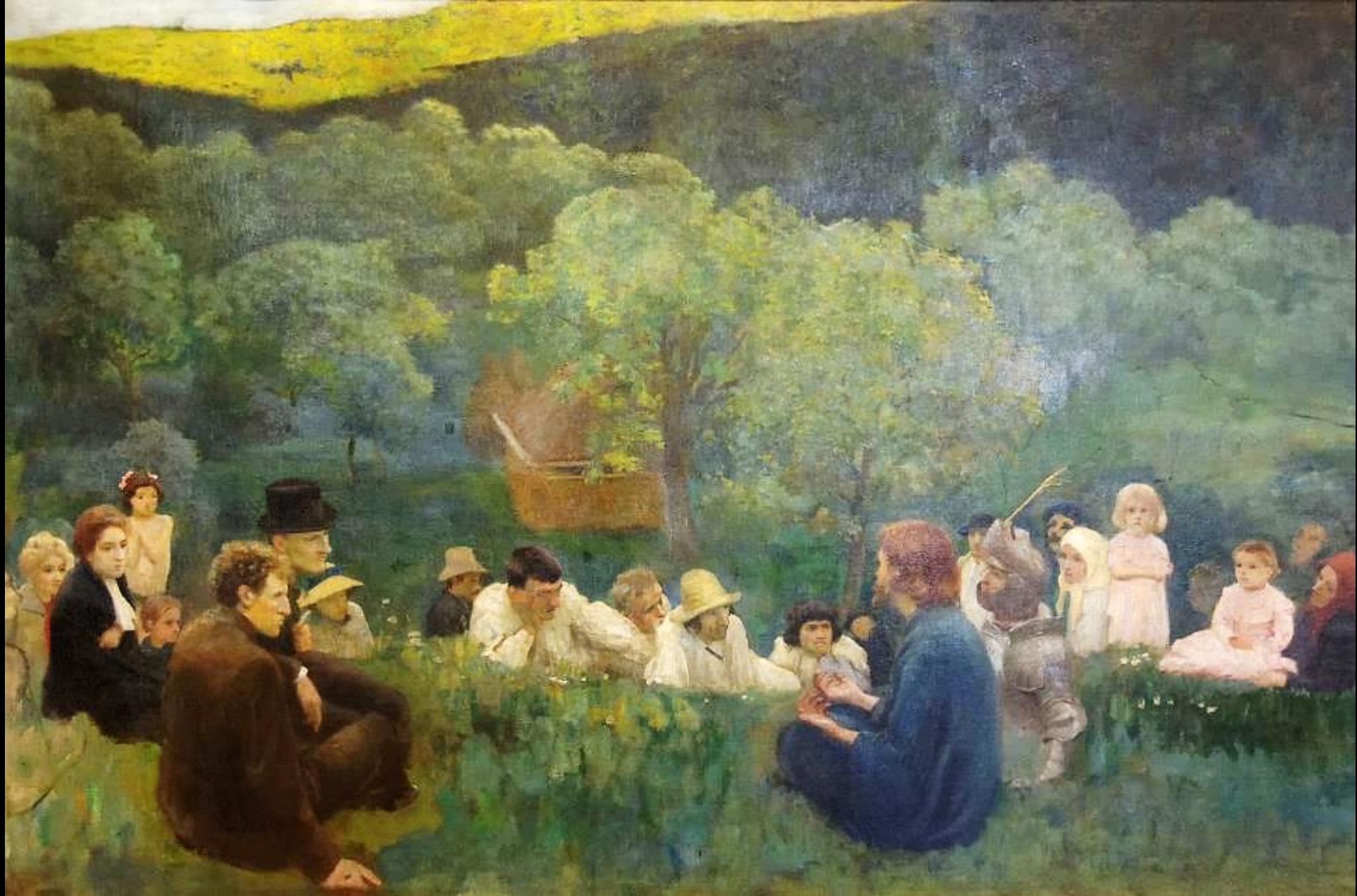
Sermon on the Mountain -- Karoly Ferenczy, Hungarian National Gallery, Budapest, Hungary