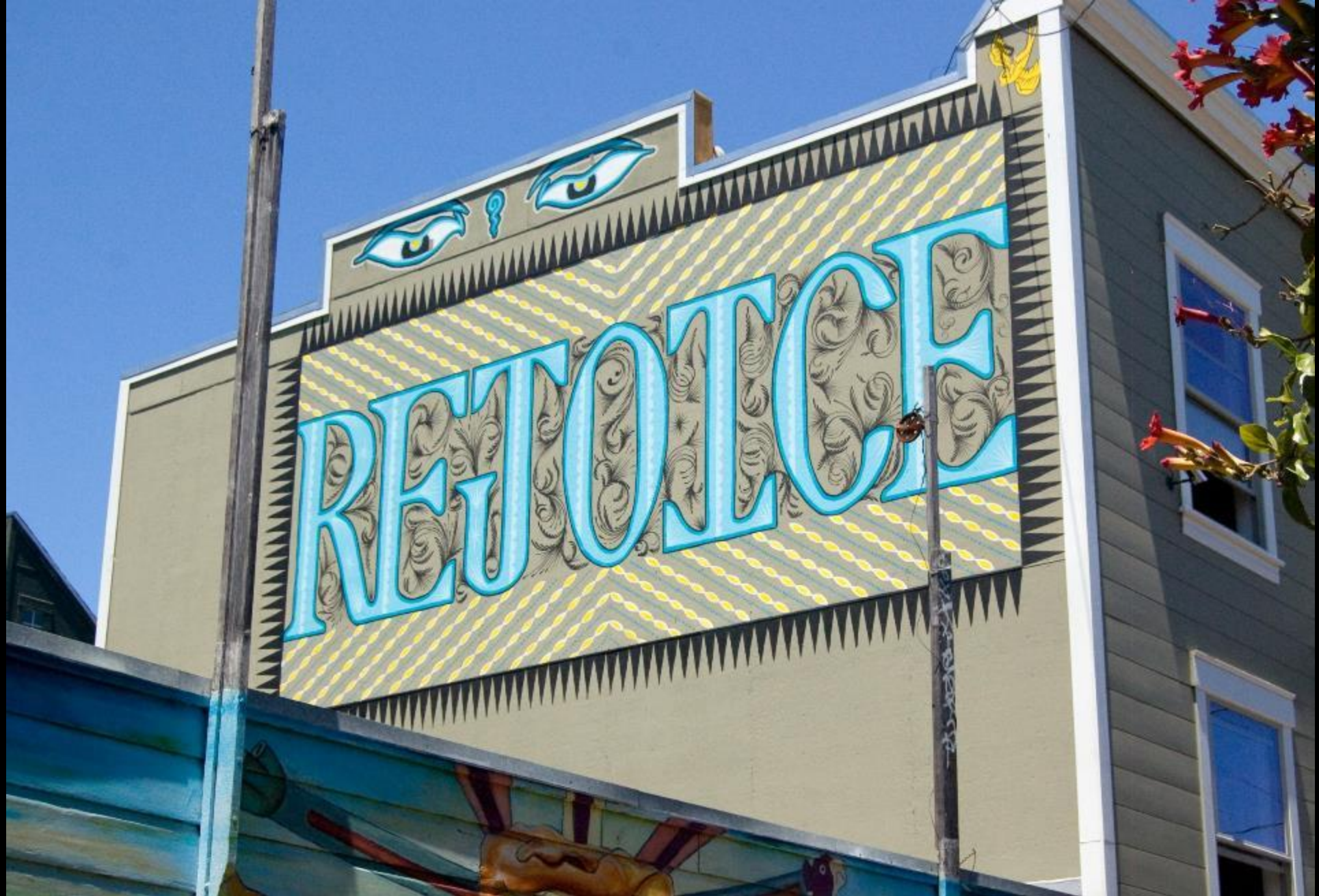
Rejoice! -- Mural in Mission District, San Francisco, CA