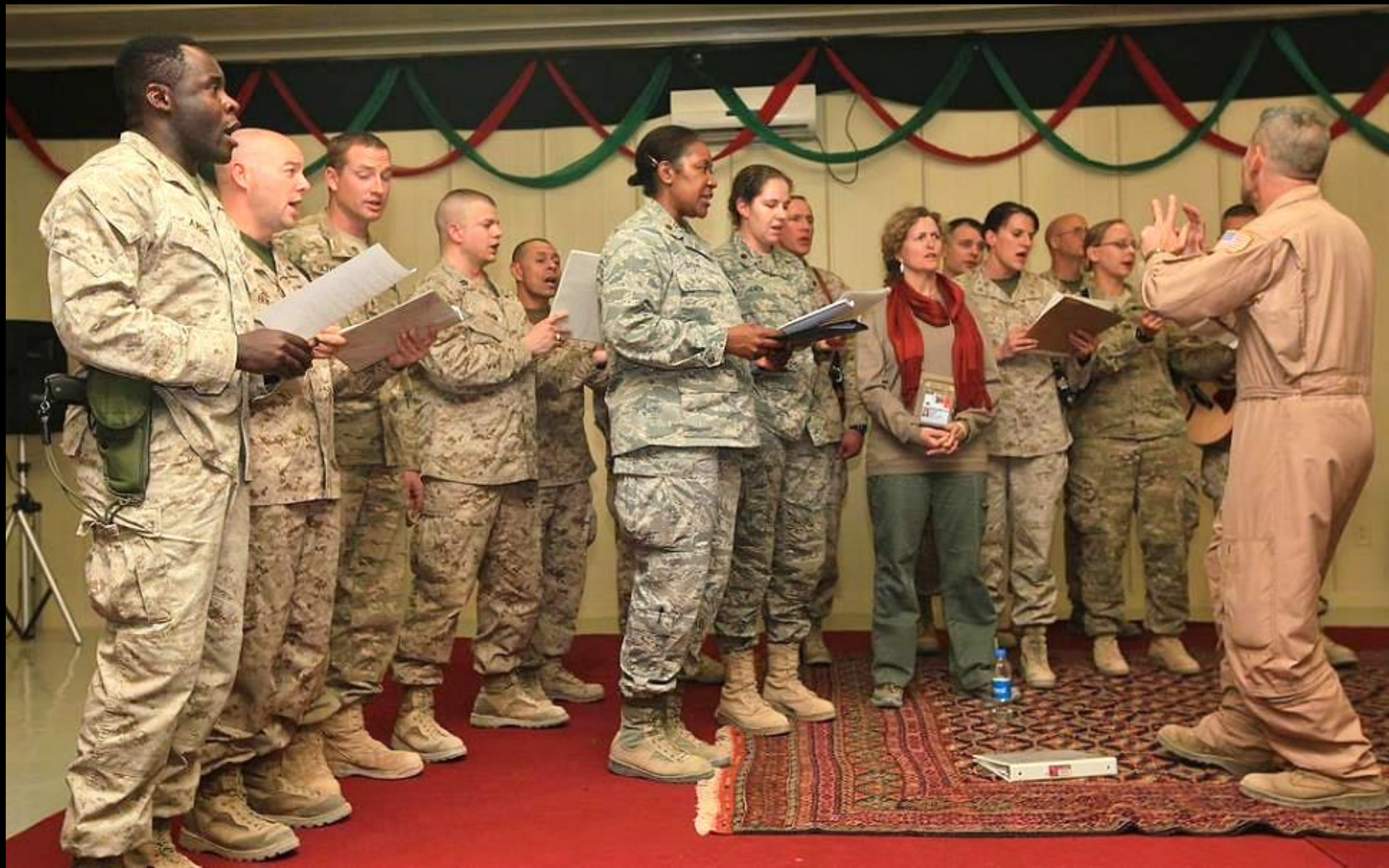
Christmas Choir, US Armed Forces -- Afghan Cultural Center, Helmand, Afghanistan