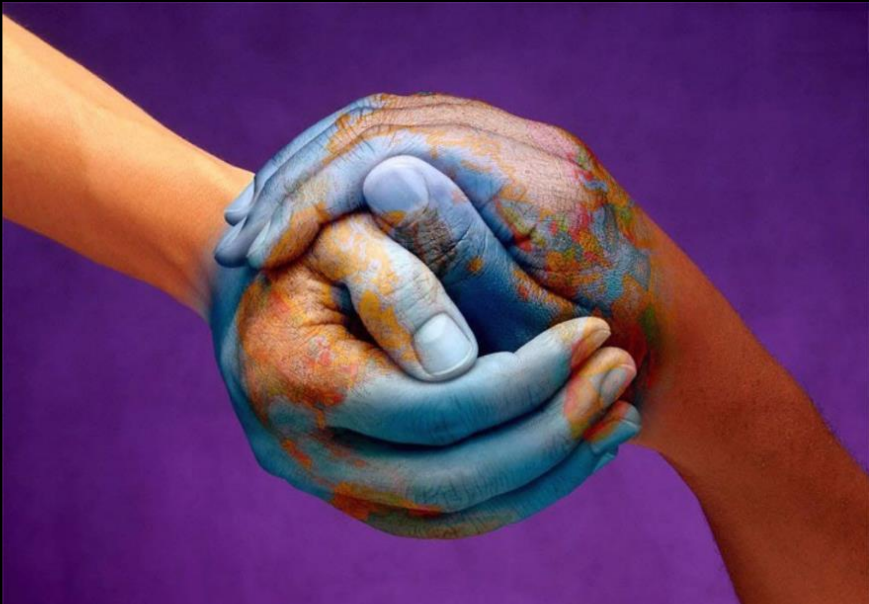
Hands of the World -- Non-profit "Movement for Peace" graphic