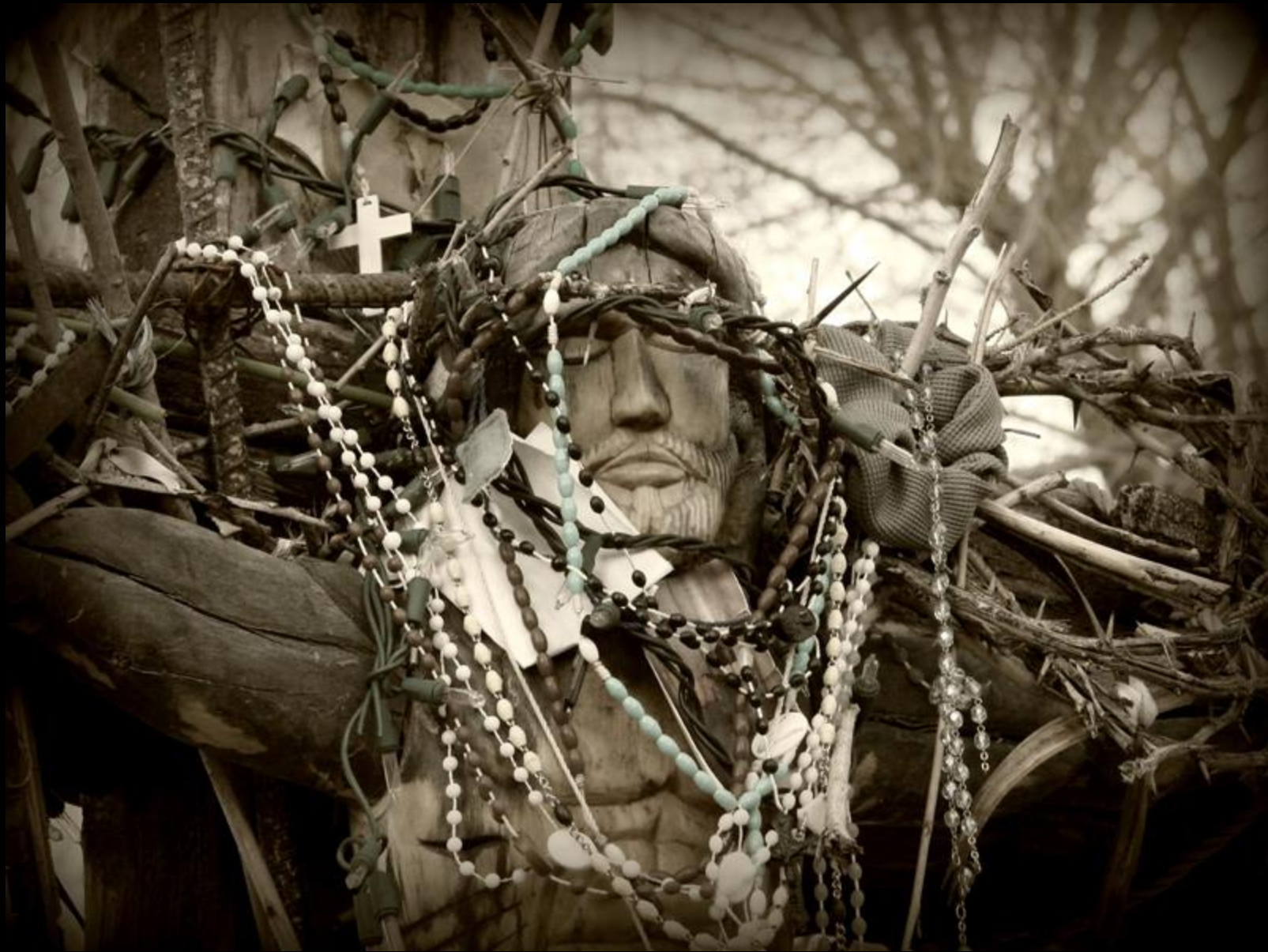
Crucifixion -- Chimayo, New Mexico