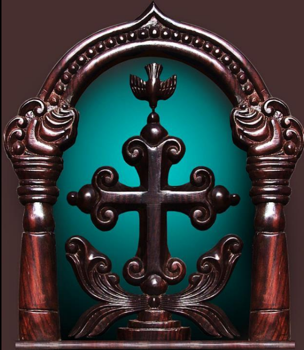
Mar Thoma Sliva Cross – St. Thomas Cross