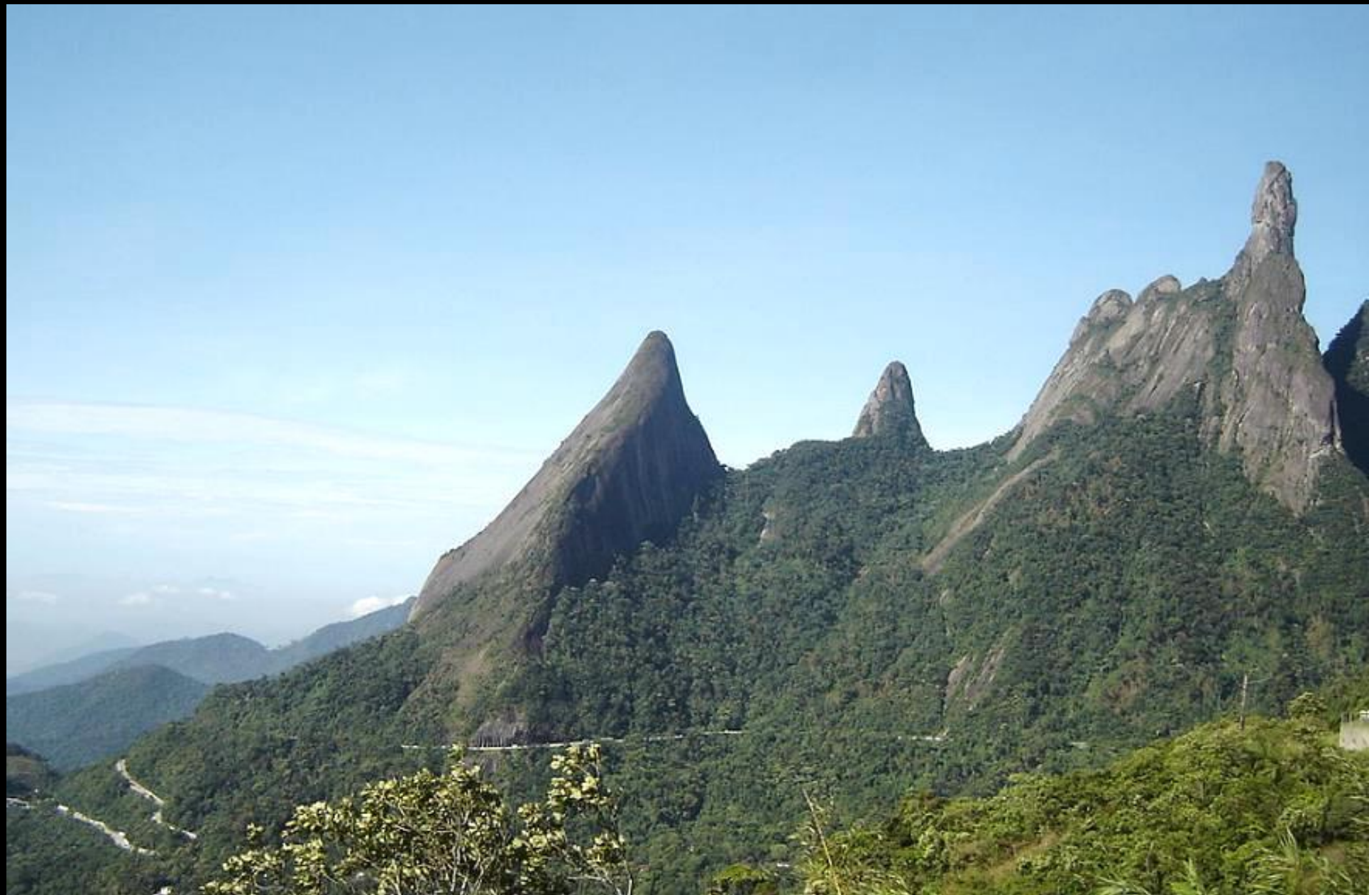
The Finger of God Rock Formation -- Teresopolis, Brazil