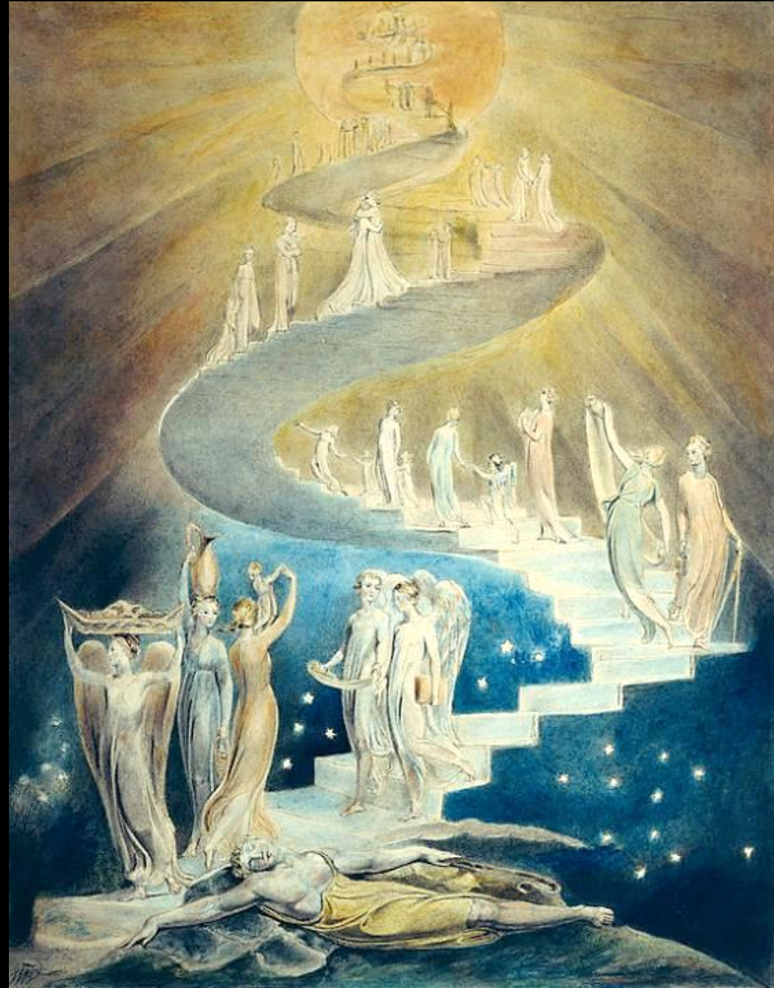
Jacob's Dream William Blake British Museum London, England