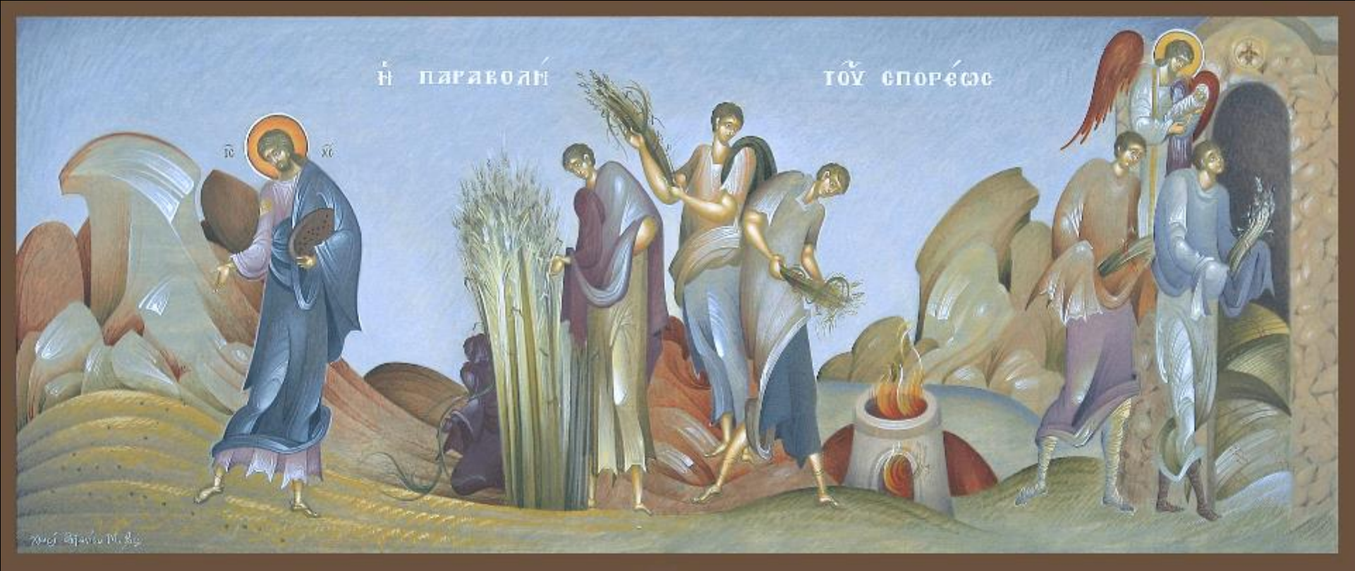
Parable of the Sower -- Greek Icon