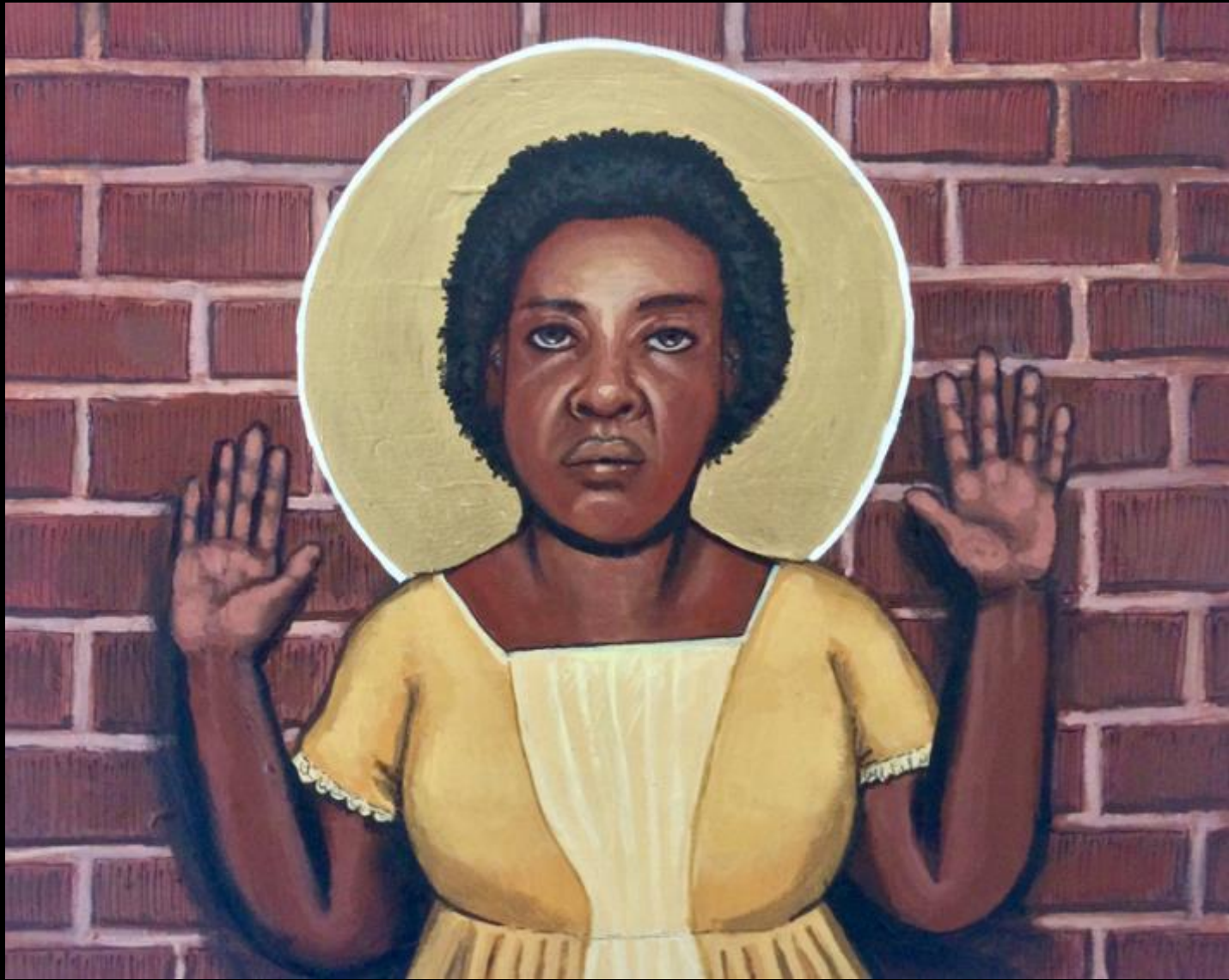
Fannie Lou Hamer, activist for women's and civil rights