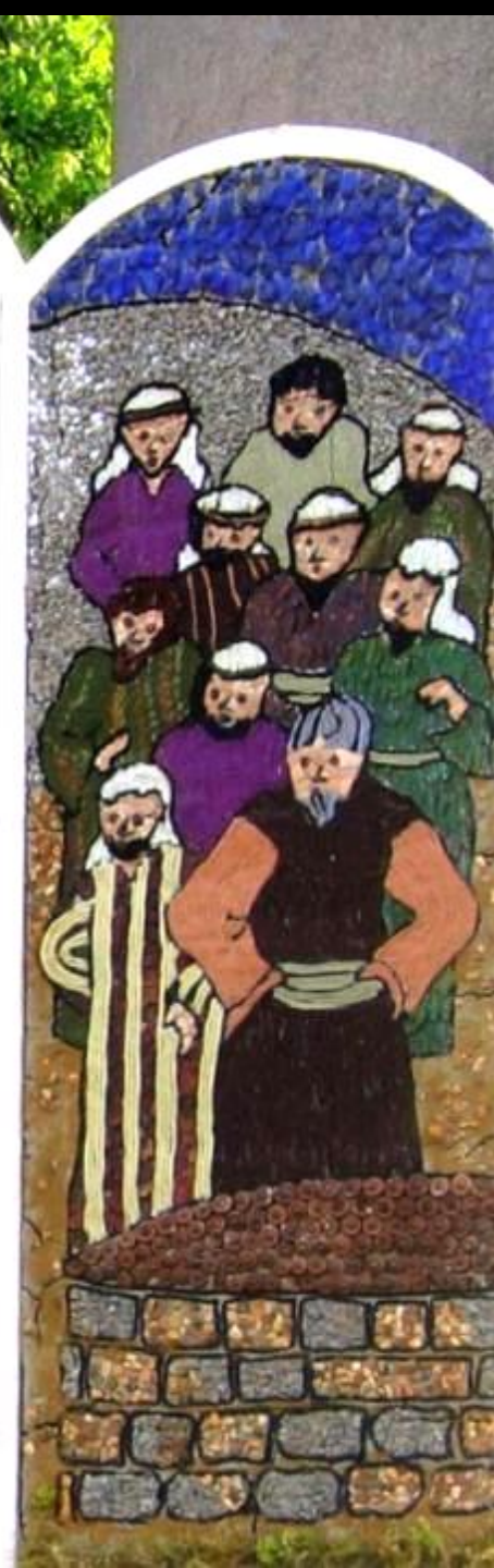
Joseph the Dreamer