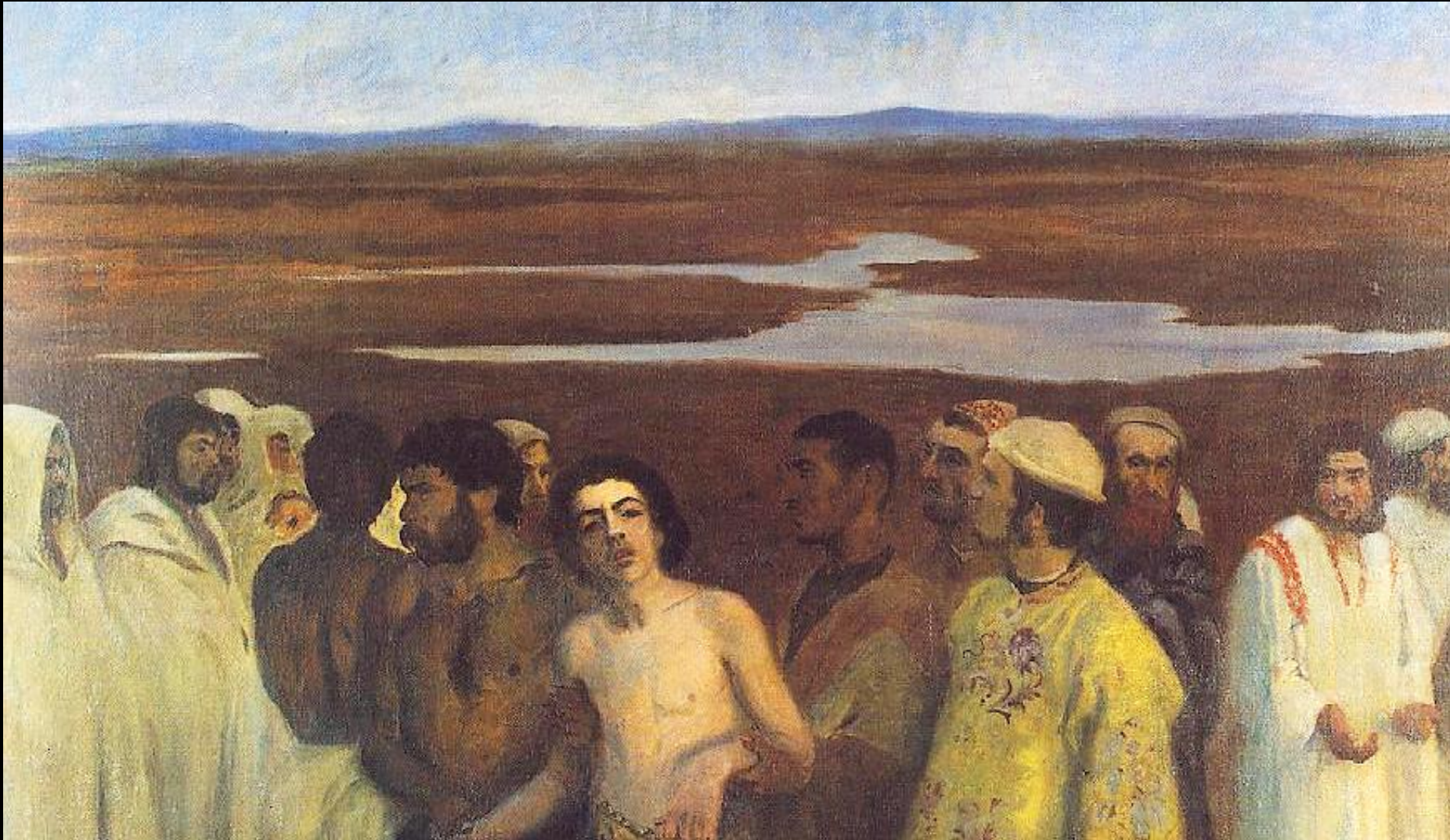
Joseph Sold into Slavery -- Karoly Ferenczy, Hungarian National Gallery, Budapest