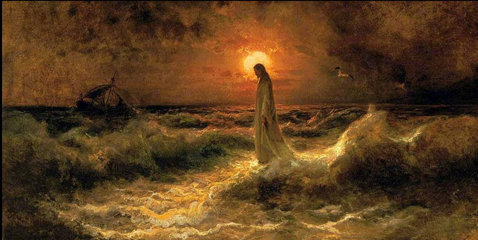
Christ Walking on the Water -- Julius Sergius Von Klever