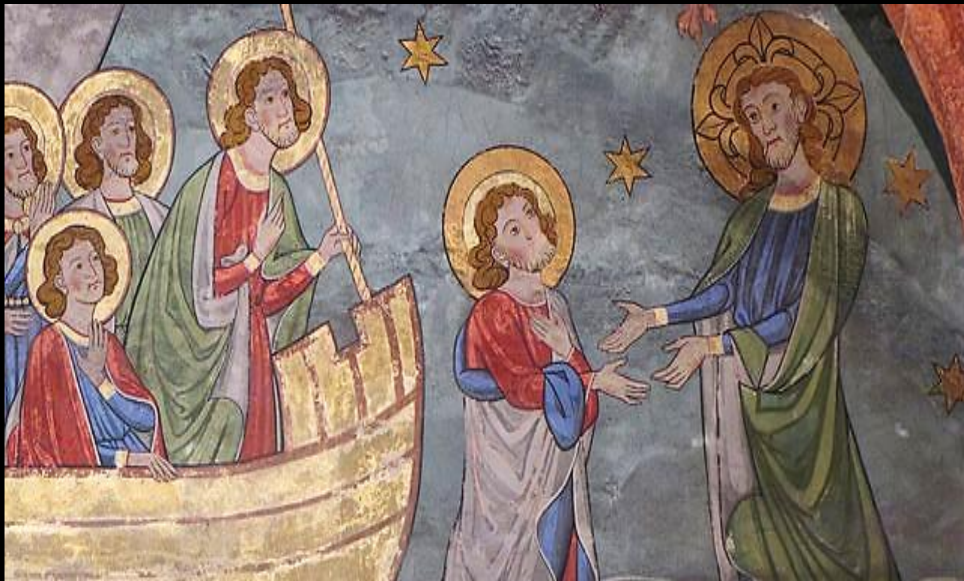
Peter on the Water -- Church of St. Peter the Younger, Strasbourg, France