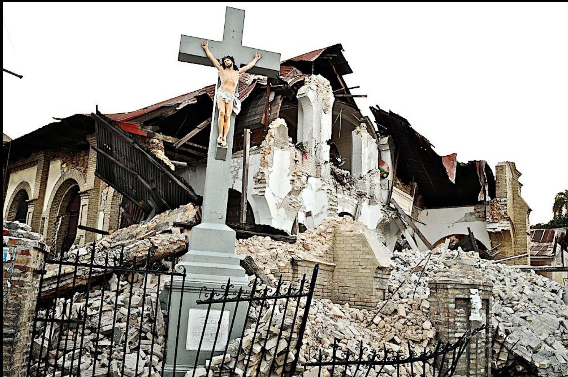
Earthquake Destruction 2010, Port-au-Prince, Haiti