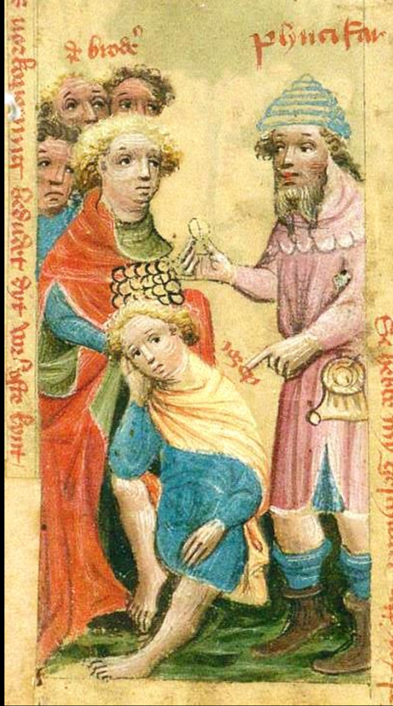
Rueben Saves Joseph