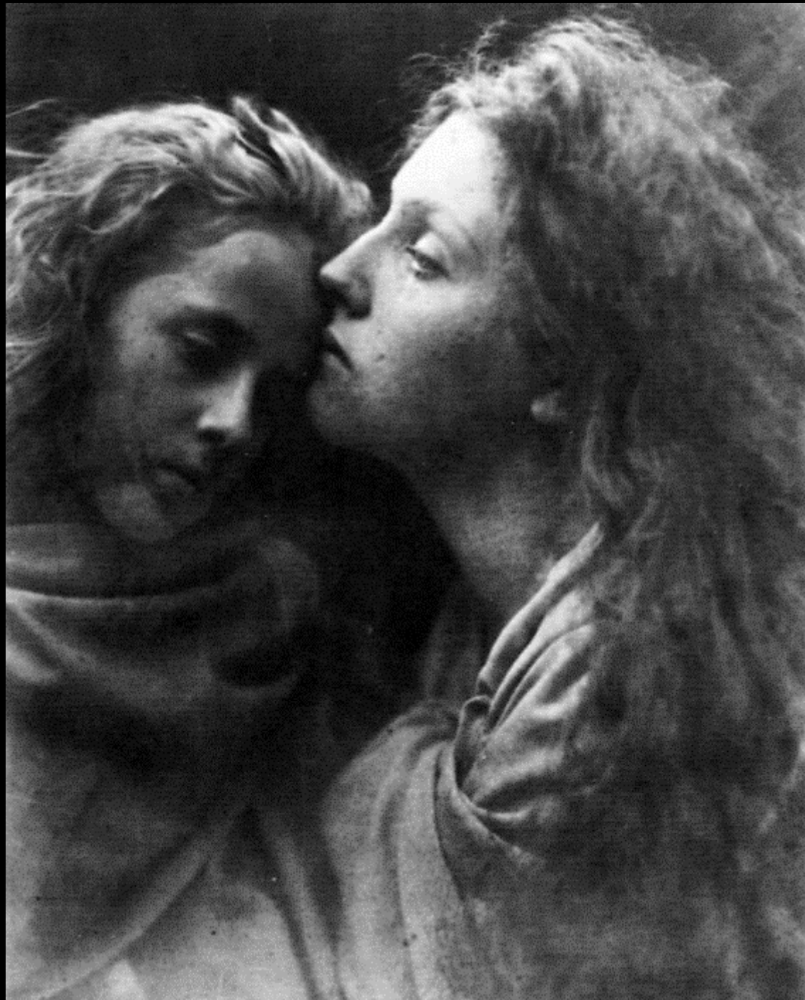
Kiss of Peace