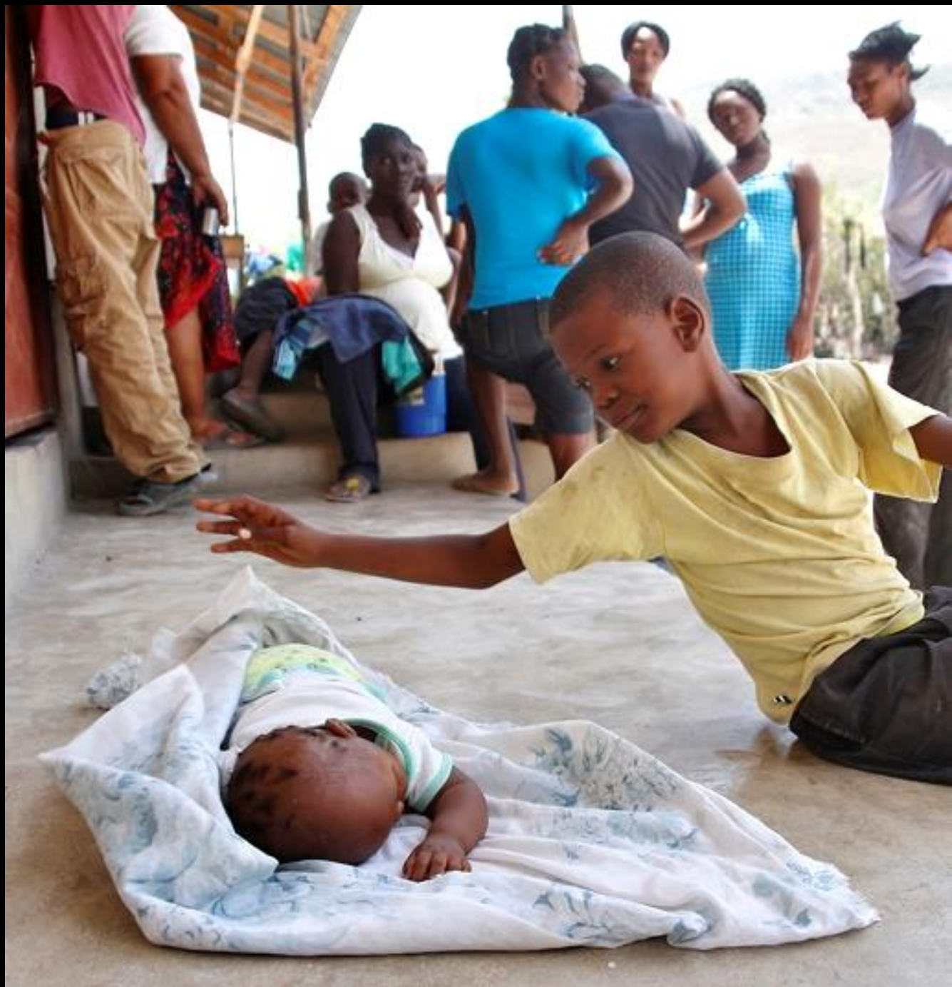
Caring for Sleeping Brother