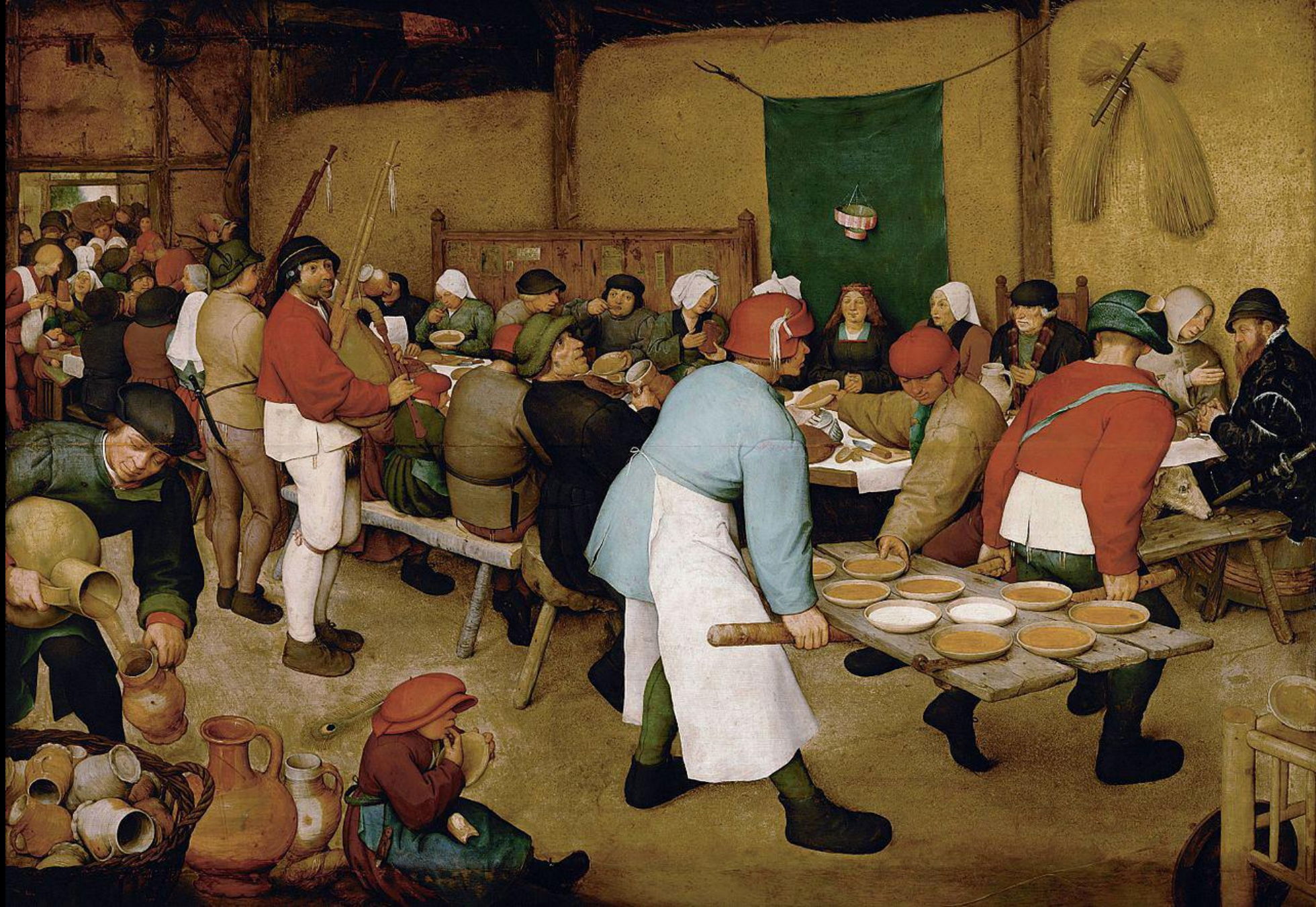
Peasant Wedding-- Pieter Bruegel, Kunsthistorisches Museum, Vienna, Austria