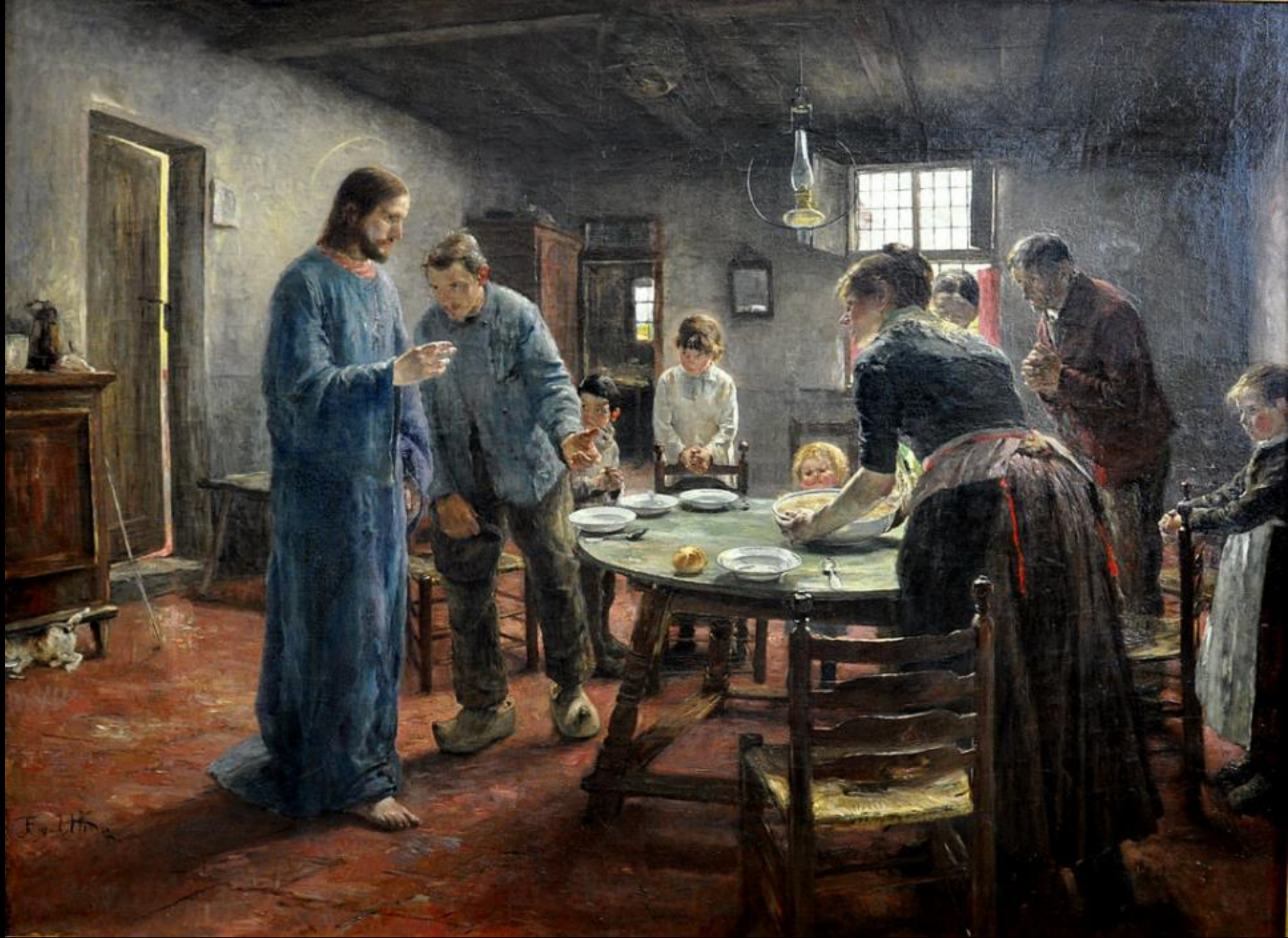
The Mealtime Prayer -- Fritz von Uhde, Alte Nationalgalerie, Berlin, Germany