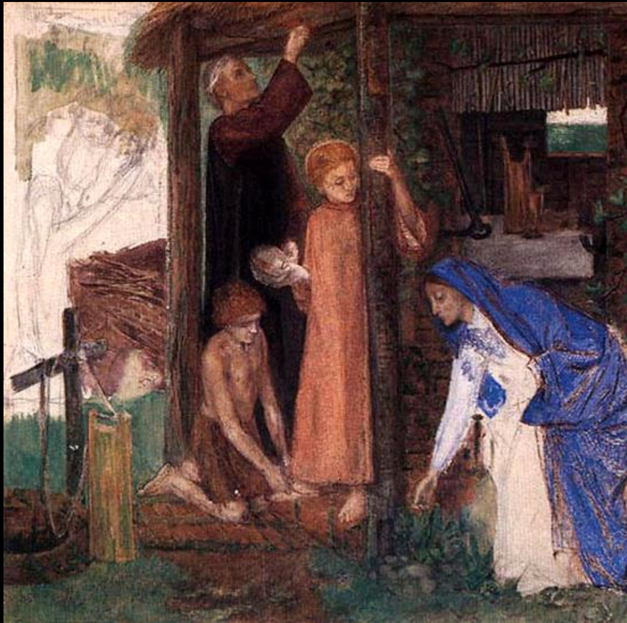
The Passover in the Holy Family -- Dante Rossetti, Tate Britain, London, England