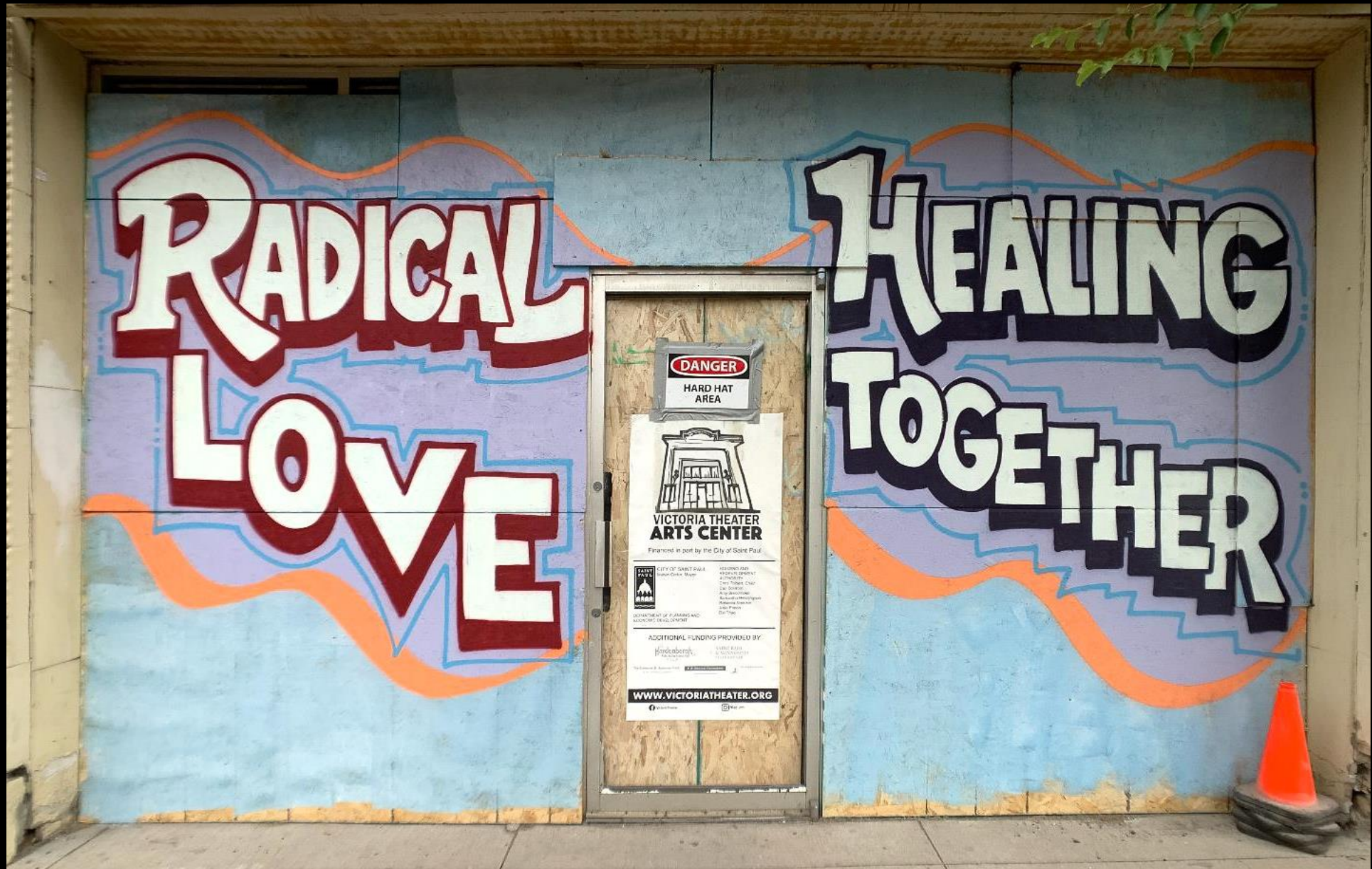
Street Art Response to George Floyd's Death -- St. Paul, MN