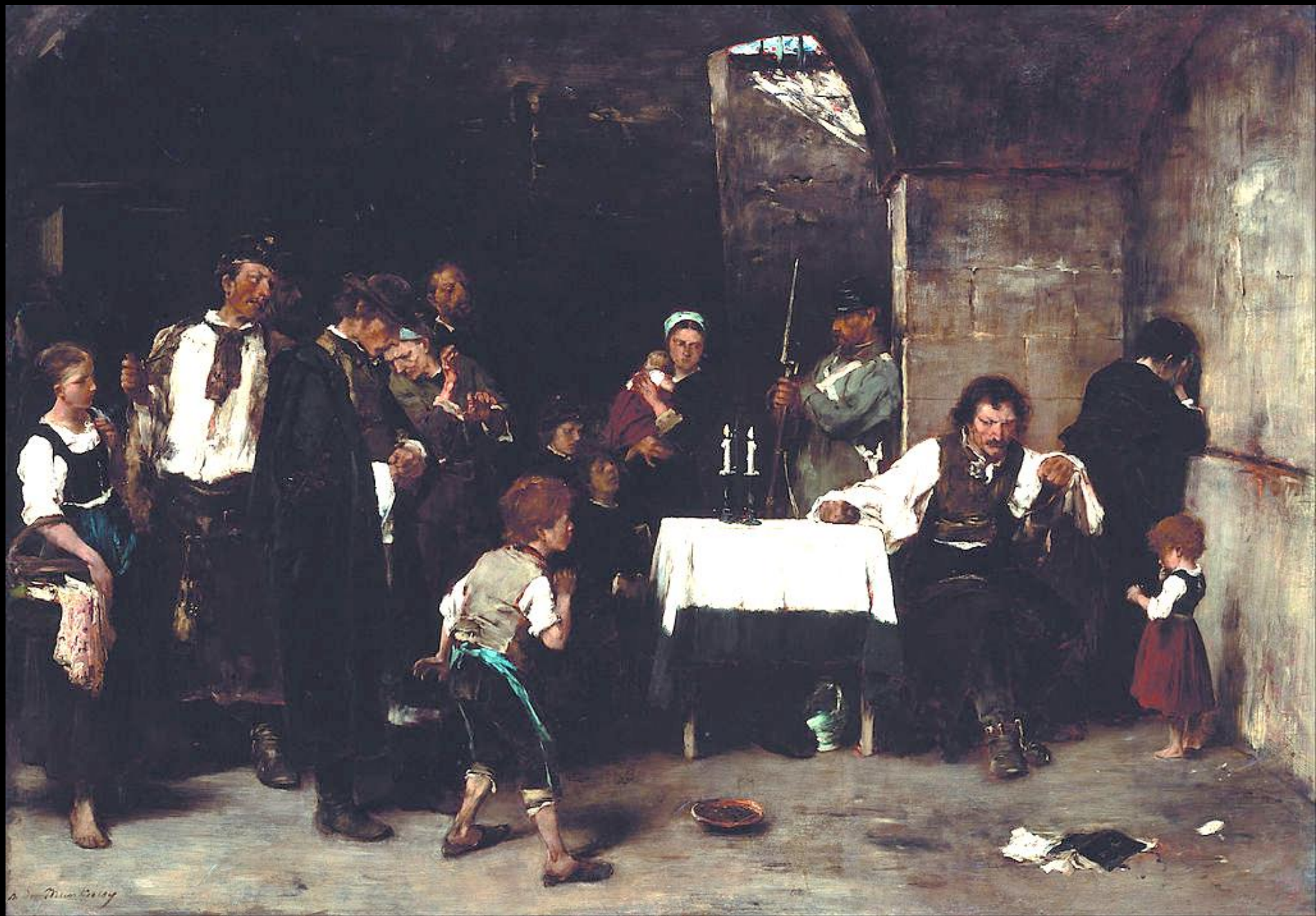
Cell of the Condemned -- Mihaly Munkacsy, Hungarian National Gallery, Budapest, Hungary