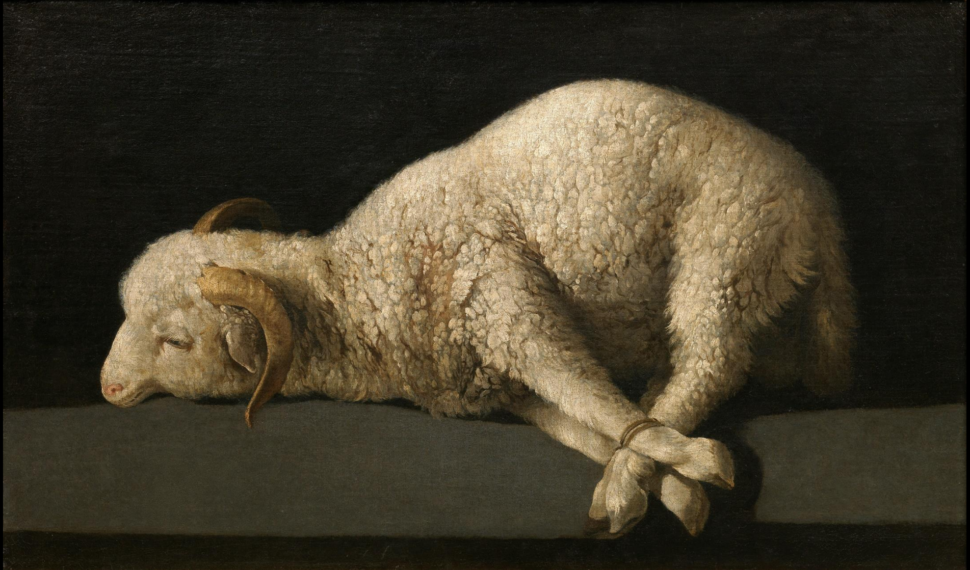
A Lamb -- Francisco Zurbaran, Prado Museum, Madrid, Spain