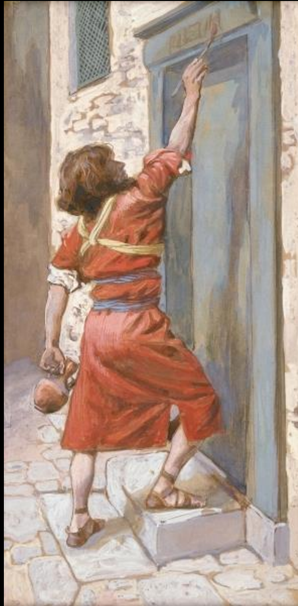
Signs on the Door -- James Tissot, Jewish Museum, New York City