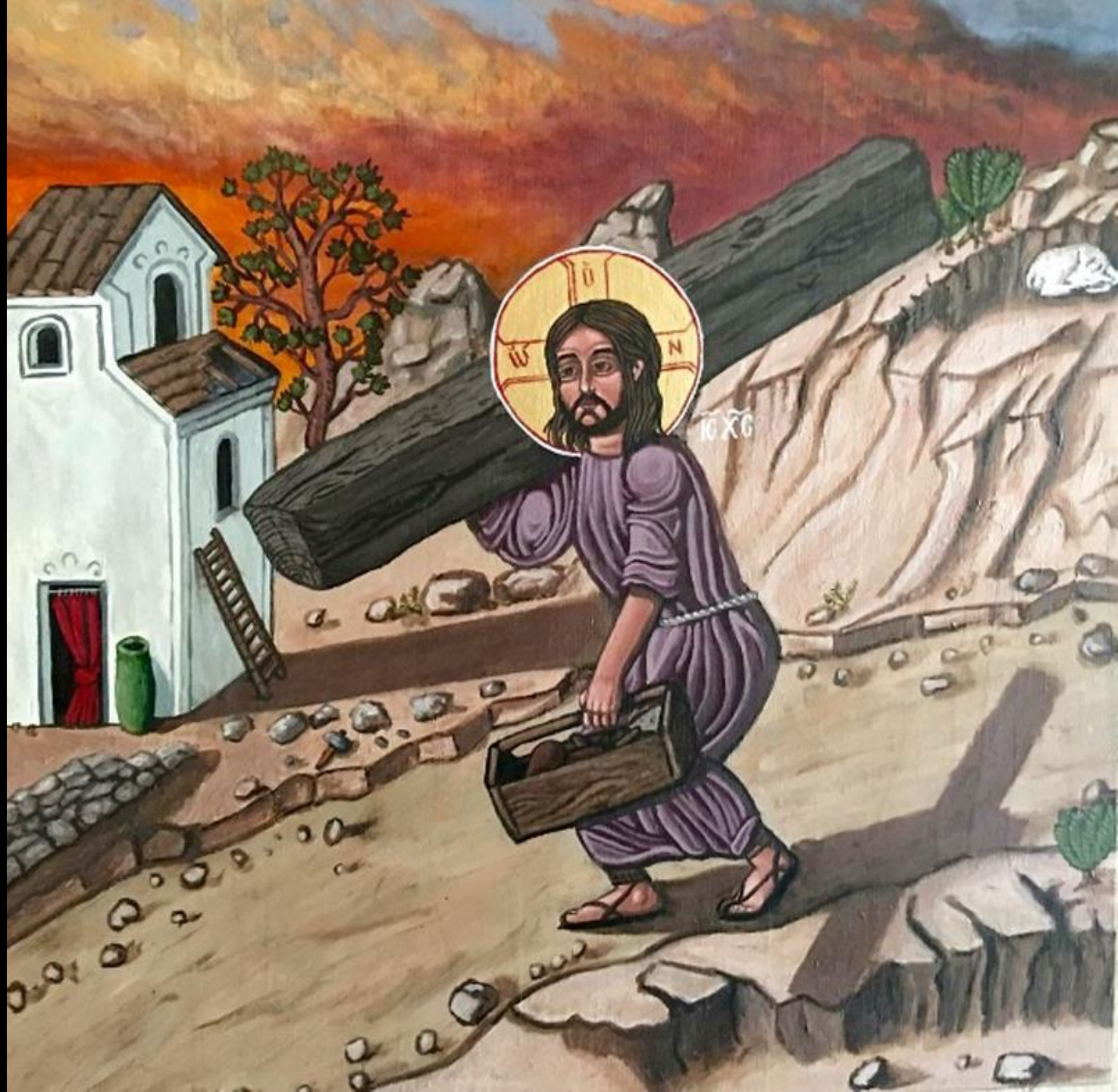
Christ: The Tekton