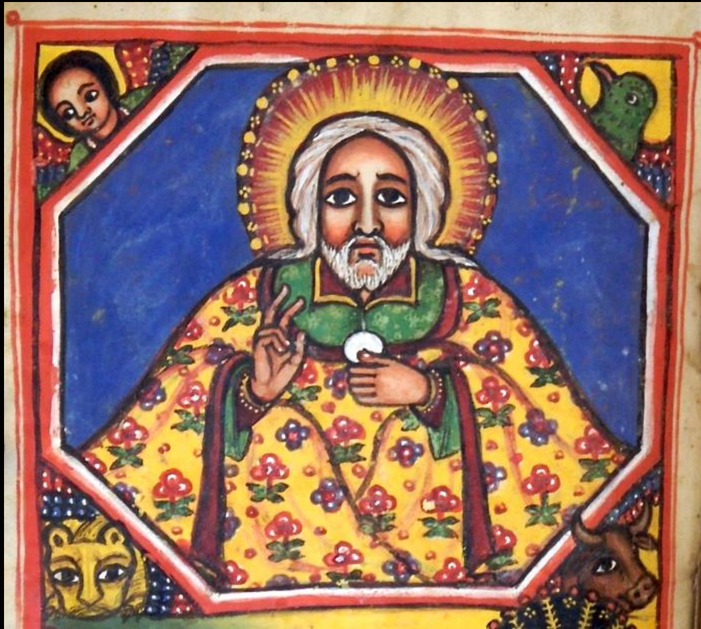
Face of God -- Ethiopian 18 th c. manuscript, Church of Narga Selassie, Lake Tana, Ethiopia