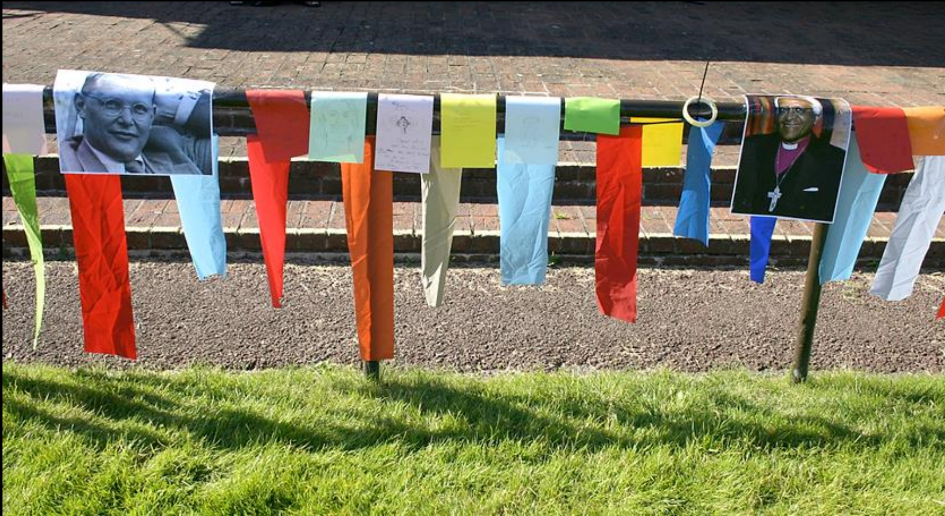
"placing yourself in god's story, among the heroes of the faith on the arena rail..." Emerging Church Festival, Cheltenham, England