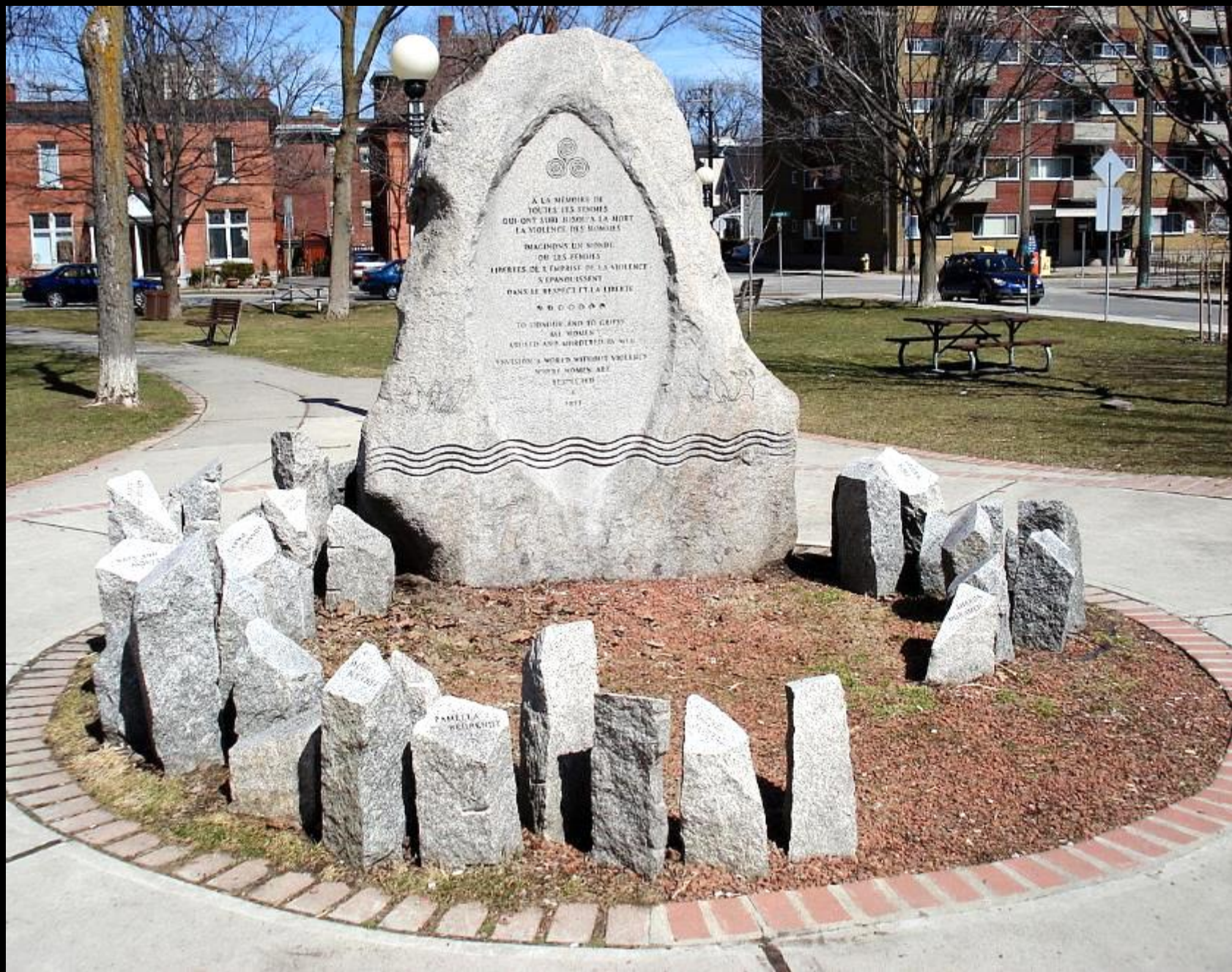
Enclave: Monument to Victims of Domestic Violence -- Ottawa, Canada