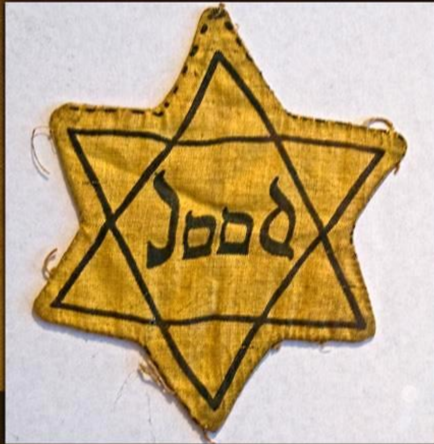
Jewish Star Patch Worn by Jews in Holland, 1940-1945 -- Corrie Ten Boom