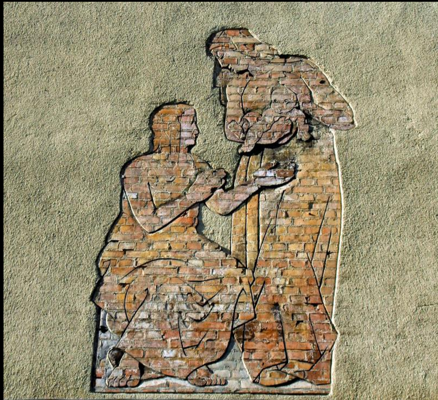
A New Child Brick wall mural Gdansk, Poland