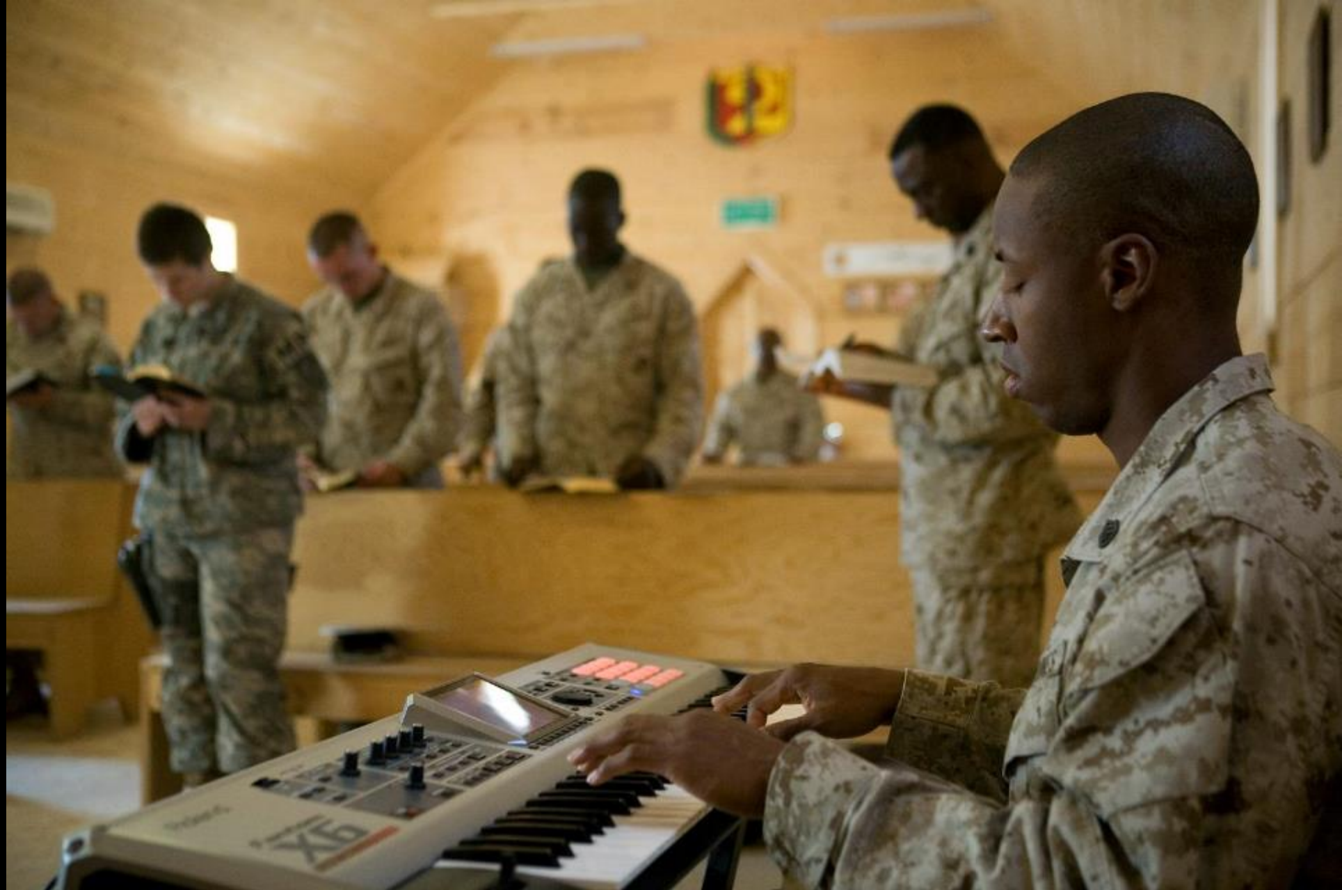
Marine Regimental Combat Team Worship Service, Camp Ripper Chapel, Al Asad, Iraq