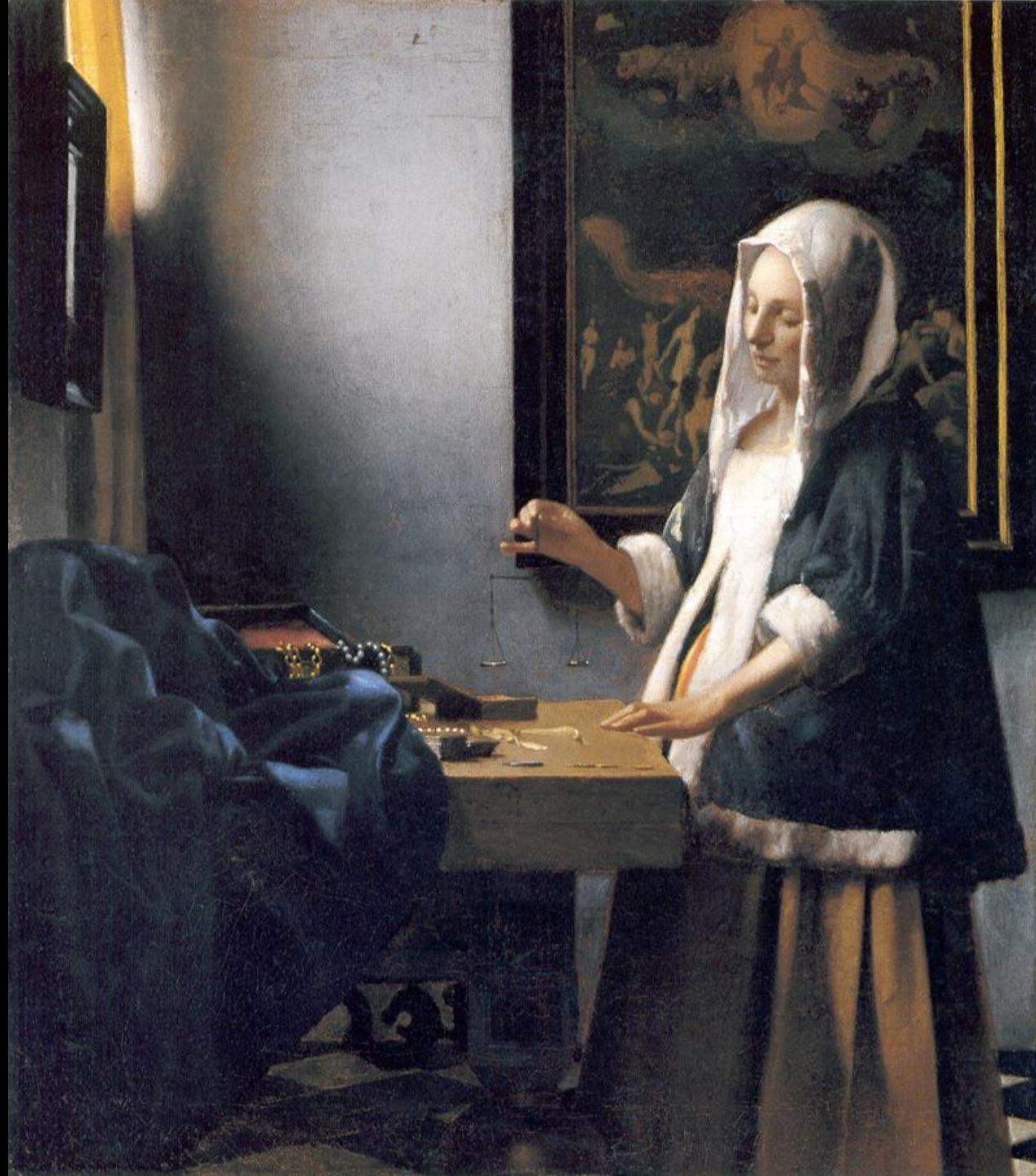
Woman Holding a Balance

Johannes Vermeer National Gallery of Art Washington, DC