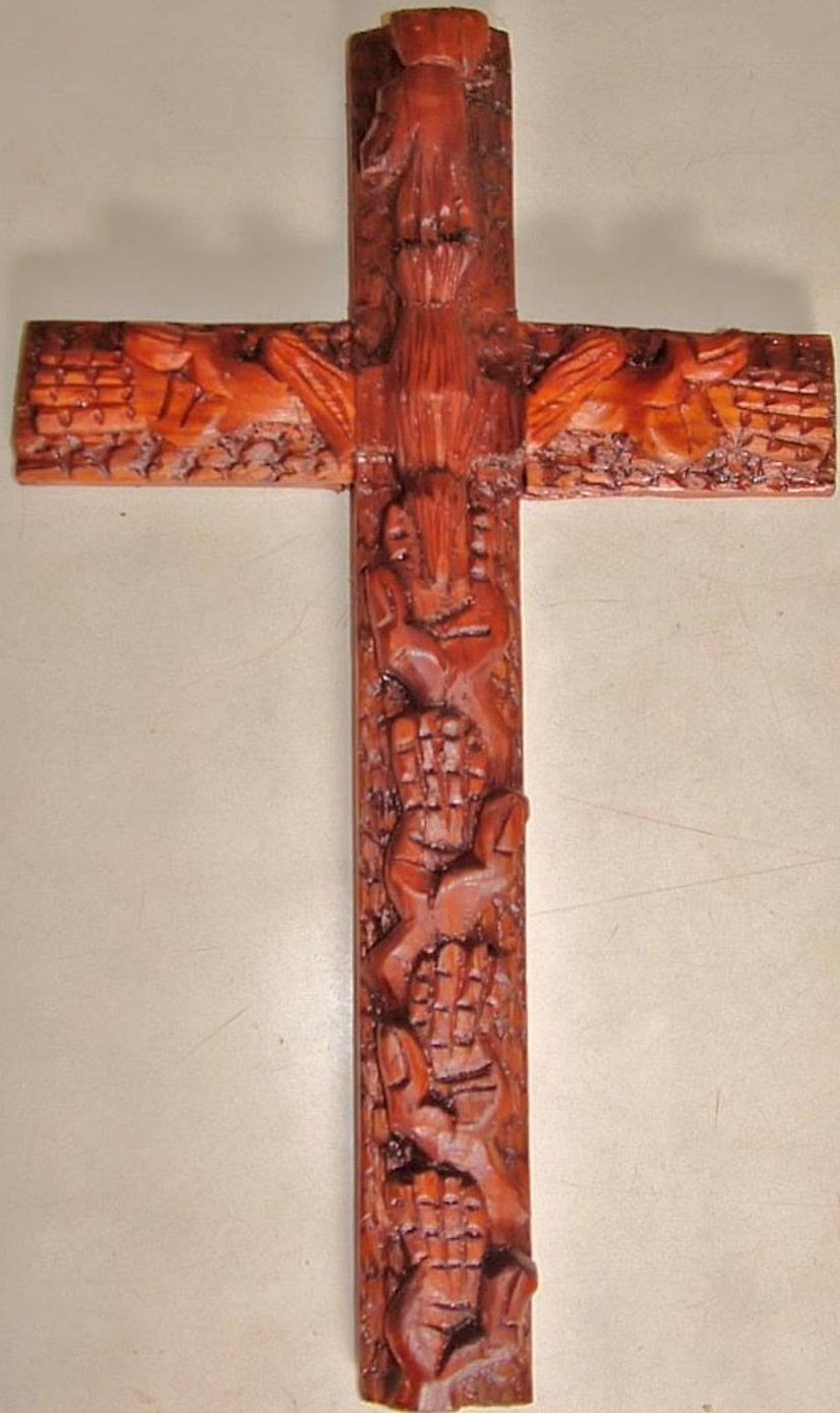
Cross of Hands

Mulungwishi Methodist Church Democratic Republic of Congo