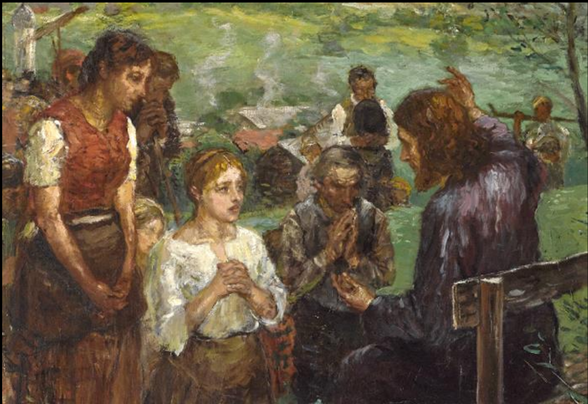
Christ Teaching -- Fritz von Uhde, Museum of Fine Arts, Budapest, Hungary