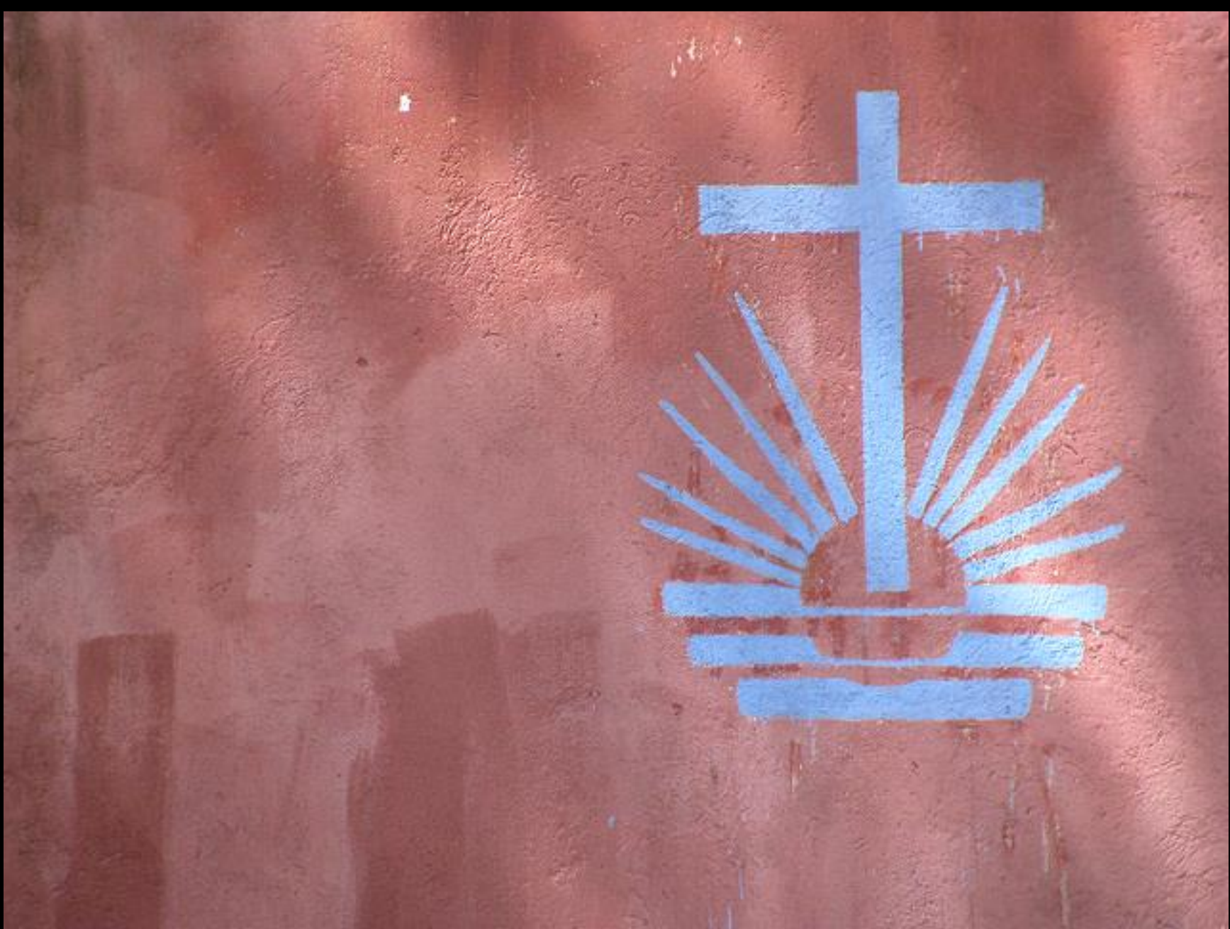
Church Mural, Manchewe, Malawi