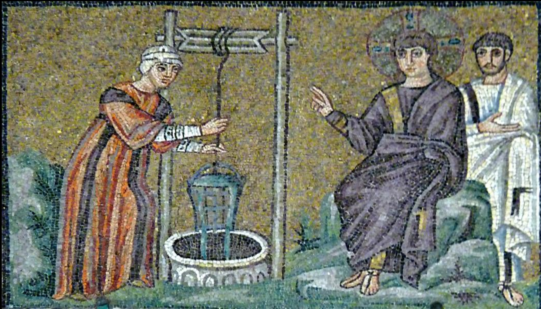
Christ and the Samaritan Woman -- San Apollinare Nuovo, Ravenna, Italy