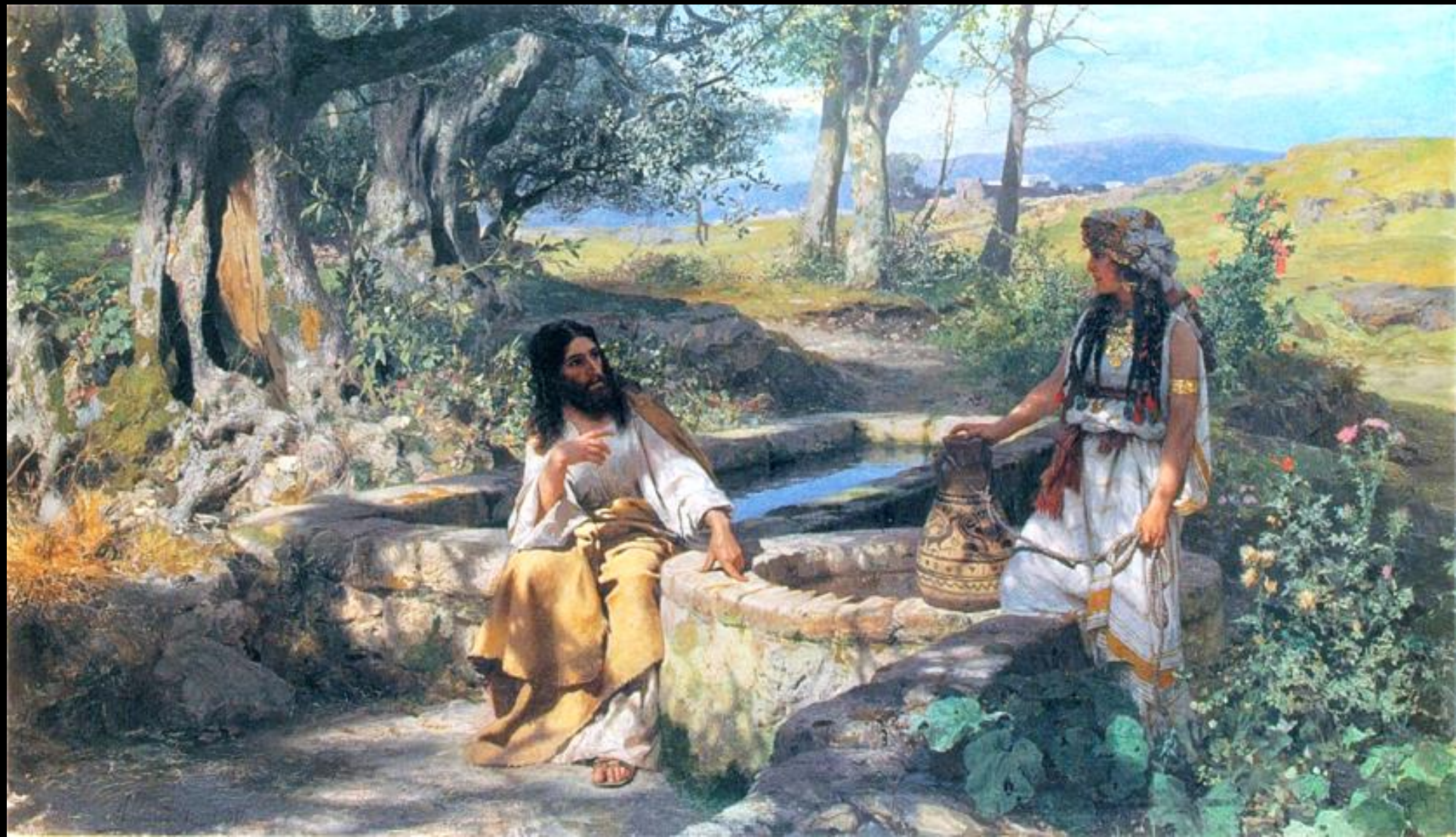
Christ and the Samaritan Woman -- Henryk Siemiradzki, Lviv Art Gallery, Lviv, Ukraine