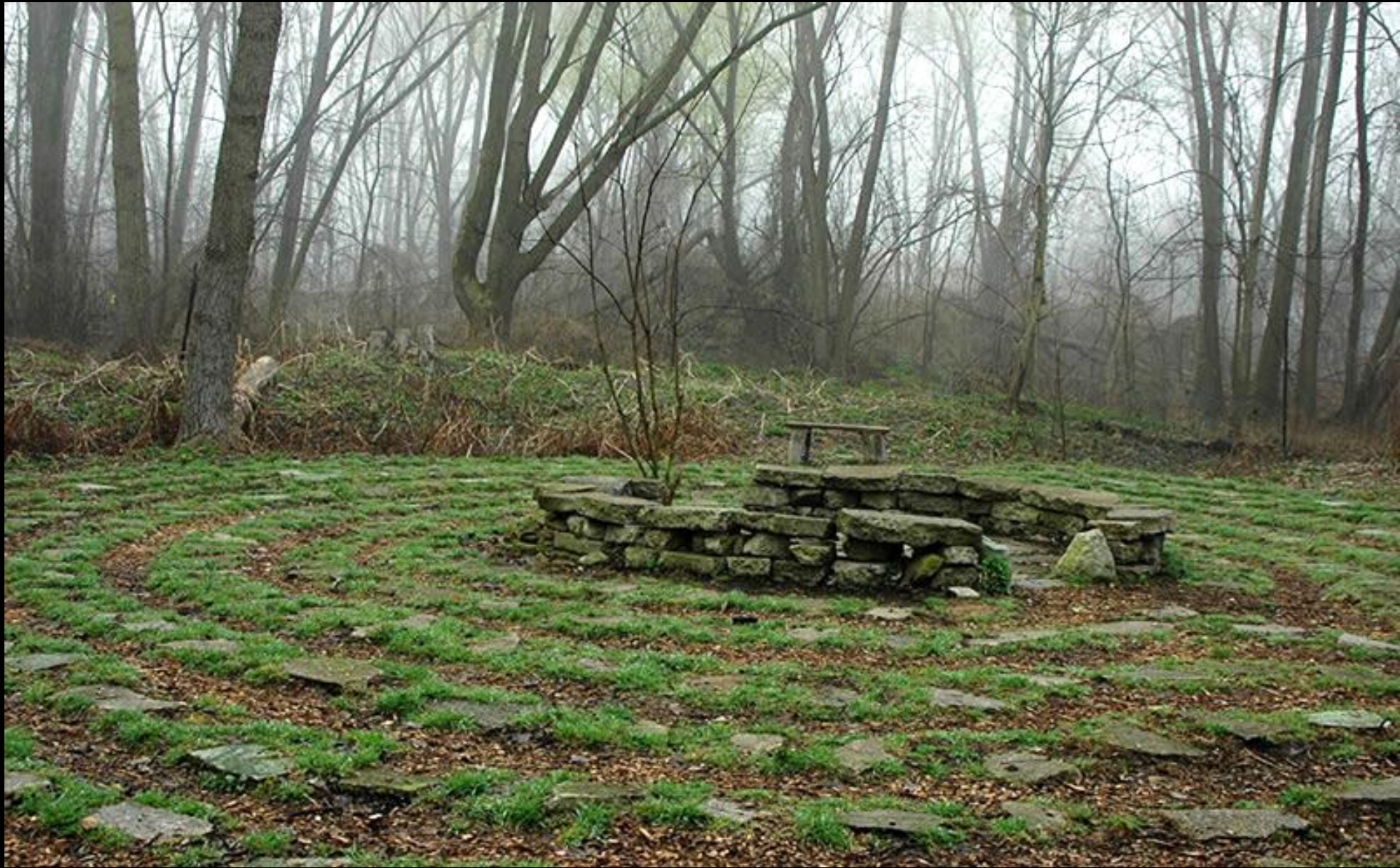
Turtle Peace Labyrinth -- Teaneck Creek Conservancy, Teaneck, NJ