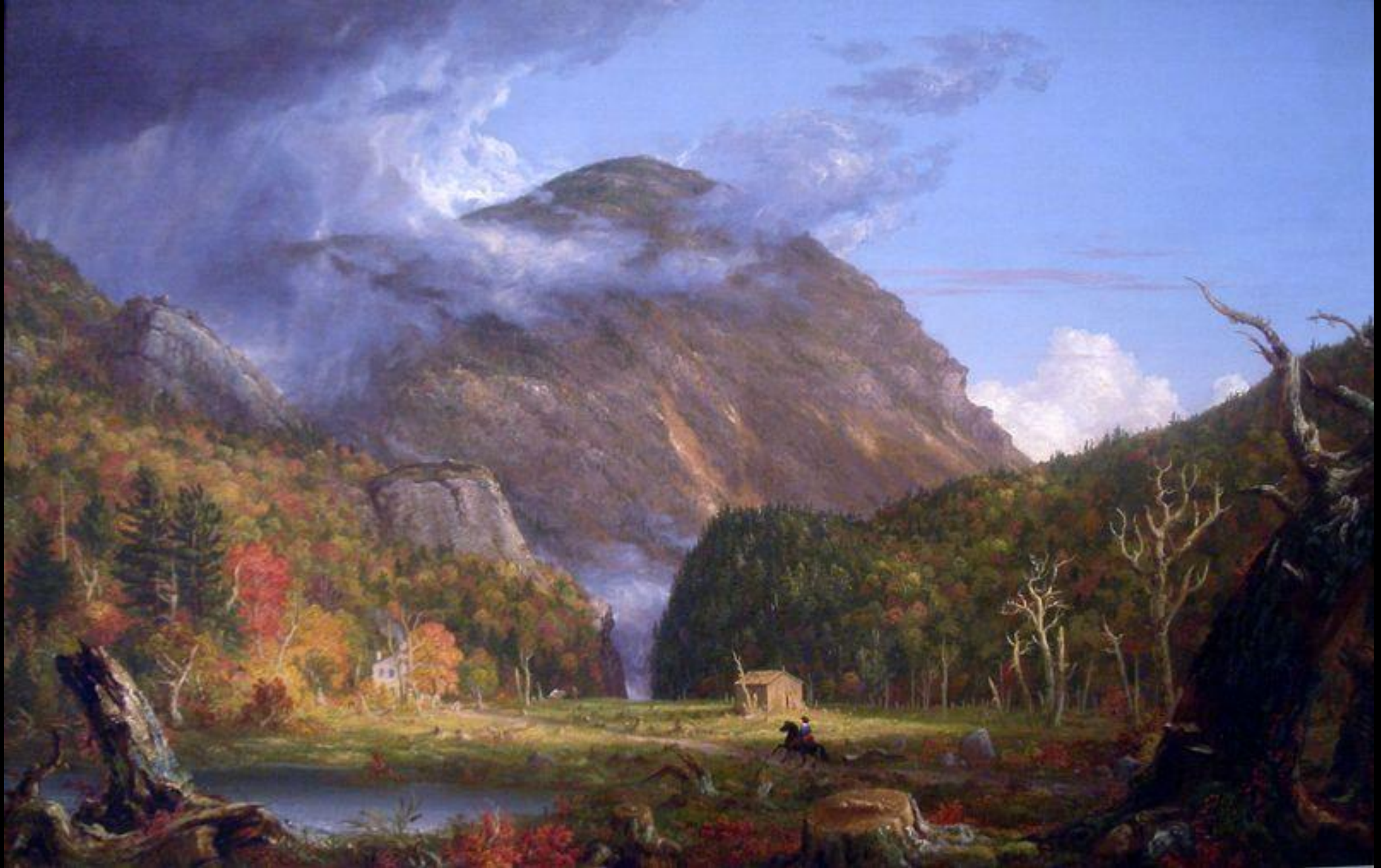
Crawford Notch -- Thomas Cole, National Gallery of Art, Washington, DC