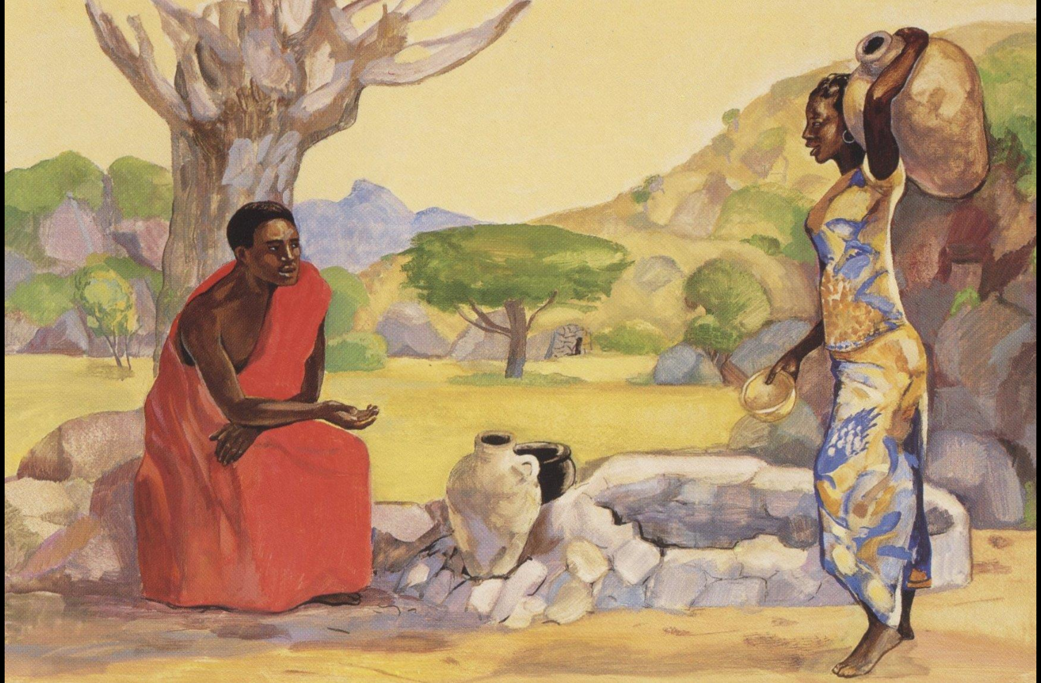
Jesus and the Samaritan Woman -- Jesus MAFA, Cameroon