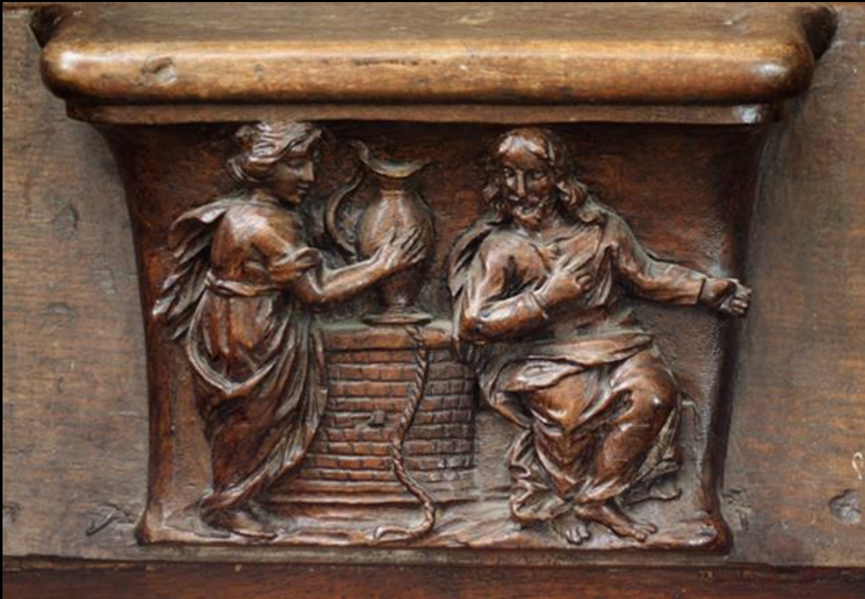
Christ and the Samaritan Woman -- Saint-Sulpice, Favieres, France