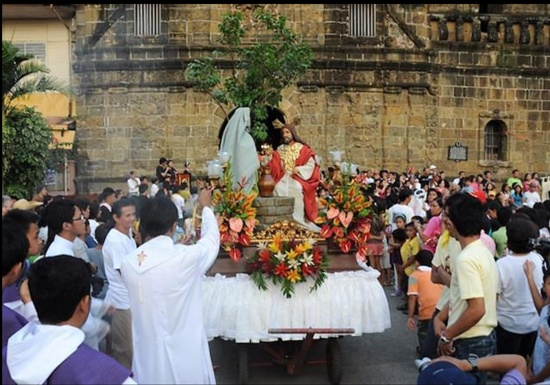
The Woman at the Well -- Paete, Philippines