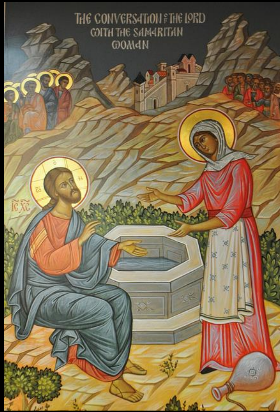
Christ and the Samaritan Woman