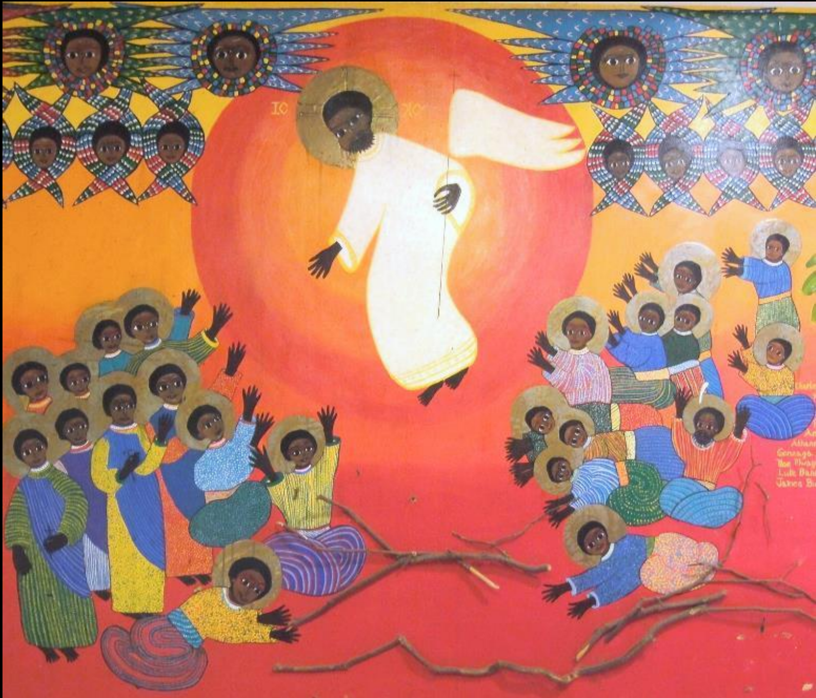
Martyrs of Uganda Emmaus House Kamapala, Uganda