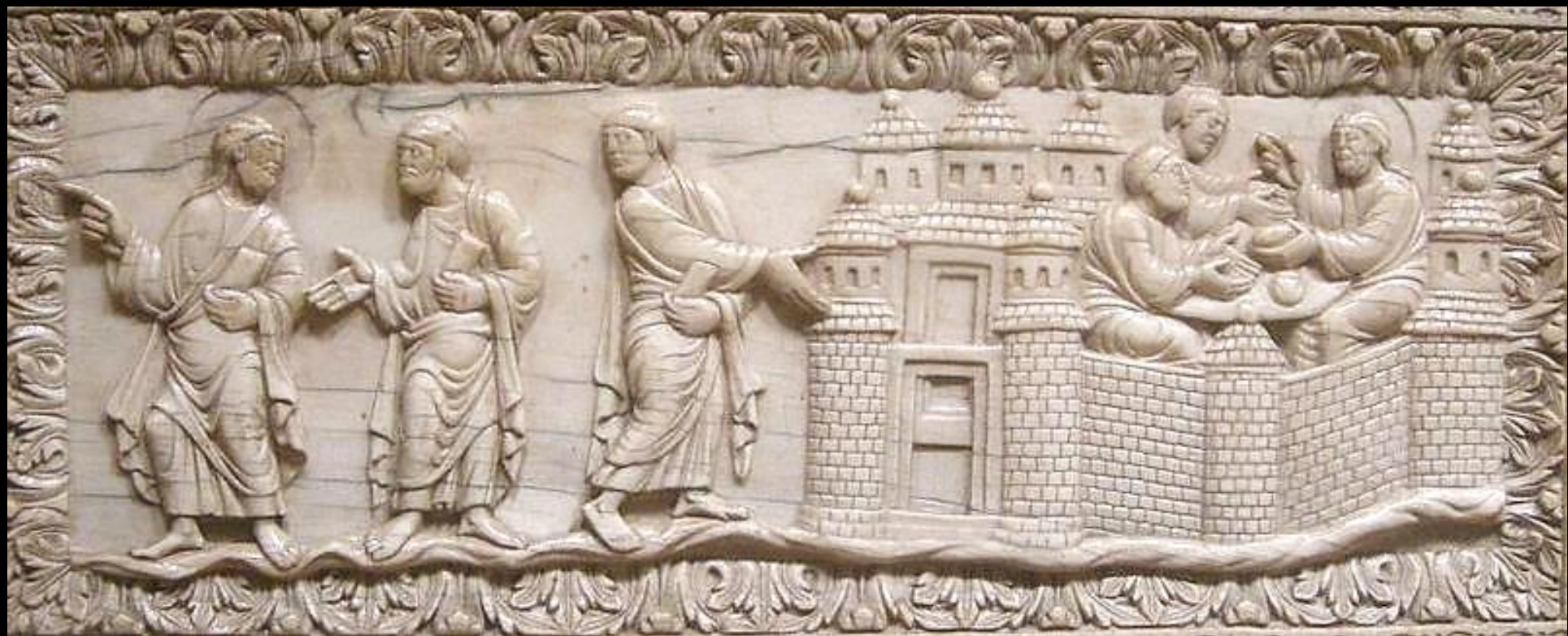
Road to Emmaus -- Carolingian, 9 th c., Cloisters Museum, New York