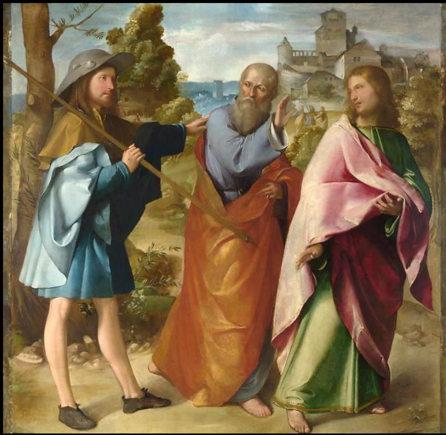
Road to Emmaus

Altobello Melone National Gallery London