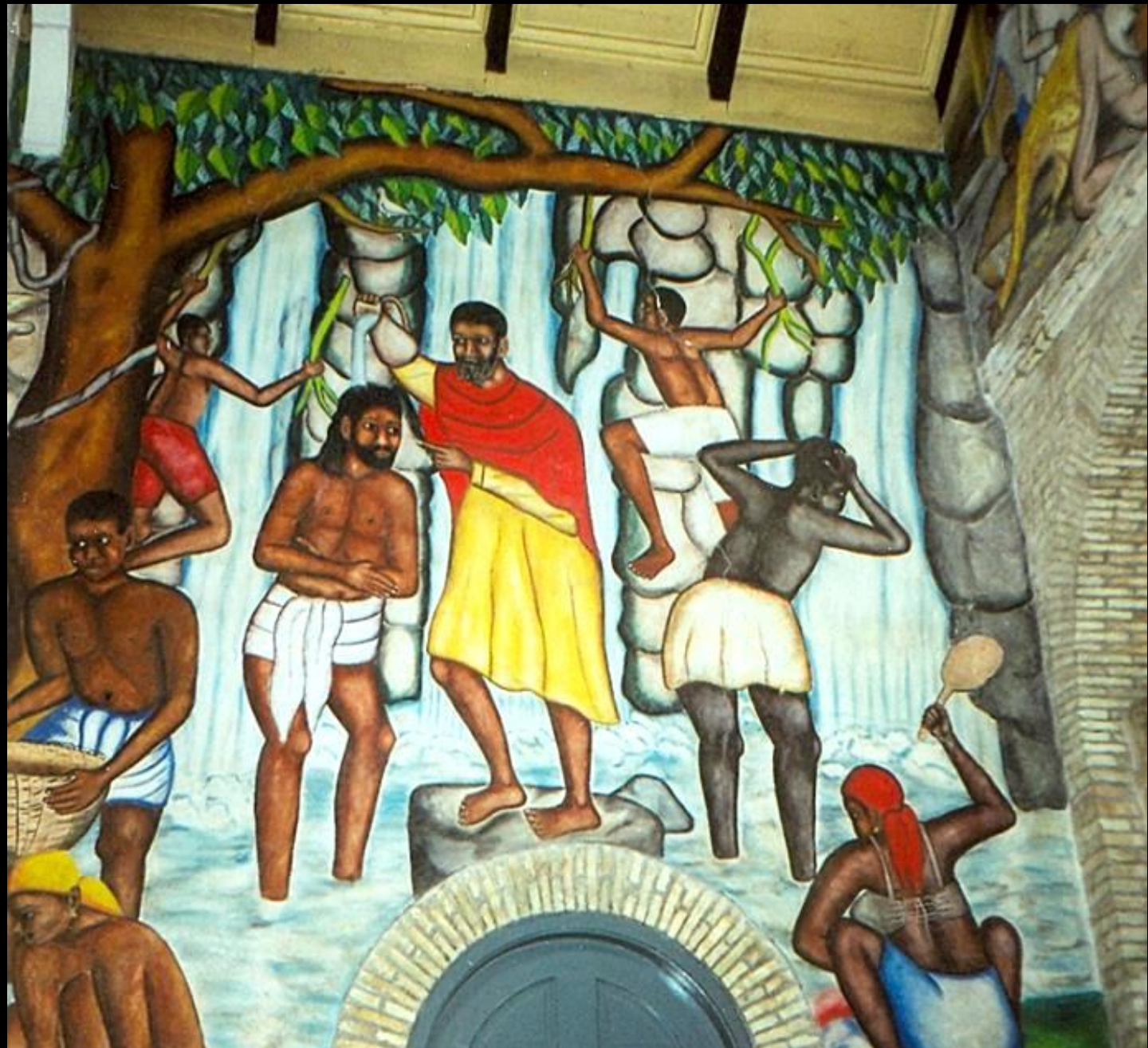
Baptism of Christ Castera Bazile Cathedrale de Sainte Trinite Port-au-Prince, Haiti