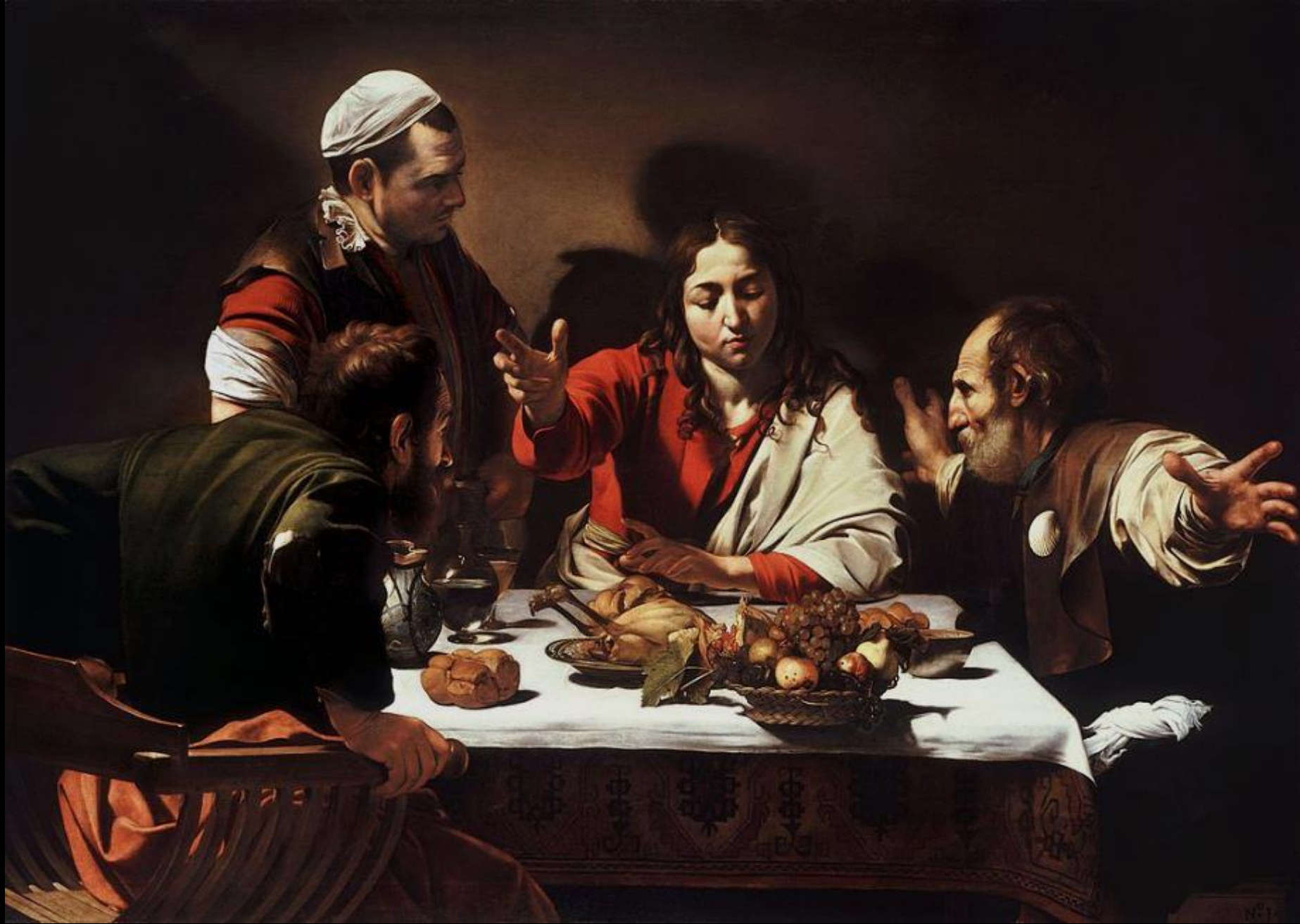
Supper at Emmaus -- Caravaggio, National Gallery, London