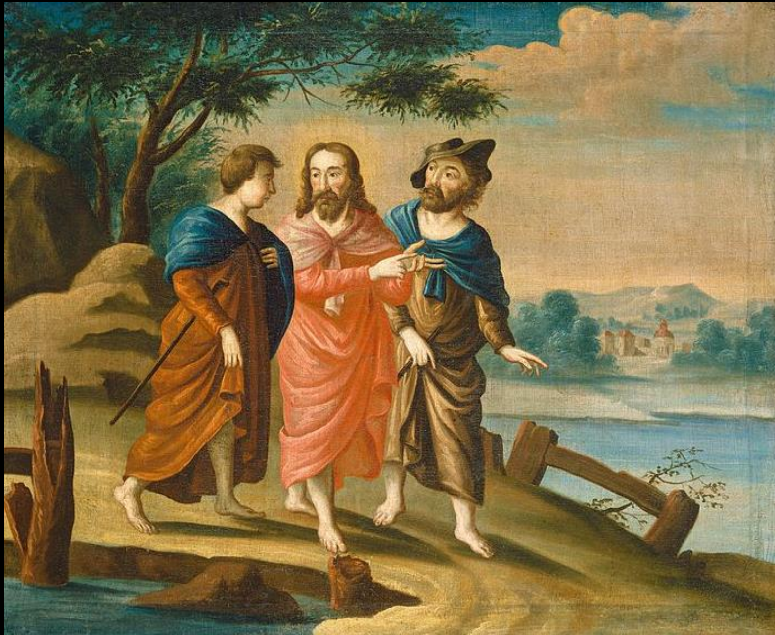
Road to Emmaus -- American, early 18 th c., National Gallery of Art, DC