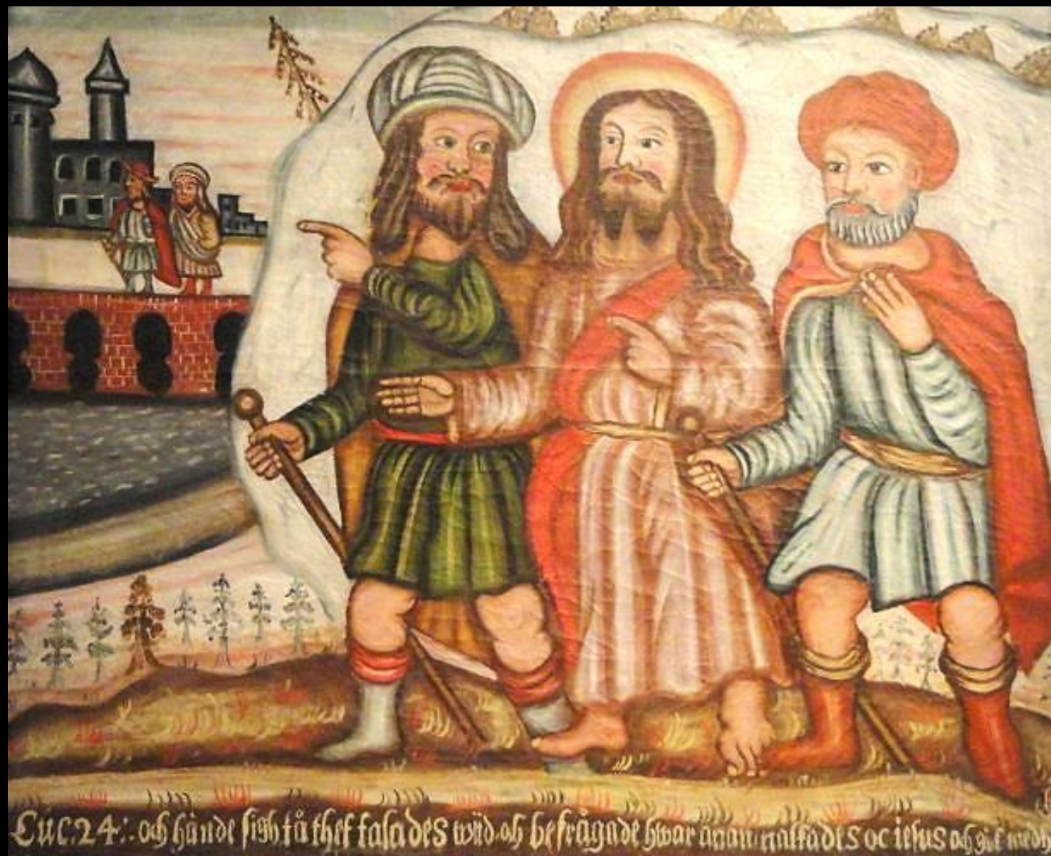
Road to Emmaus -- National Museum of Finland, Helsinki