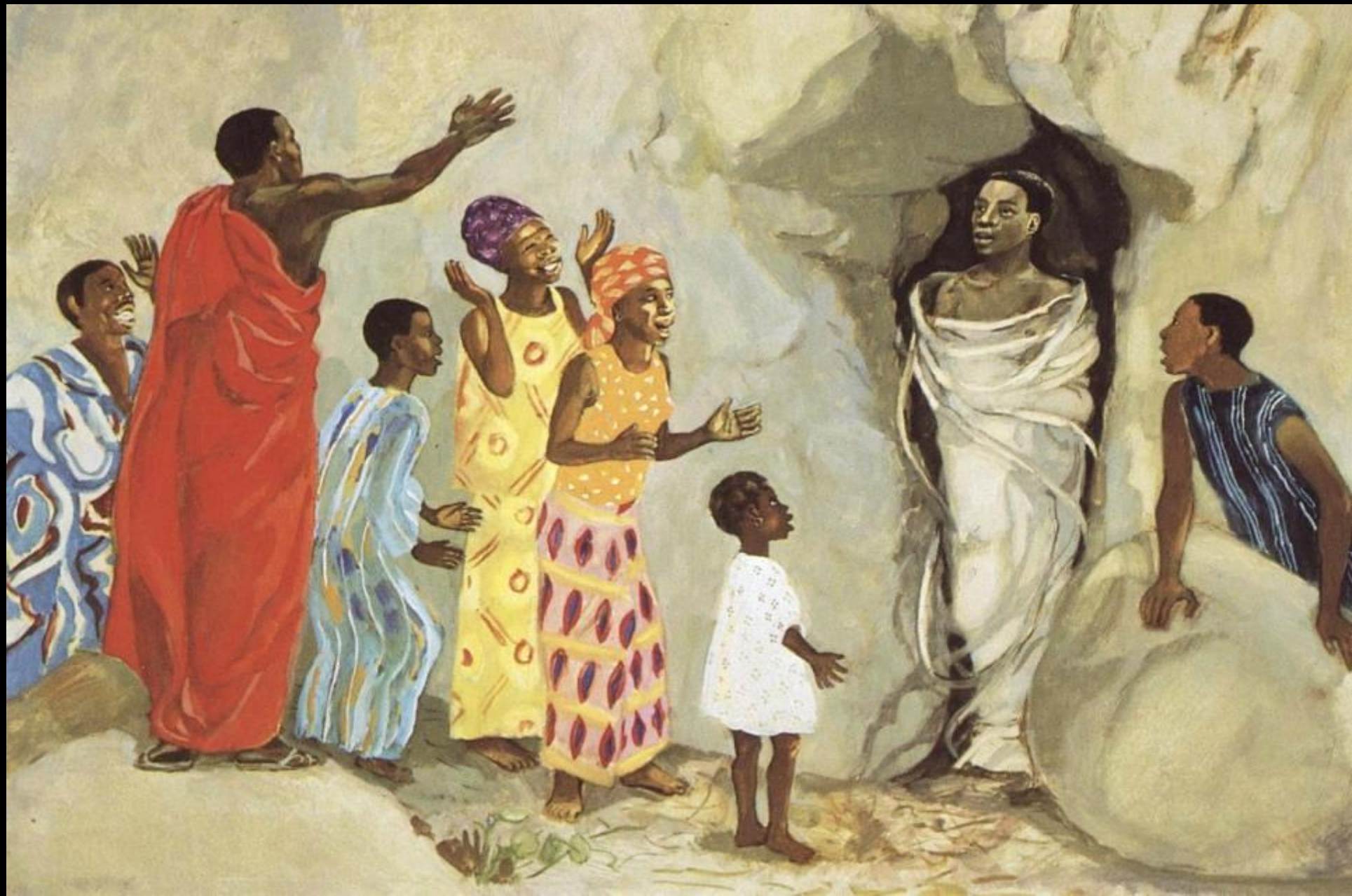
Christ Calls to Lazarus -- JESUS MAFA, Cameroon