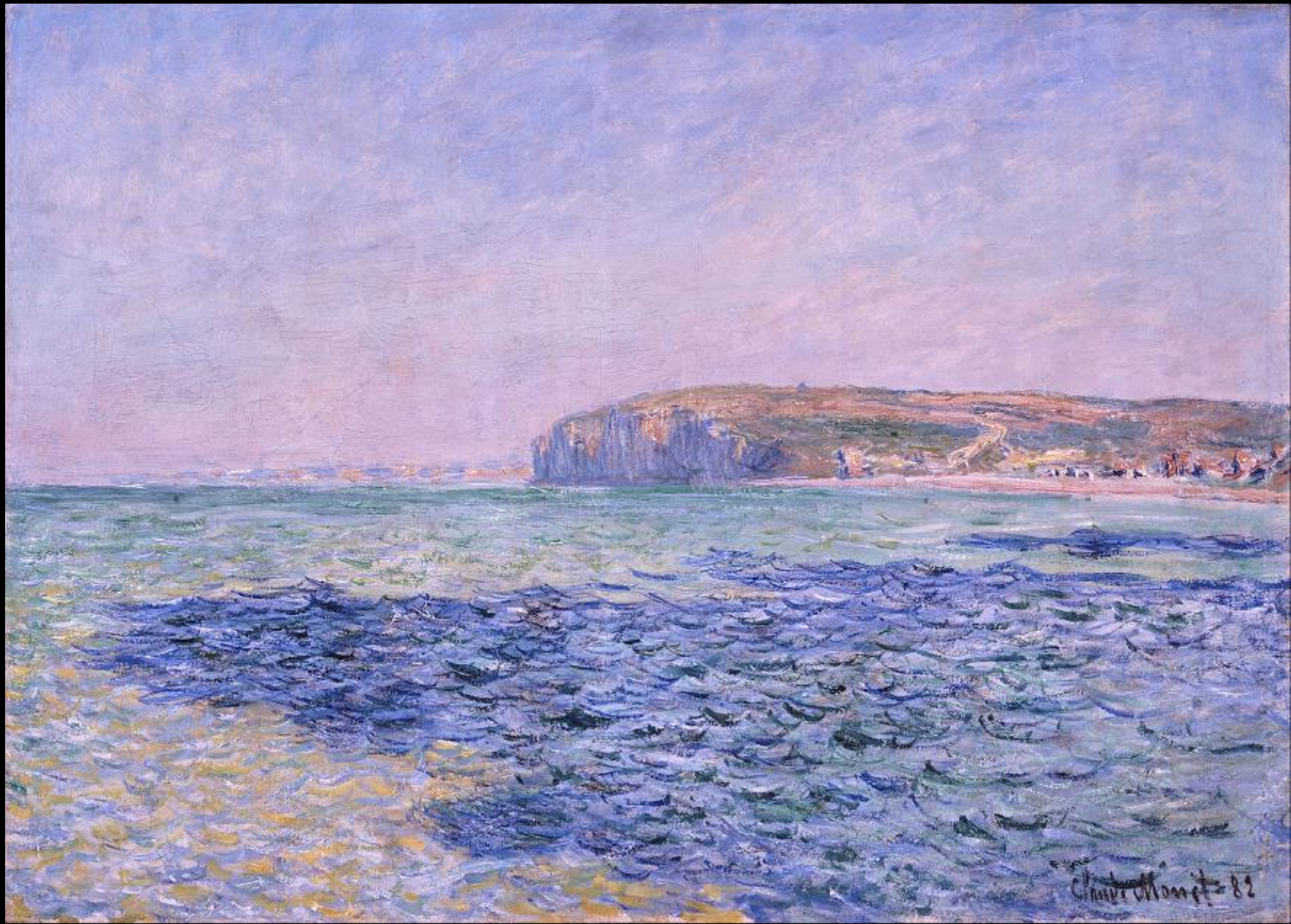
Cliffs at Pourville -- Claude Monet, Ny Carlsberg Glyptotek, Copenhagen, Denmark