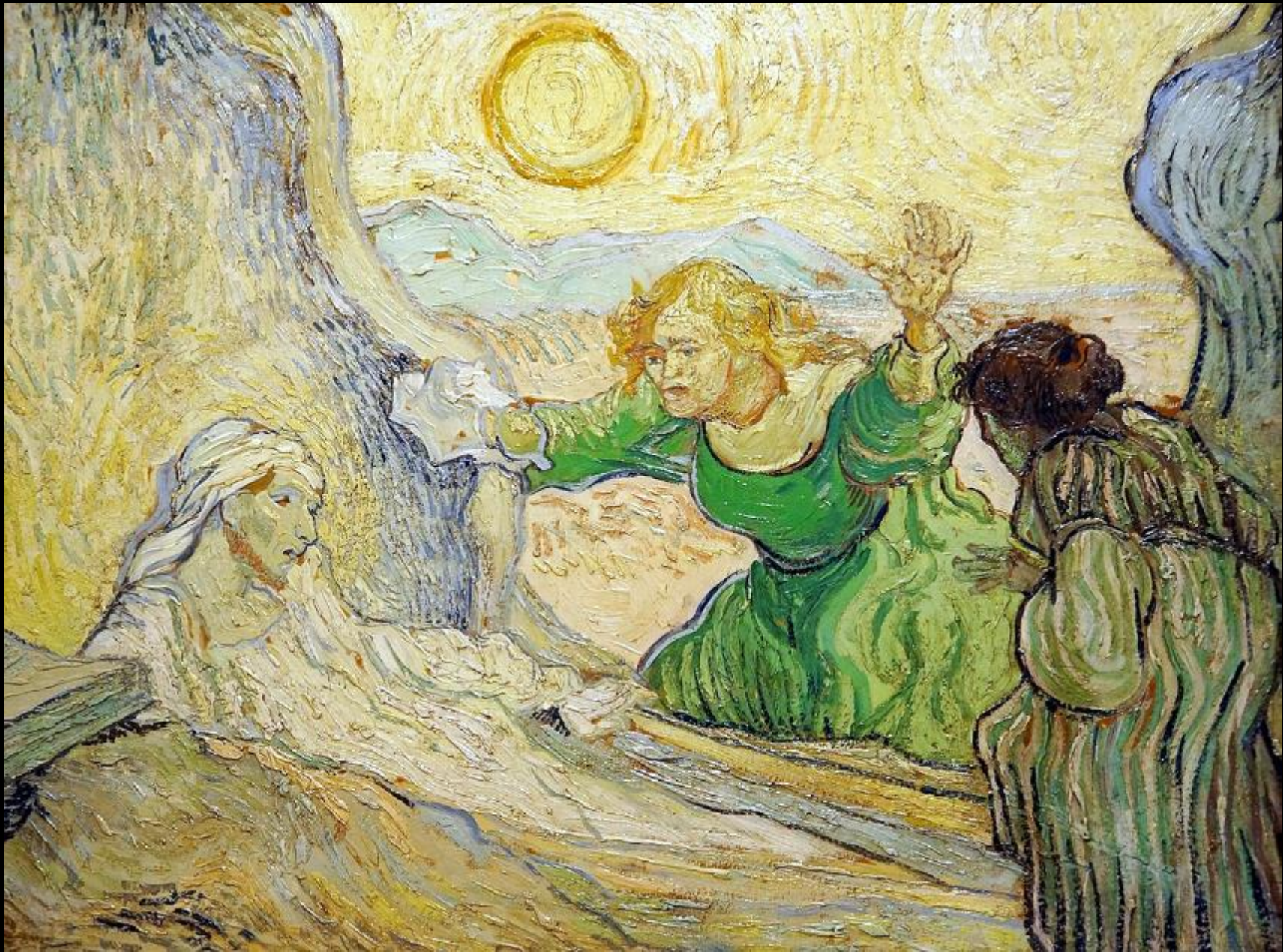
Raising of Lazarus -- Vincent van Gogh, Van Gogh Museum, Amsterdam, Netherlands