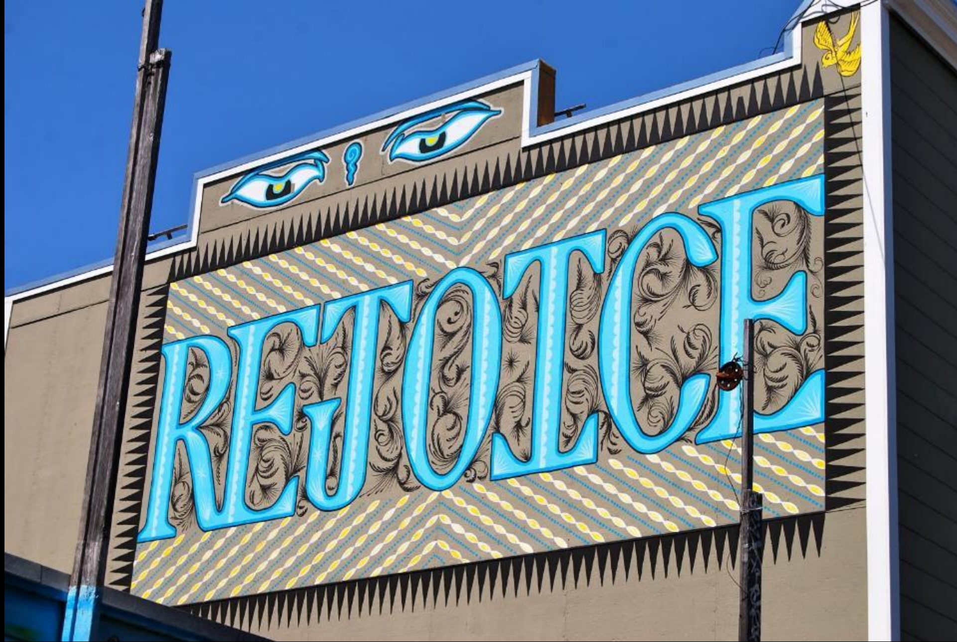
Rejoice Mural -- Mission District, San Francisco, CA