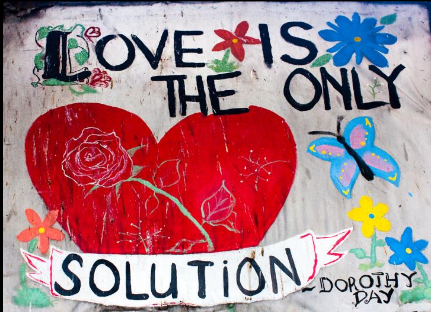
"Love is the Only Solution" - Dorothy Day -- Mural in San Francisco, CA