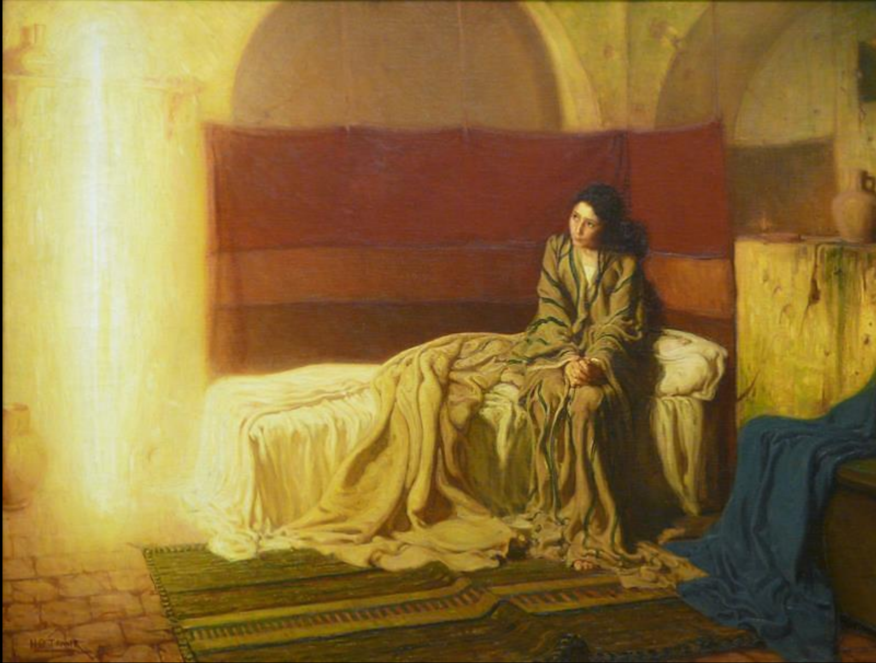
The Annunciation -- Henry Ossawa Tanner, Philadelphia Museum of Art, Philadelphia, PS