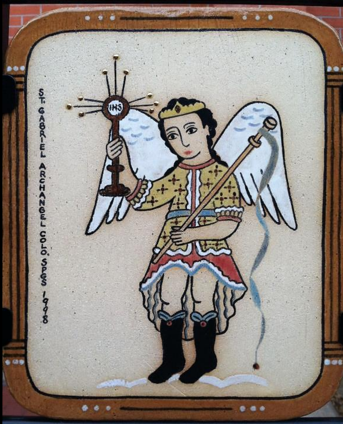
St. Gabriel, Personal icon