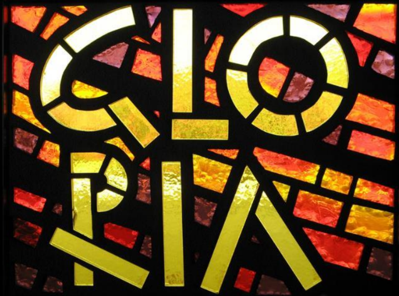
Gloria! -- Prince of Peace Abbey, Oceanside, CA