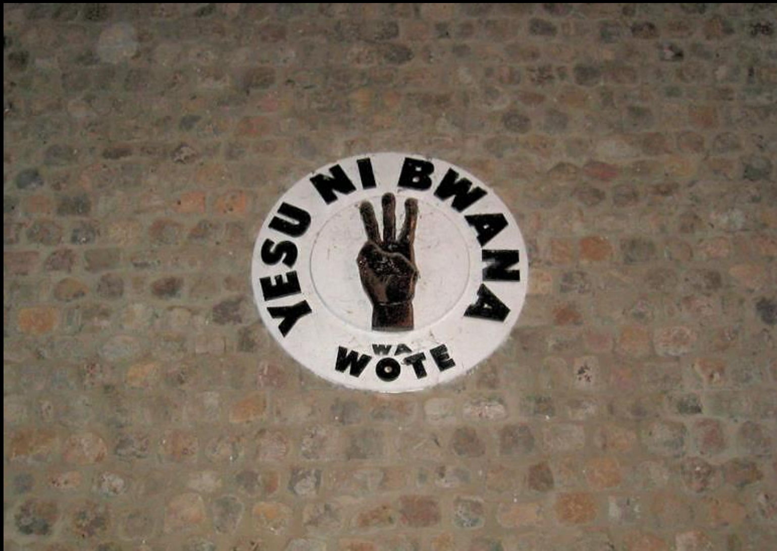
Jesus is Lord of All -- Panel in Chapel, Mulungwishi Mission, D. R. Congo