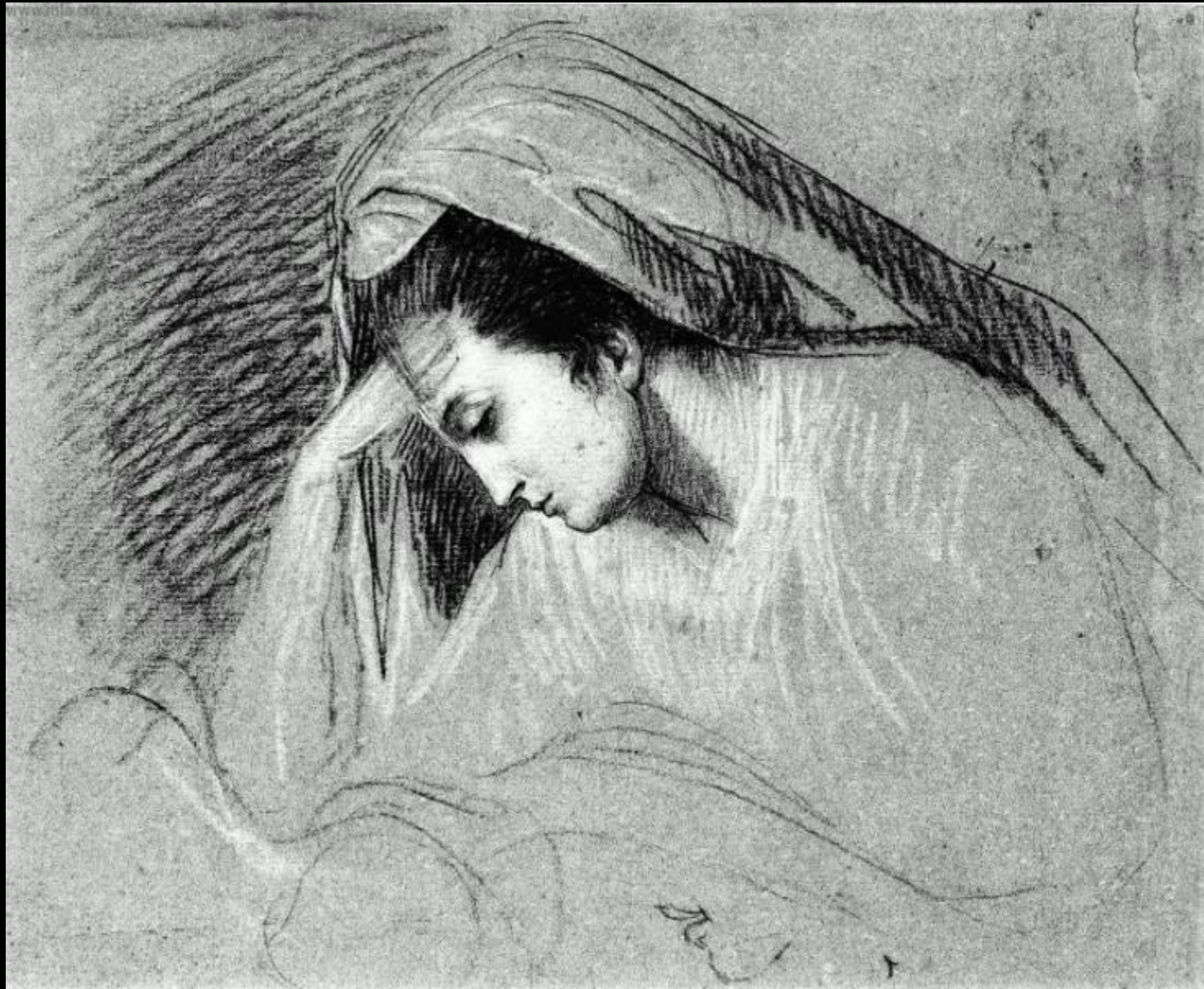
Study for the Head of the Virgin -- John Singleton Copley, Museum of Fine Arts, Boston, MA