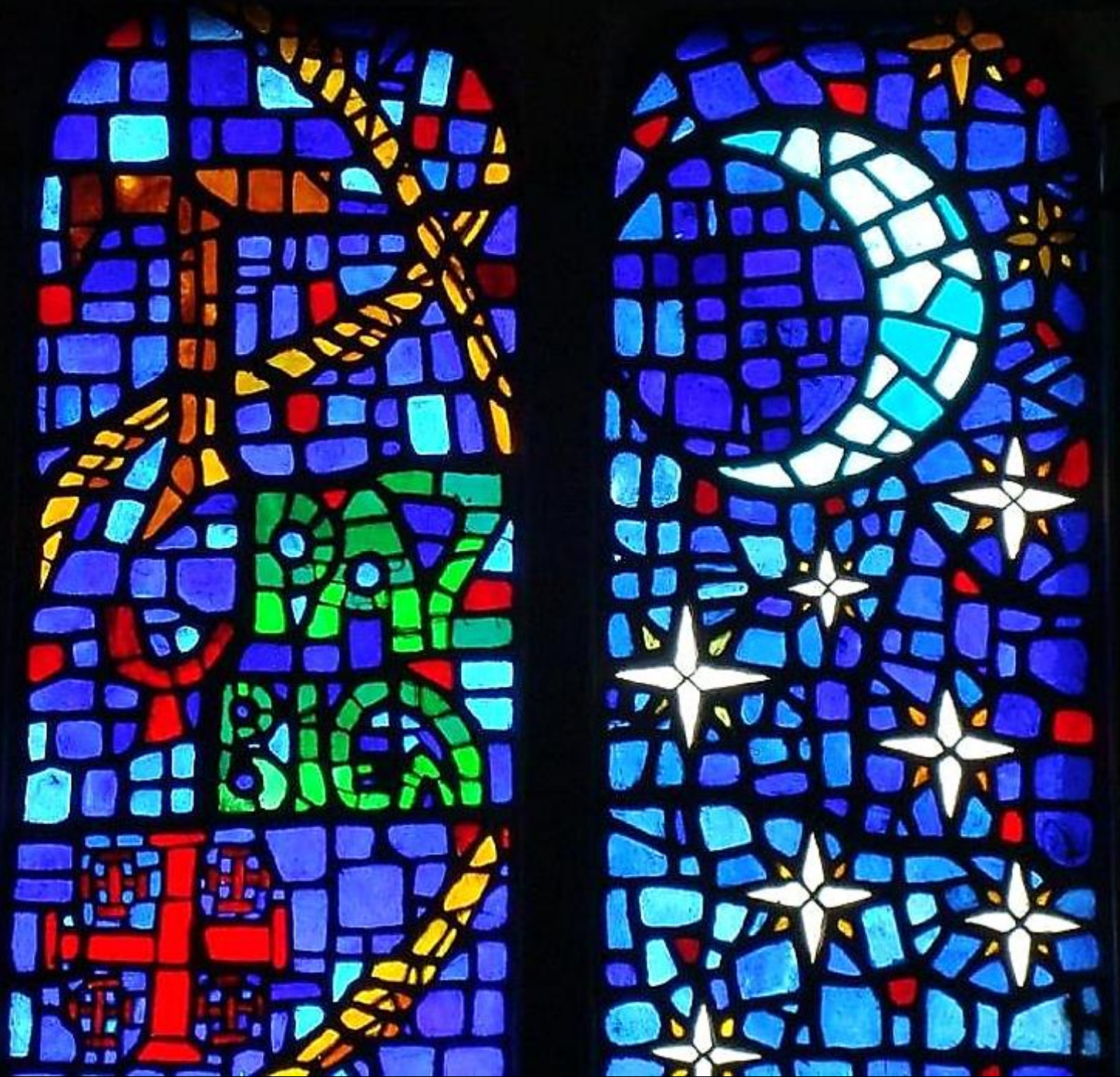
Moon and the Stars Window