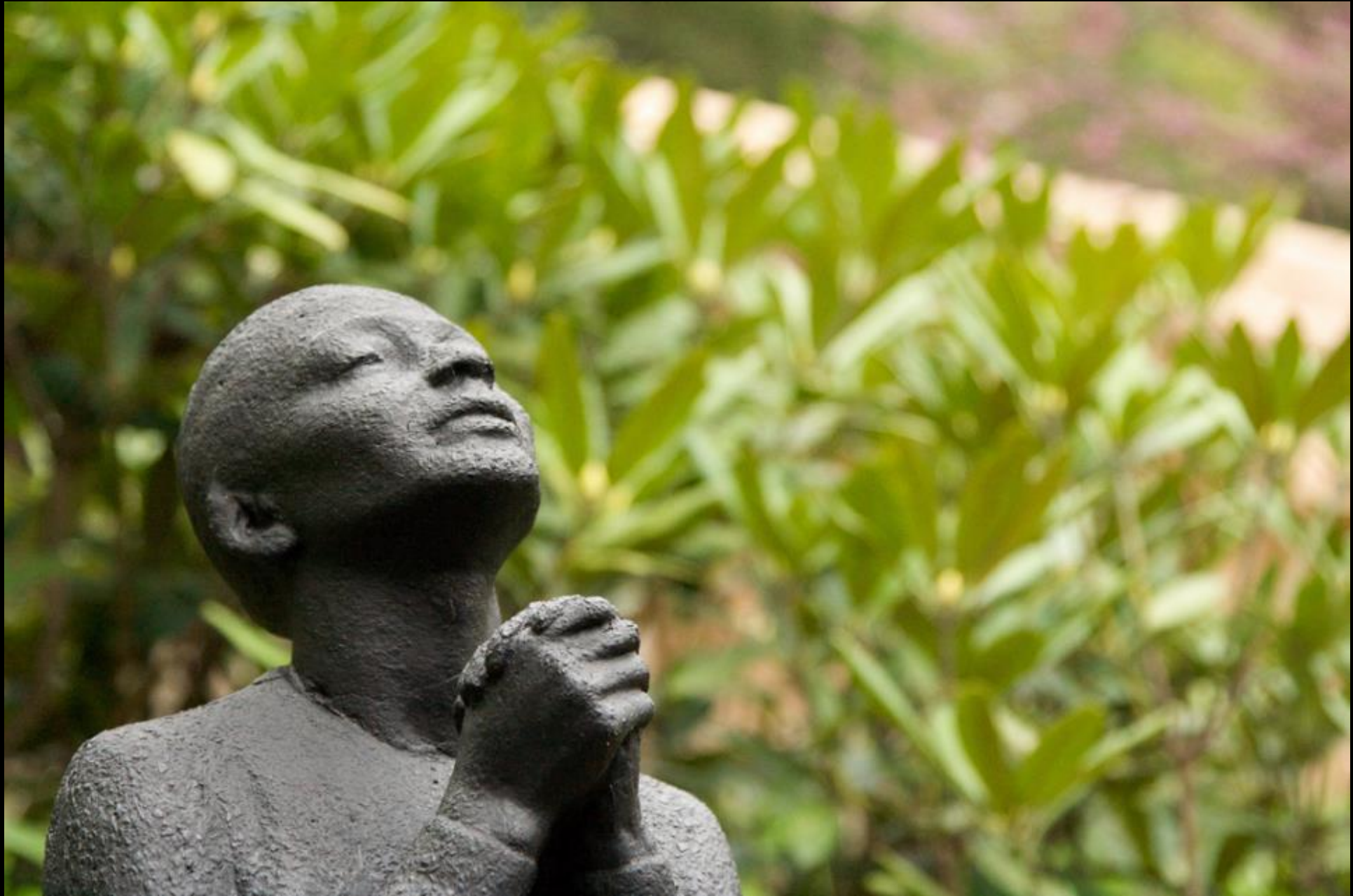
Rose McClendon in Prayer -- Richmond Barthe, Fallingwater, PA