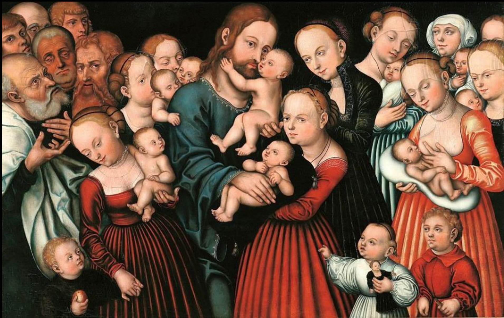
Christ Blessing the Children -- Lucas Cranach, Wawel Castle, Krakow, Poland