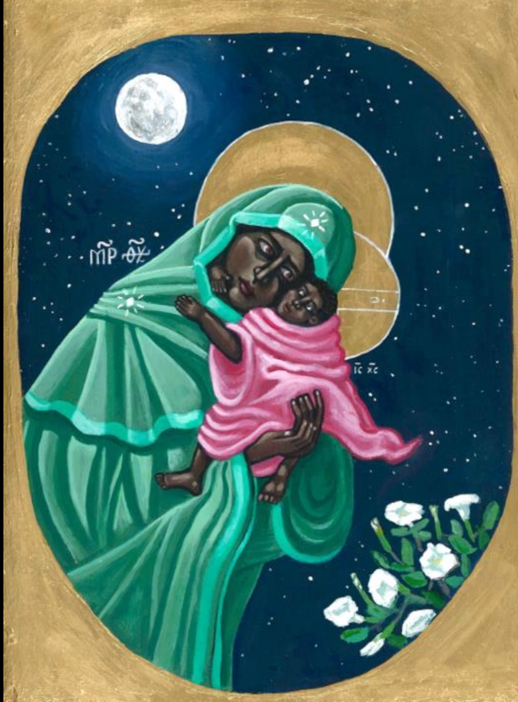
Mary and Jesus