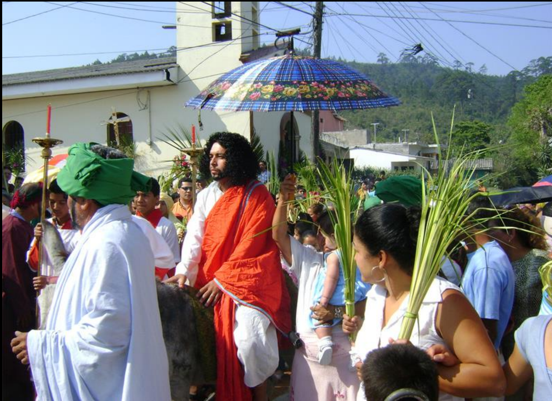
Palm Sunday Procession -- Honduras