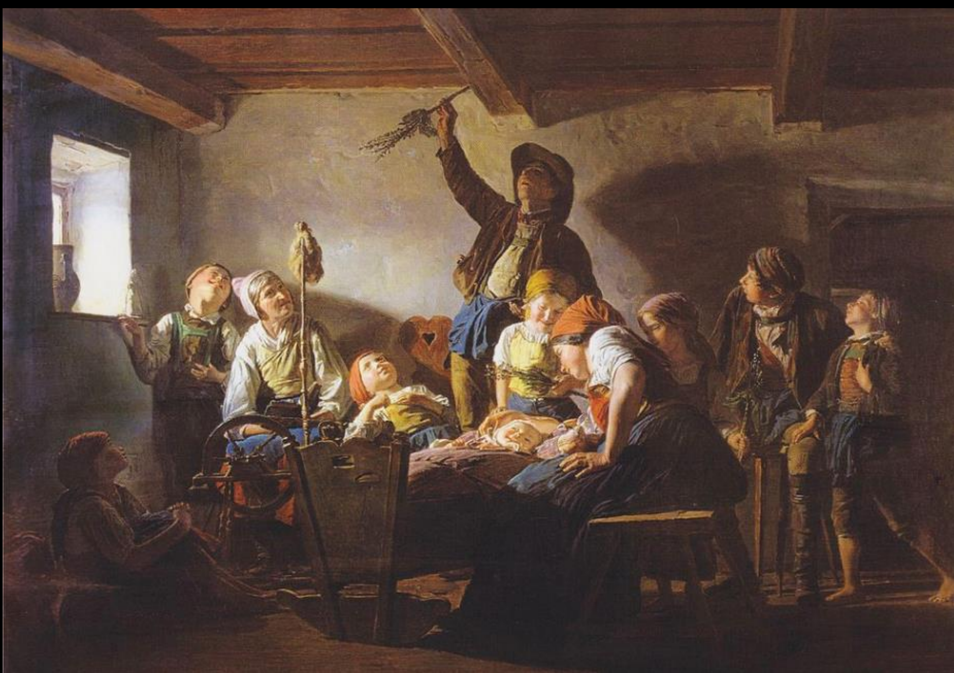
Palm Sunday -- Ferdinand Georg Waldmüller, Moravian Gallery, Brno, Czech Republic