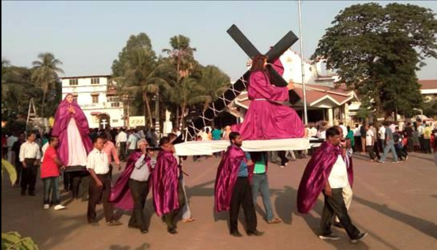
Palm Sunday Procession -- Kurla, India