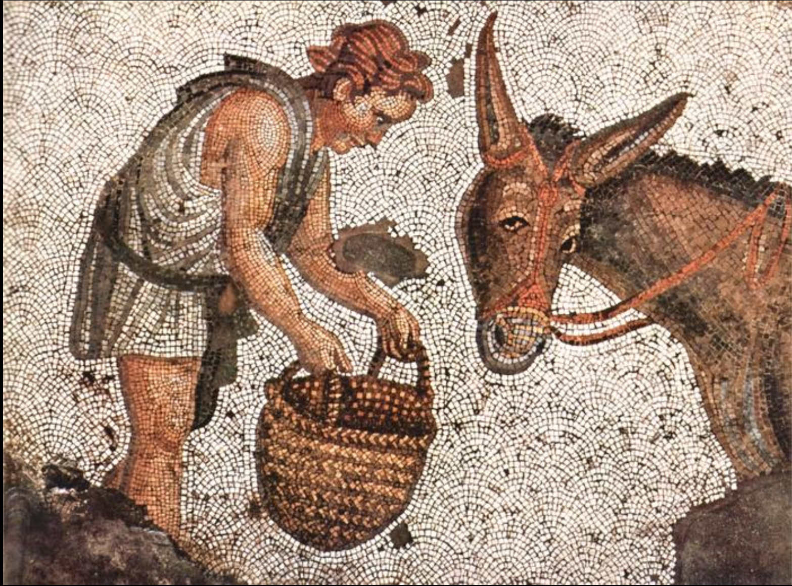
Child and Donkey -- Palace of Constantine the Great, Istanbul, Turkey