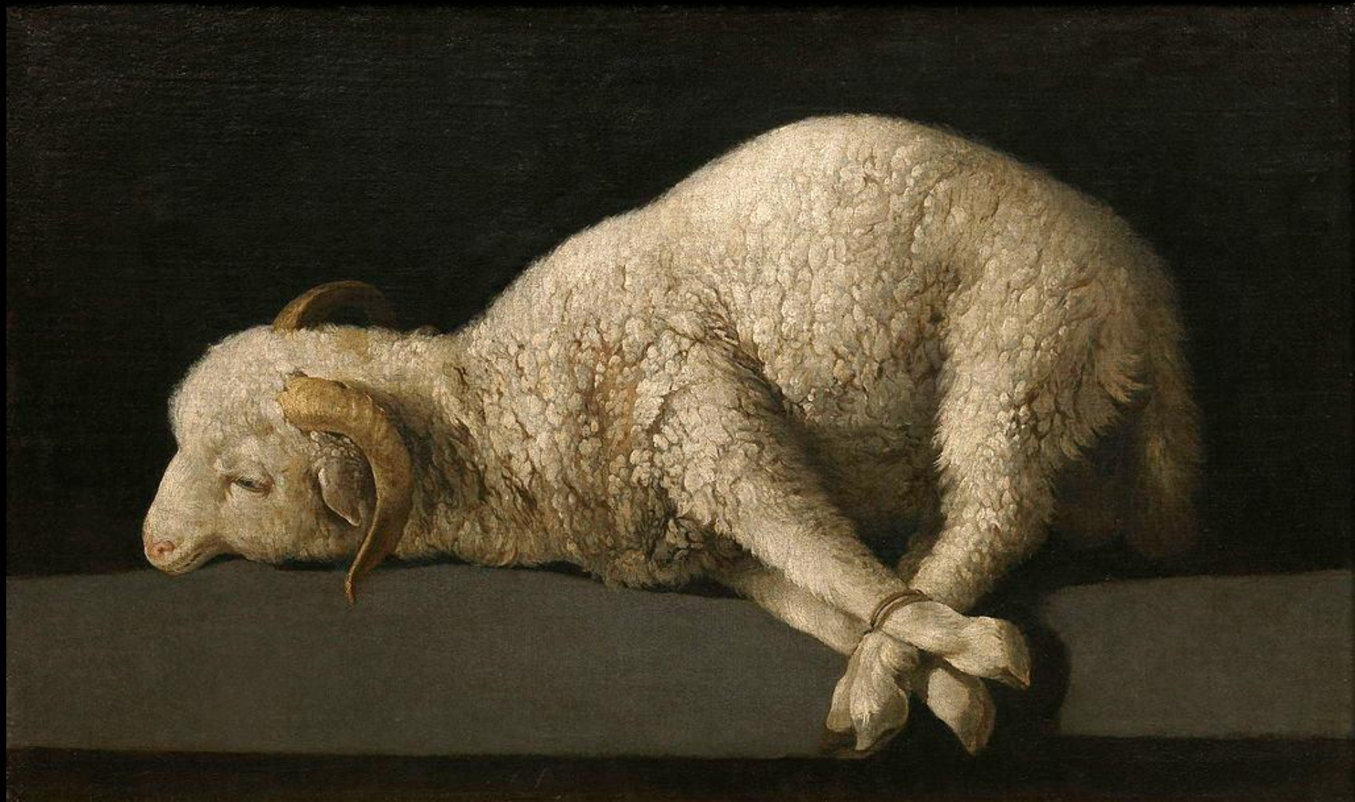
Lamb of God -- Francisco de Zurbaran, Prado, Madrid, Spain