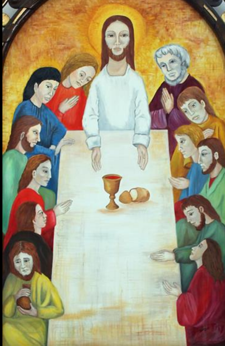
Last Supper Cathedral of Sancti Spiritus Sancti Spiritus, Cuba