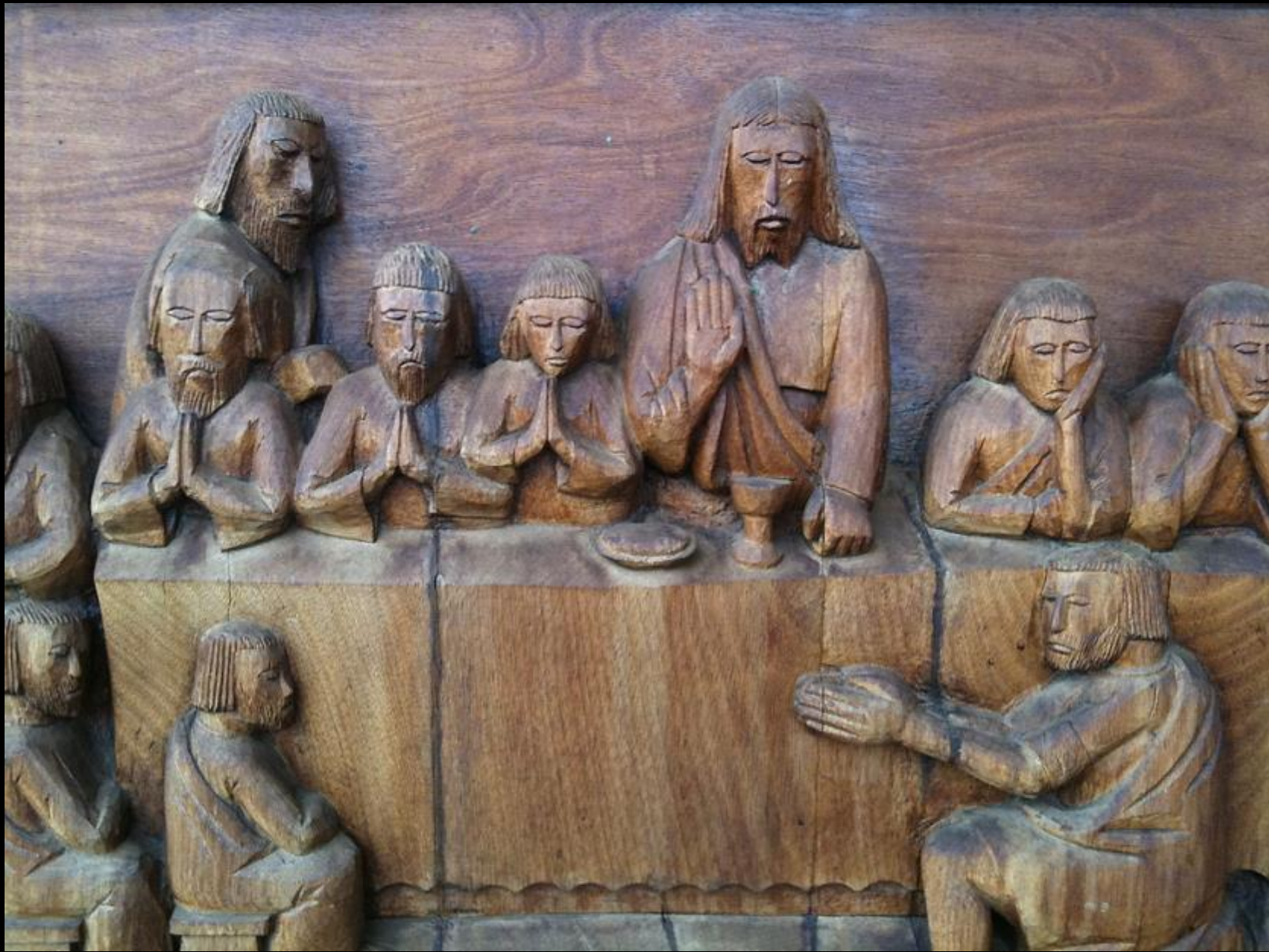
Last Supper -- Capetown, South Africa