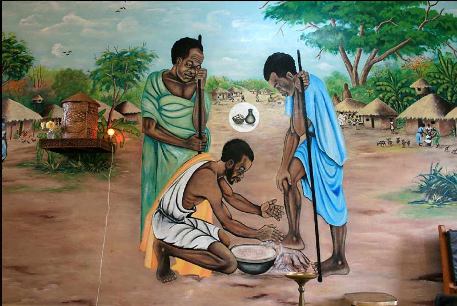
Jesus Washes His Disciples' Feet -- Victoria Falls, Zambia