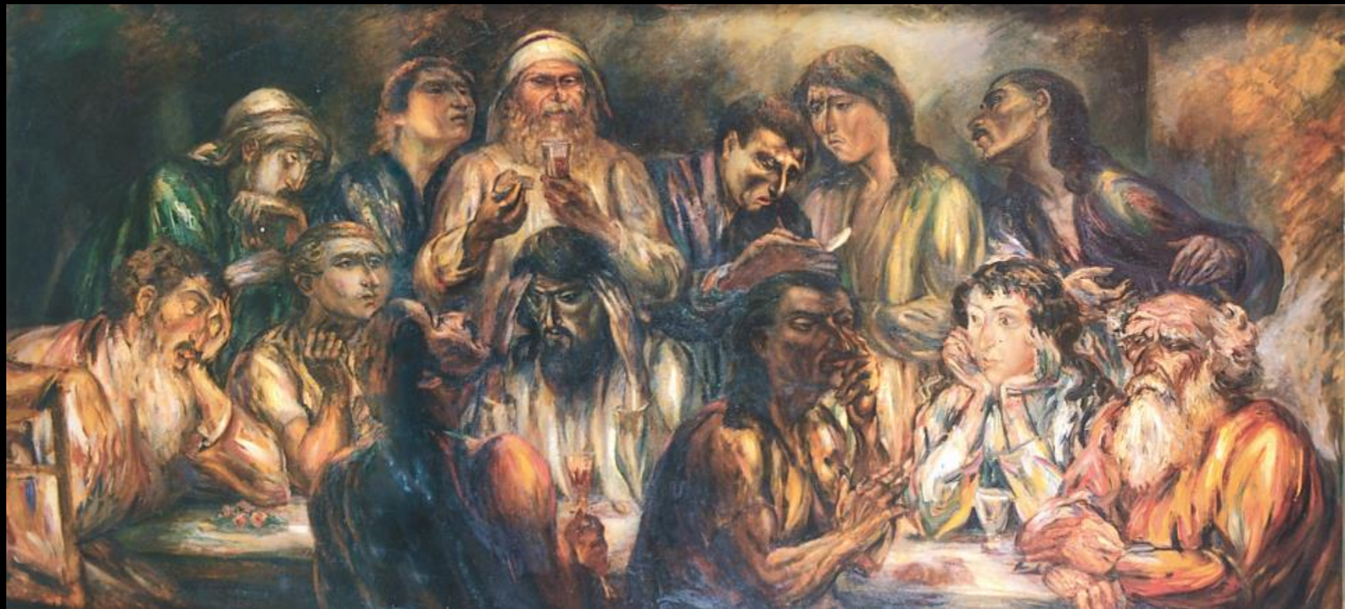
Last Supper -- Karoly Kernstok, Hungarian National Gallery, Budapest, Hungary