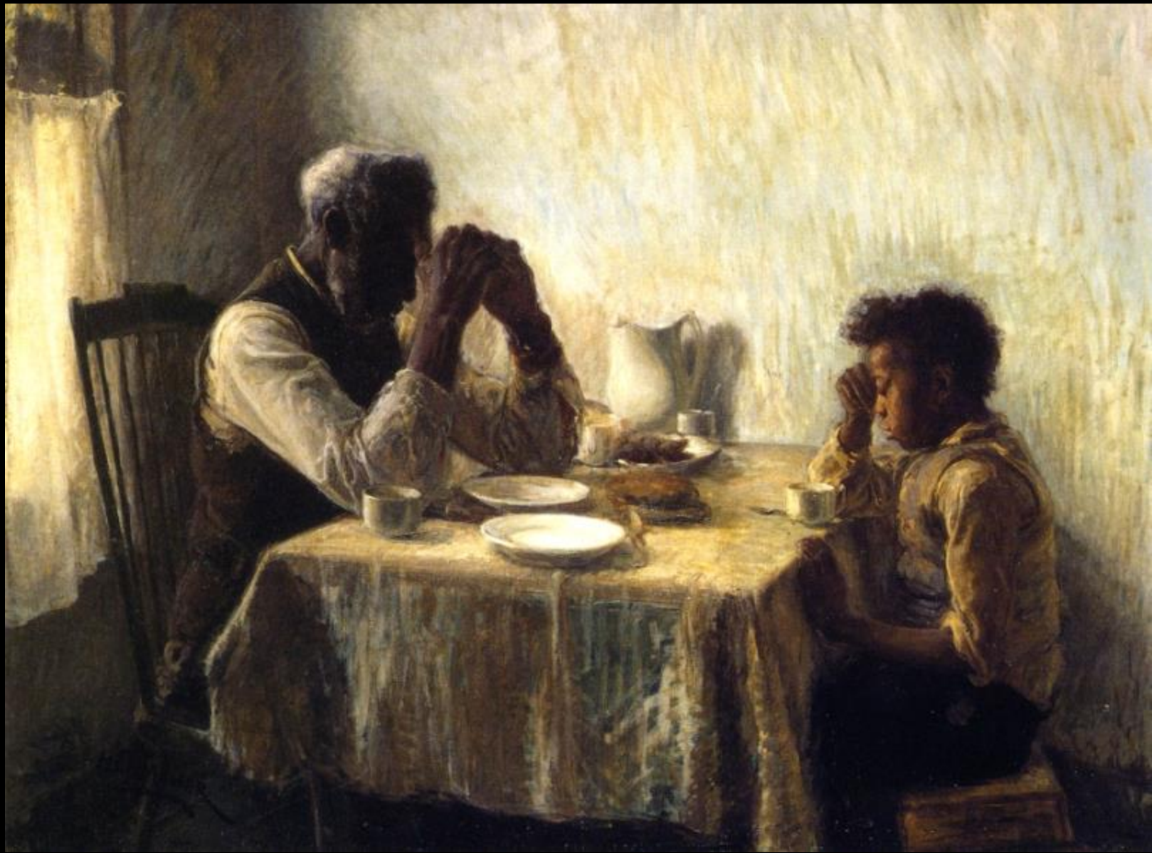
Giving Thanks -- Henry Ossawa Tanner