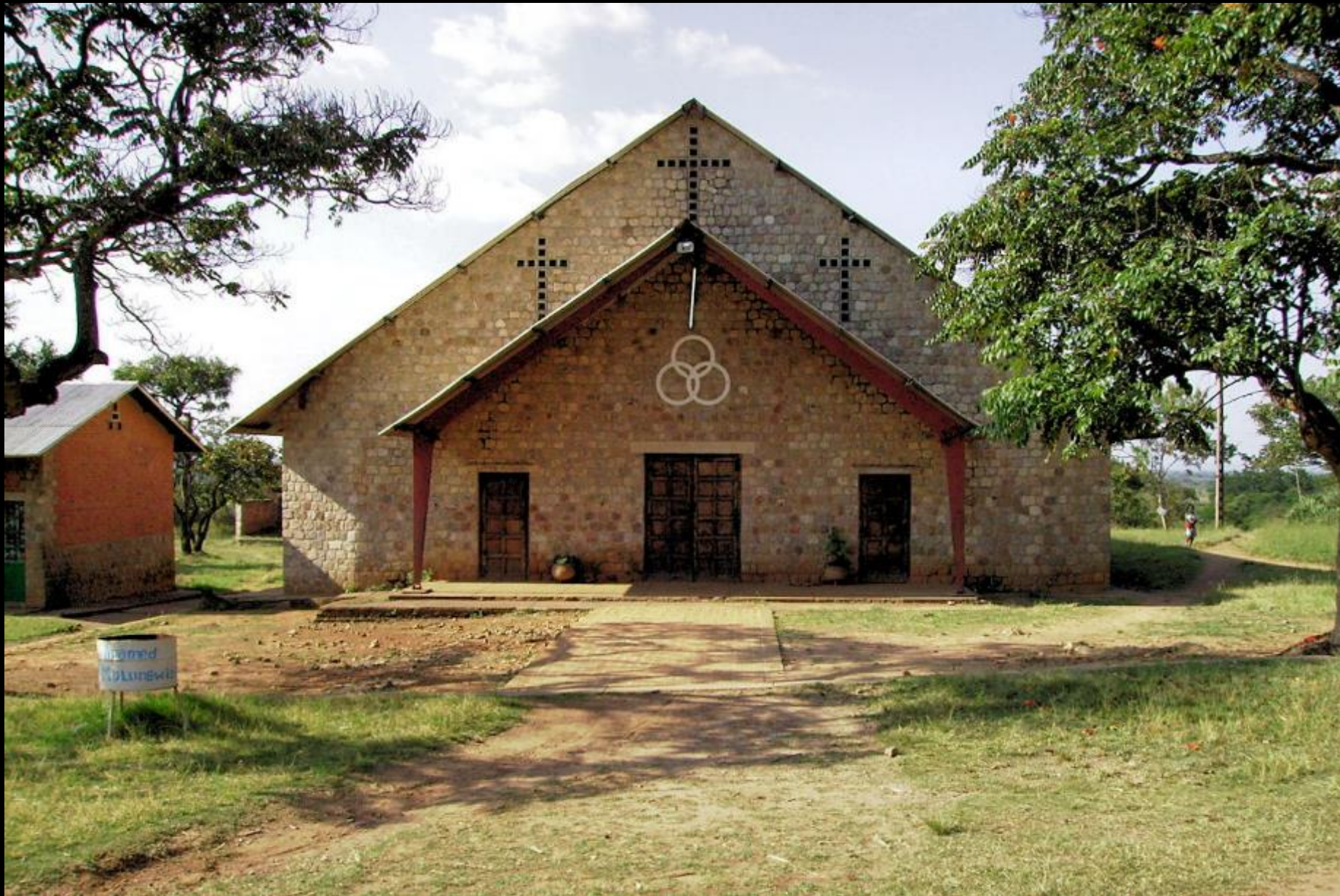
Mulungwishi United Methodist Church, Mulungwishi, Democratic Republic of Congo