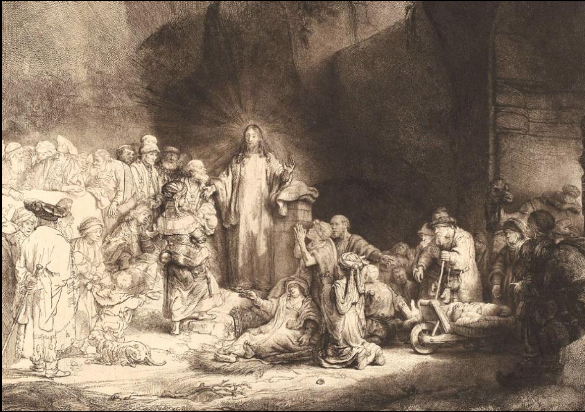
Christ Preaching -- Rembrandt, Rijksmuseum, Amsterdam, Netherlands