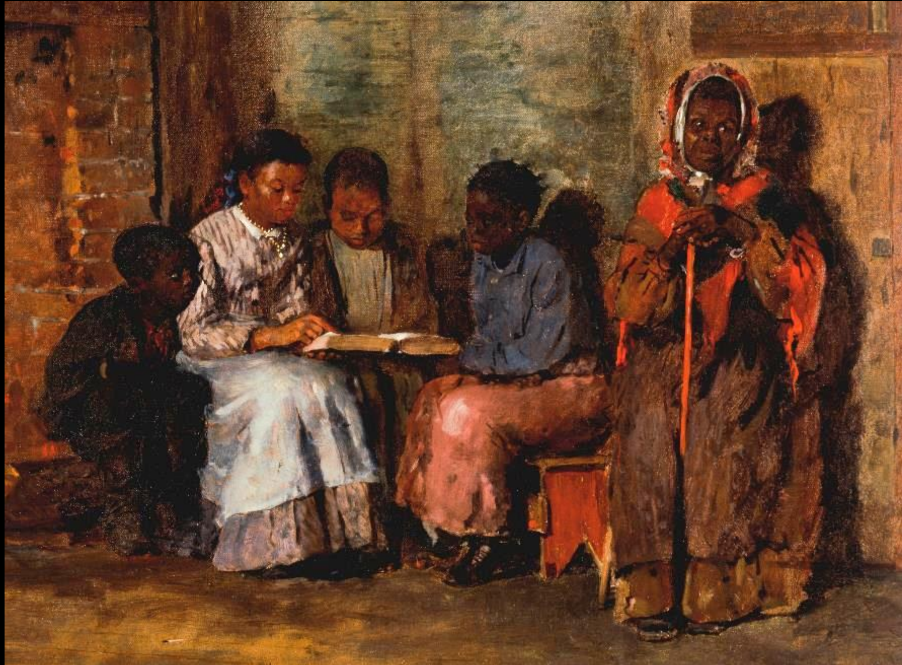
Sunday Morning in Virginia -- Winslow Homer, Cincinnati Art Museum, Cincinnati, OH