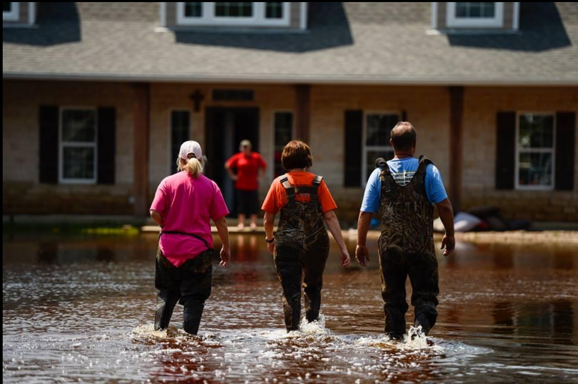
Hurricane Harvey Relief -- Orange, Texas