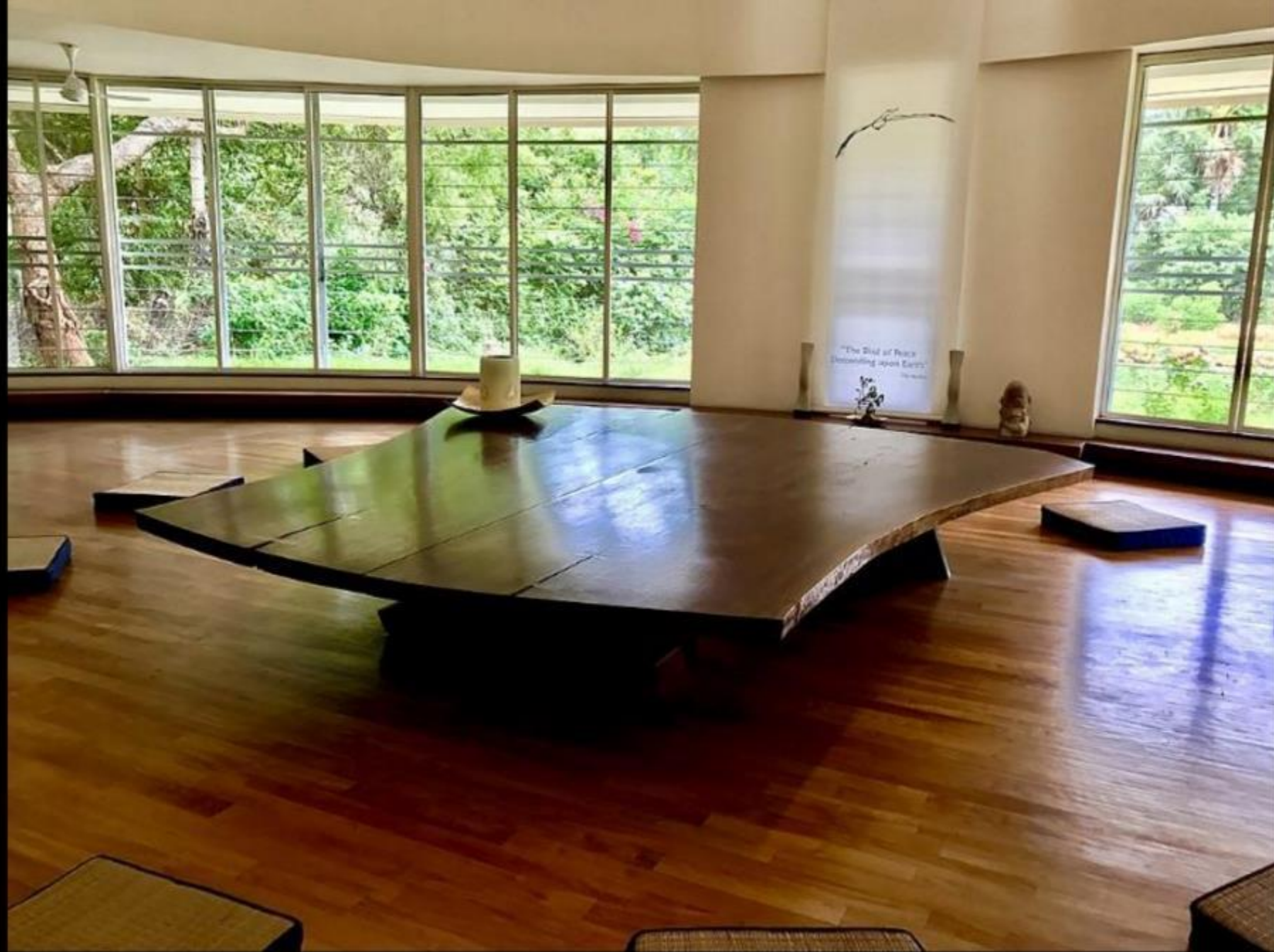
Peace Table for Asia -- George Nakashima, Hall of Peace, Auroville, India