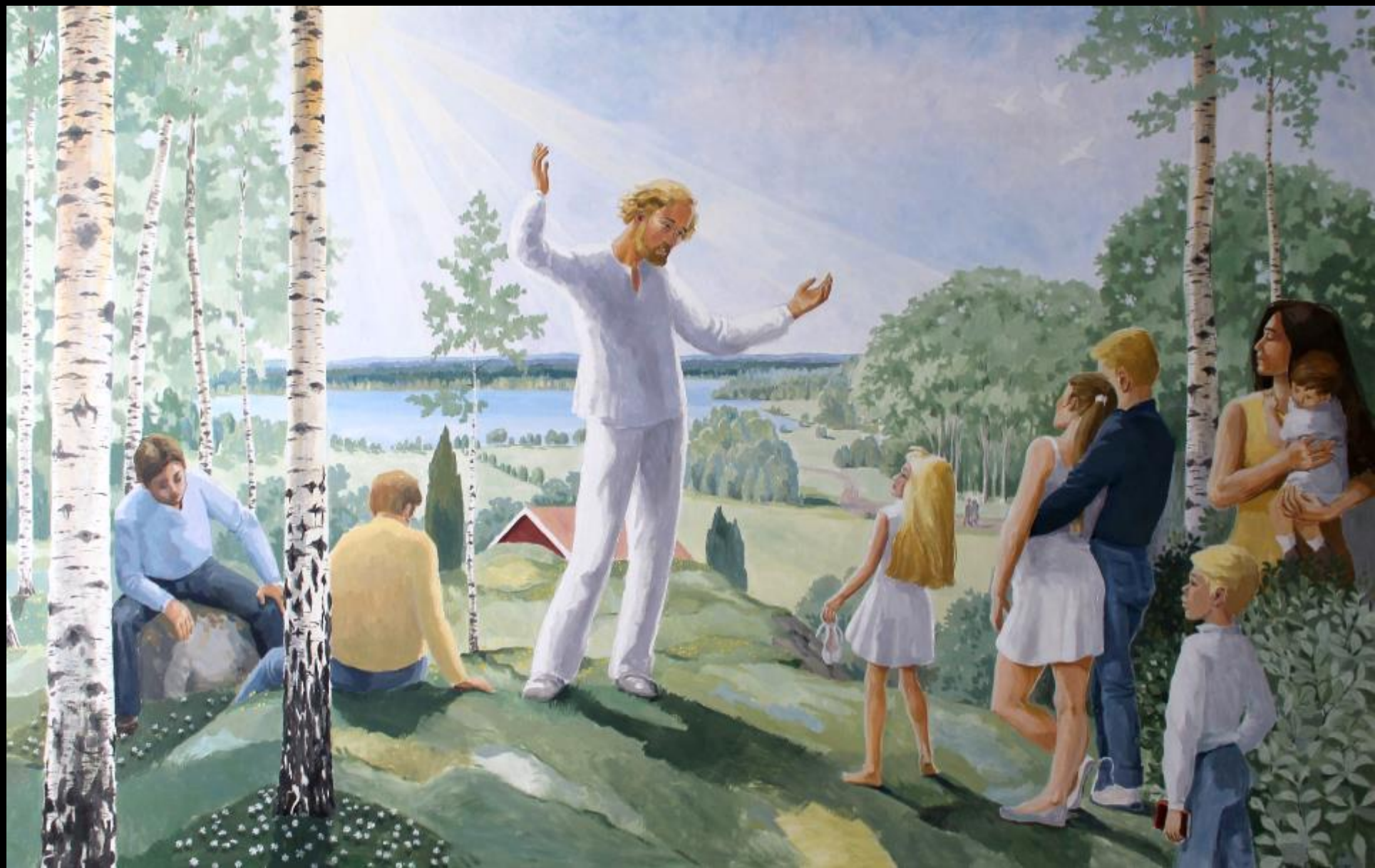
Jesus Preaching in the Present -- Soraby Kyrka, Rottne, Sweden