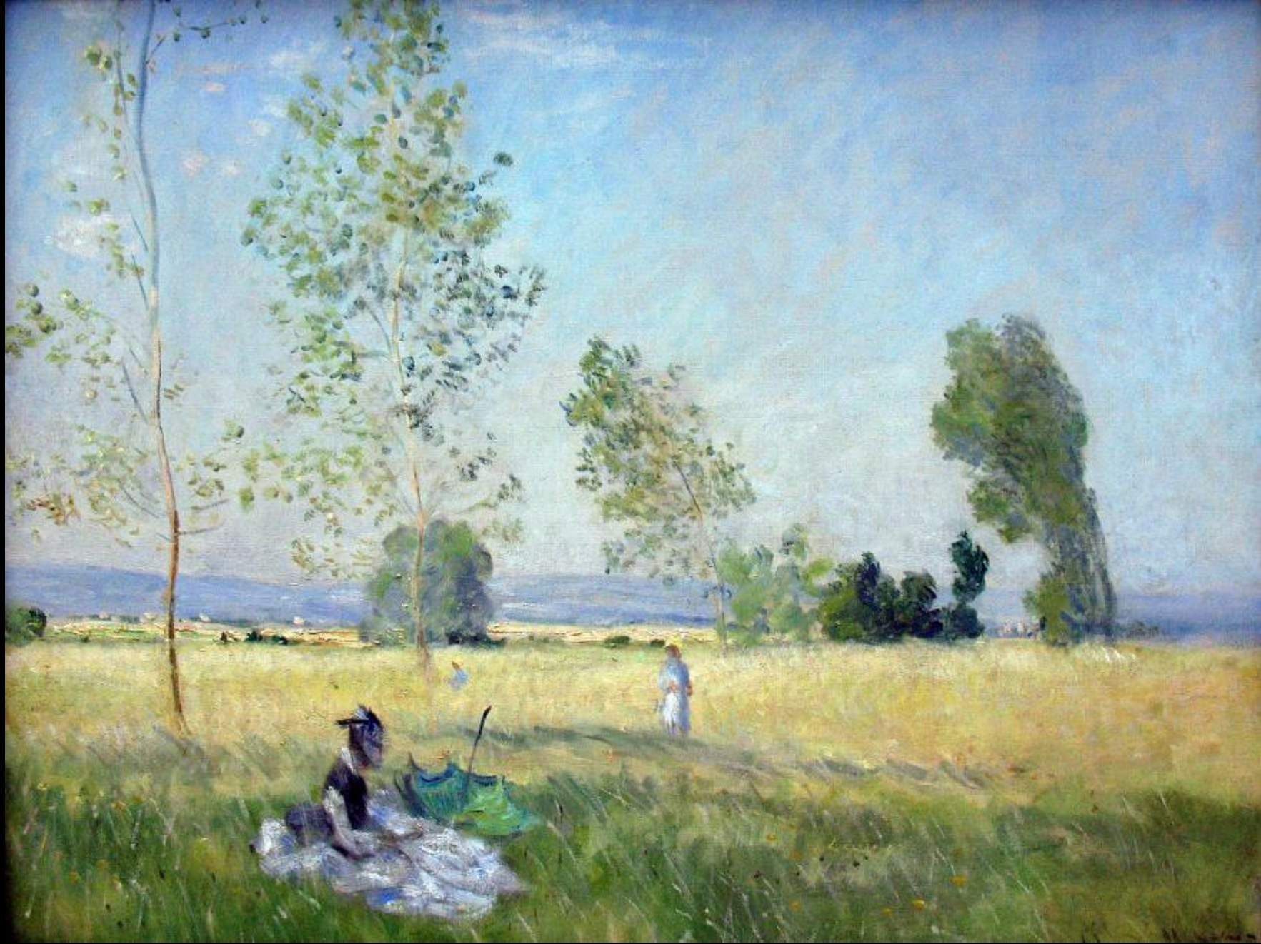
Summer -- Claude Monet, Alte Nationalgalerie, Berlin, Germany