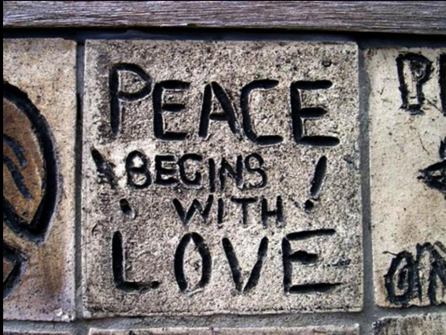
Peace Begins with Love -- Peace Wall, Hamilton, New Zealand