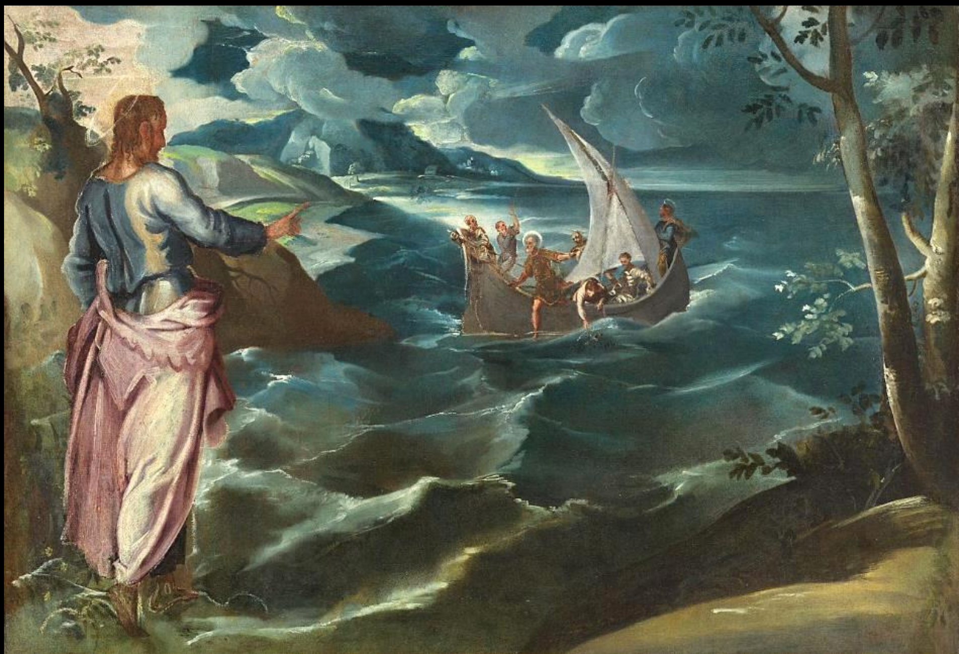
Christ at the Sea of Galilee -- Tintoretto, National Gallery of Art, Washington, DC