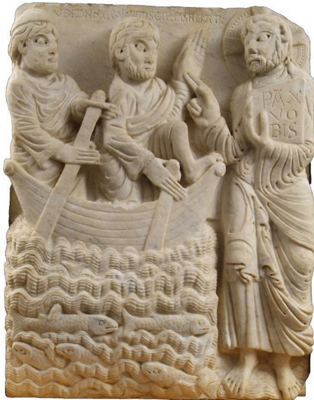
Christ Walking on the Water