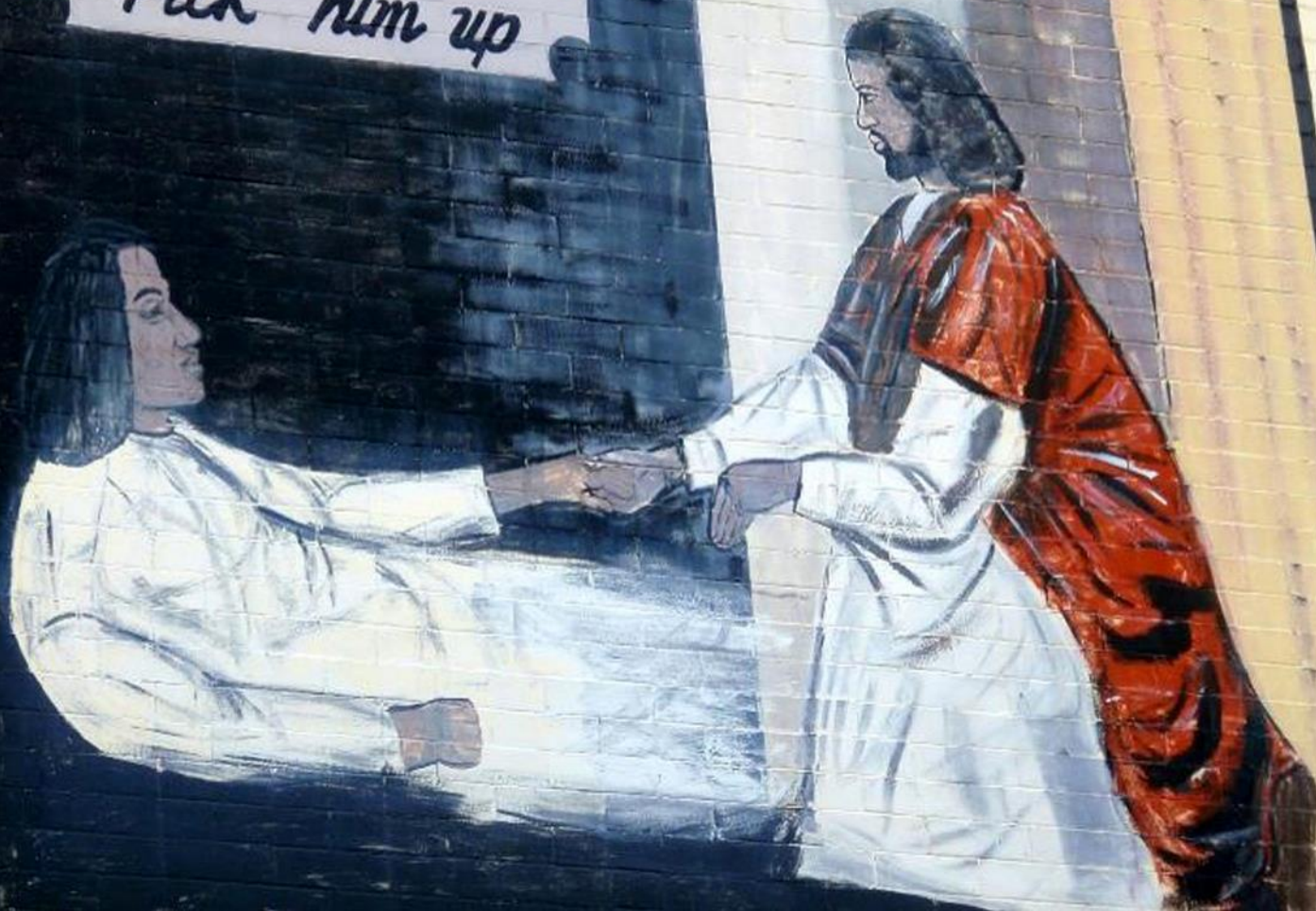
"Don't Look Down..." -- Mural, Washington, DC

Don't Look down on a man... Unless you gonna Pick him up