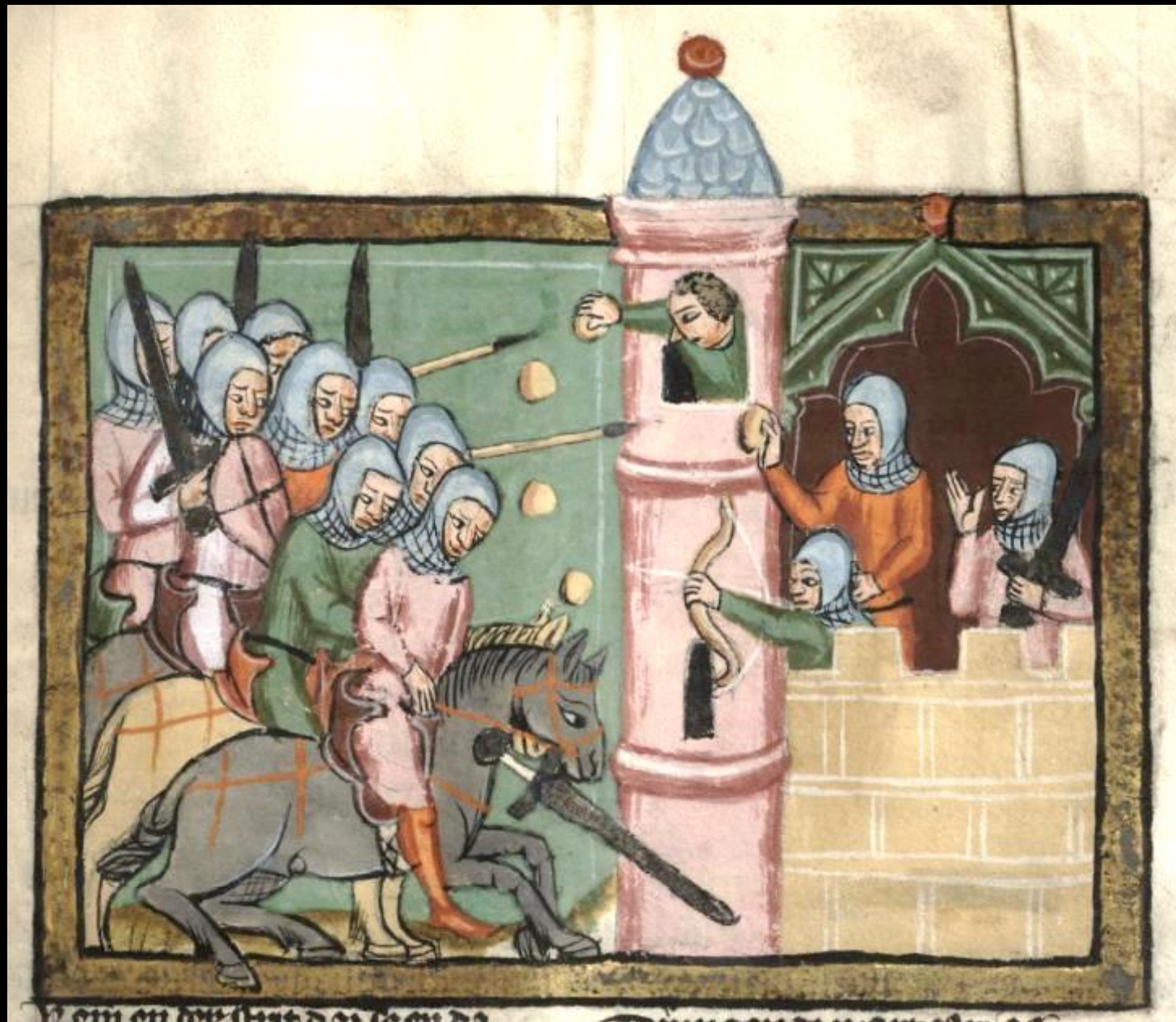
Uriah Falls at the Siege of Rabbas -- Rudolf von Ems, World Chronicle, Fulda University Library, Germany