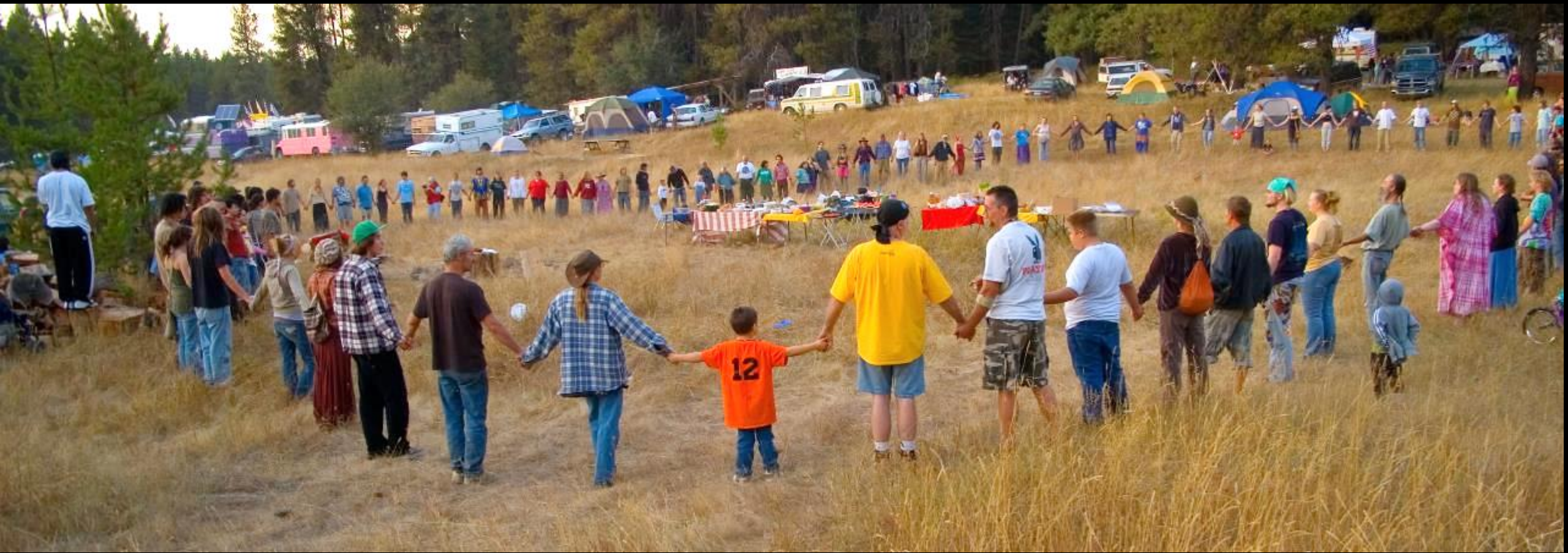
Potluck, First Lutheran Church -- Tyson Creek Station, Idaho