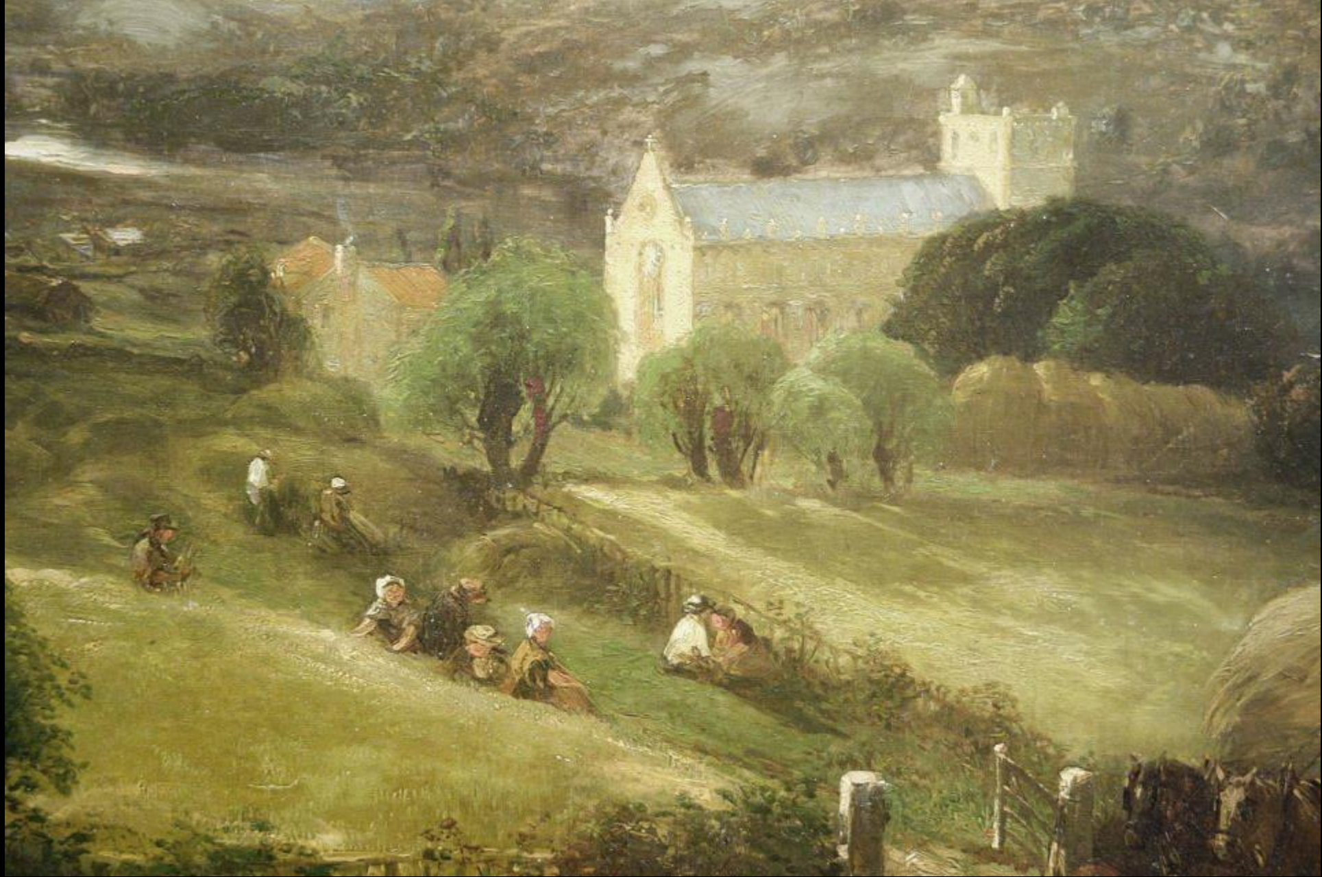
Peace and Plenty -- William Hart, New Britain Museum of American Art, New Britain, CT