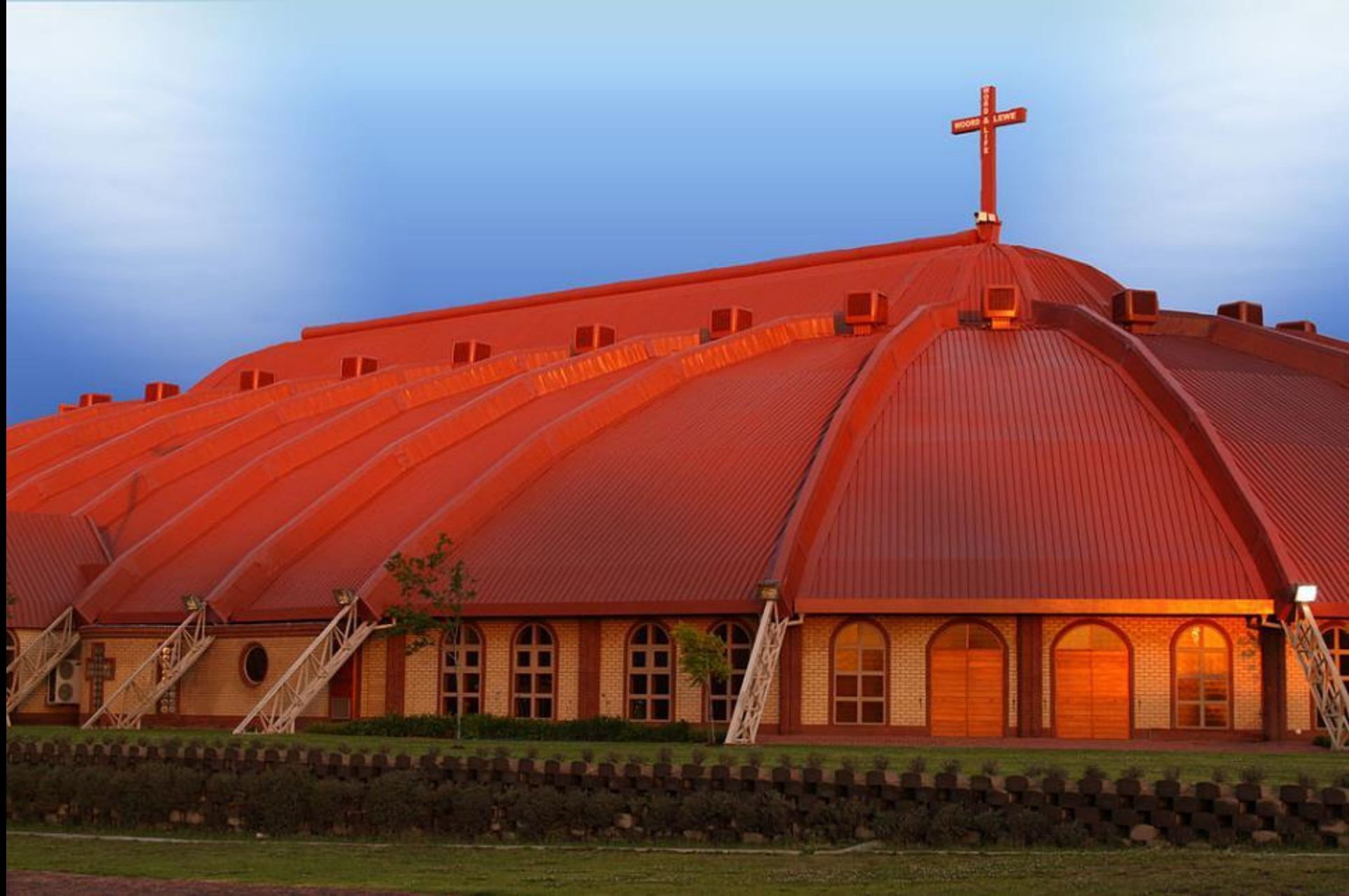
Word and Life Apostolic Mission Church -- Boksburg, South Africa