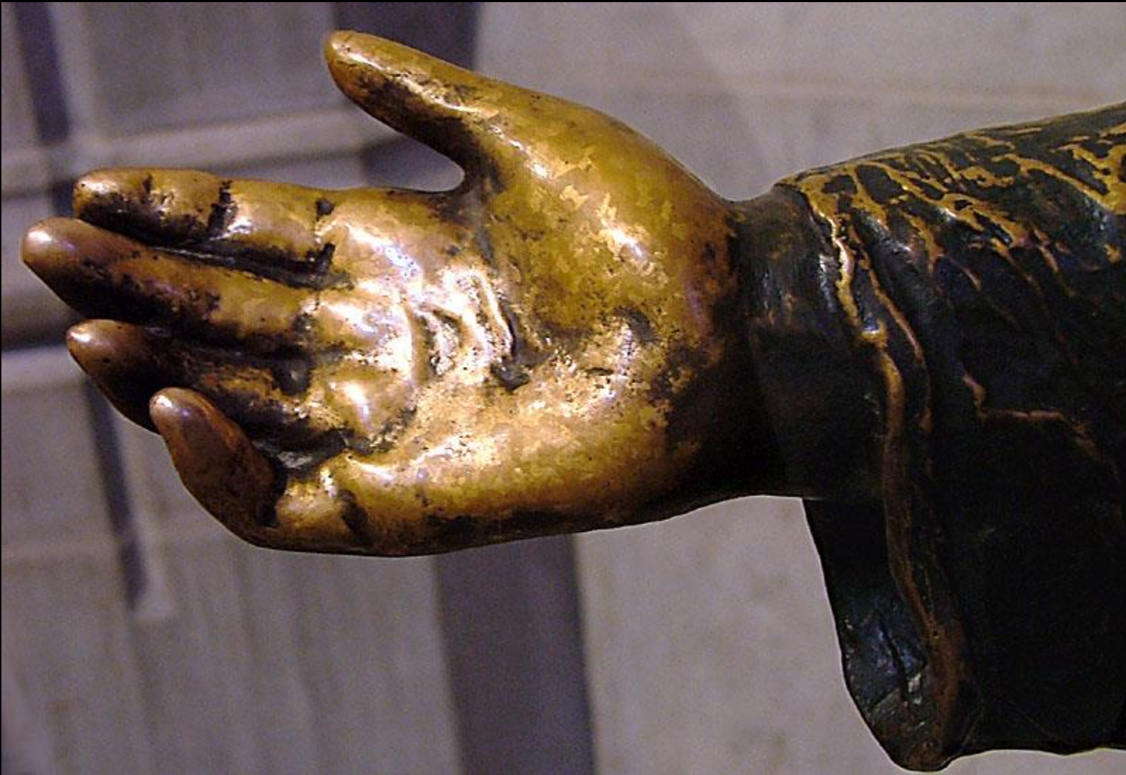
Hand of Christ Reaching out to Children -- Washington National Cathedral, Washington, DC