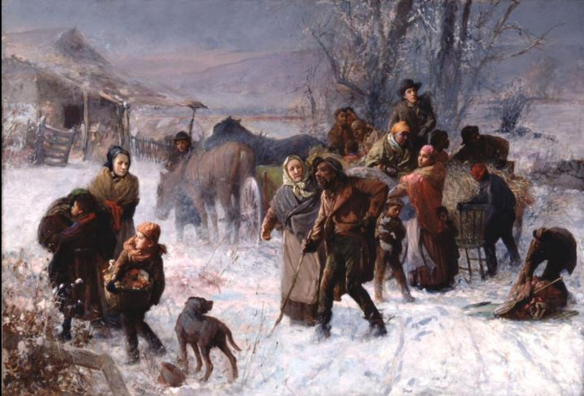
The Underground Railroad -- Charles T. Webber, Cincinnati Art Museum, Cincinnati, Ohio