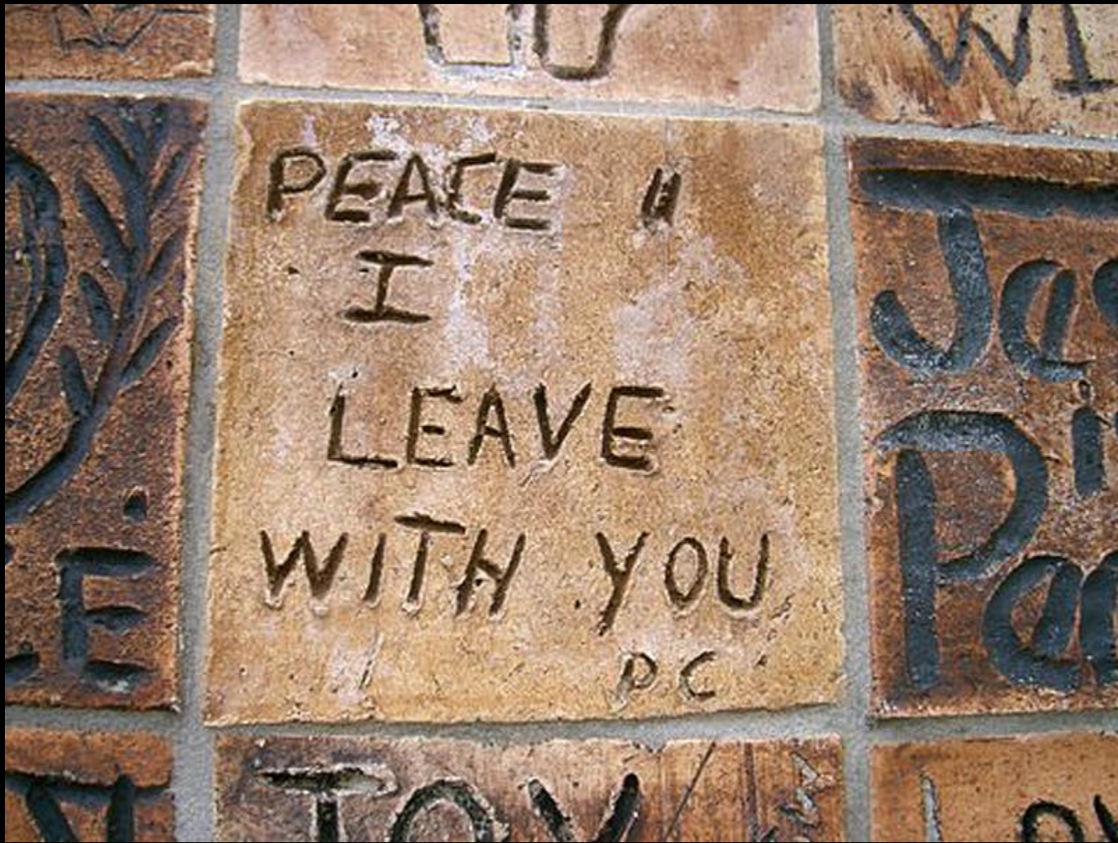
"Peace I Leave with You" -- Tile from Peace Wall, Hamilton, New Zealand