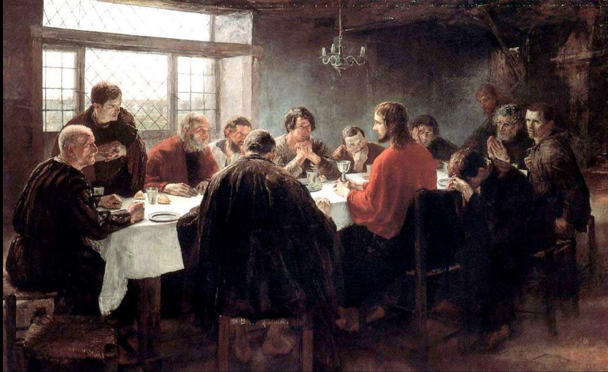
Last Supper -- Fritz Uhde, State Gallery, Stuttgart, Germany