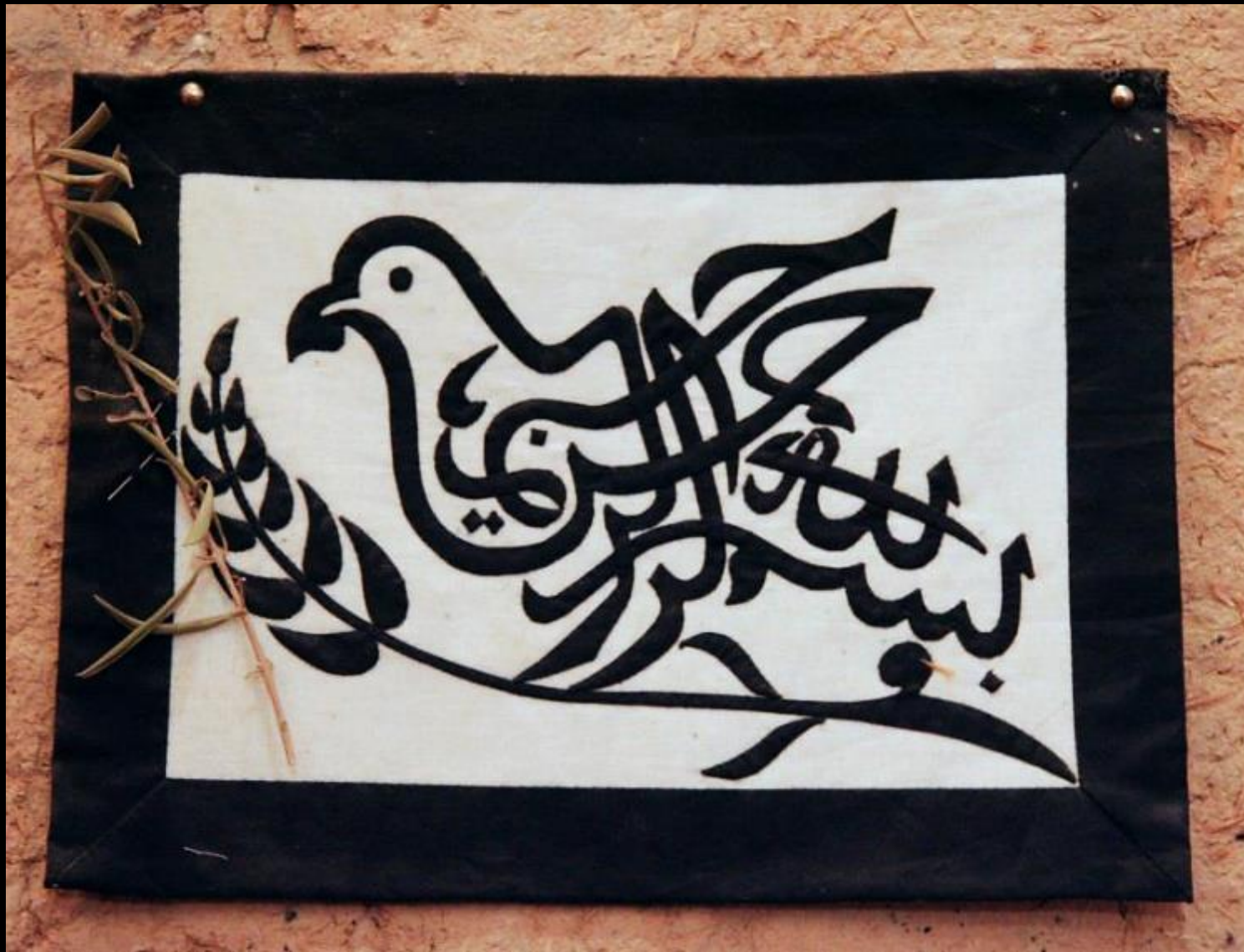
Holy Spirit Calligraphy -- Monastery of Moses the Abyssinian, Deir Mar Musa al-Habashi, Syria