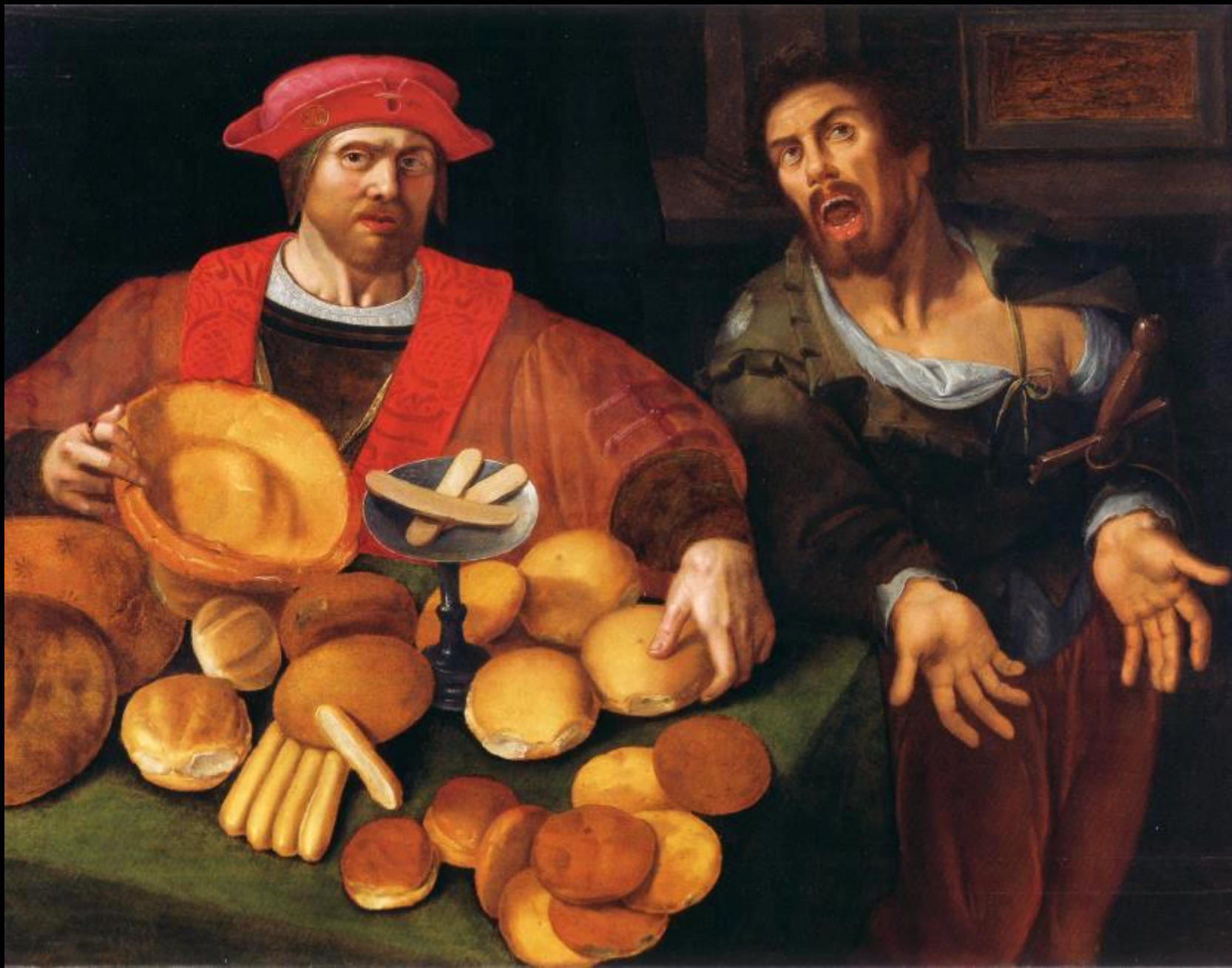
Rich and Poor, or War and Peace -- Museum Brot und Kunst, Ulm, Germany