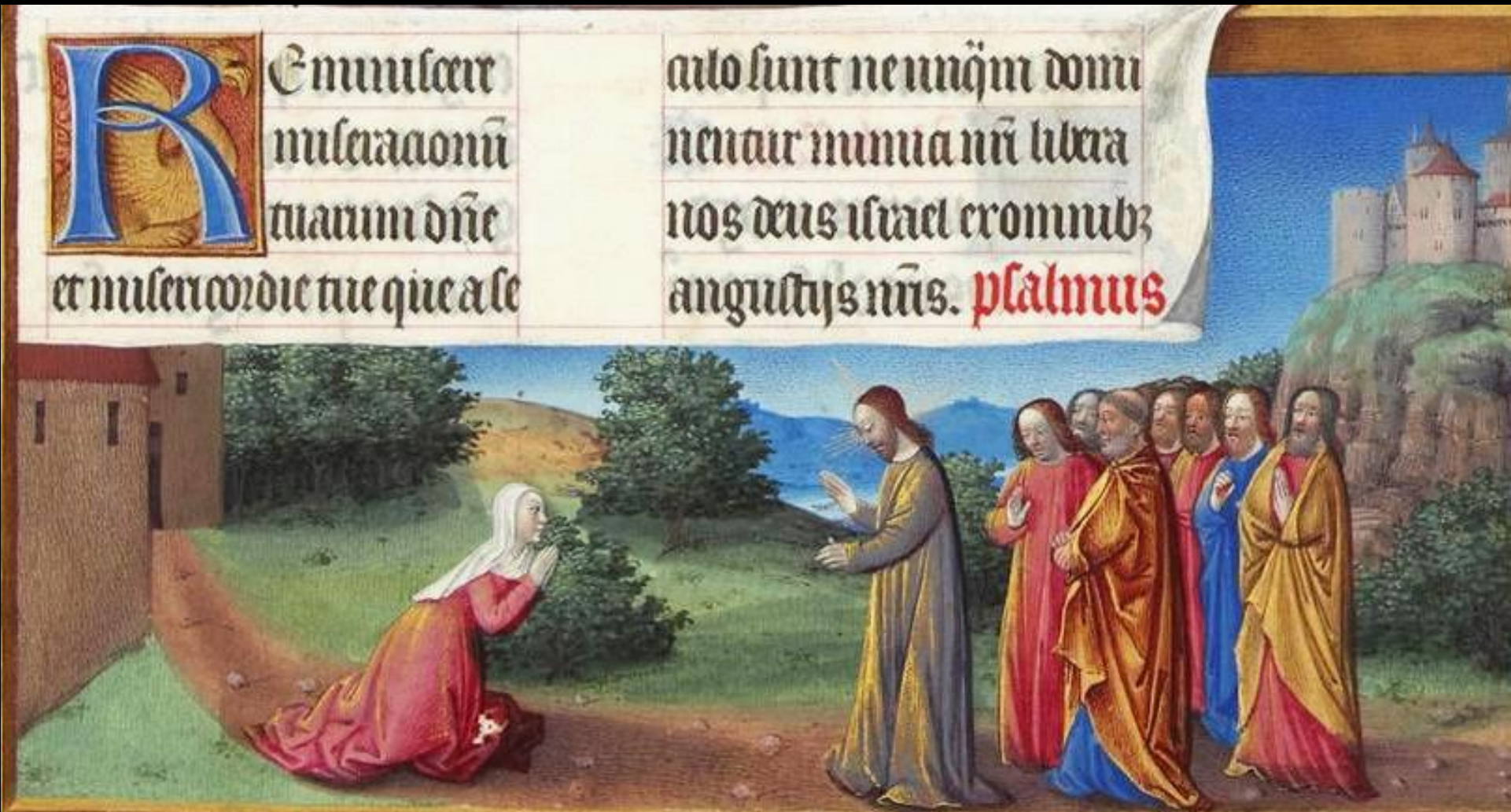
The Canaanite Woman -- Tres Riches Heures du duc de Berry, Musée Condé, Chantilly, France