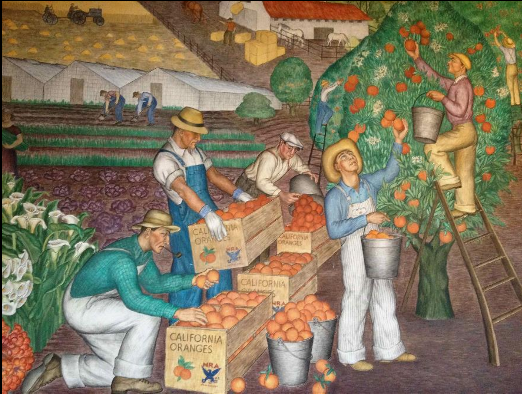
Migrant Farm Workers -- Mural, Coit Tower, San Francisco, CA