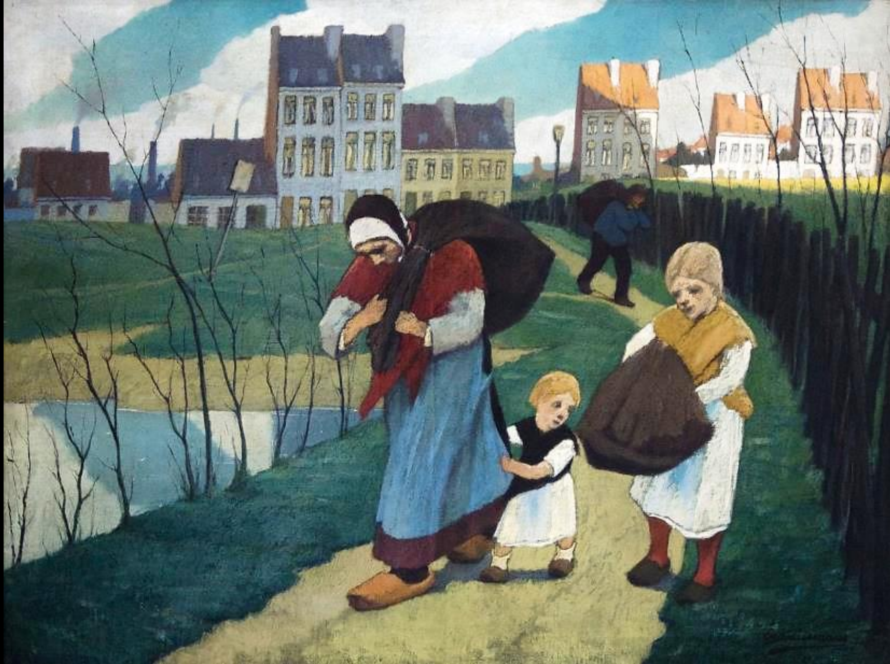
The Rag Collectors -- Eugène Laermans, Museum Dhondt-Dhaenens, Deurle, Belgium