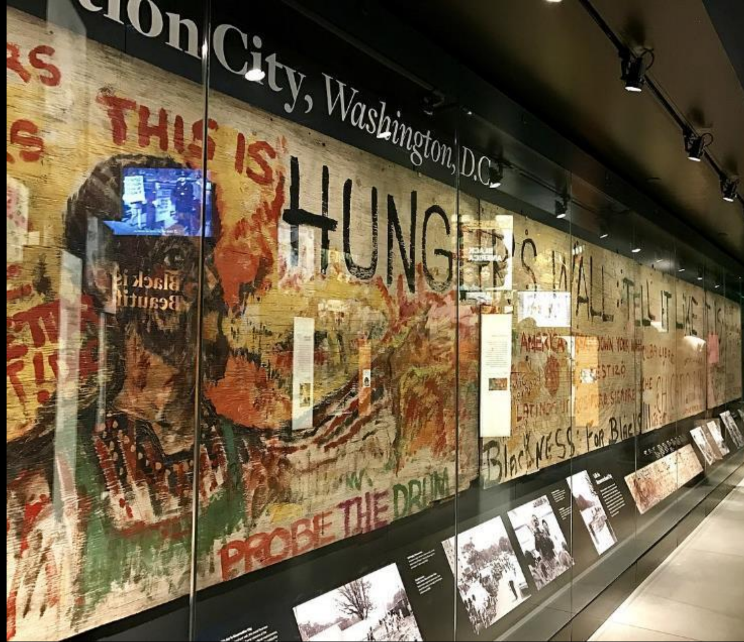
Hunger Mural from Resurrection City, 1968, Washington, DC – National Museum of African-American History and Culture