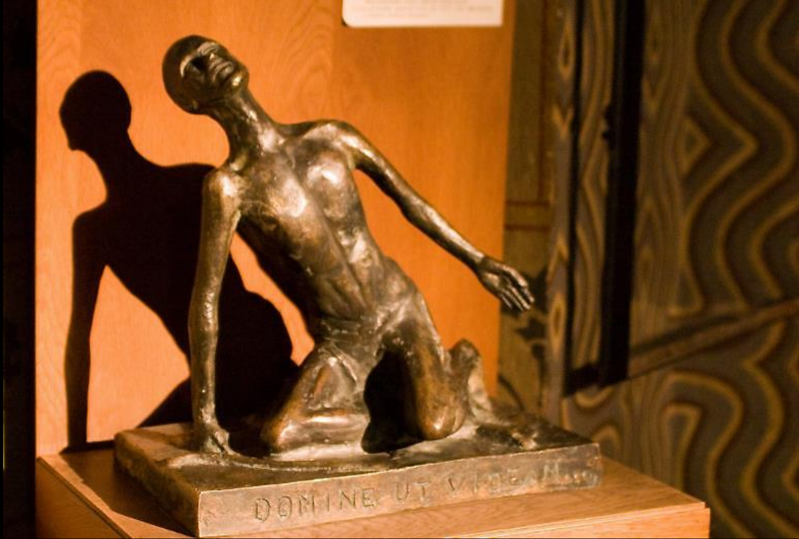
"Lord, That I Might See!" -- Matyas Church, Budapest, Hungary