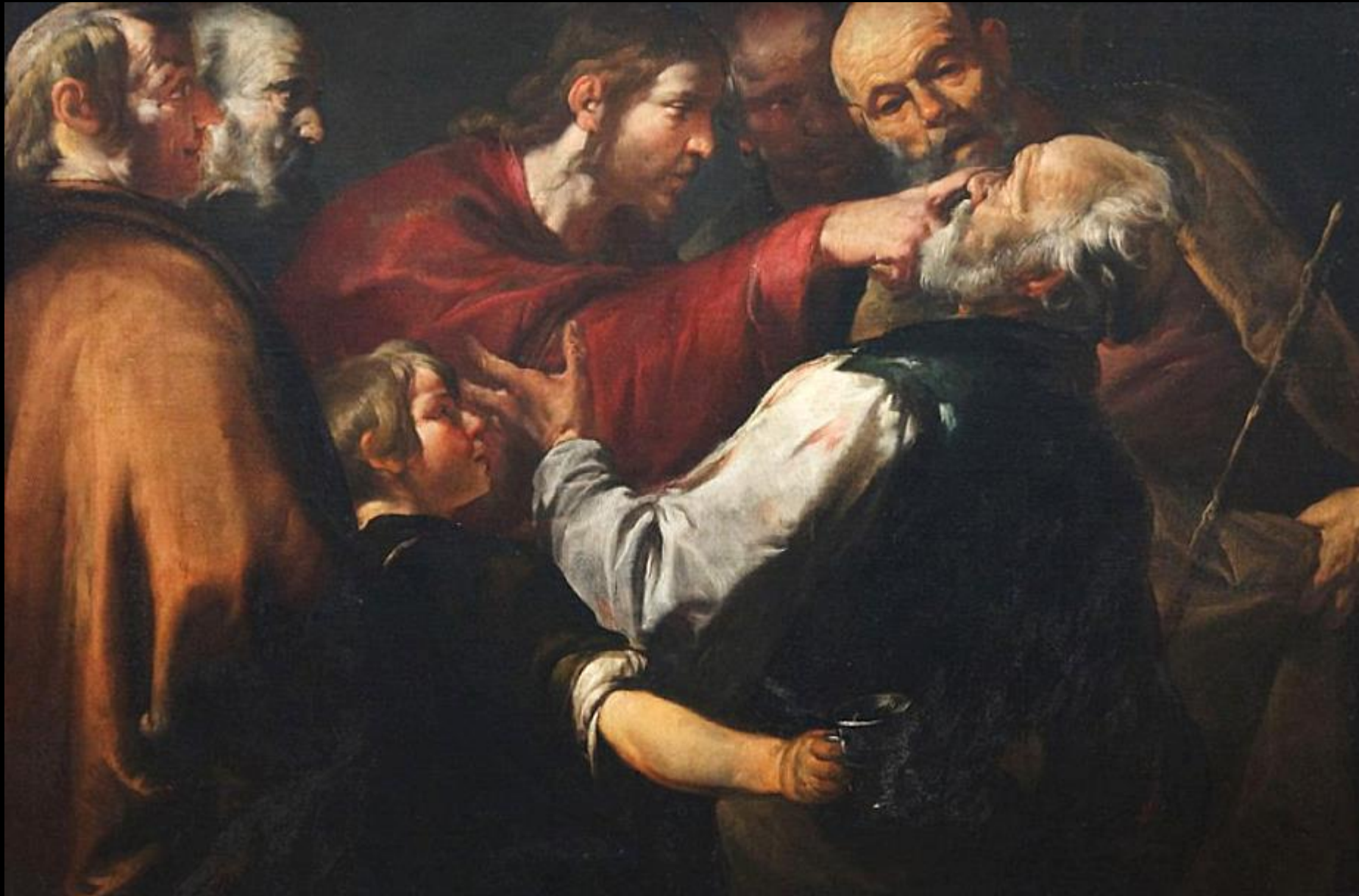
Christ Healing the Blind Man -- Gioacchino Assereto,