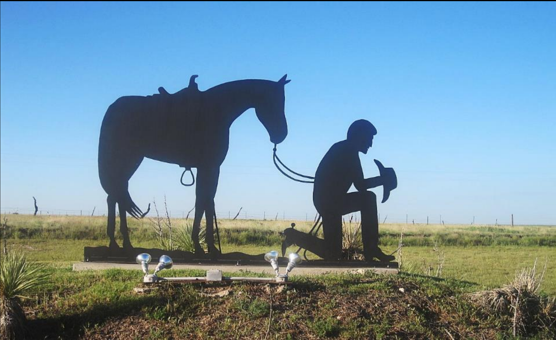
Cowboy at Prayer -- Clayton, NM