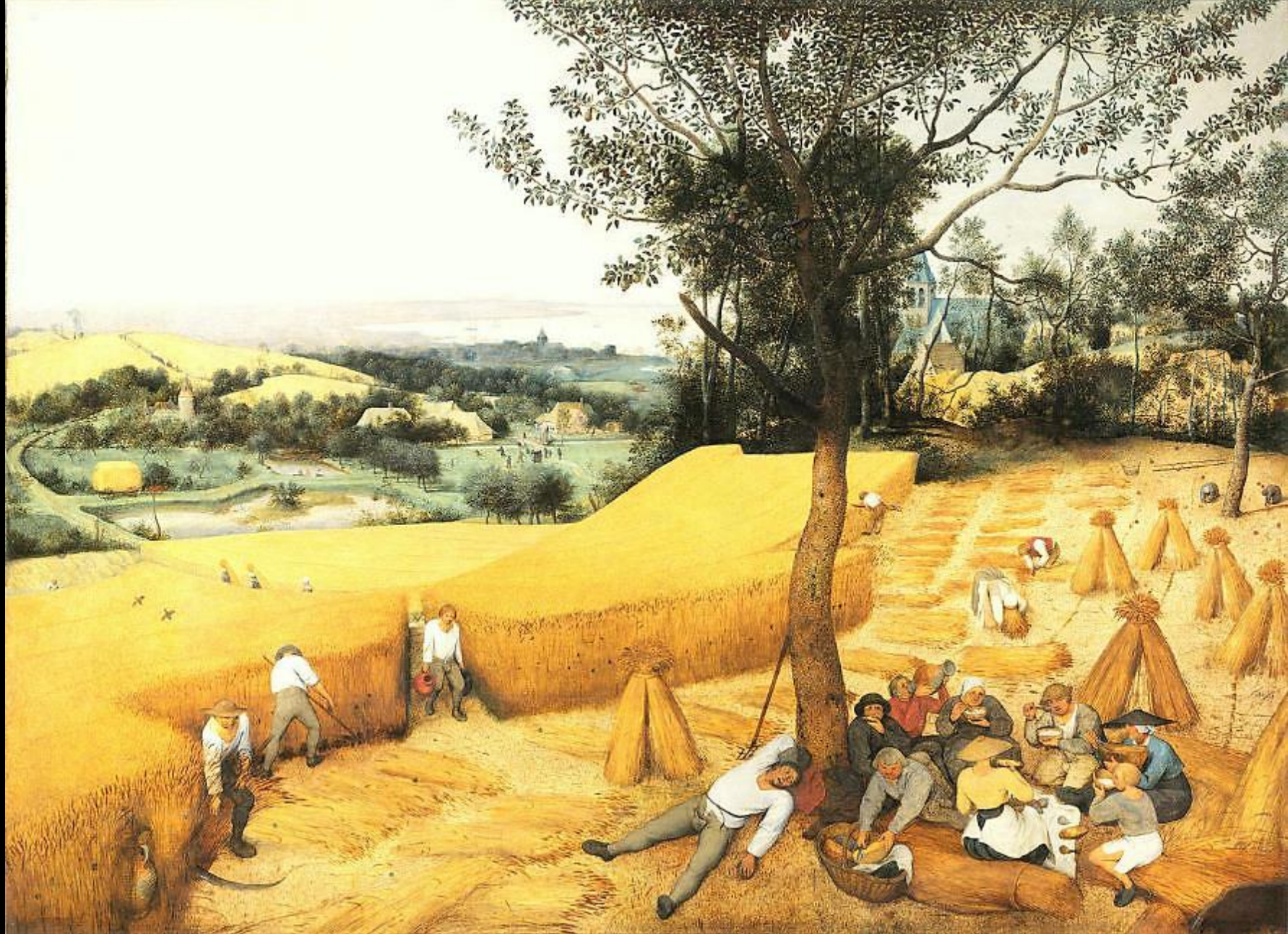
Harvesters -- Pieter Bruegel, Metropolitan Museum of Art, New York, NY