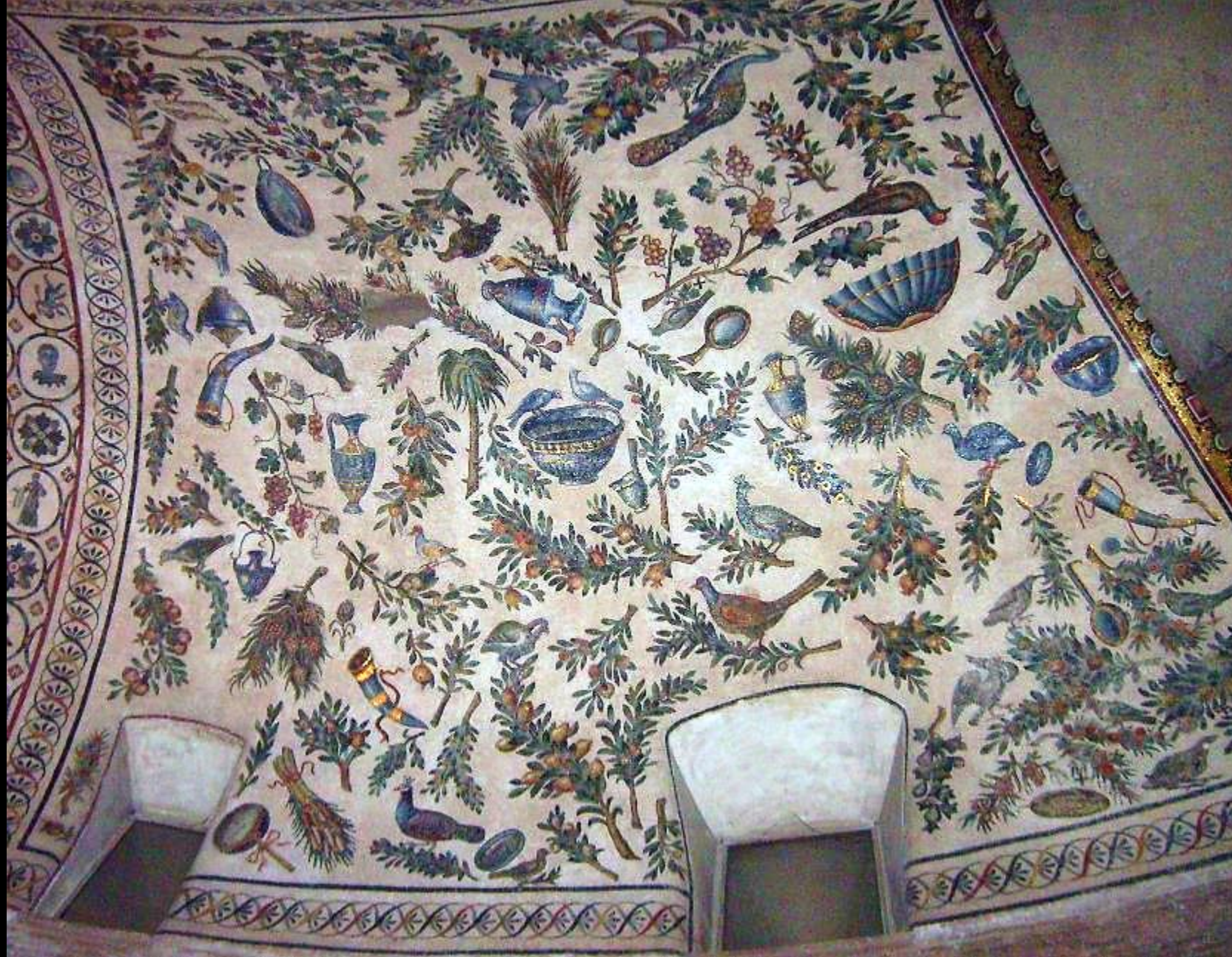
Early Christian Bird Mosaic -- 4 th c. Mausoleum of Santa Costanza, Rome , Italy