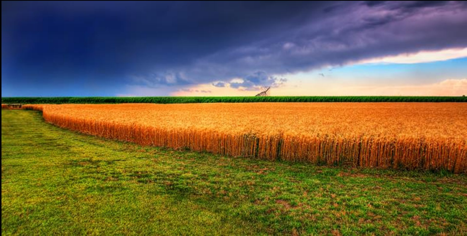
Kansas Summer Wheat