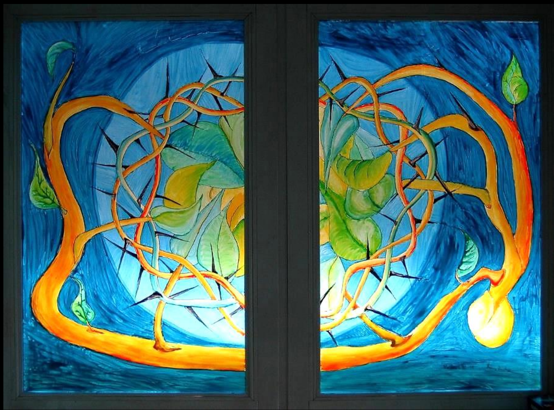
Parable of the Mustard Seed -- Window at the YMCA training center, Kassel, Germany