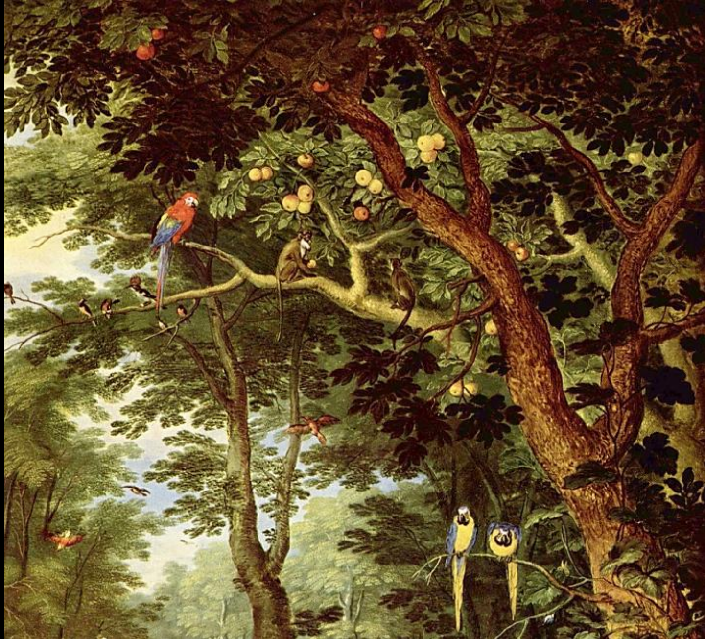
Jan Bruegel -- Paradise, Gemaldegalerie, Berlin, Germany