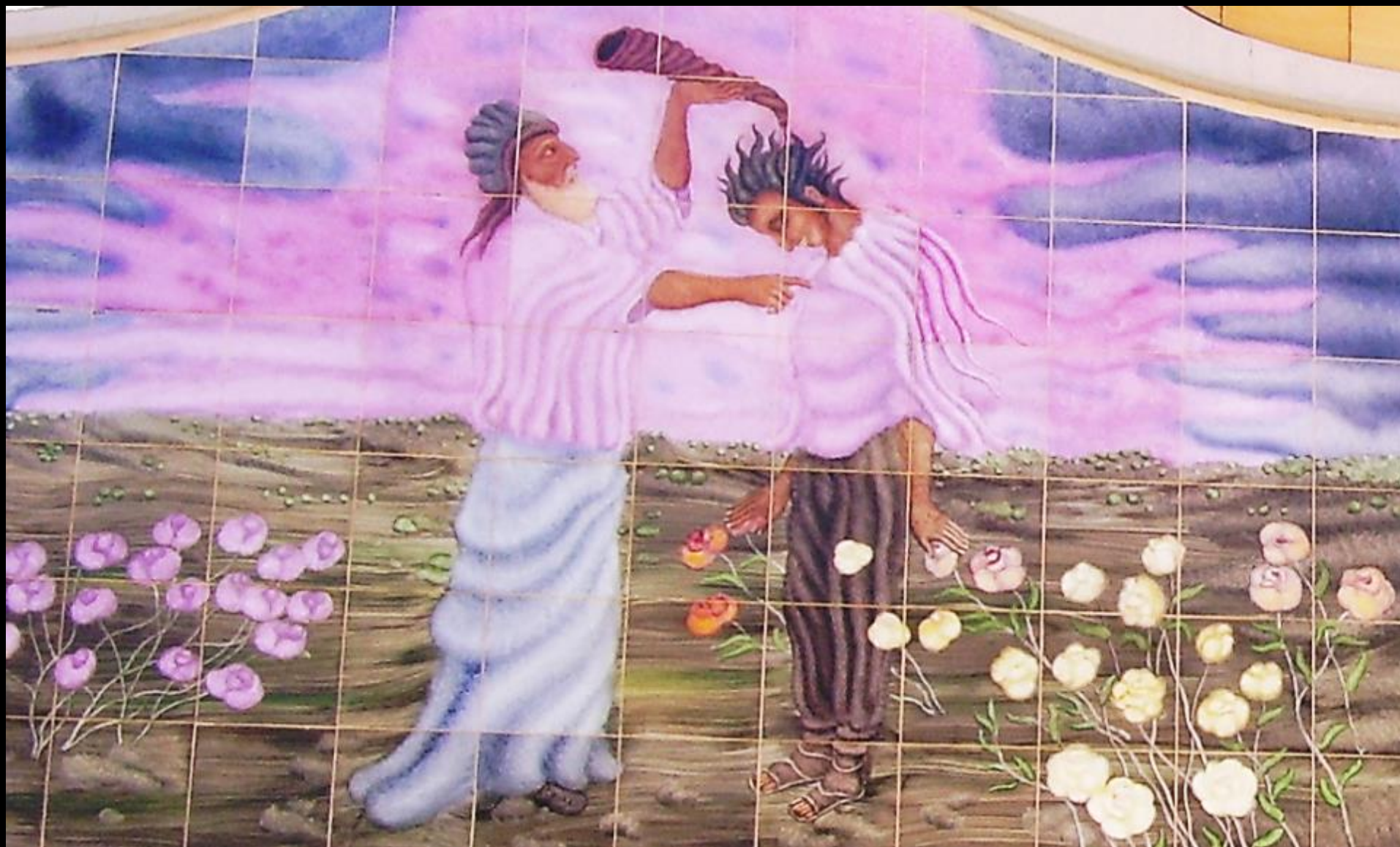
Samuel Anoints David -- Castra center, Haifa, Israel