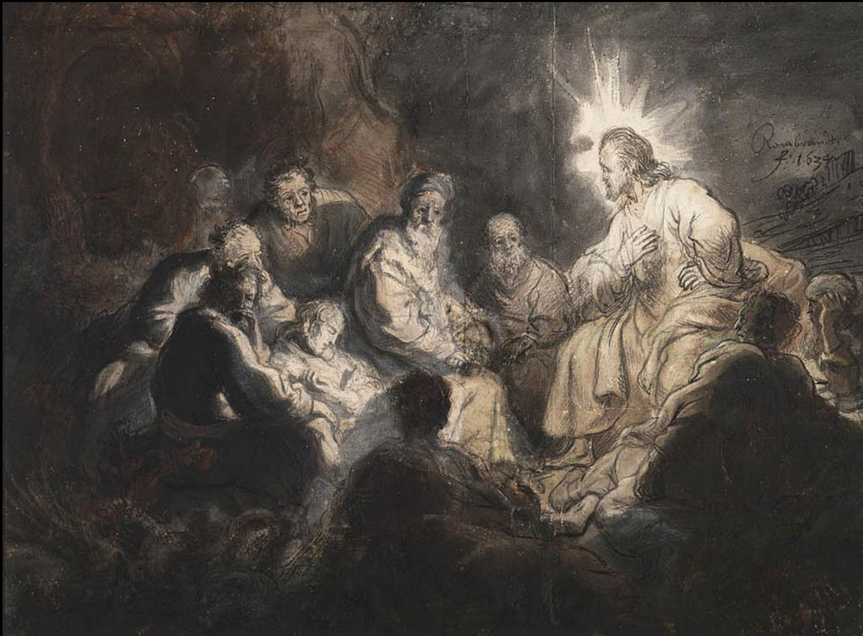
Christ and His Disciples -- Rembrandt, Teylers Museum, Haarlem, Netherlands