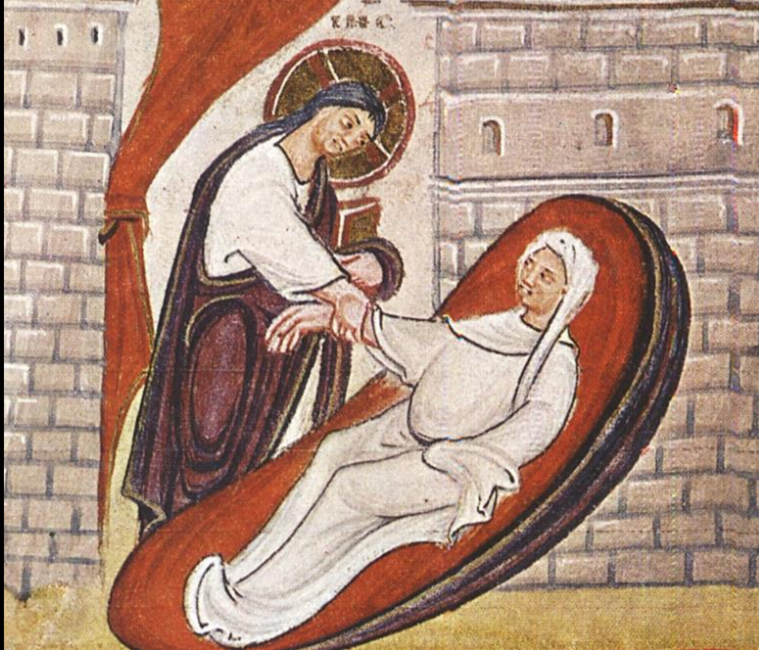
Christ Raising the Daughter of Jairus -- Codex Egberti, 10 th c., Stadtbibliothek, Trier, Germany