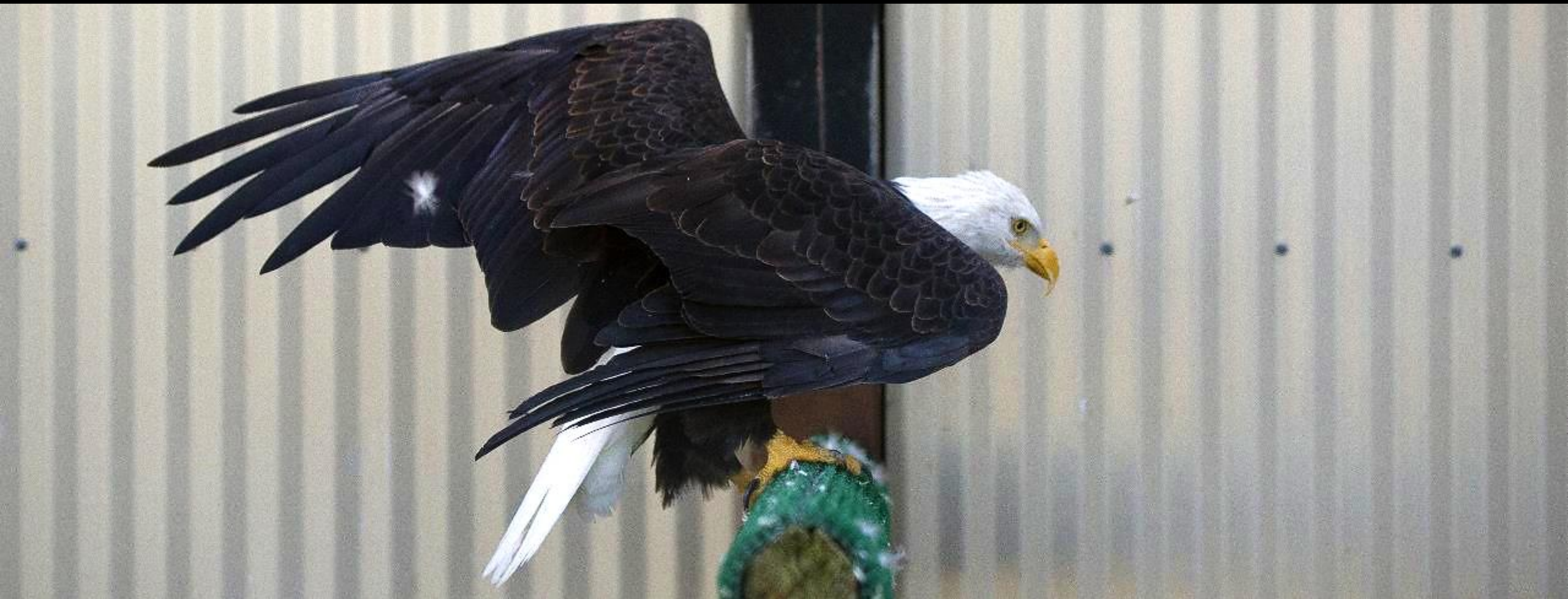
Rescued, Disabled Eagle -- Memorial Park, Joint Base Elmendorf-Richardson, Alaska