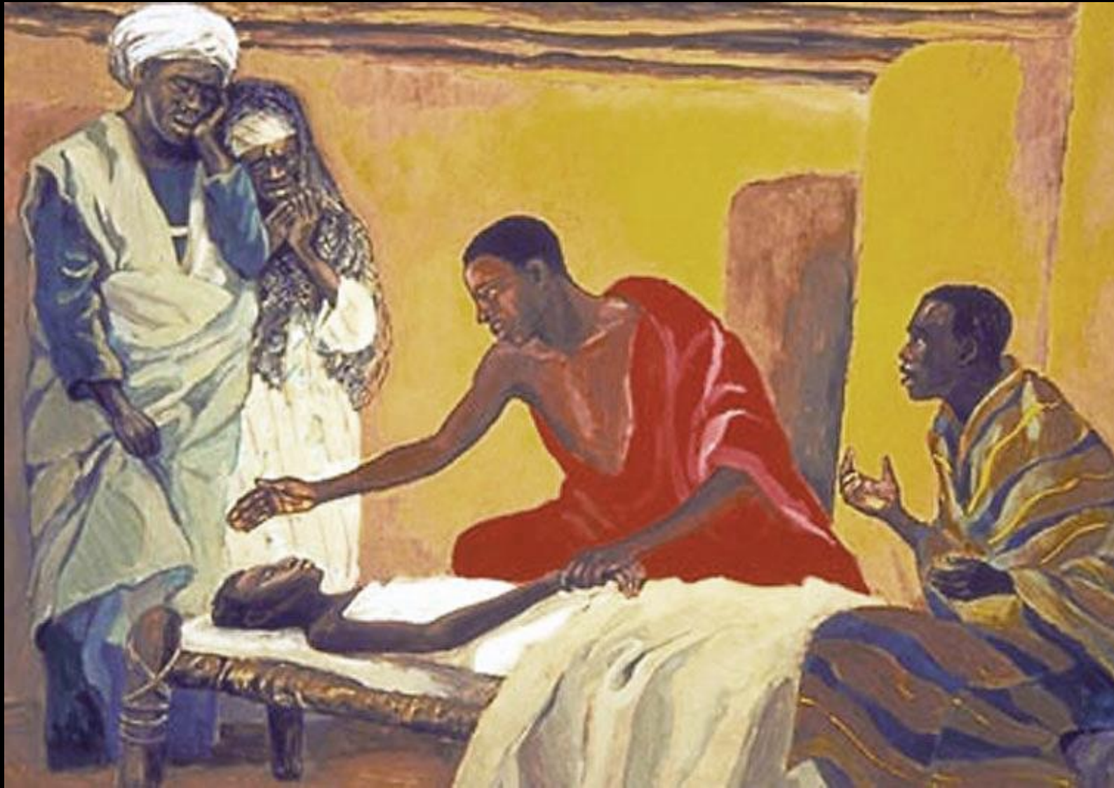
Healing of the Daughter of Jairus -- JESUS MAFA