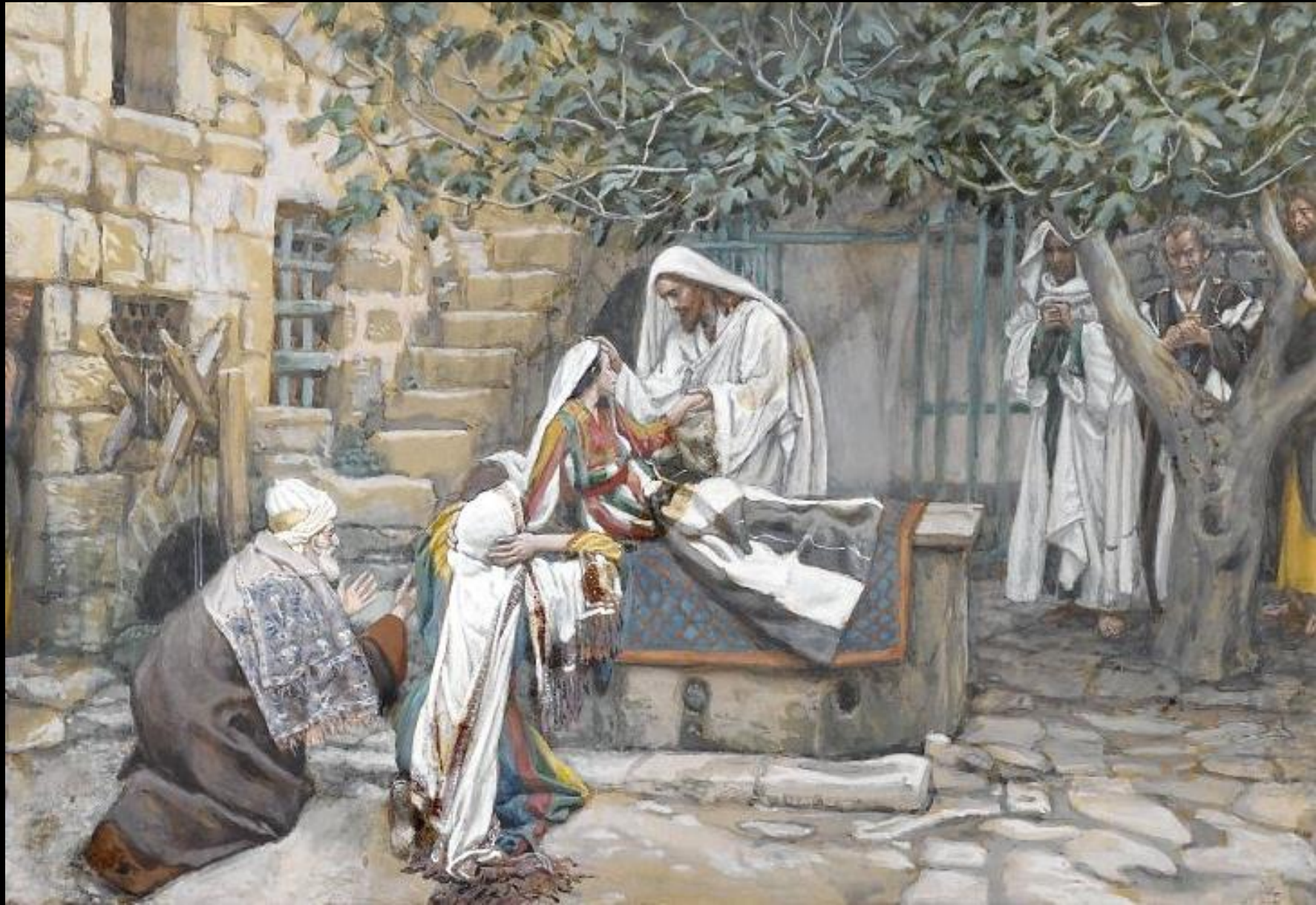
The Daughter of Jairus -- James Tissot, Brooklyn Museum, New York, NY