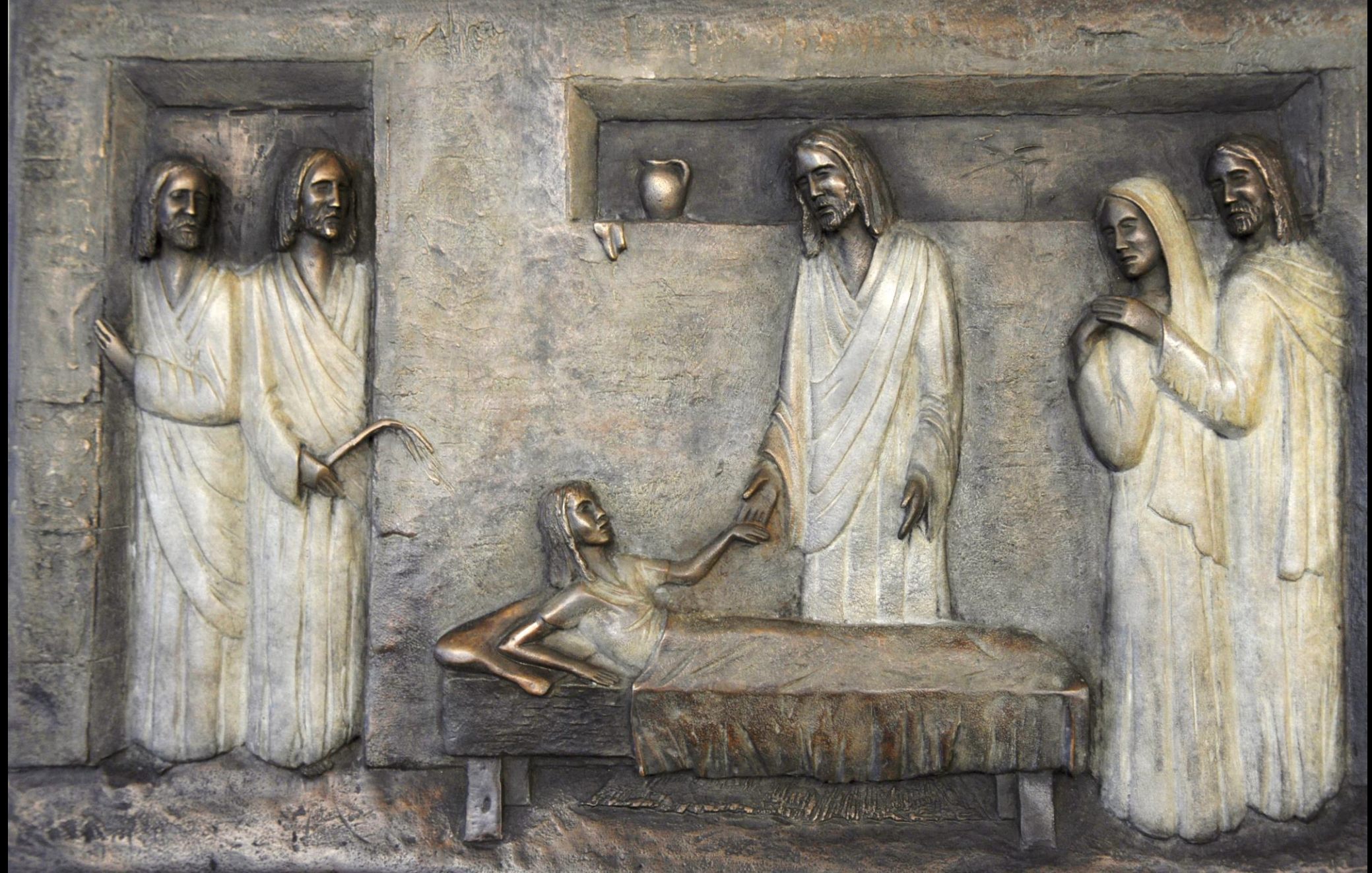
Jairus' Daughter -- National Children's Hospital, Dublin, Ireland