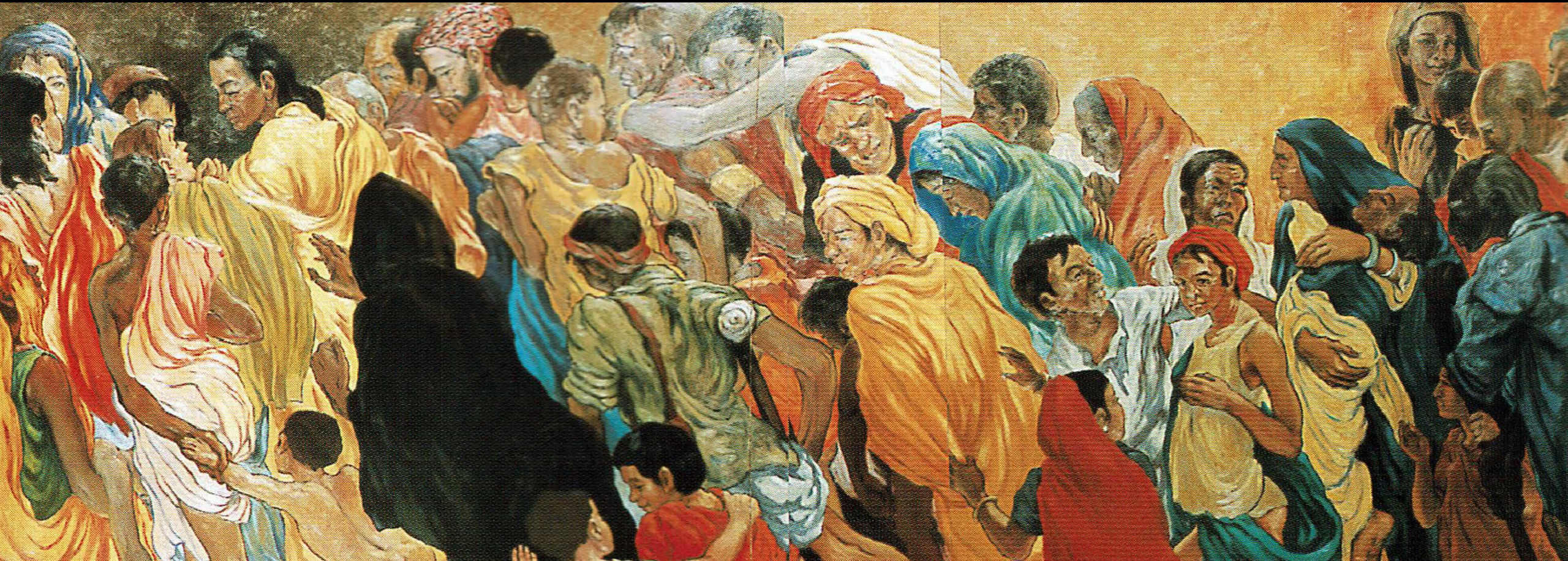
Woman with the Flow of Blood -- Frank Wesley