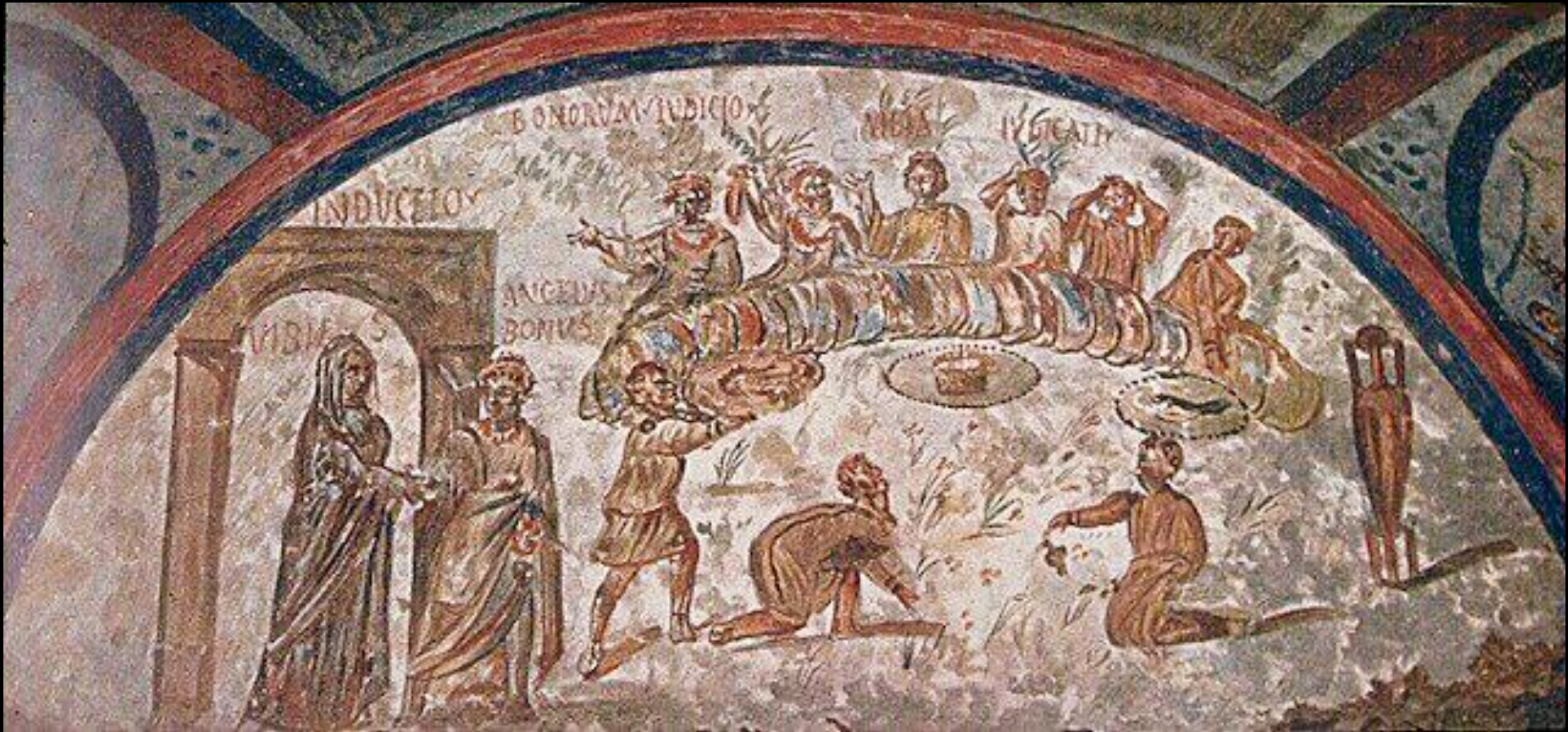
Agape Meal -- 3 rd century, Catacomb of Domitilla, Rome, Italy