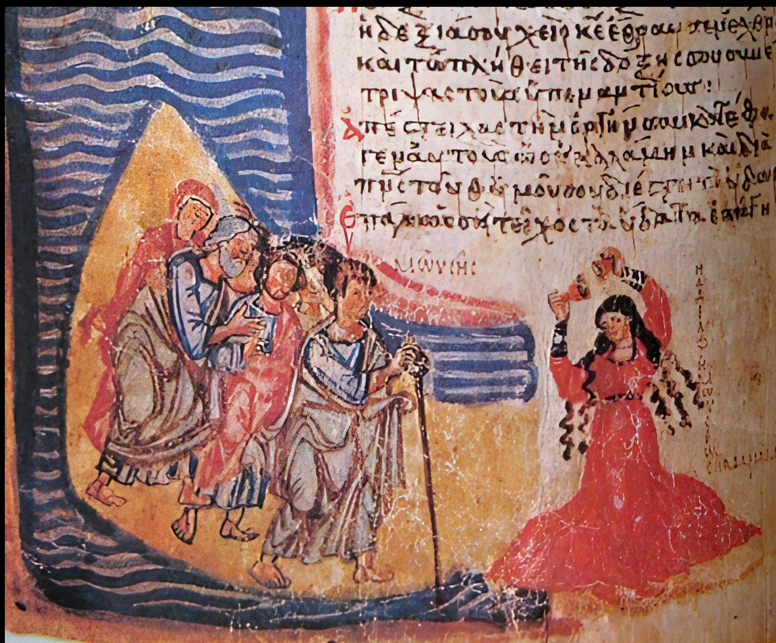
Song of Miriam -- Chludov Psalter, State Historical Museum, Moscow