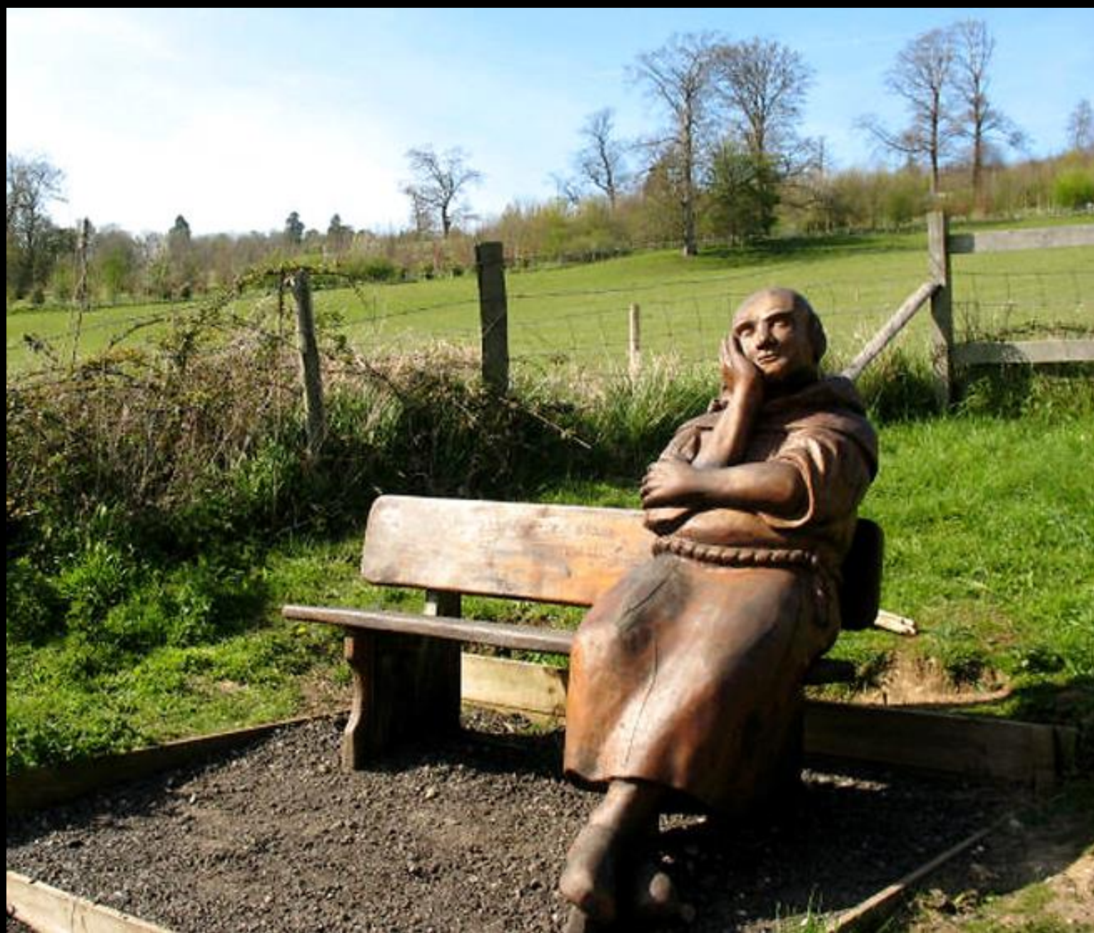
"Pilgrim bound by staff and faith, rest thy bones" -- Wood sculpture, Harrietsham, England