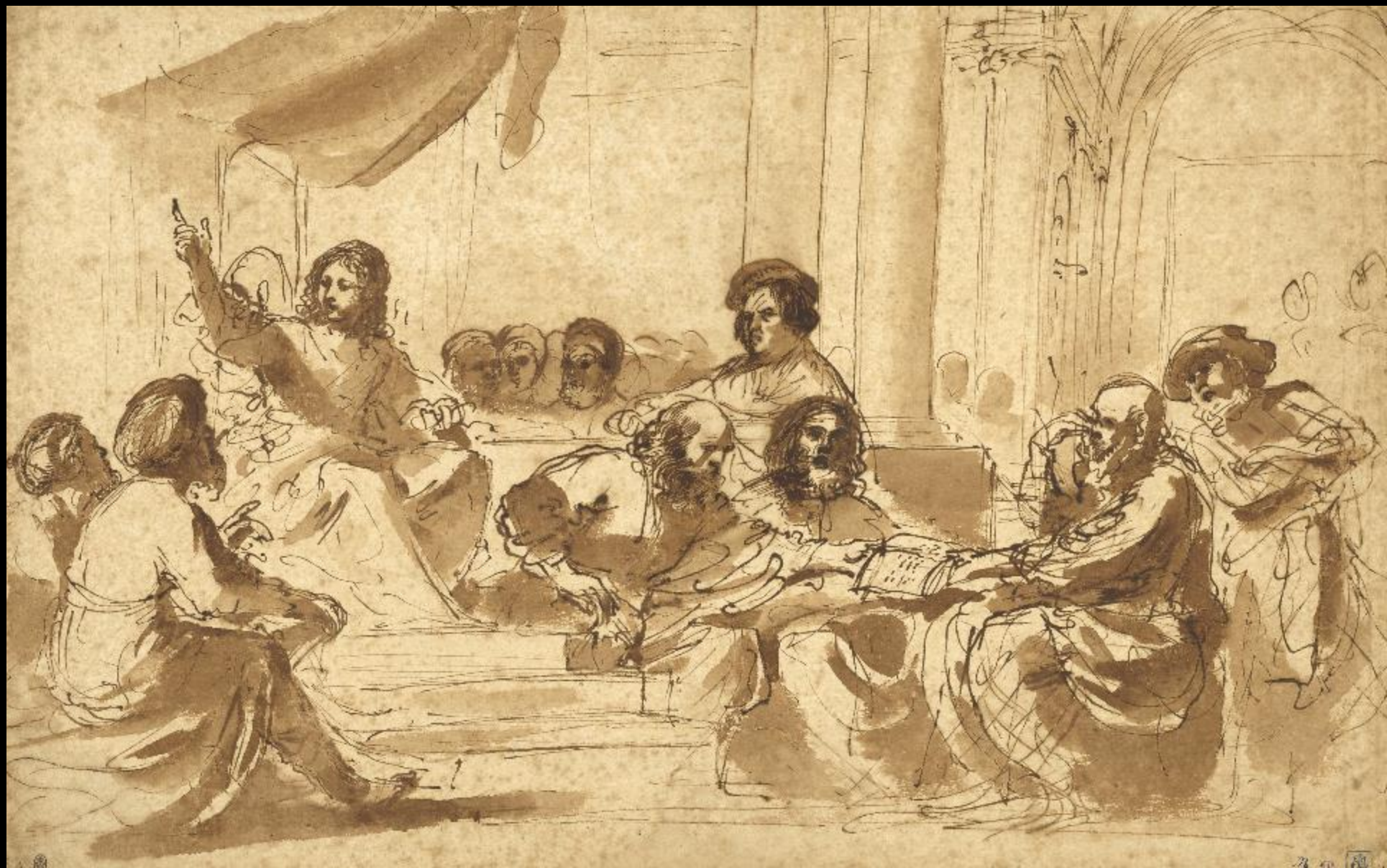
Christ Preaching in the Temple -- Guercino, J. Paul Getty Museum, Los Angeles, CA