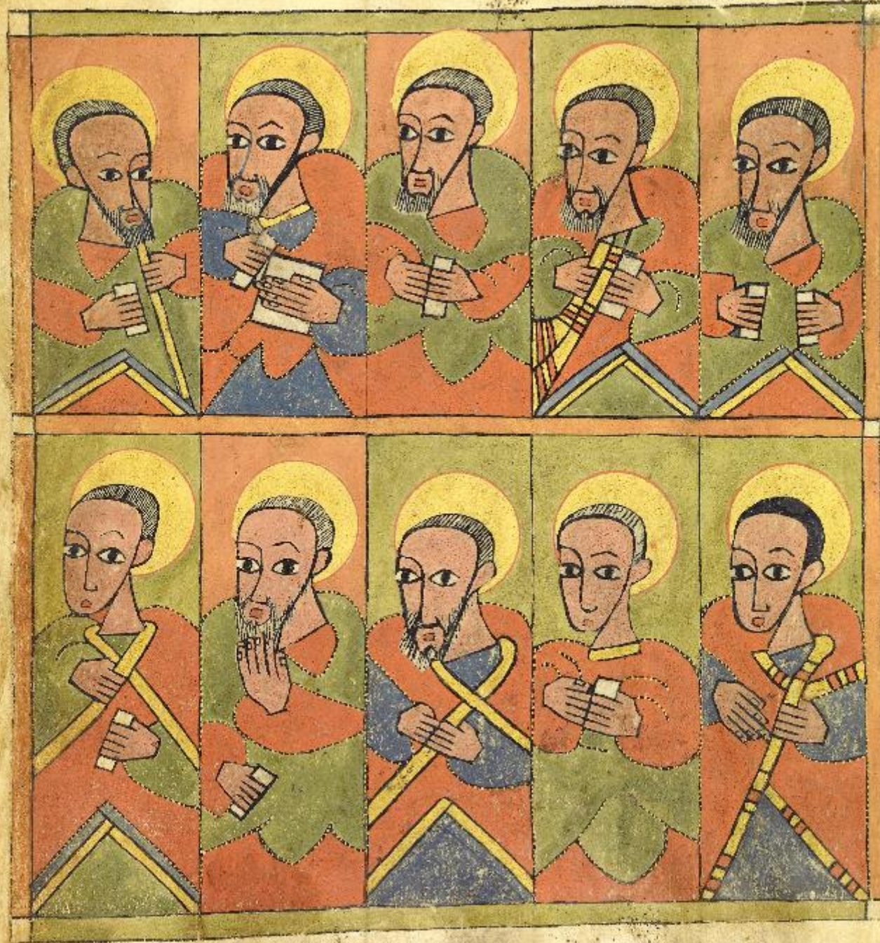
The Seventy-Two Disciples

Ethiopian about 1480 – 1520 Getty Museum Los Angeles, CA