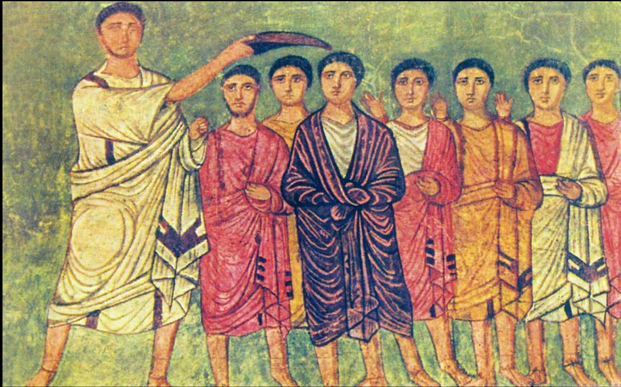
David is Anointed and Affirmed as King -- Dura Europos Synagogue, Syria