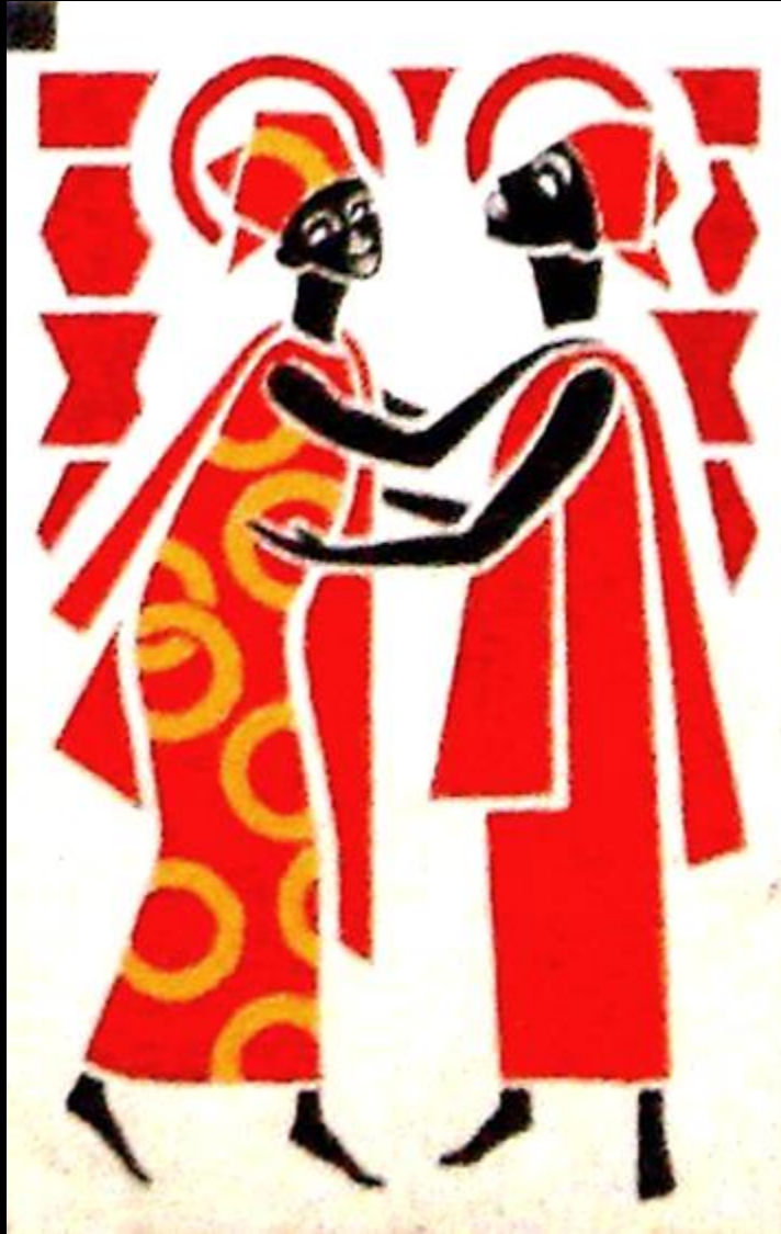
The Visitation -- Keur Moussa Abbey, Senegal