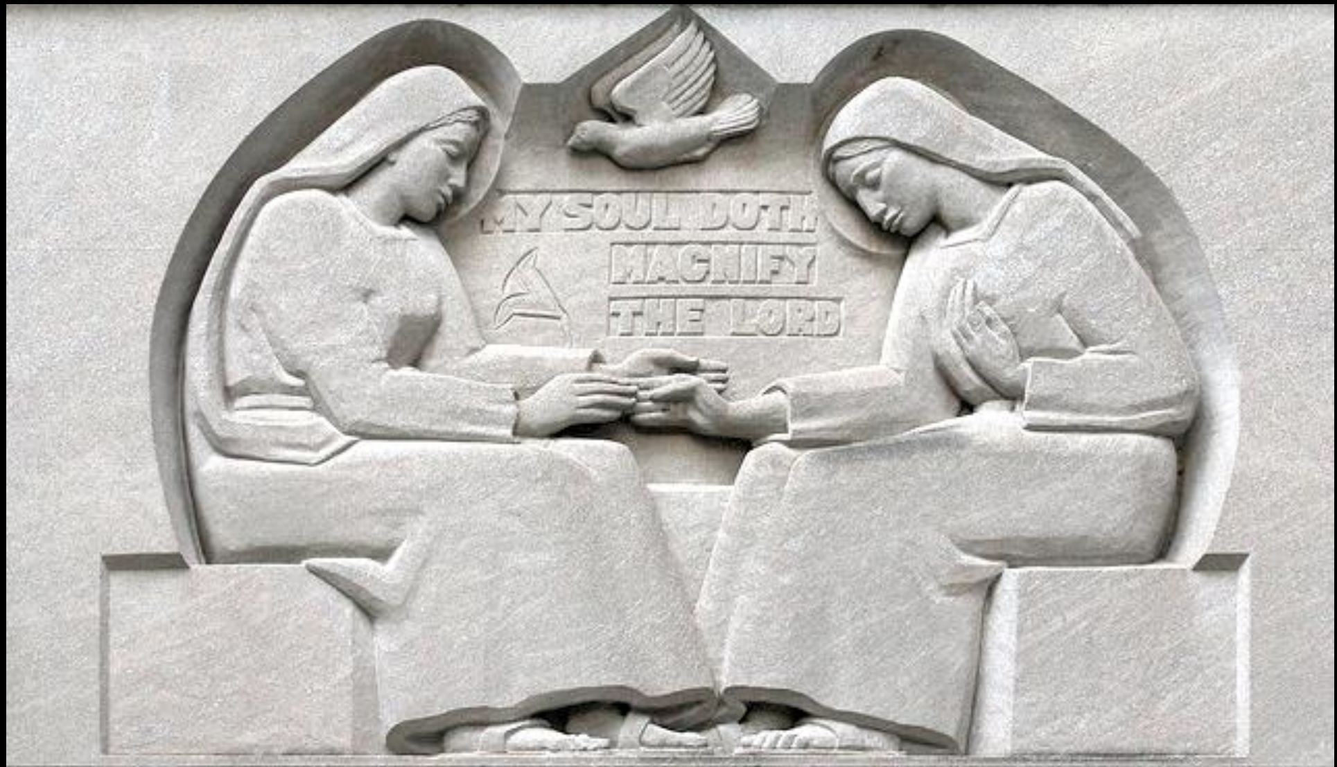
The Magnificat -- Baltimore Cathedral, Baltimore, MD