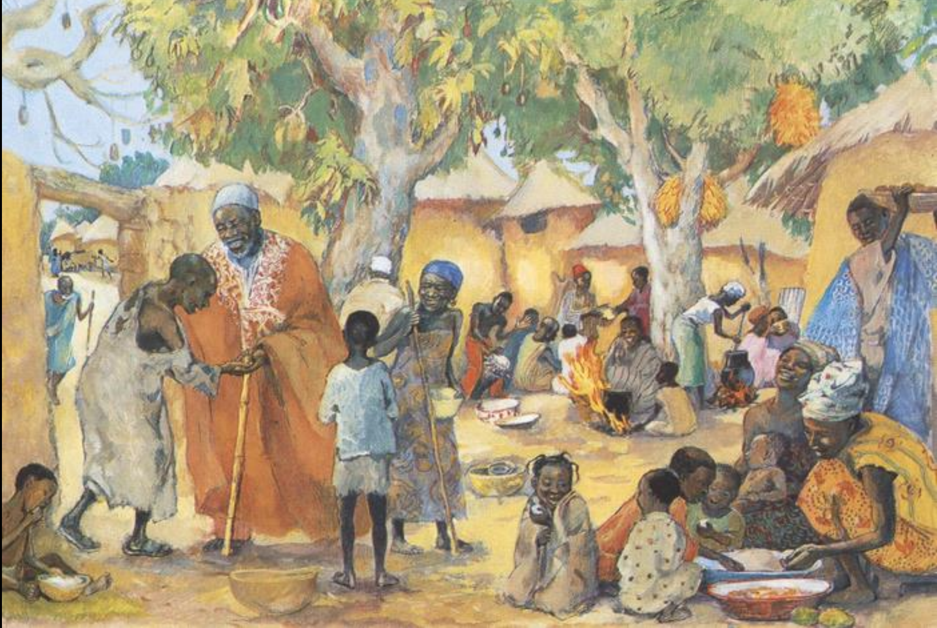
The Poor Invited to the Feast -- JESUS MAFA, Cameroon