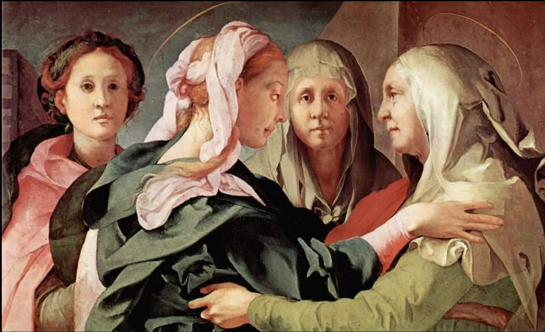
Visitation of Mary -- Jacopo da Pontormo, Parish Church, Carmignano, Italy