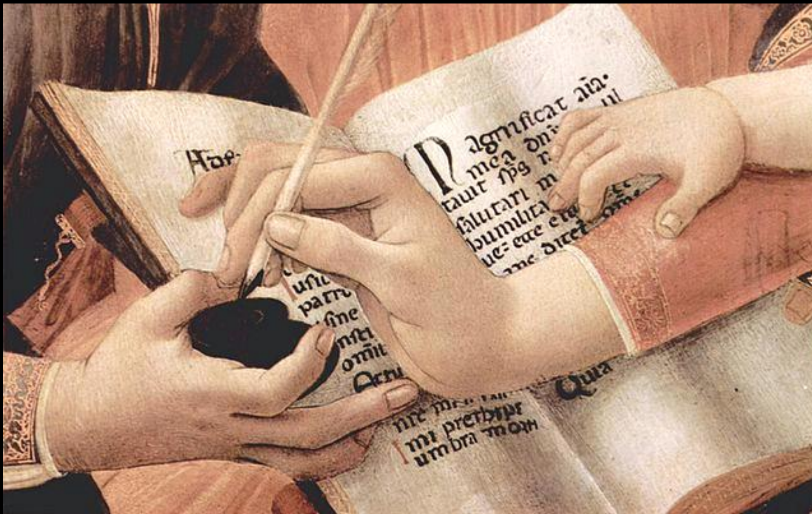
Madonna of the Magnificat (detail) -- Sandro Botticelli, Uffizi Gallery, Florence, Italy