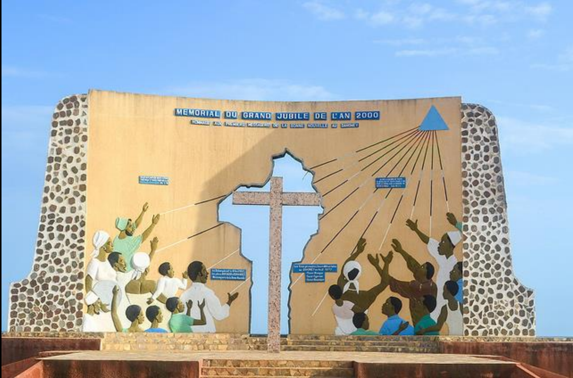
Jubilee Monument -- Ouidah, Benin