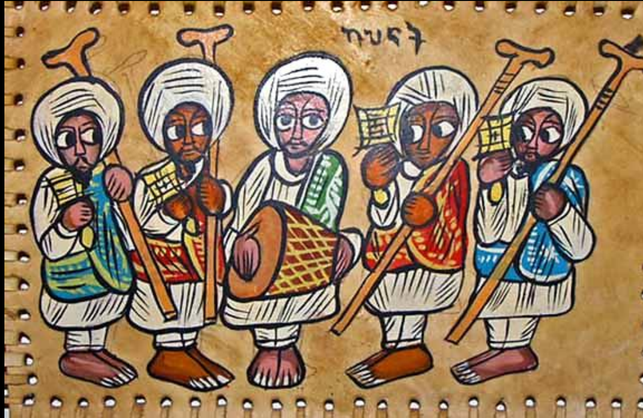
Ethiopian Orthodox Choir -- Paint on leather, 20 th century