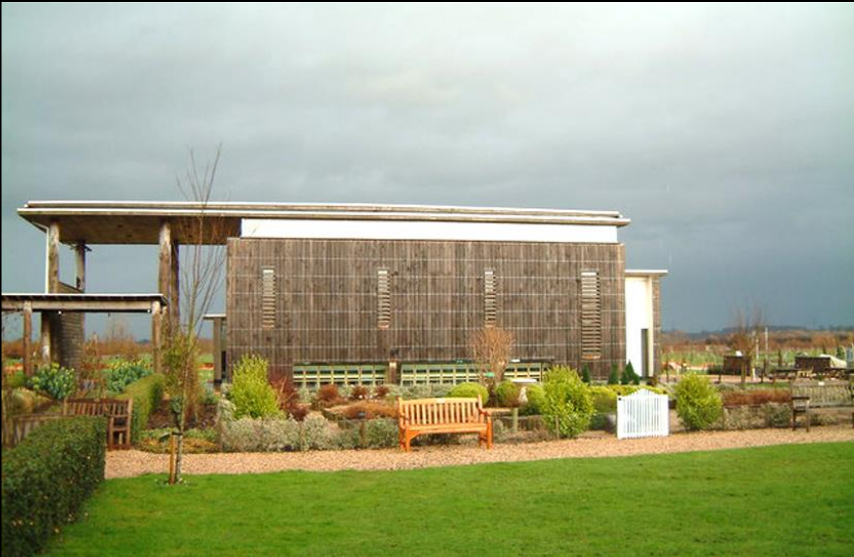
Millenium Chapel of Peace and Forgiveness, Alrewas, England