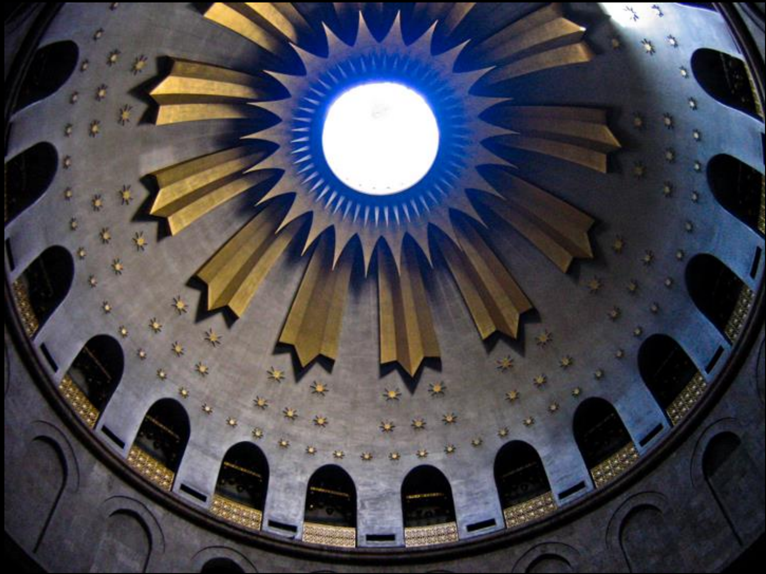
Church of the Holy Sepulcher -- Jerusalem