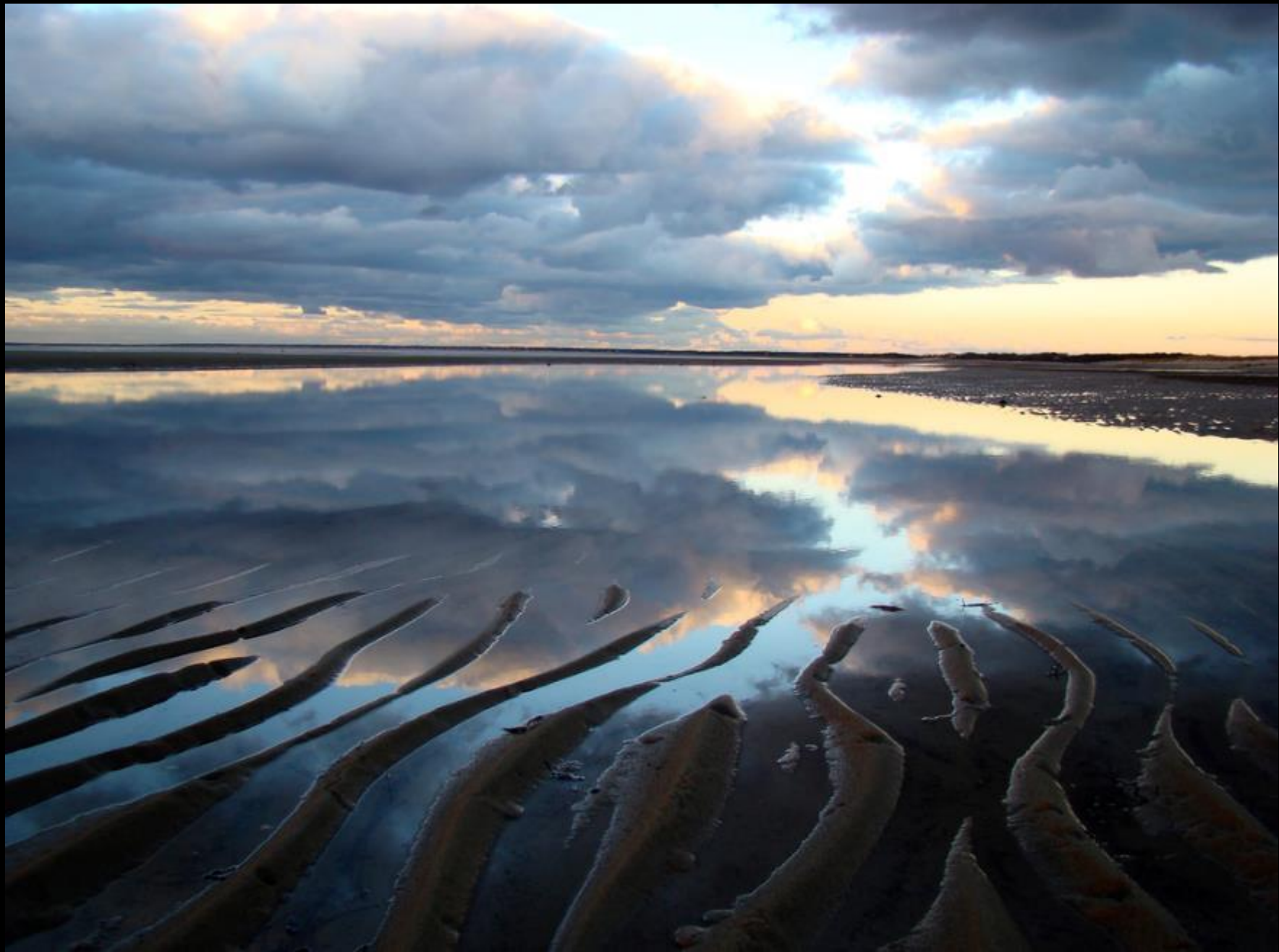
Ascension -- Joanna Vaughn, Cape Cod Bay