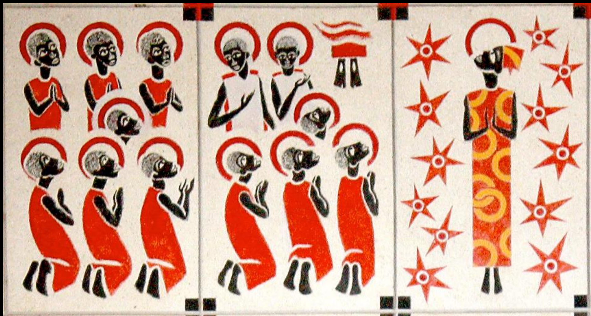
Ascension -- Keur Moussa Abbey, Keur Moussa, Senegal