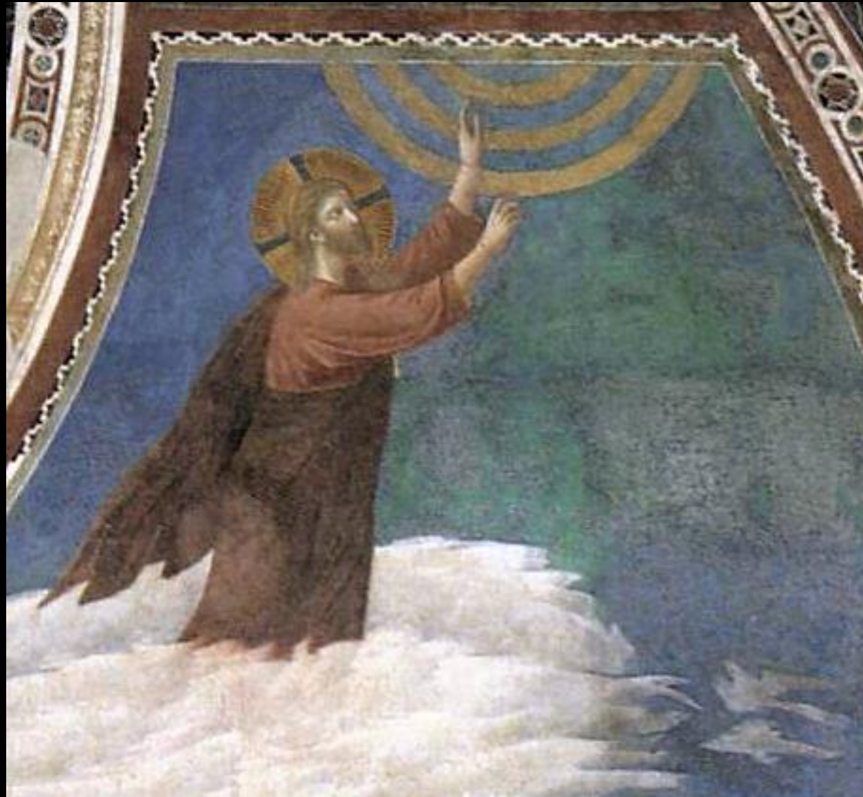
Ascension -- Giotto, Basilica of San Francis of Assisi, Assisi, Italy