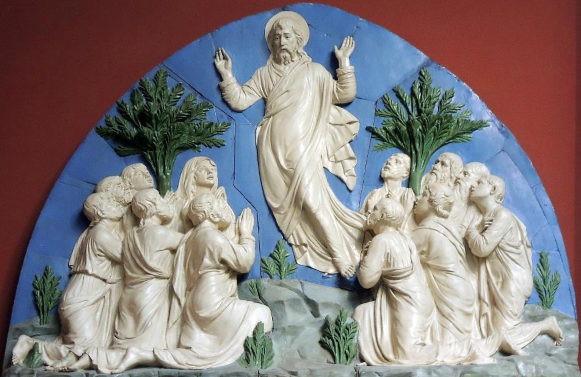
Ascension of Christ -- Lucca della Robbia, Pushkin Museum, Moscow, Russia