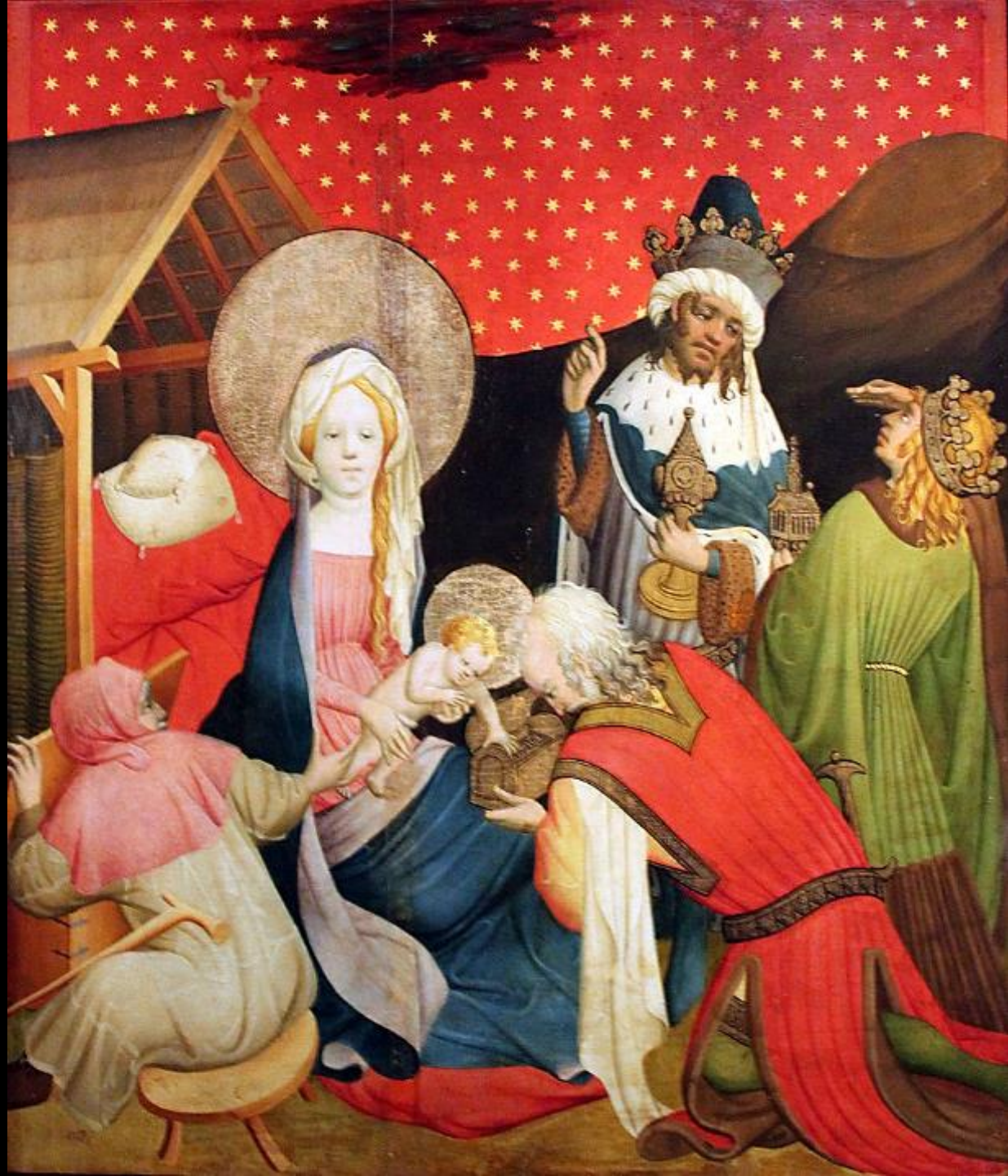
Adoration of the Magi

Master Francke Kunsthalle Hamburg Hamburg, Germany