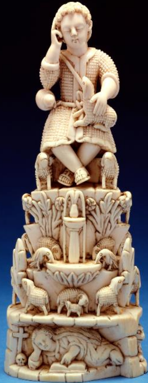
Christ Child as Good Shepherd

Goa, India Walters Art Museum Baltimore, MD