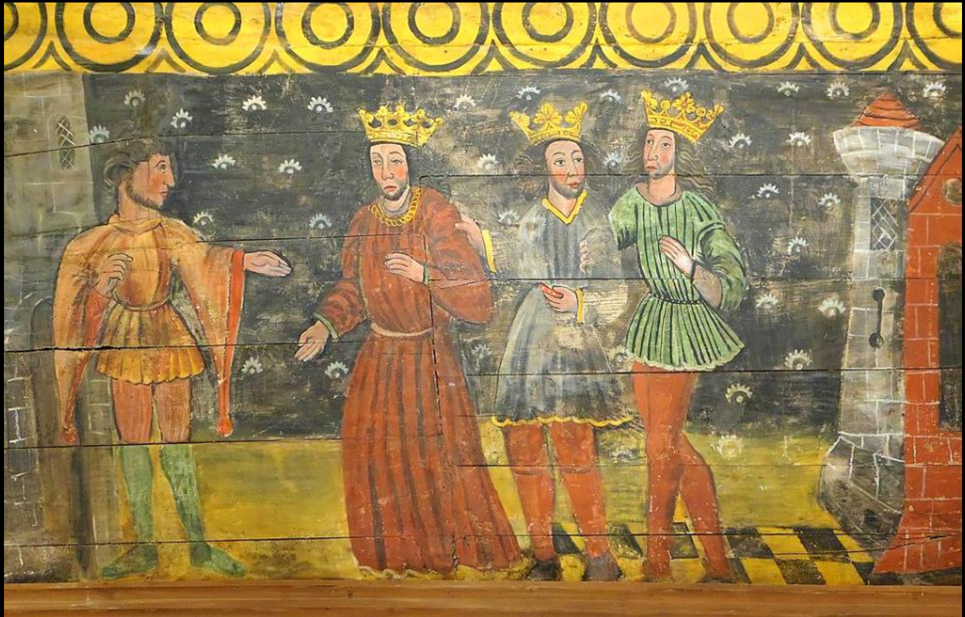
Herod with the Three Kings -- Church of Saint-Gonery, Plougrescant, France