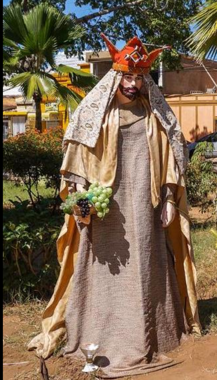
Figure of the Tres Reyes Magos Maracaibo, Venezuela