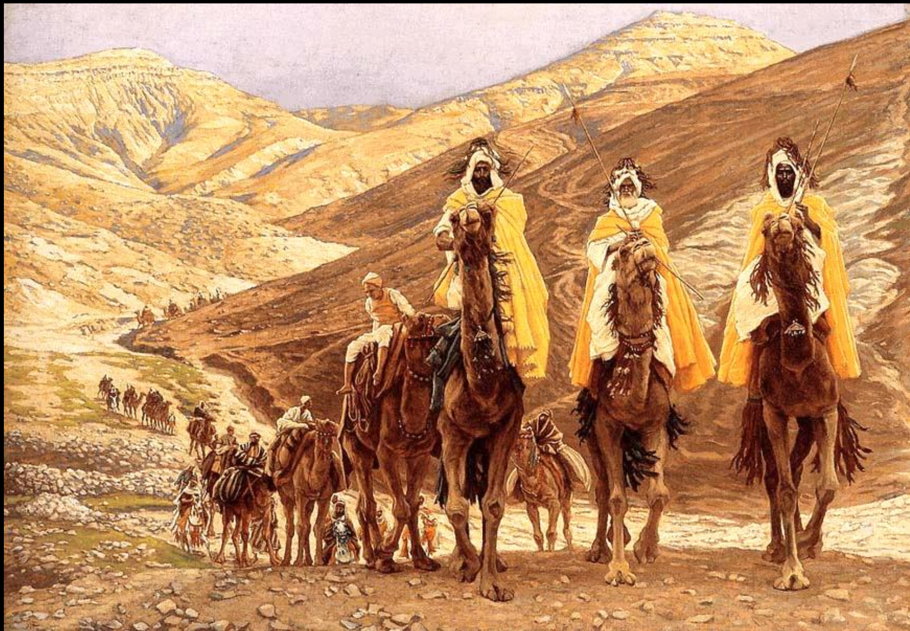
Journey of the Magi -- James Tissot, Minneapolis Institute of Art, Minneapolis, MN