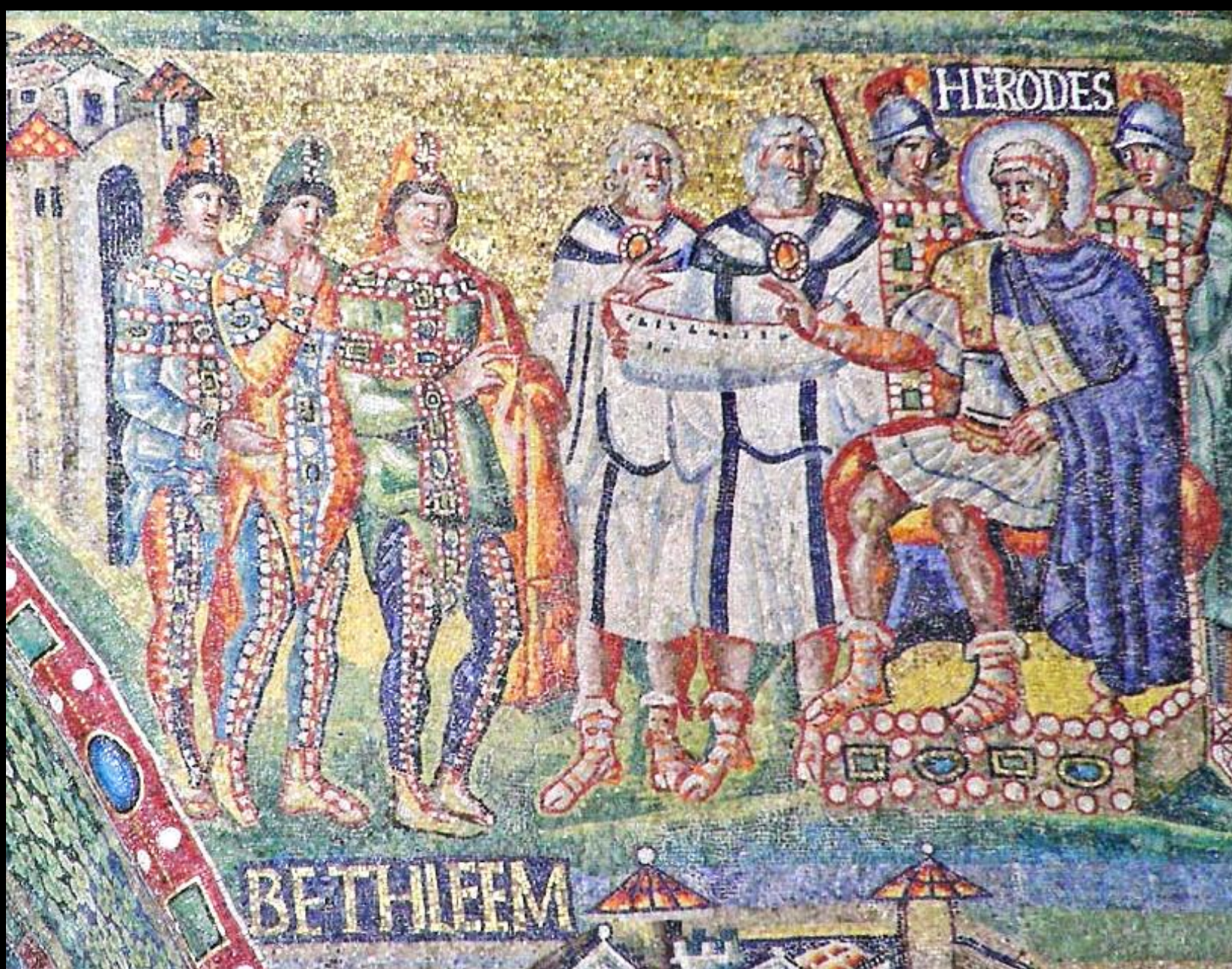
Herod Speaks with the Magi -- Mosaic, Santa Maria Maggiore, Rome, Italy