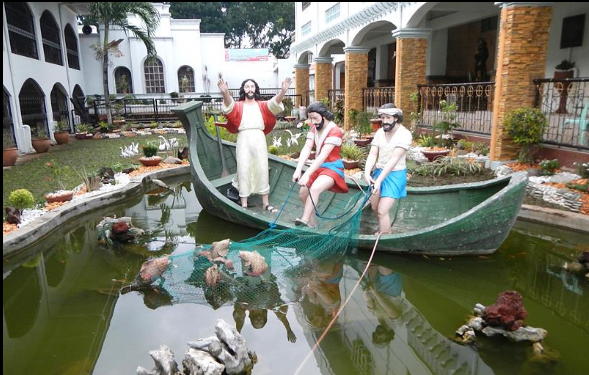
Christ and Simon Peter and Andrew -- San Pedro Bautista, Candelaria, Philippines