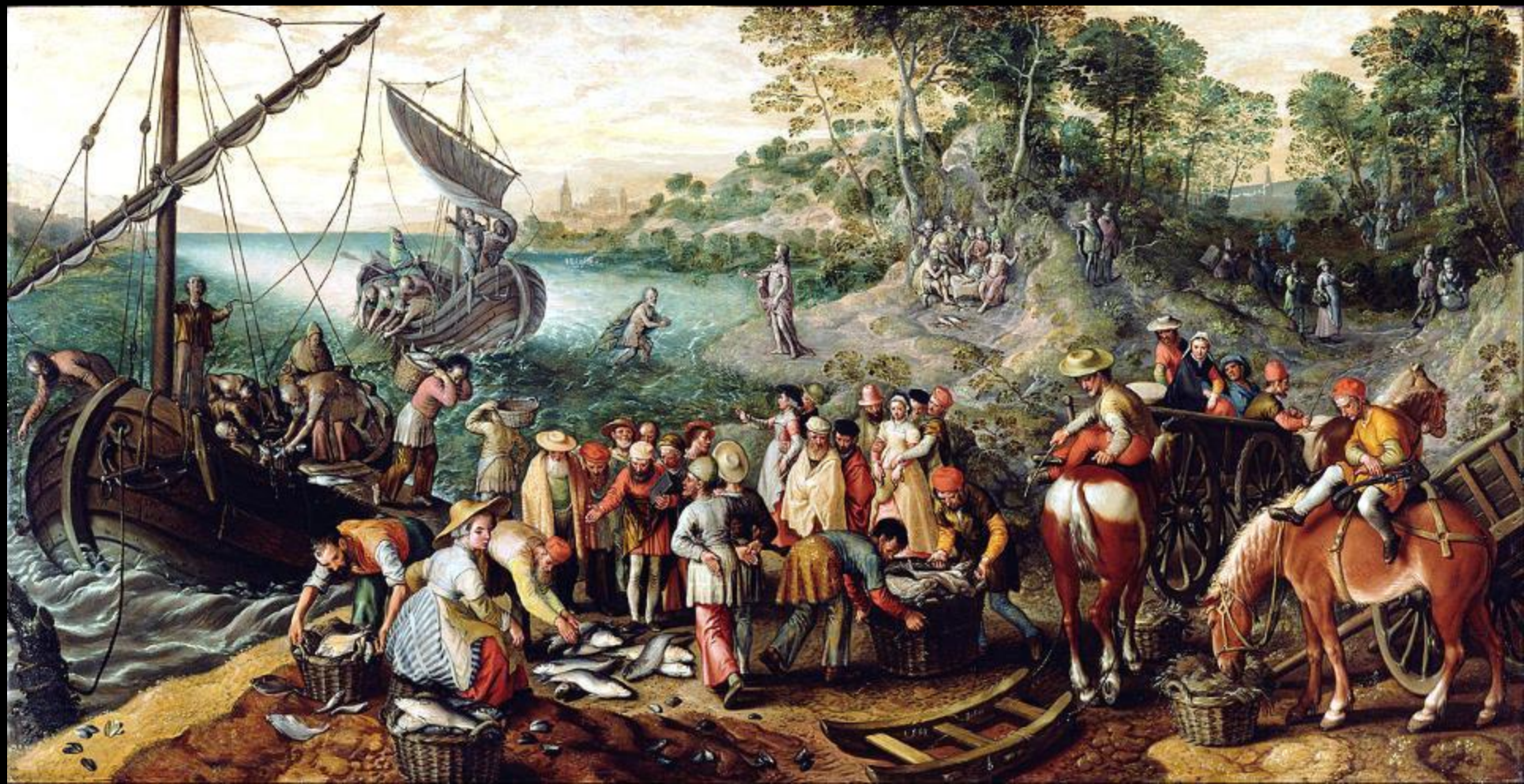
Miraculous Draught of Fishes -- Joachim Beuckelaer, Getty Center, Los Angeles, CA