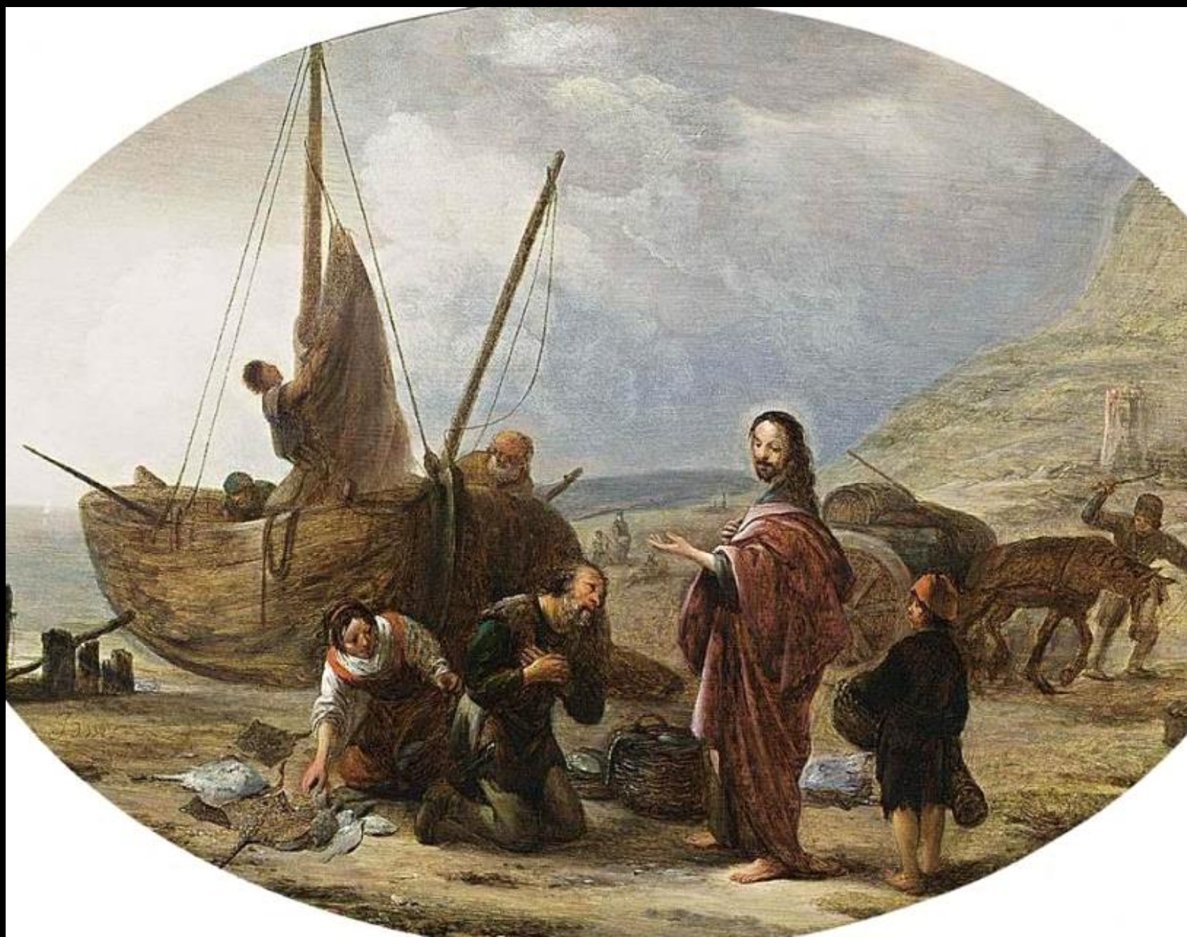
The Calling of Simon Peter -- Jacob de Wet, first half of 17 th c.