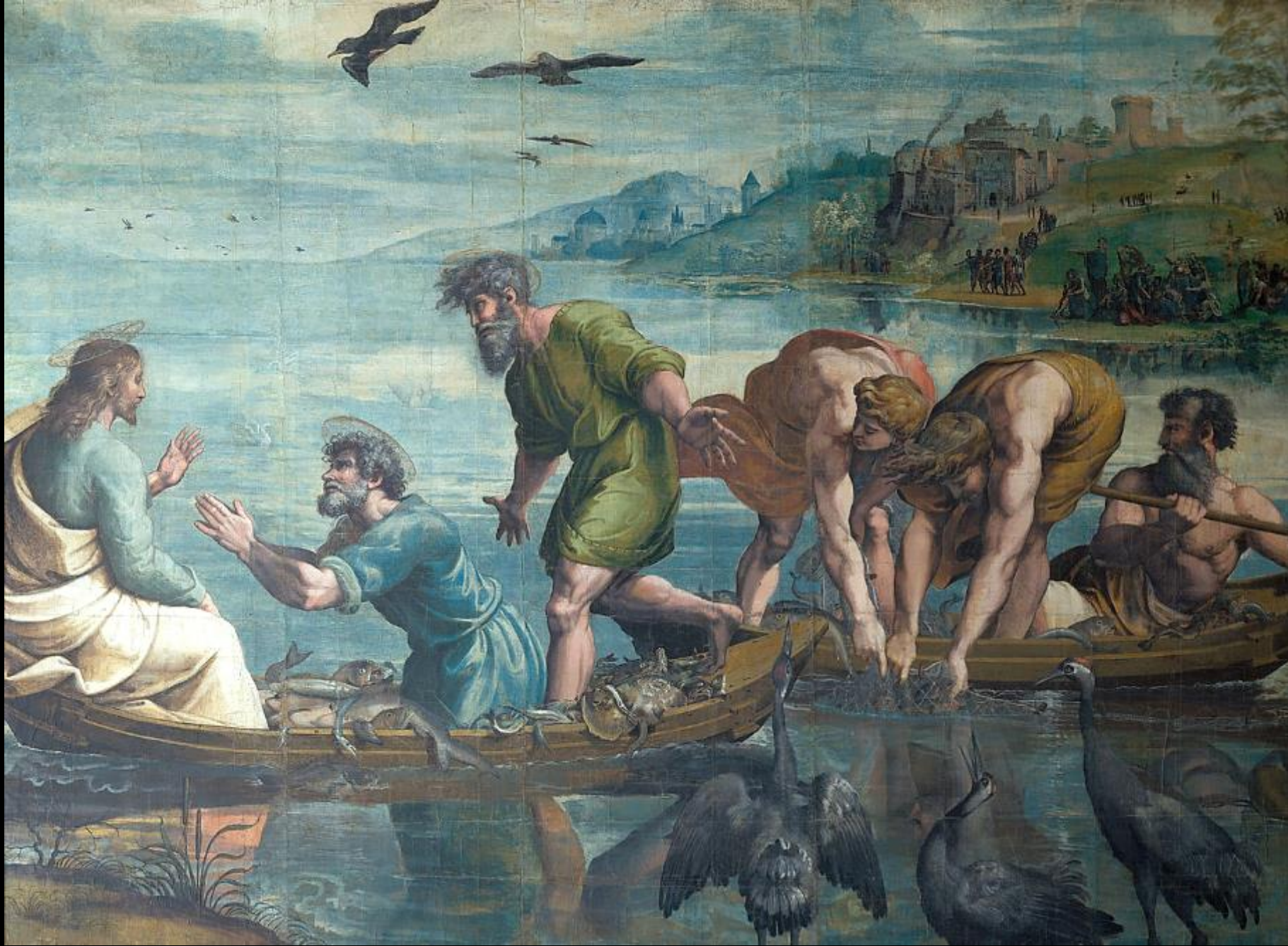
The Miraculous Draught of Fishes -- Raphael, Victoria and Albert Museum, London, England