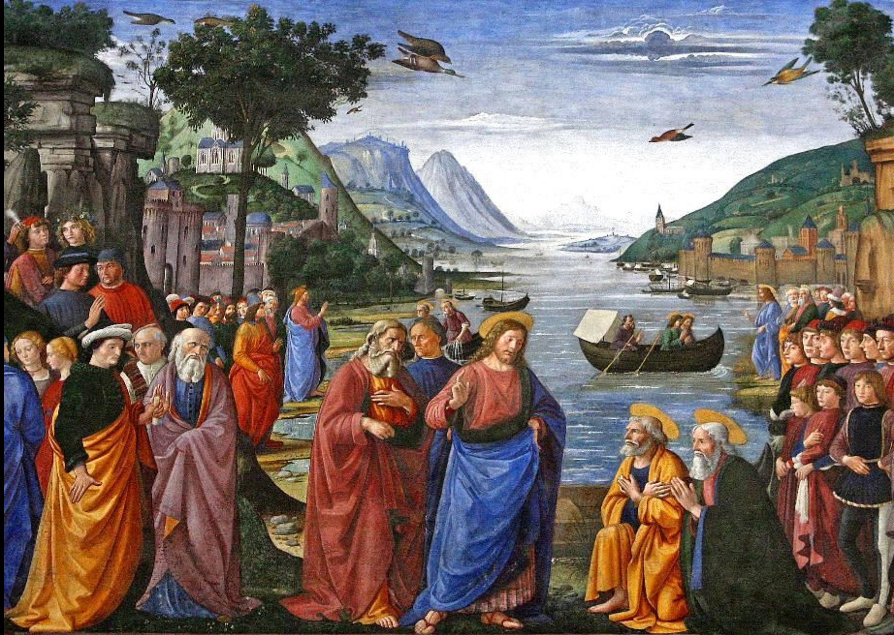
Calling of the Disciples -- Domenico Ghirlandaio, Sistine Chapel, Vatican, Vatican City, Italy