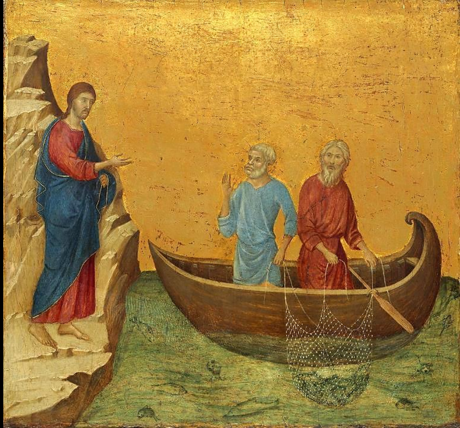
Christ Calls Simon Peter and Andrew

Duccio, National Gallery of Art, Washington, DC