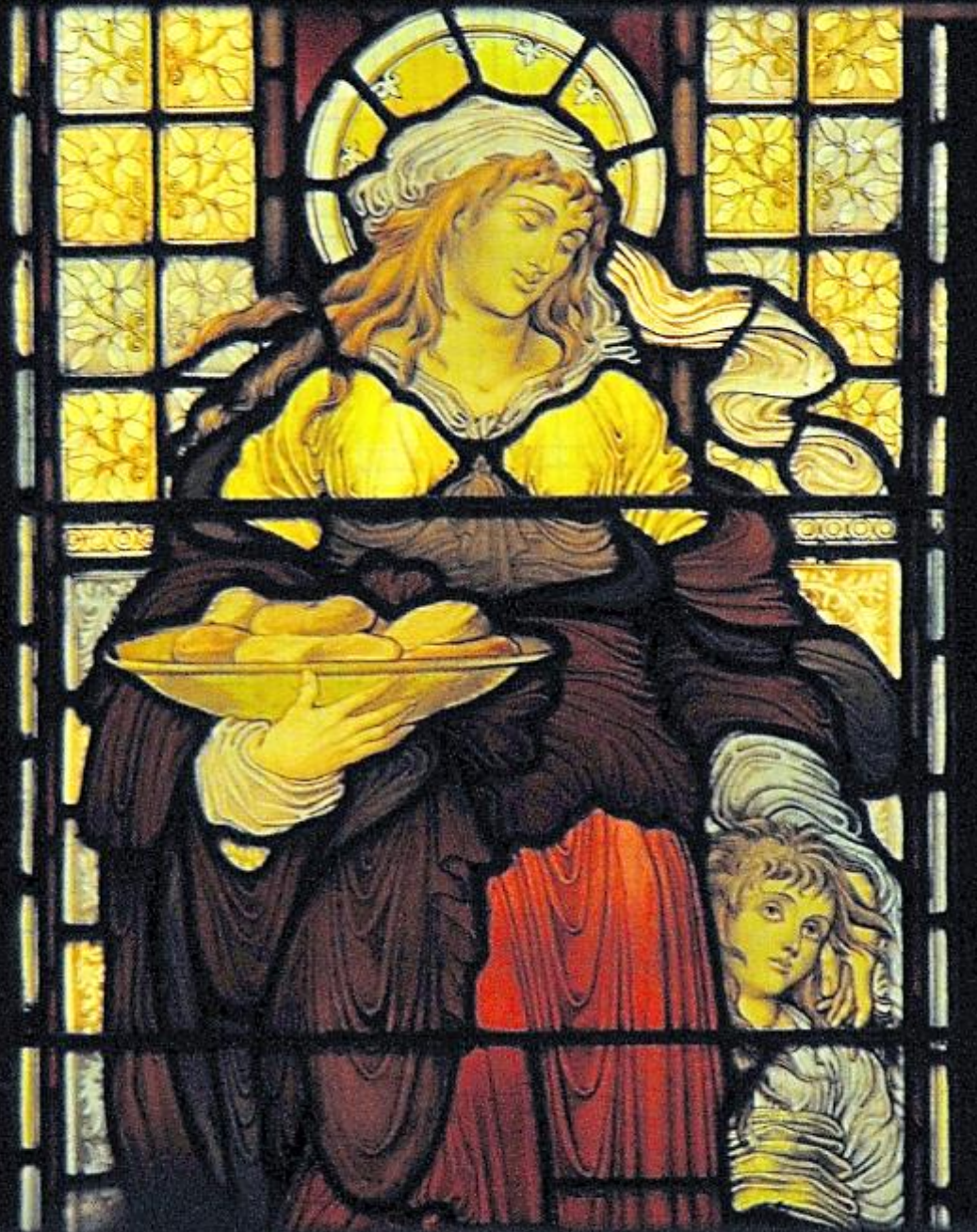
Dorcas Window Llandaff Cathedral Cardiff, Wales