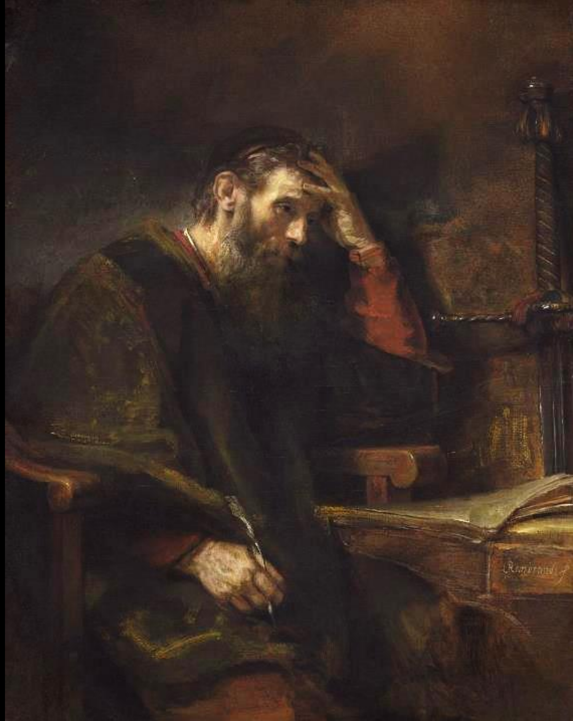
The Apostle Paul Rembrandt (attr.) National Gallery of Art Washington, DC