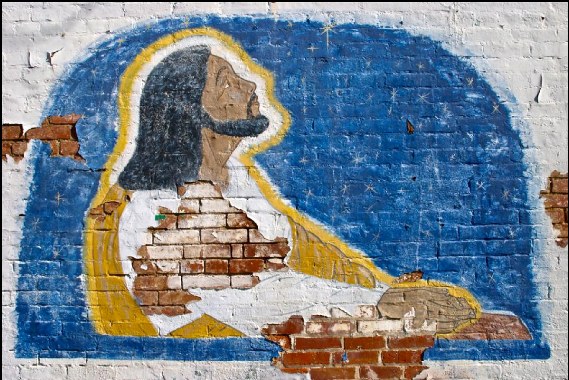
Jesus Christ -- Mural, West End, Louisville, KY