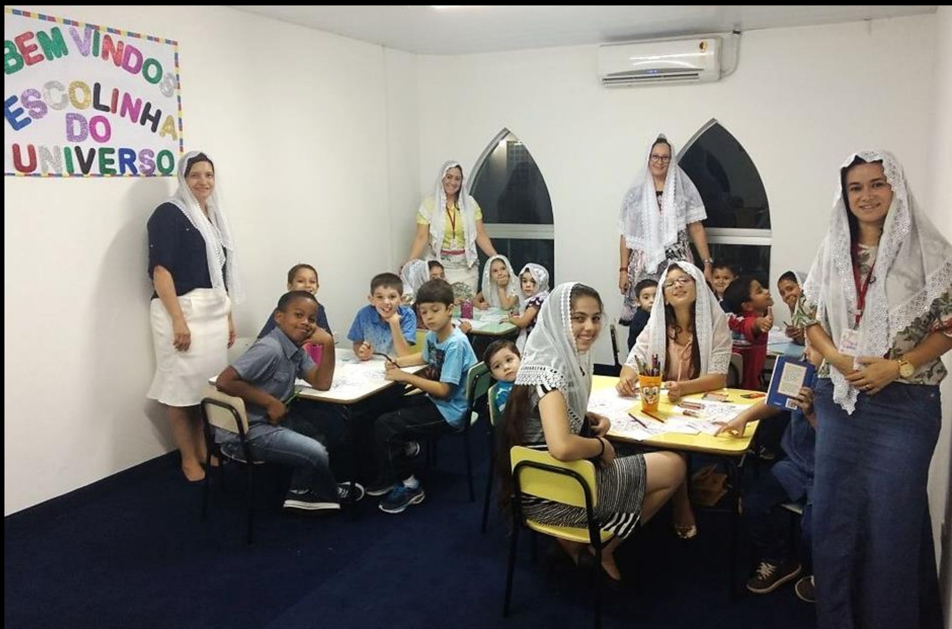
Children's Sunday School -- Pentecostal Church, Brazil