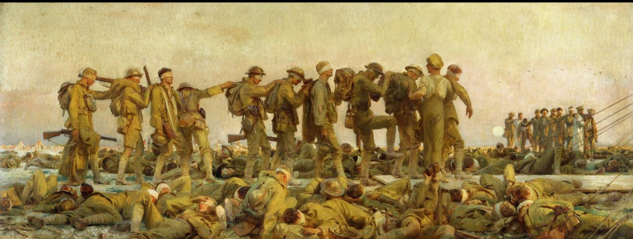
Gassed -- John Singer Sargent, Imperial War Museum, London, England