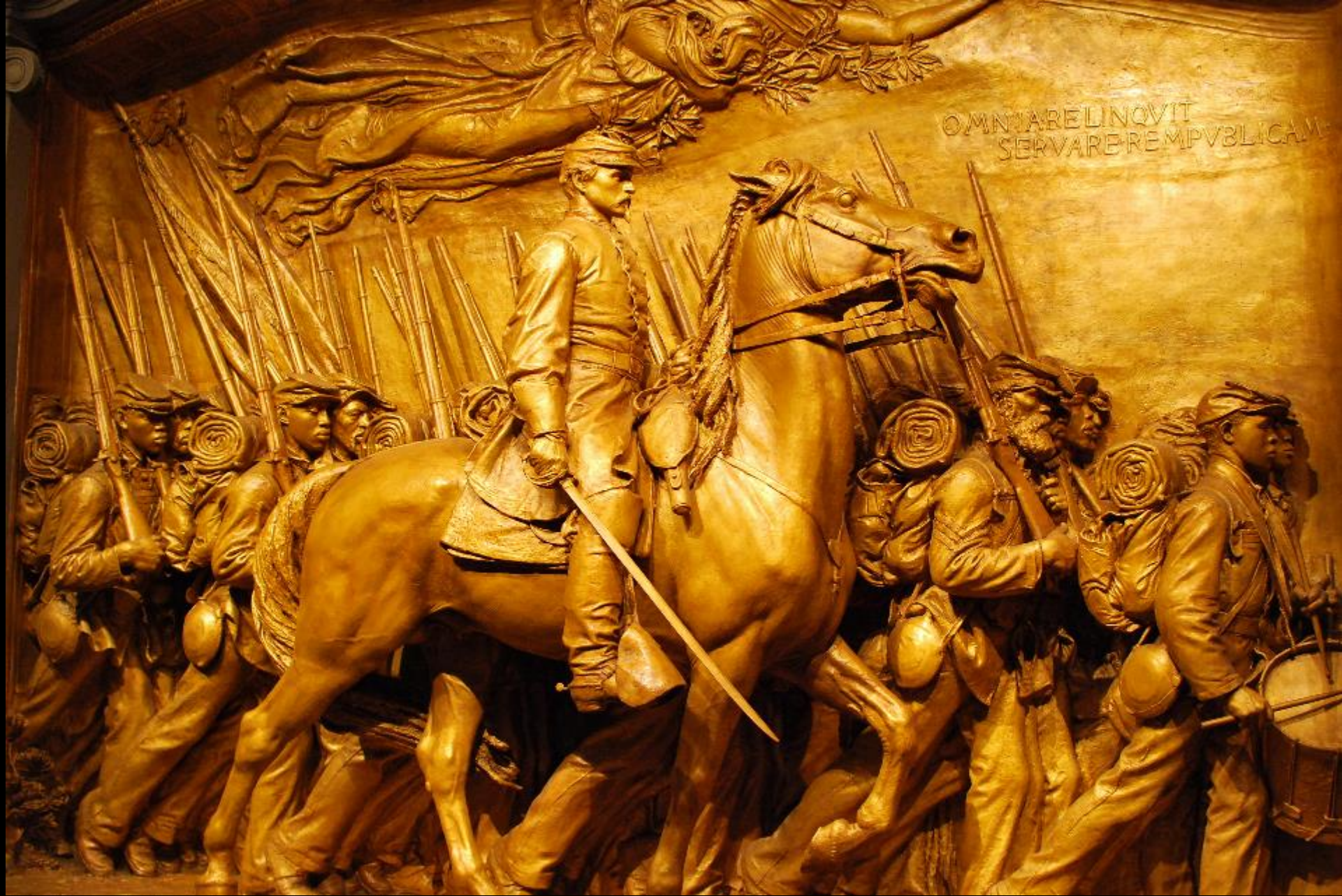
Shaw Memorial, Civil War -- Augustus Saint-Gaudens, National Gallery of Art, Washington, DC