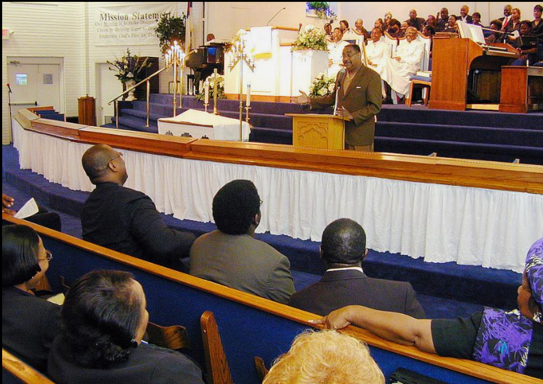
Address on Flood Relief, Payne Memorial AME Church, Houston, TX