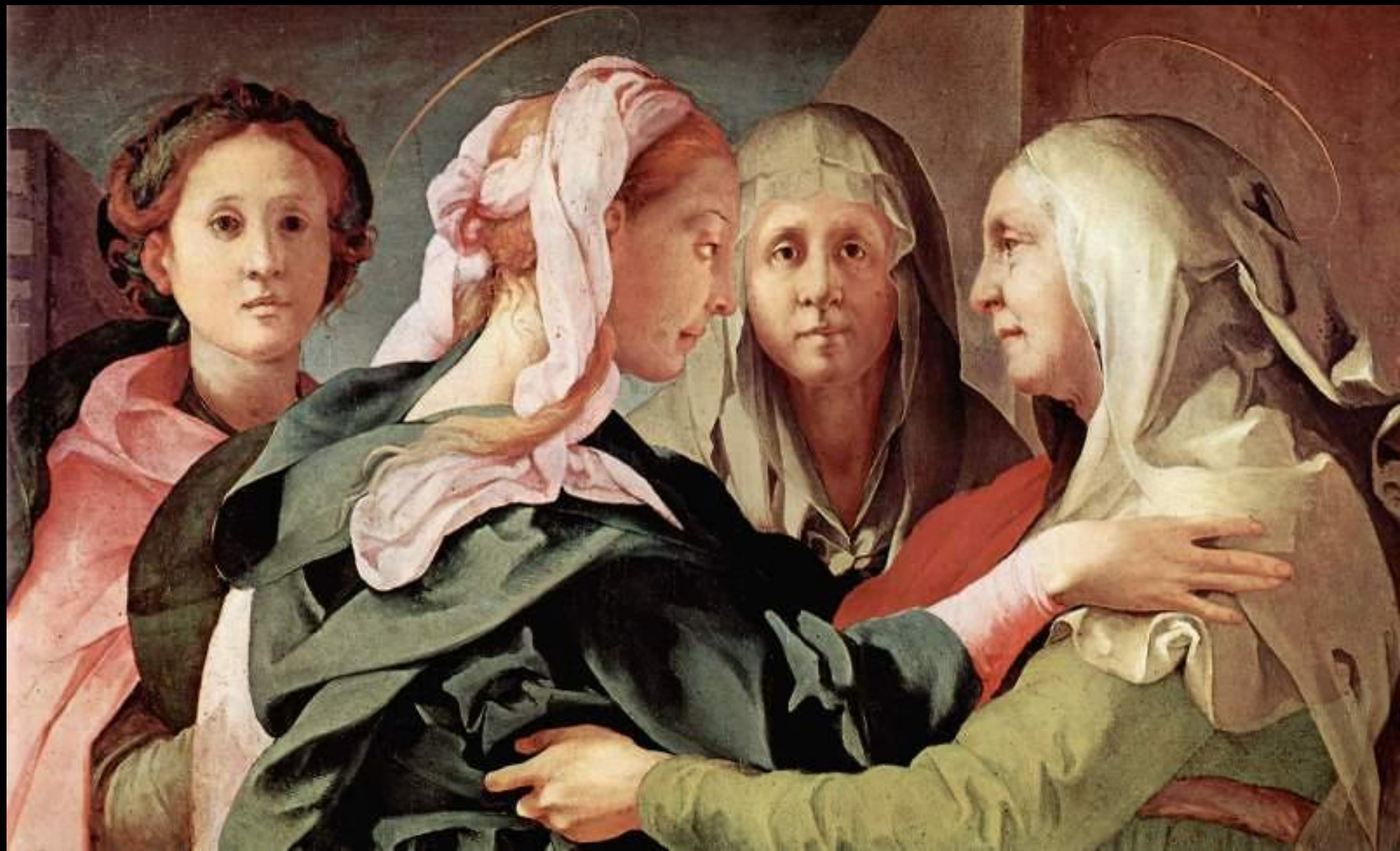
The Visitation -- Jacopo da Pontormo, Pfaarkirche, Carmignano, Italy