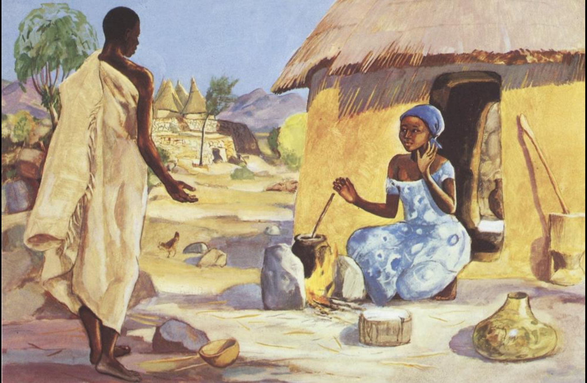
The Annunciation -- JESUS MAFA, Cameroon