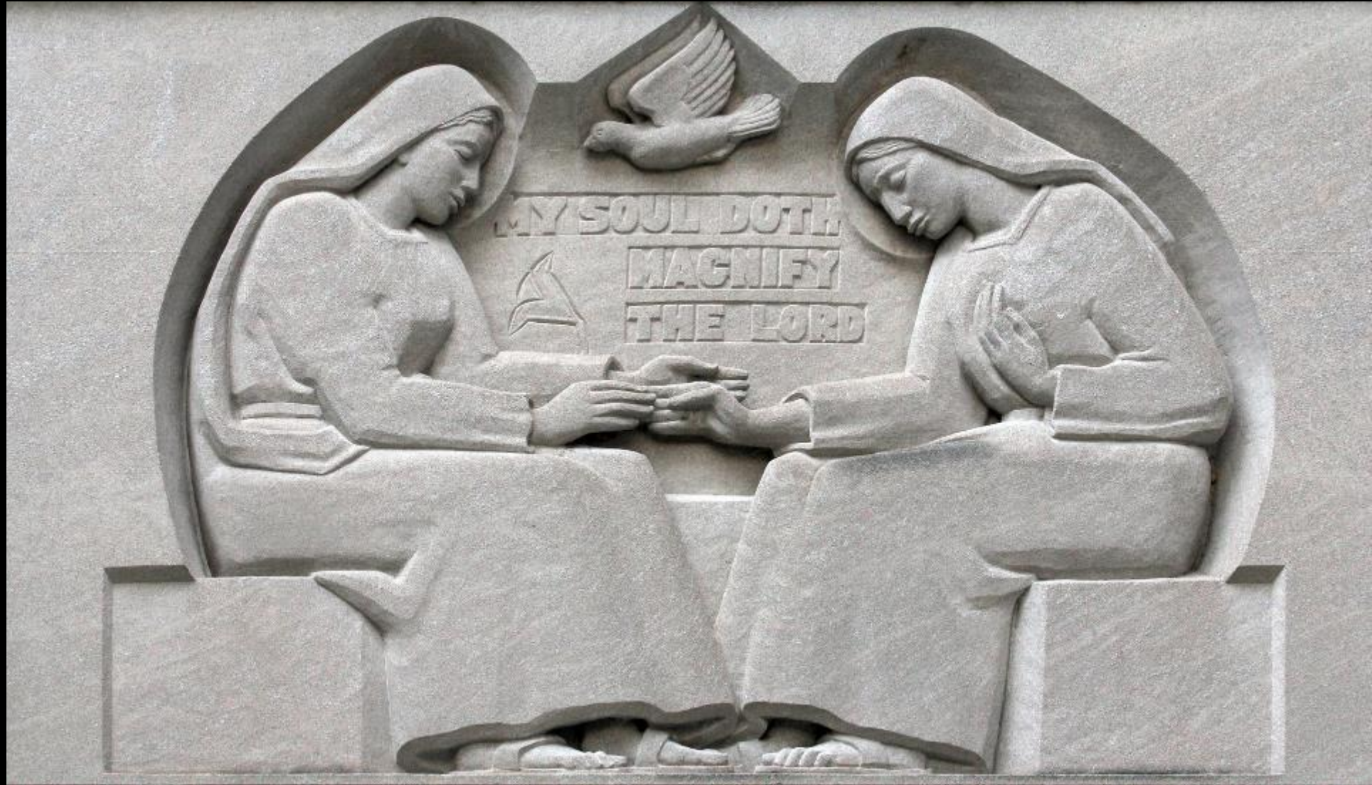
The Magnificat ("My Soul Doth Magnify the Lord") -- Baltimore Cathedral, Baltimore, MD