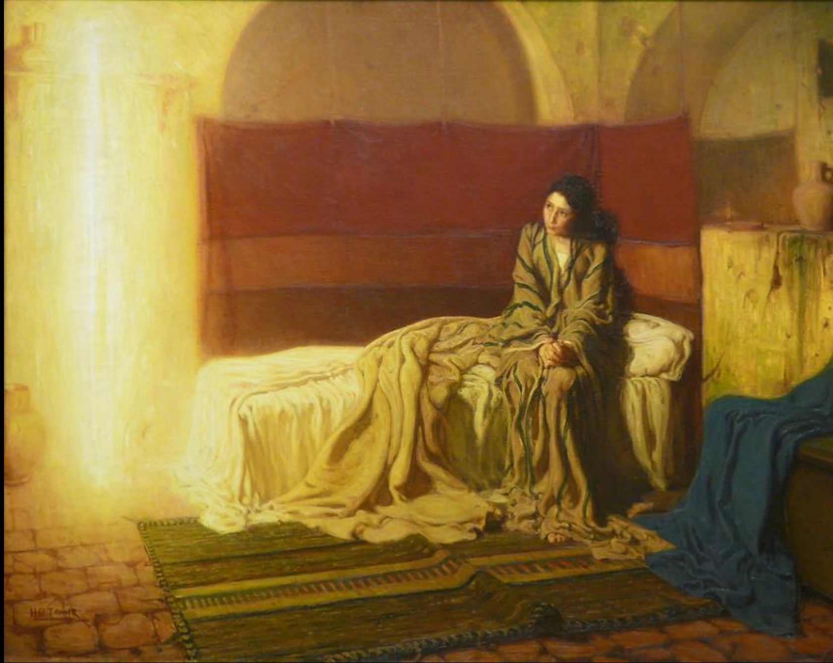
The Annunciation -- Henry Ossawa Tanner, Philadelphia Museum of Art, Philadelphia, PA