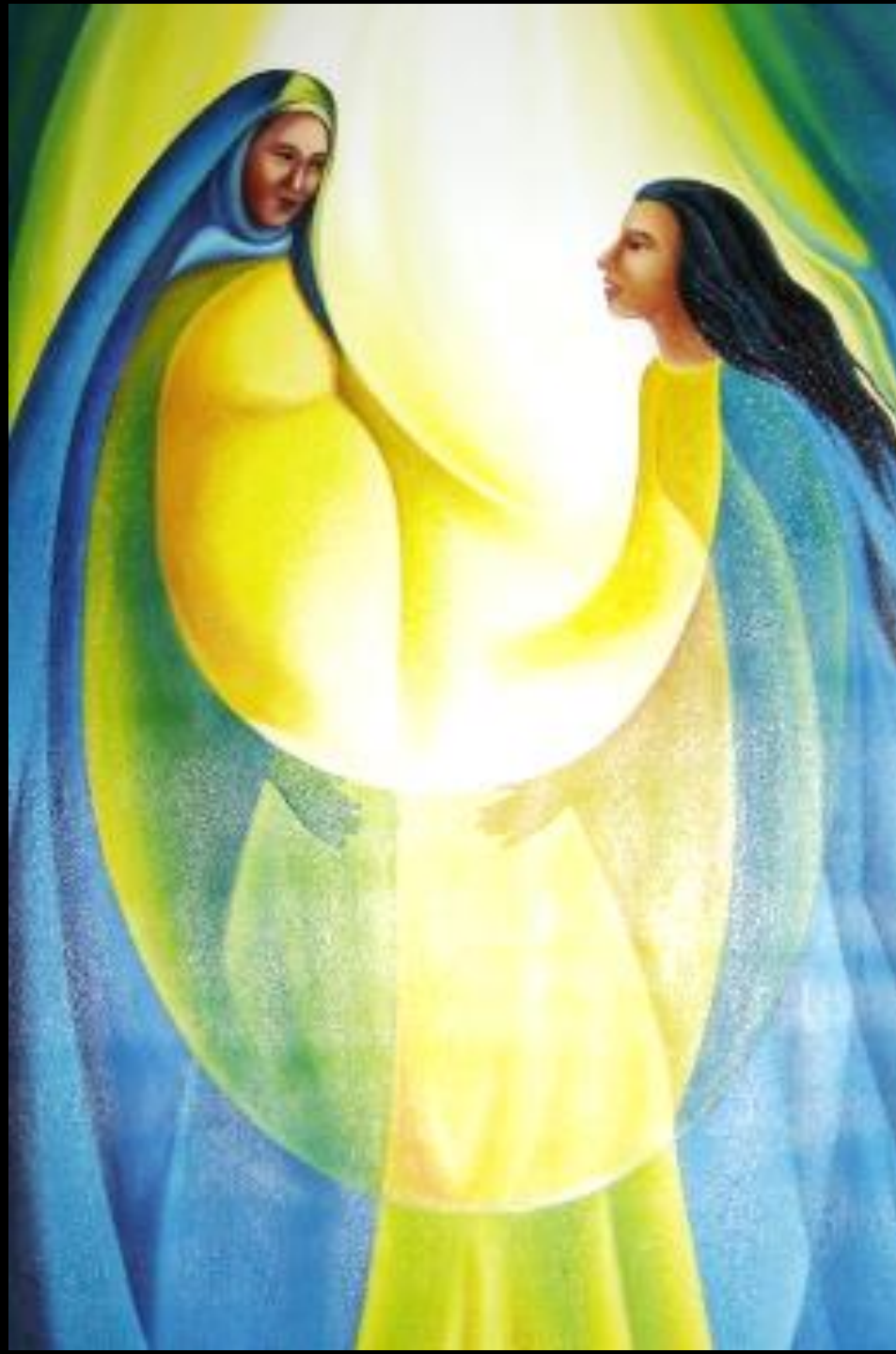
Visitation Church of El Sitio El Sitio, El Salvador