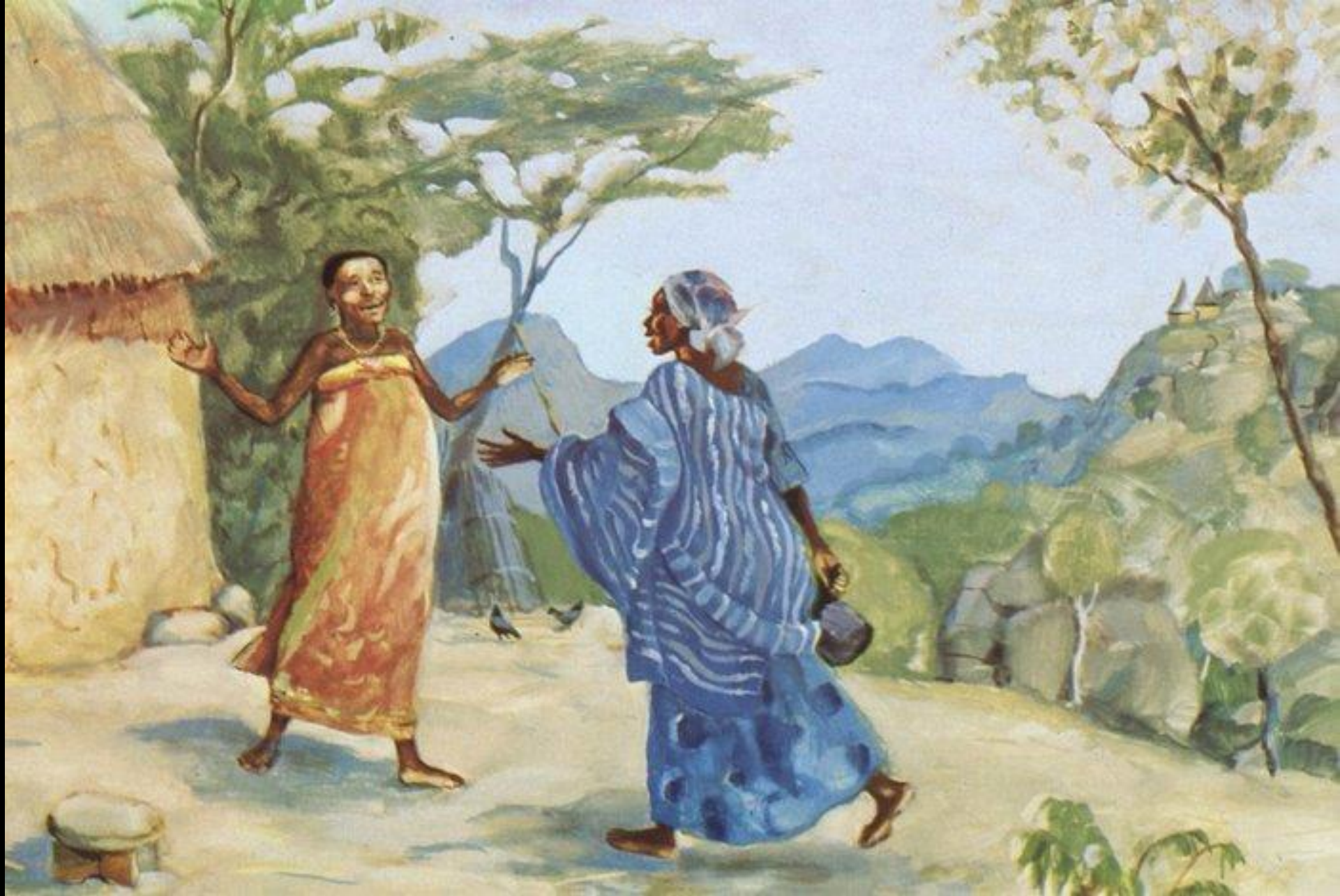
Elizabeth and Mary Greet Each Other -- JESUS MAFA, Cameroon