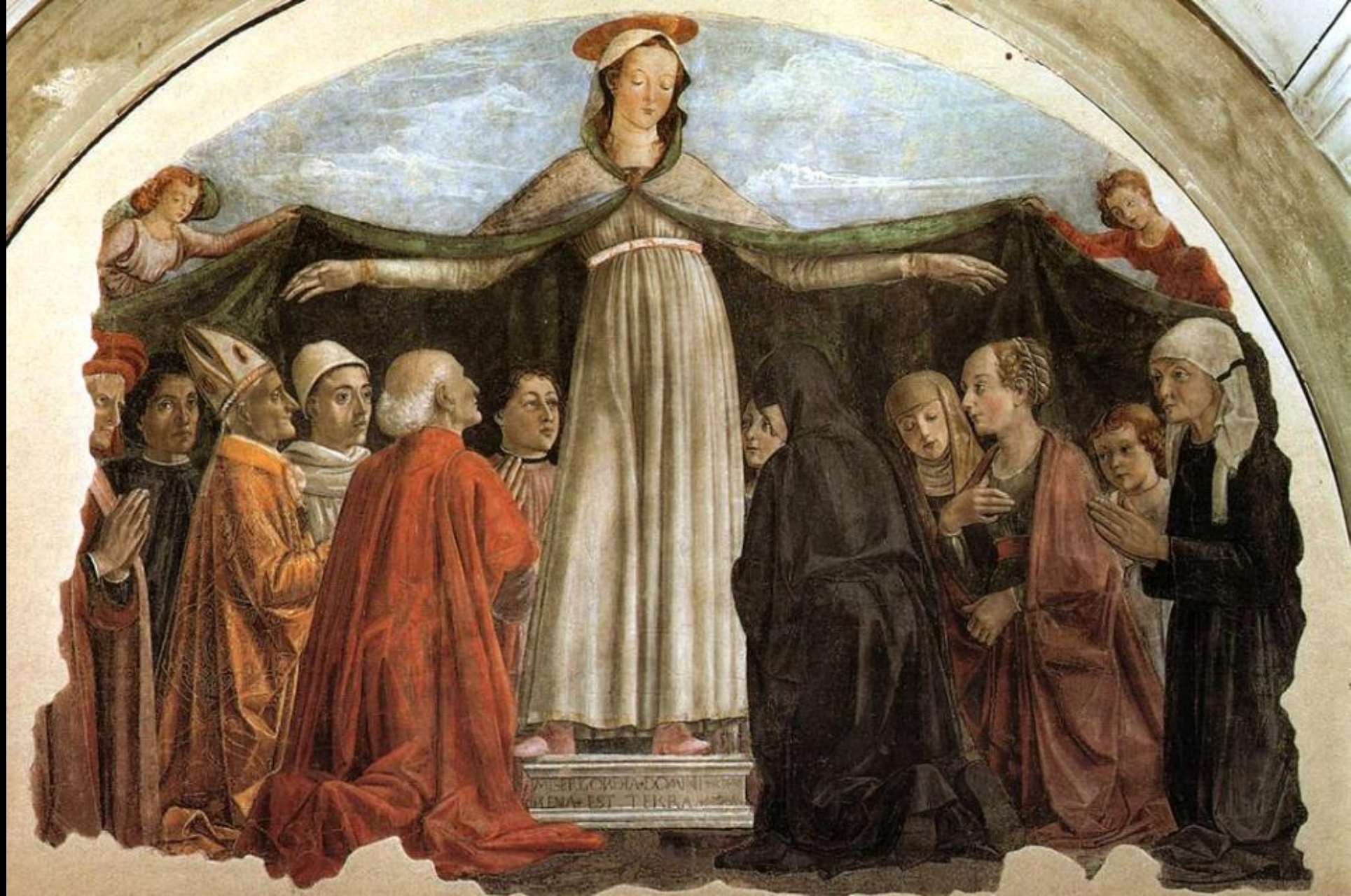
Madonna of Mercy -- Domenico Ghirlandaio, San Salvatore di Ognissanti, Florence, Italy