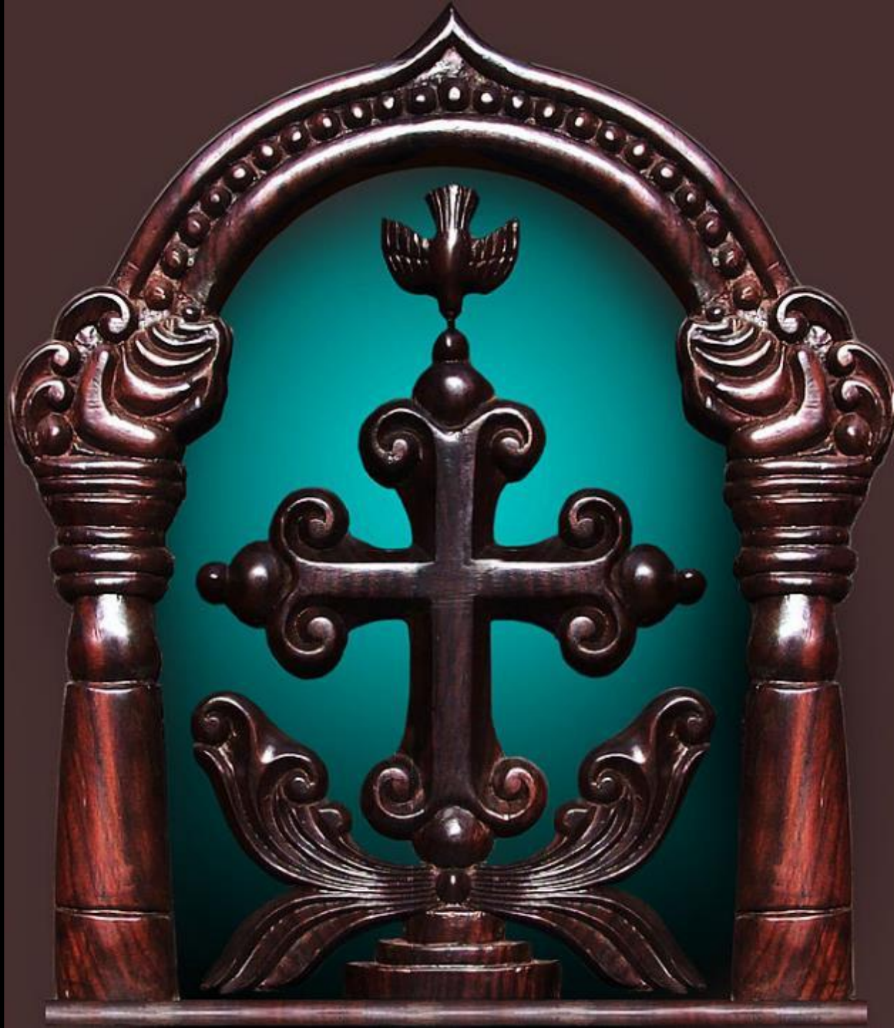
Mar Thoma Sliva Cross