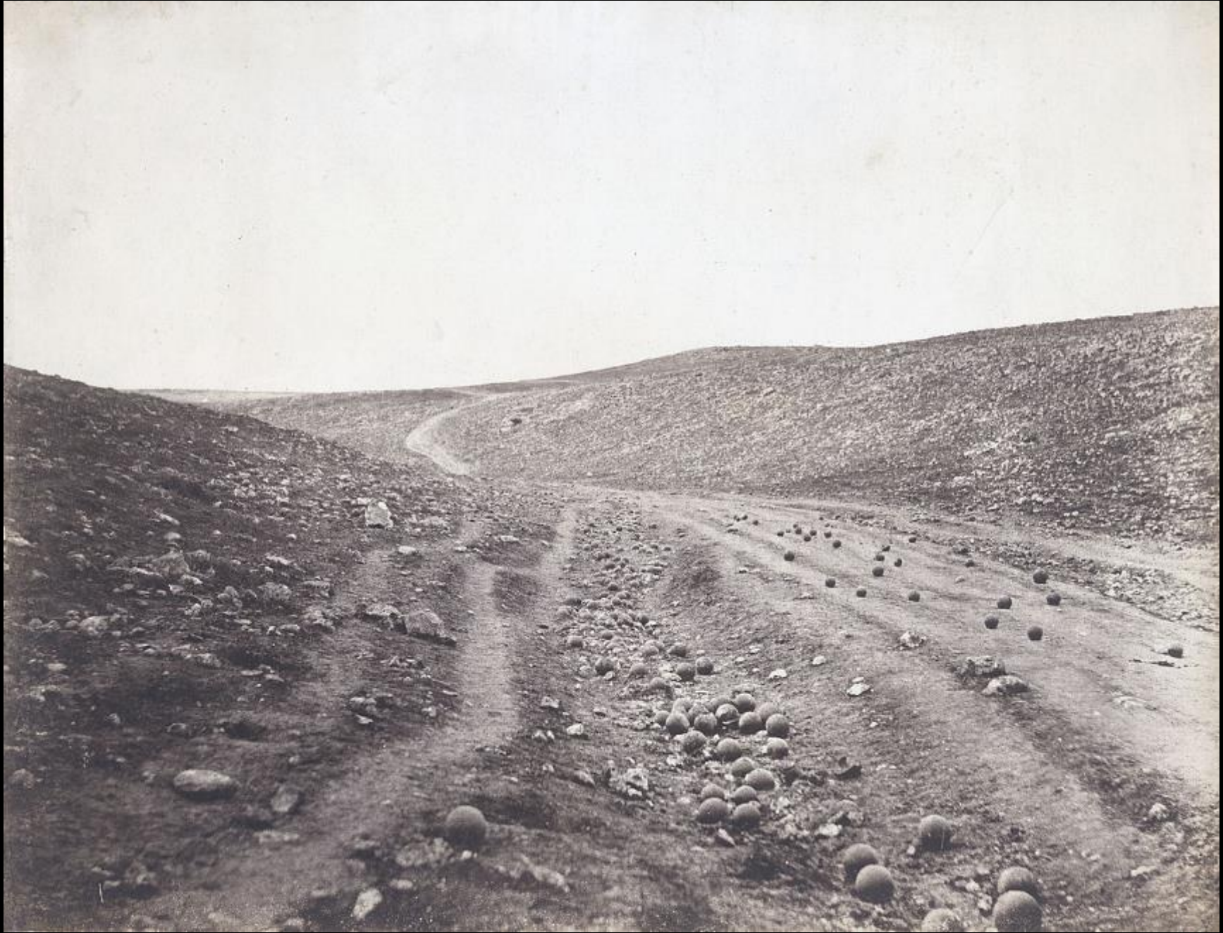
Valley of the Shadow of Death, Crimean War -- Roger Fenton, V&A Museum, London