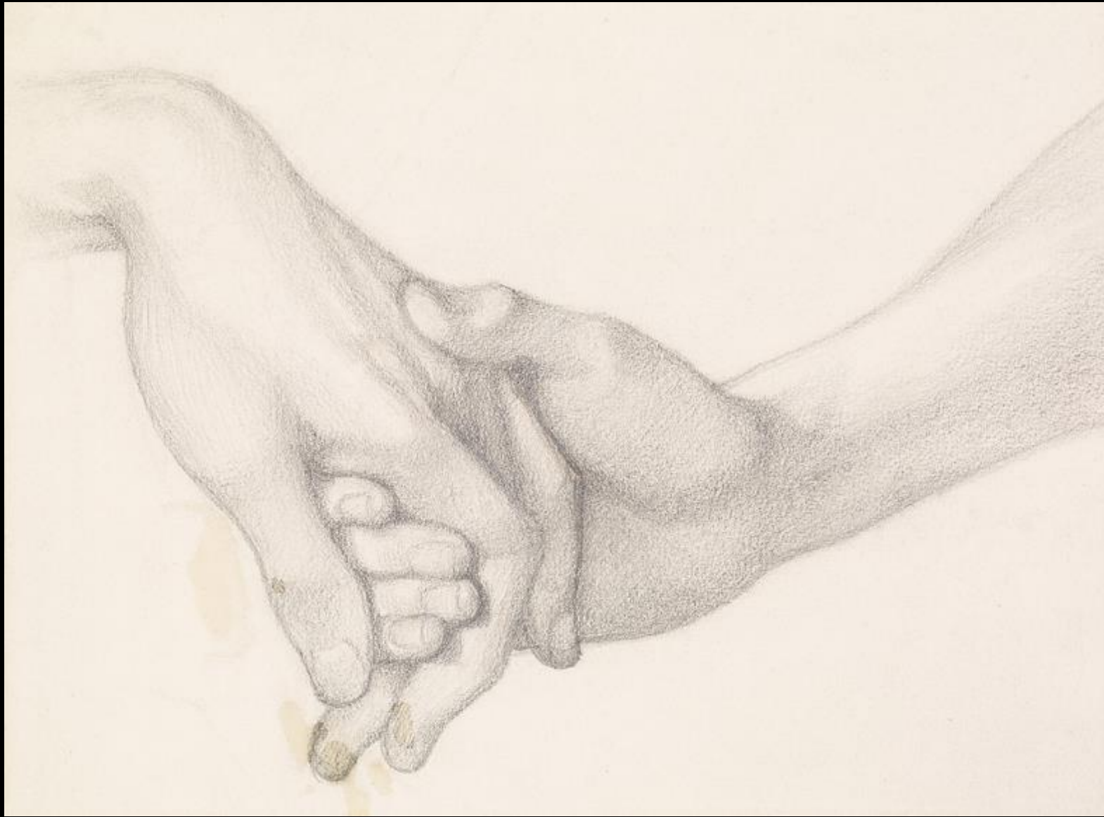
Hand of Love (study) -- Dante Rossetti, Birmingham Museum, Birmingham, England