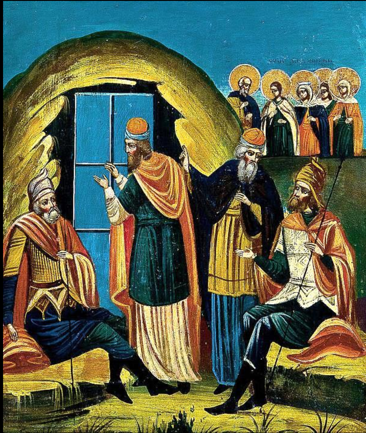
Sealing of Christ's Tomb Russian icon, late 19 th c.