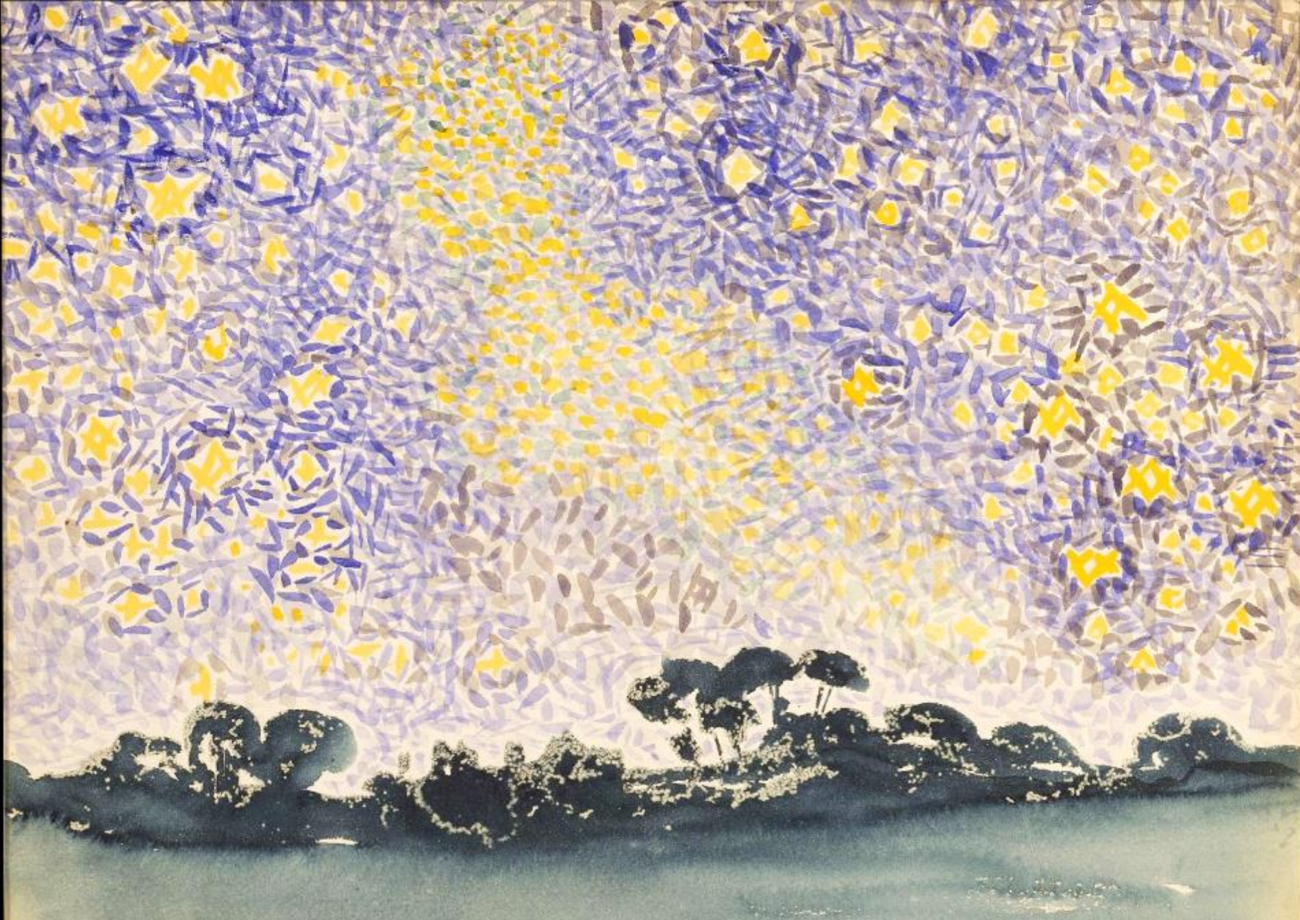
Landscape with Stars -- Henri-Edmond Cross, Metropolitan Museum of Art, New York, NY