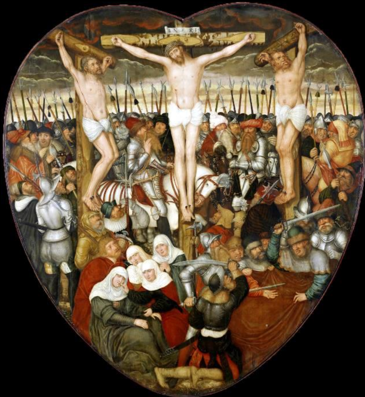
Heart-Shaped Altar, Crucifixion