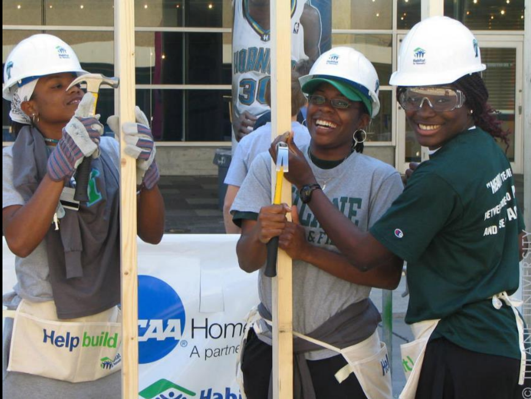
Tulane Students Helping to Build a Habitat for Humanity House