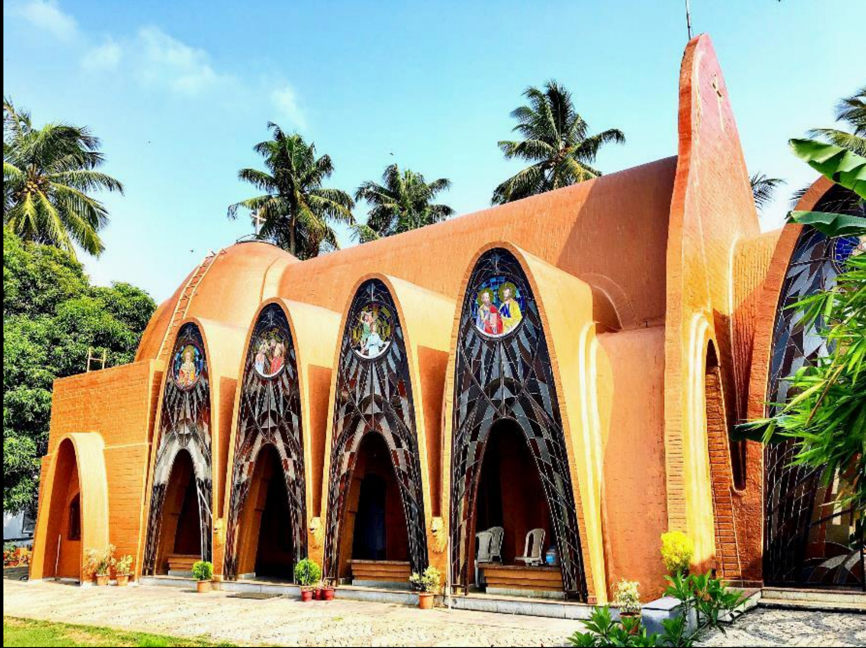
St George Orthodox Koonan Kurish Old Church -- Kerala, India (Mar Thoma, established AD 52)