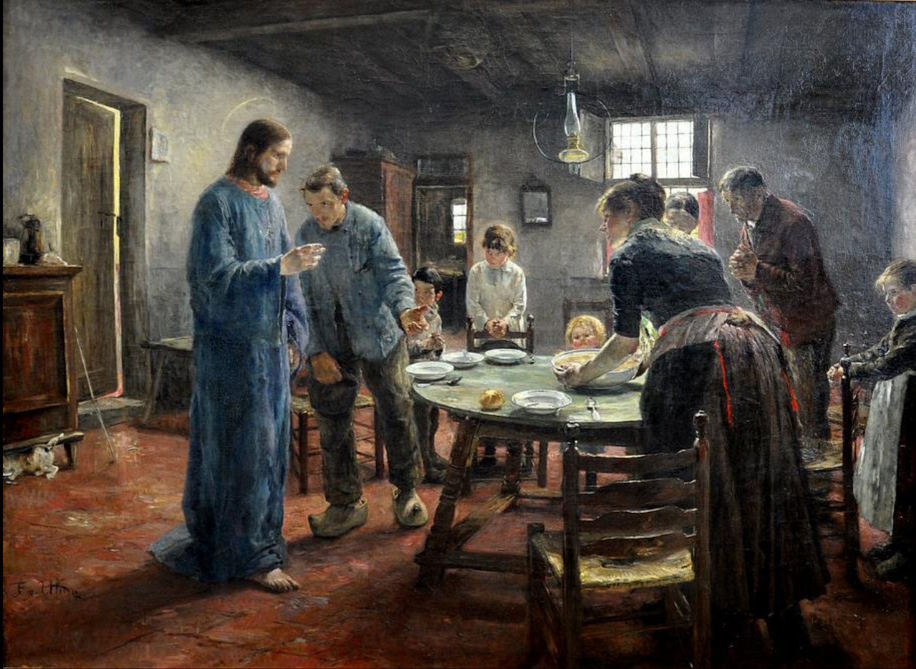
The Mealtime Prayer -- Fritz von Uhde, Alte Nationalgalerie, Berlin, Germany