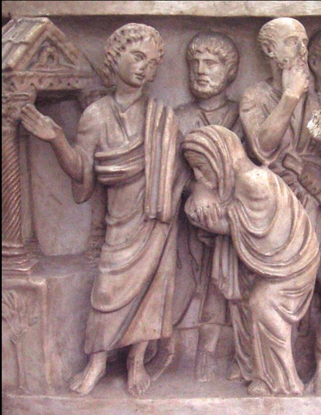
Christ Healing the Woman Bent Over

Two Brothers Sarcophagus Vatican Museum, Vatican City