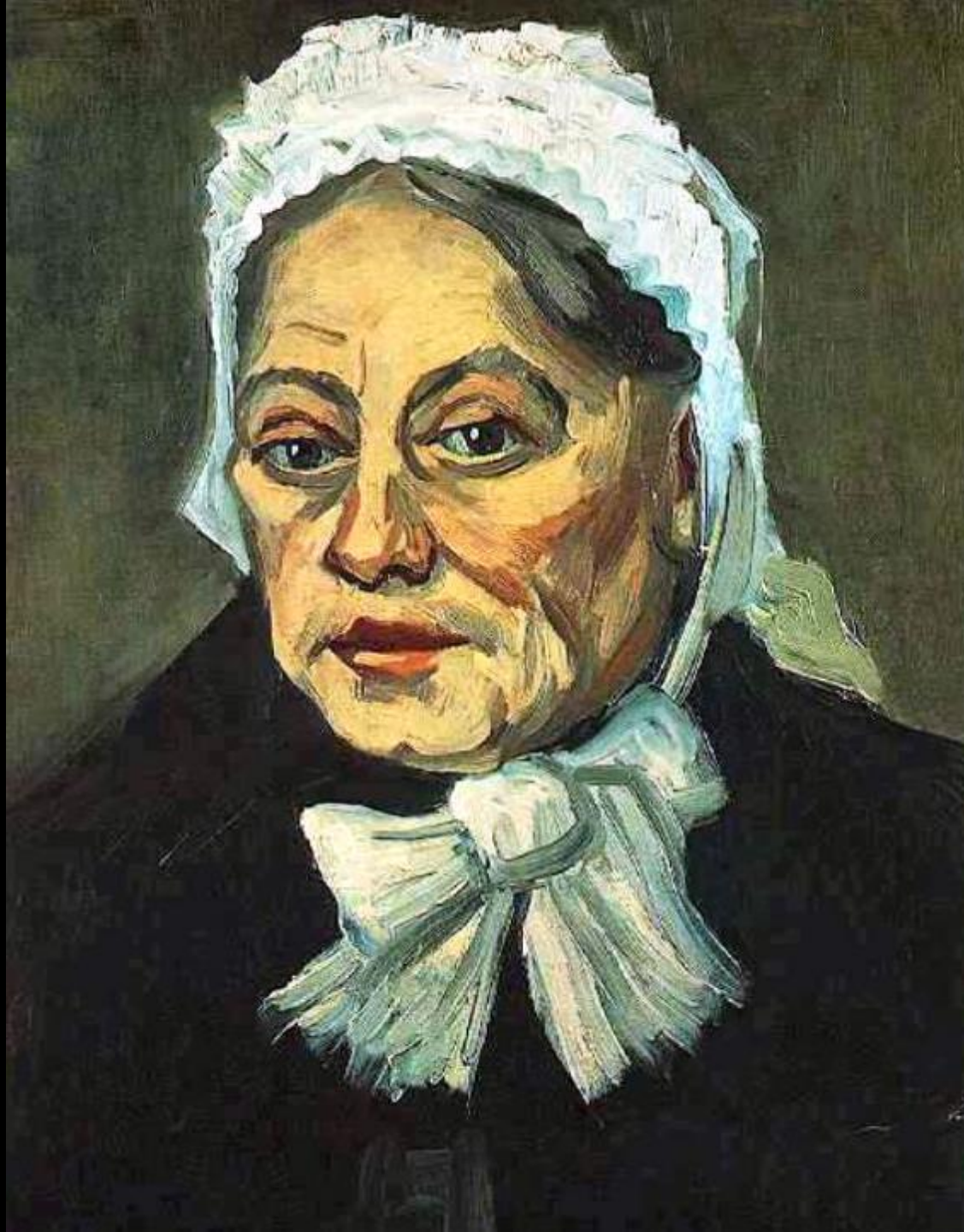
The Midwife Vincent van Gogh Van Gogh Museum Amsterdam, Netherlands