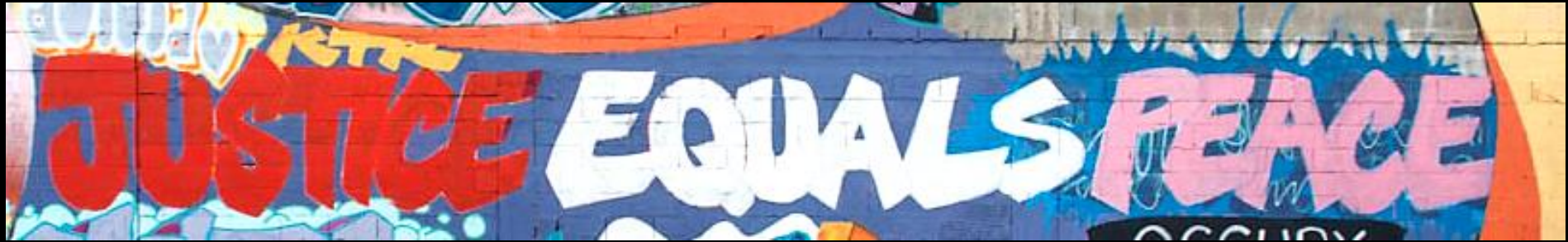
Justice Equals Peace -- detail of mural in Christchurch, New Zealand