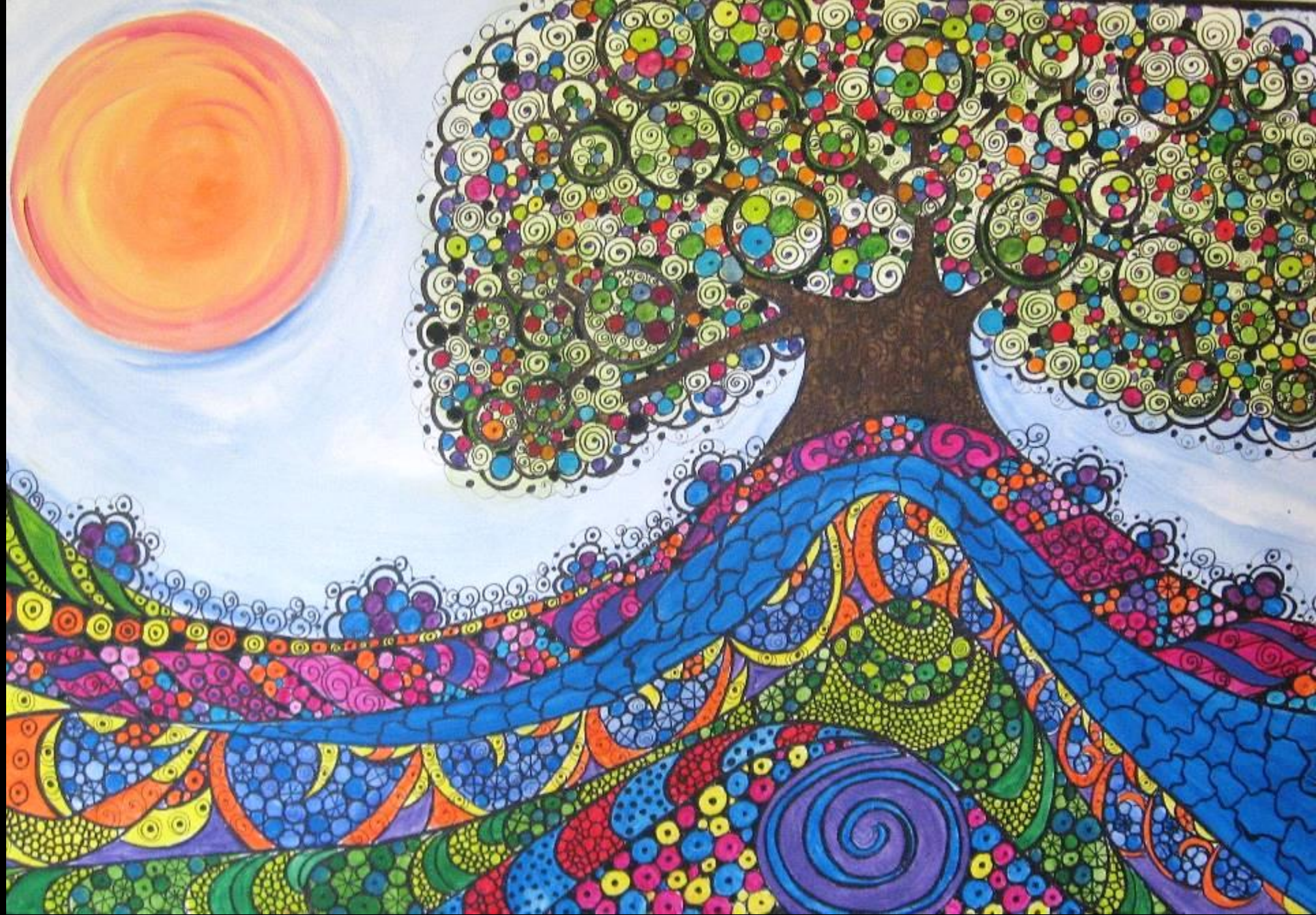
Tree of Hope for Breast Cancer Survivors -- Julie Leuthold