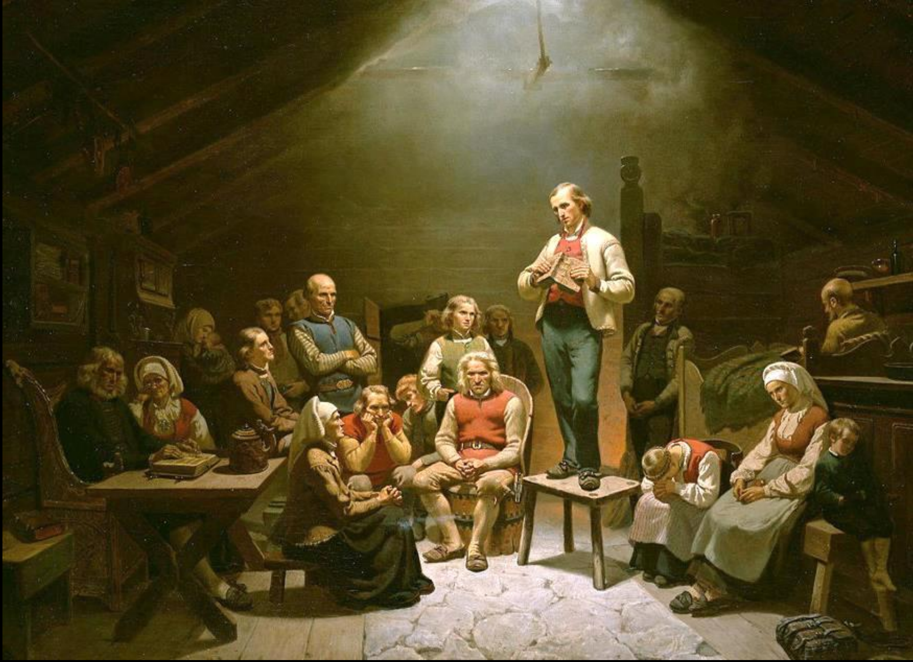
Low Church Devotion -- Adolf Tidemand, National Gallery of Norway, Oslo, Norway