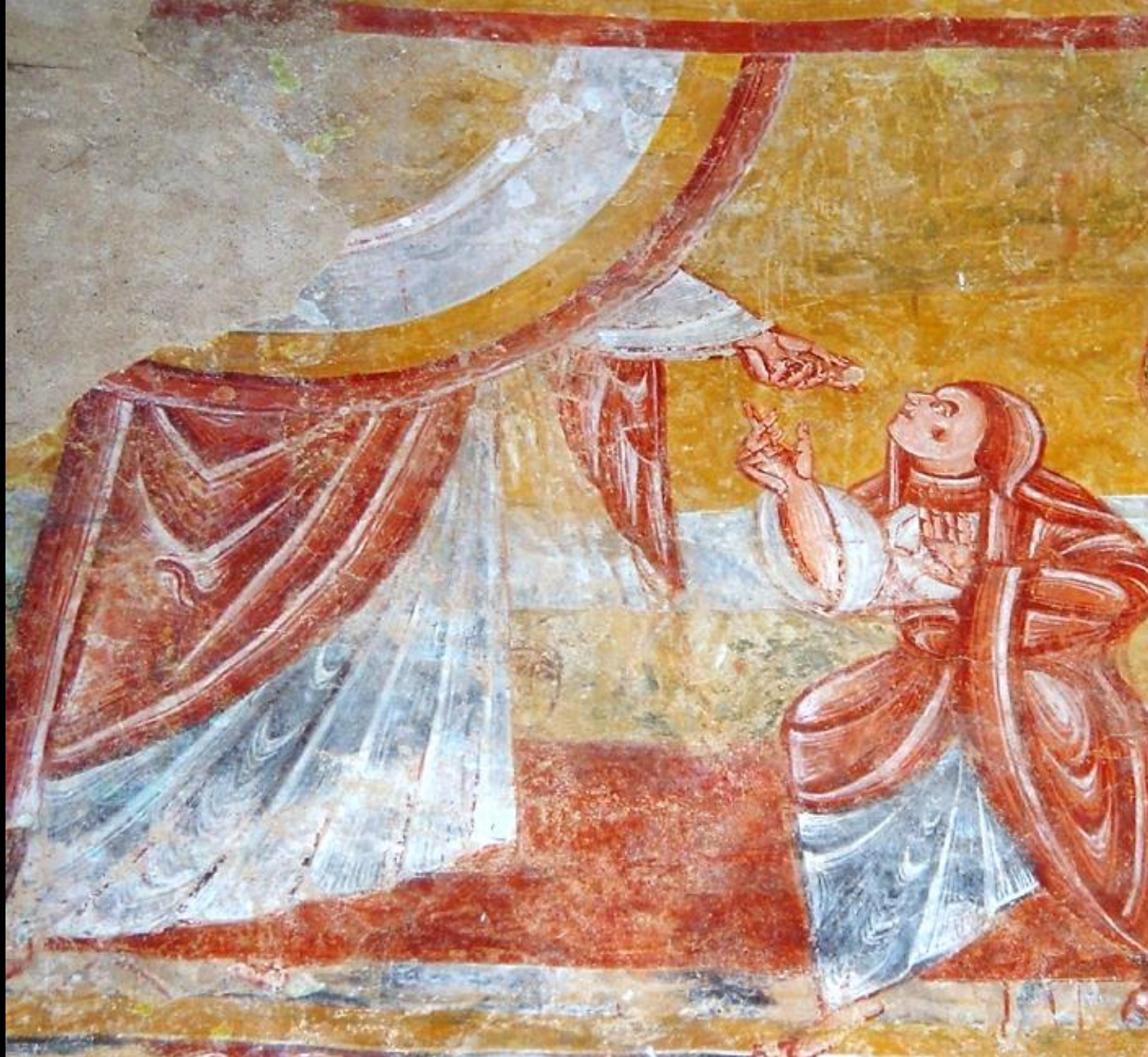
The Lord Gives Jeremiah His Words -- Church of St. Martin, Nohant-Vic, France