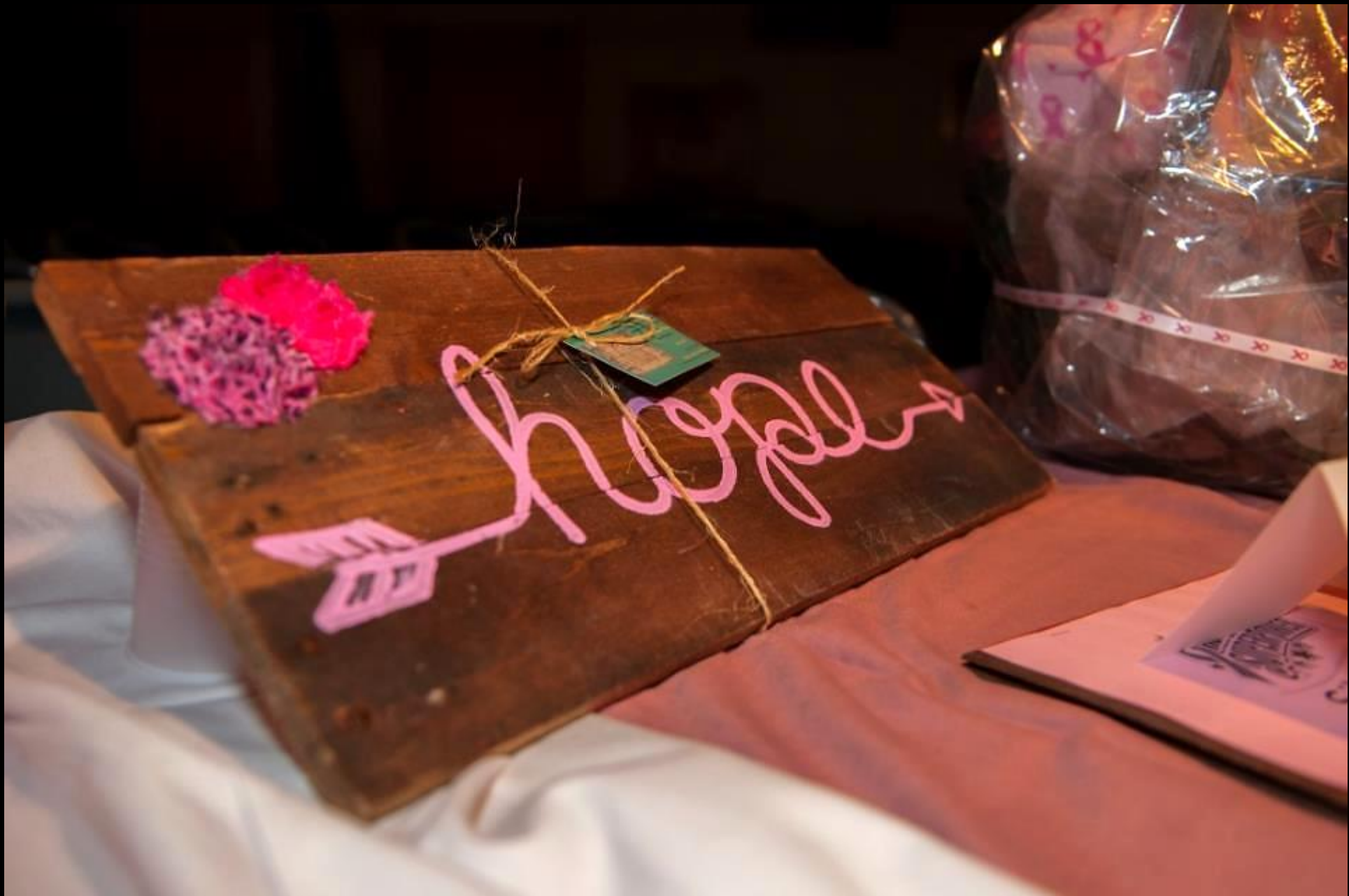
"Hope" for breast cancer patients at Minot Air Force Base medical services