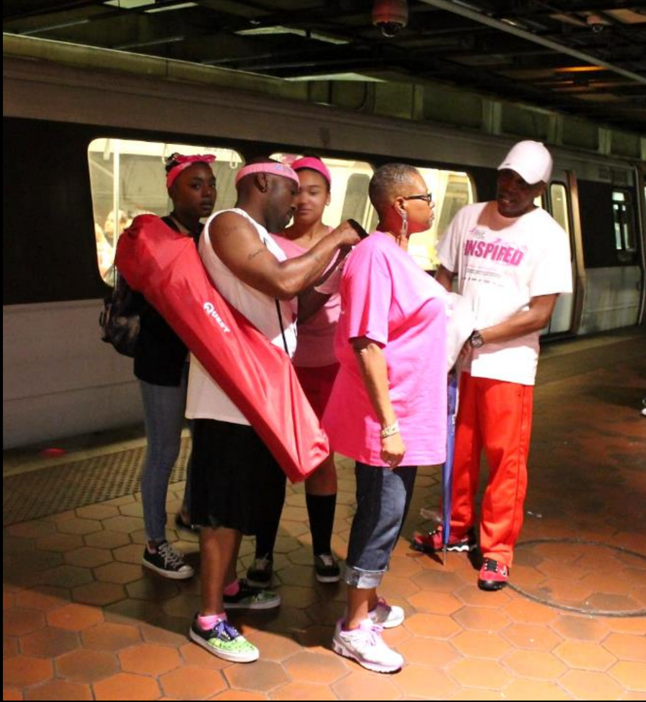
Getting Ready - Global Race for the Cure Participants