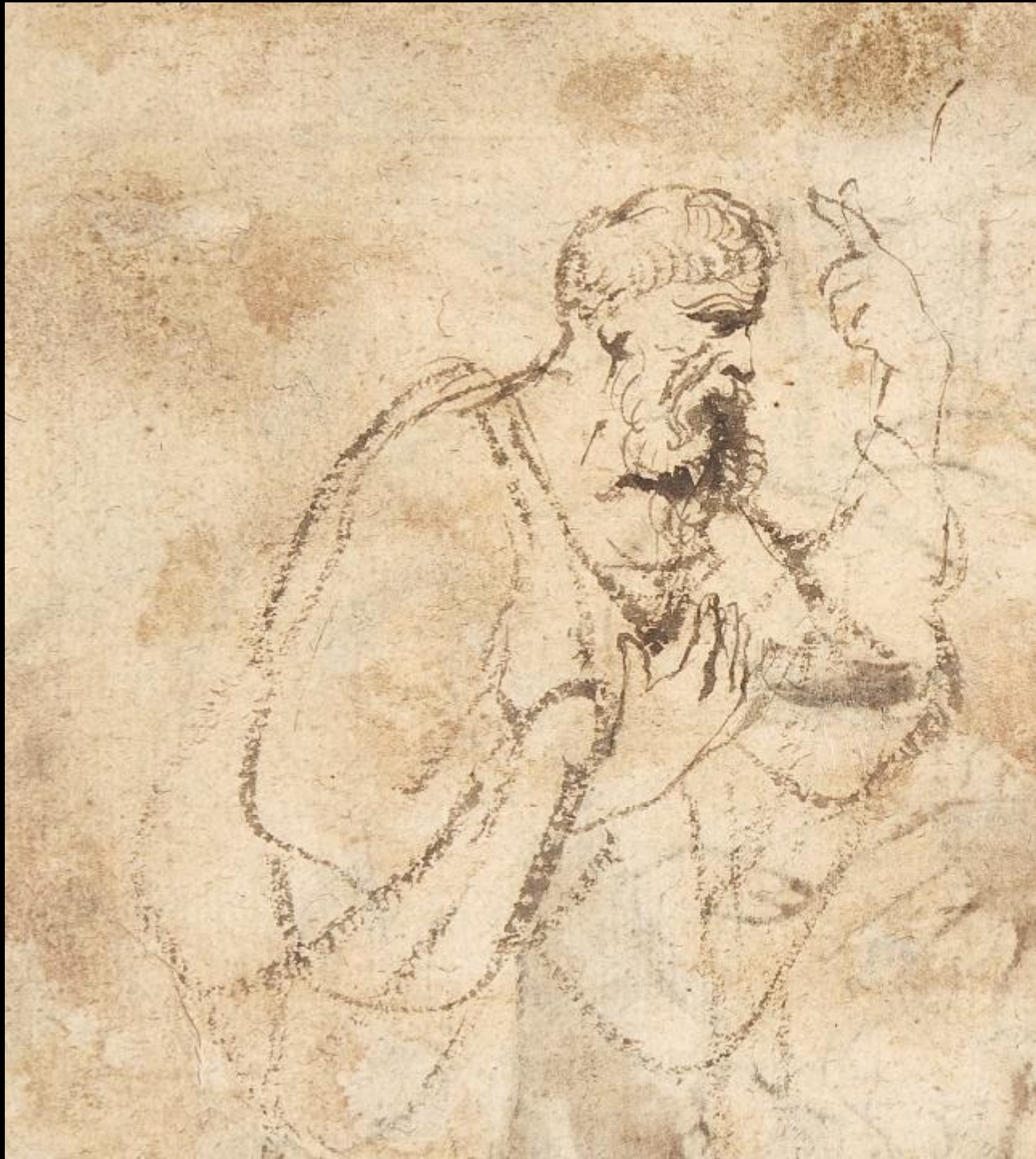
Study for a Pharisee

Anthony van Dyck Metropolitan Museum of Art New York, NY