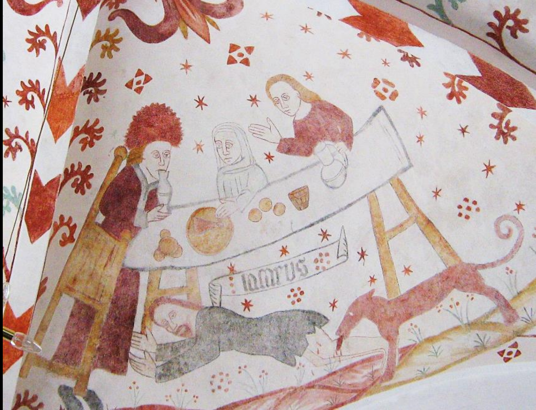
Rich Man and Lazarus -- Fanfjord Church, Mon, Denmark