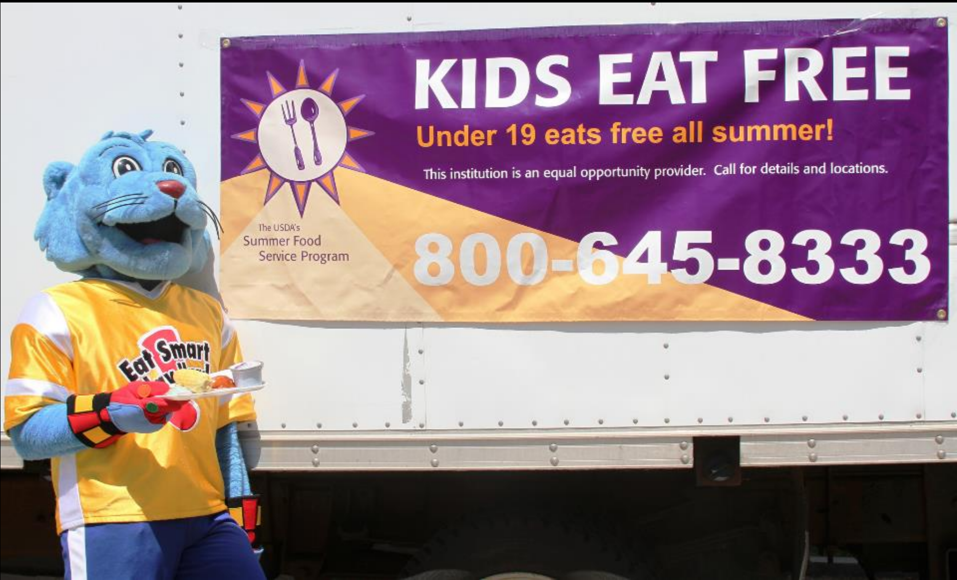
USDA Food Nutrition Summer Food Service Program -- Lila Frederick School in Dorchester, MA