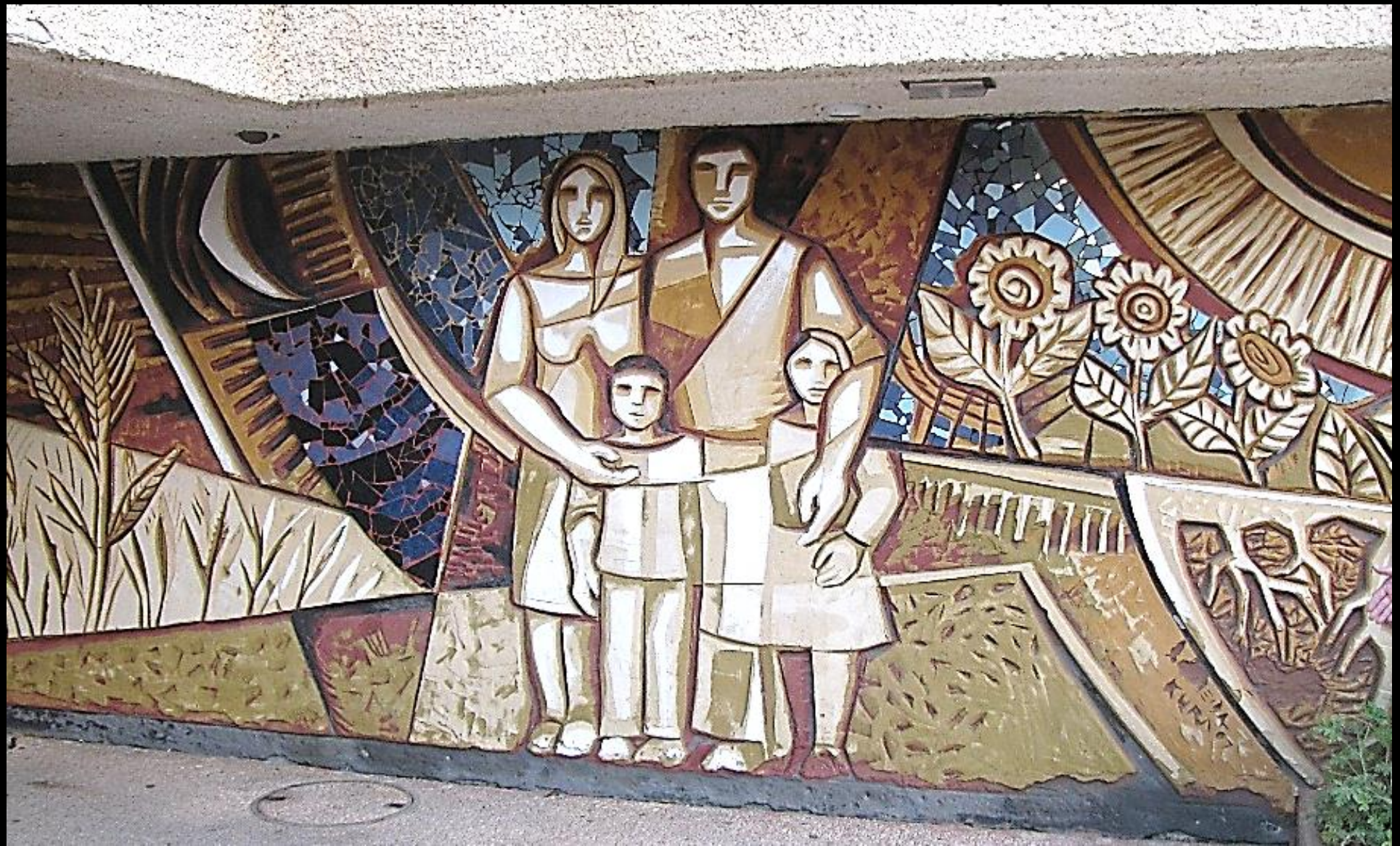
Family Mural, Kibbutz Or Haner, Israel