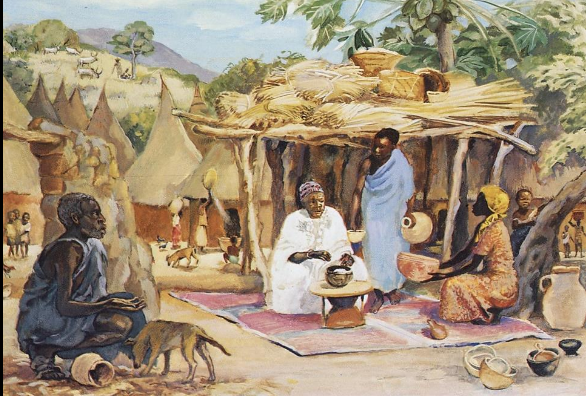
Rich Man and Lazarus -- JESUS MAFA, Cameroon