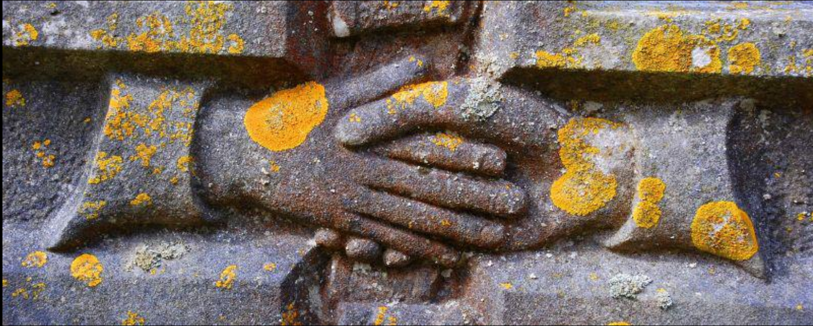
Love and Faithfulness Meet -- St. Michael's Church, Golden Grove, Wales, United Kingdom