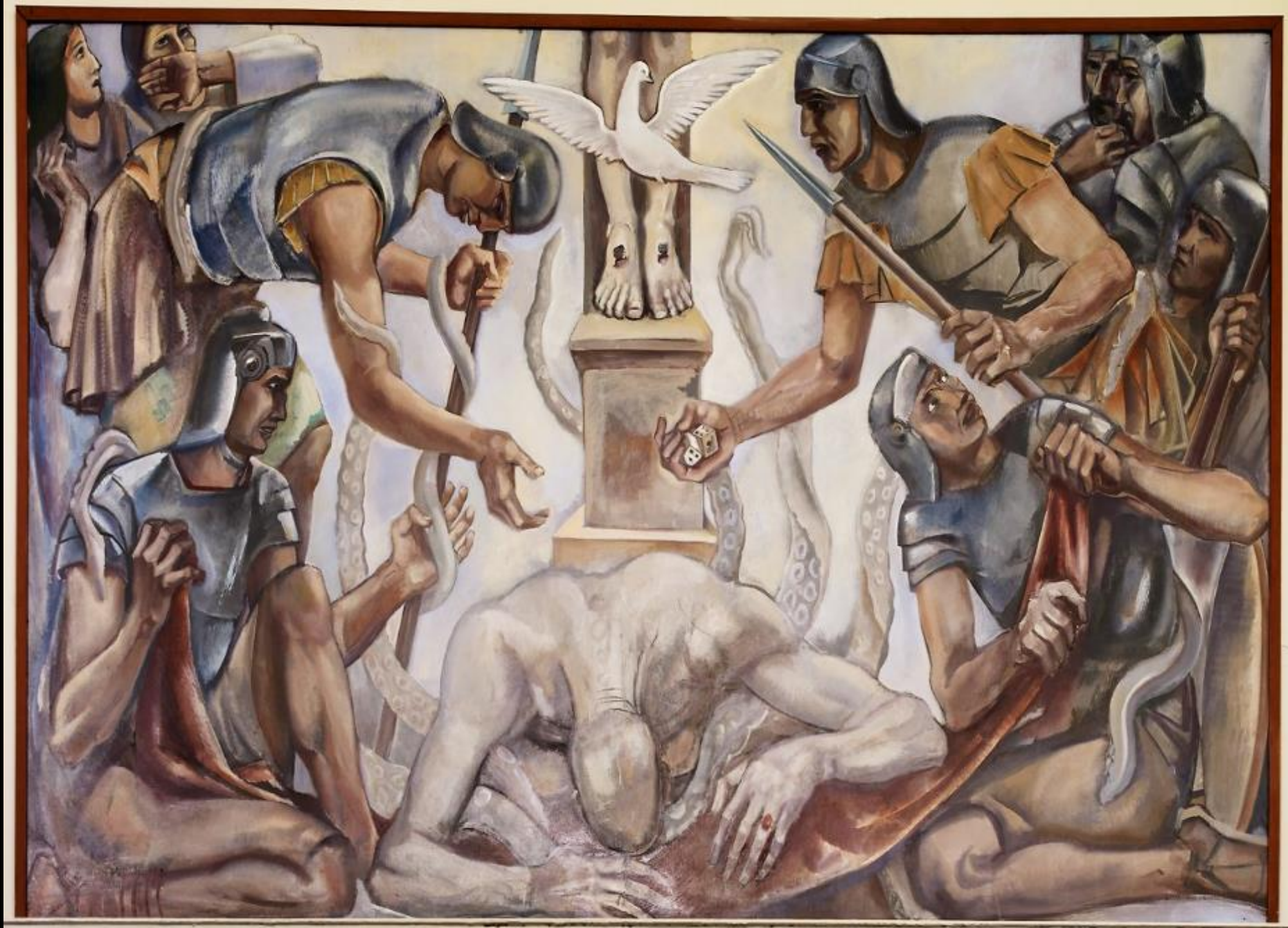
Allegory of Greed -- Mural in the Department of Justice Library, Washington, DC