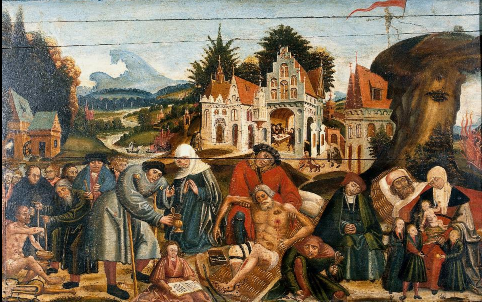
Healing Works of Mercy, with Poor Man Lazarus -- Flemish painter, c. 1550