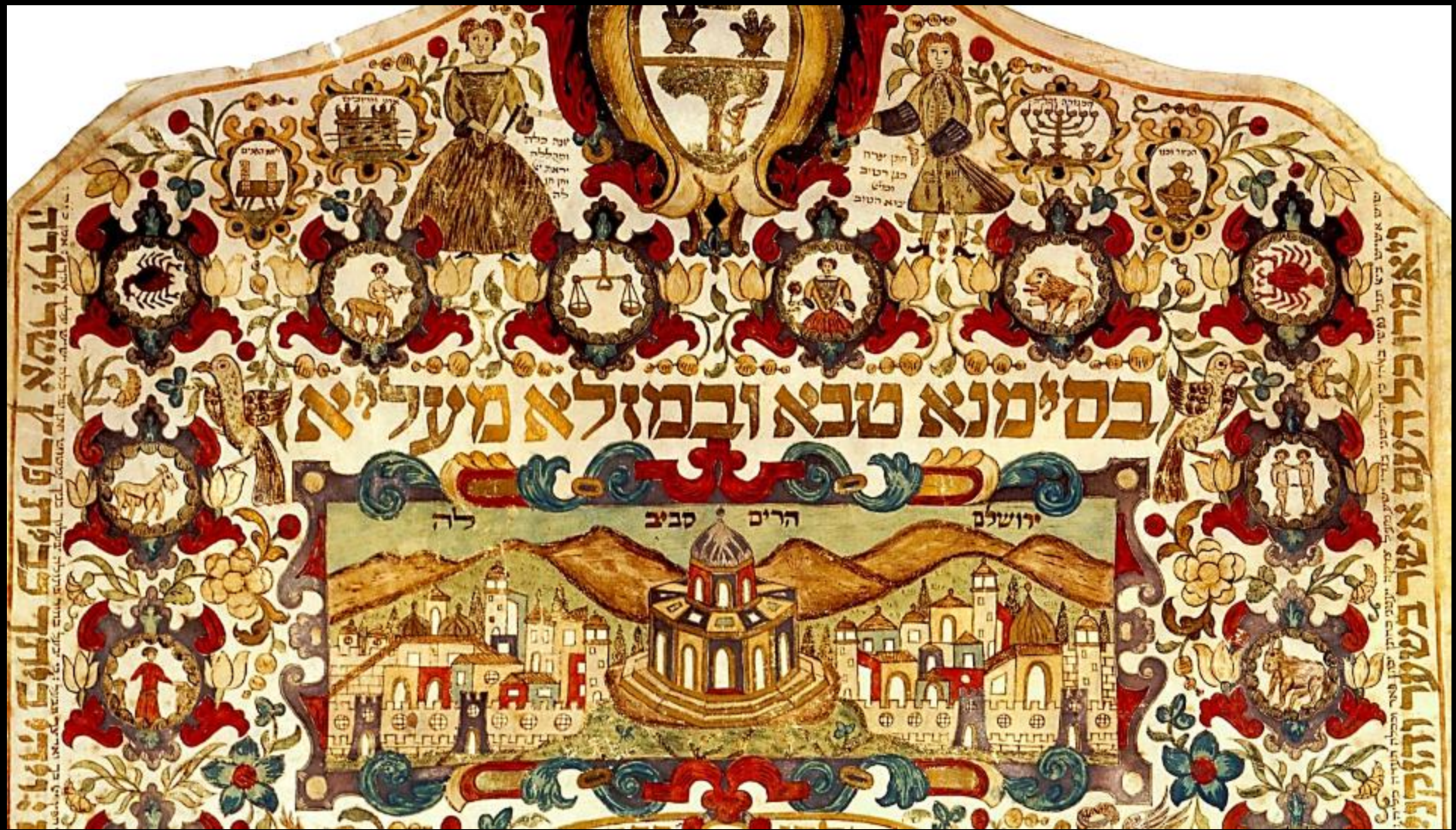
Marriage contract with a depiction of Jerusalem -- Israel Museum, Jerusalem