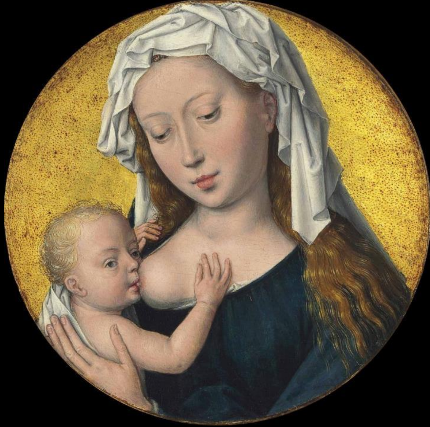
Madonna Lactans, or the Nursing Madonna