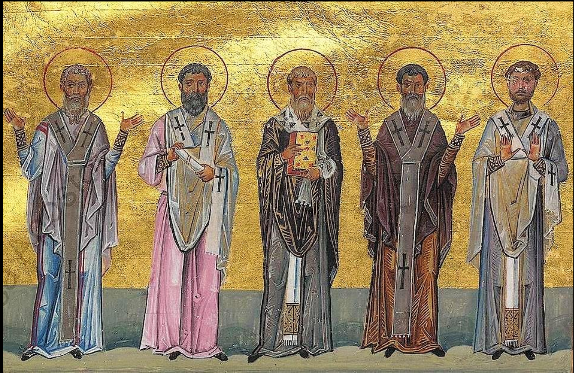
Patrobulus, Hermas, Linus, Caius, and Philologus of the 70 Disciples from the Menologion of Basil II