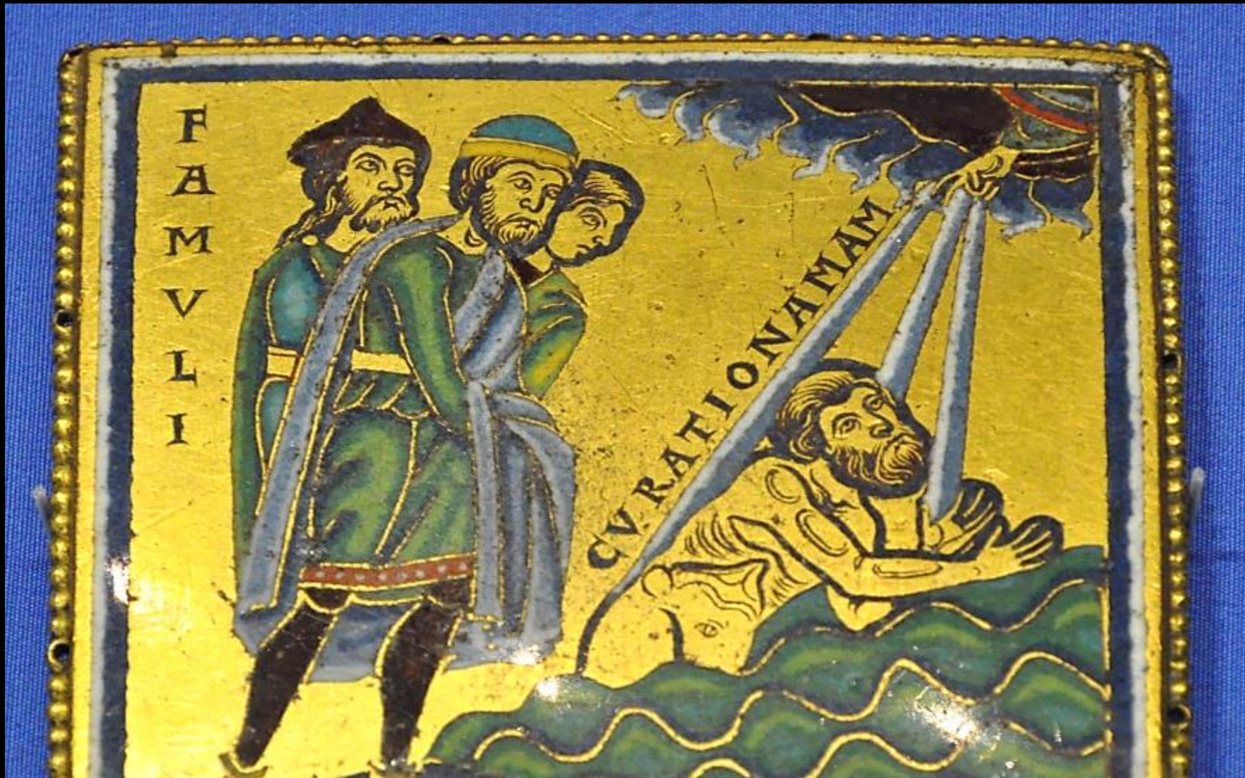
Naaman Bathing in the Jordan -- champlevé enamel, c. 1150, British Museum, London, England