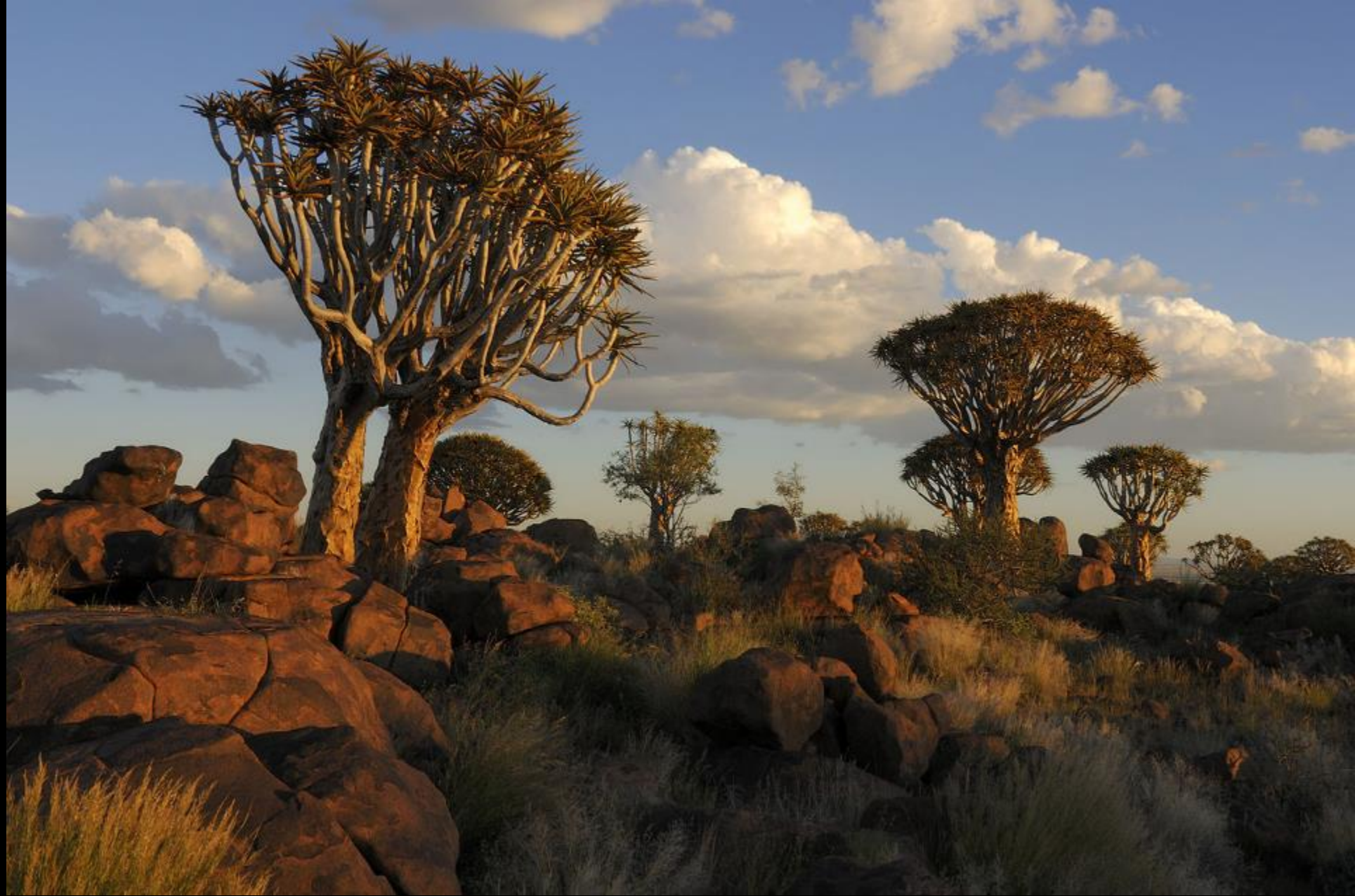
Quiver Tree Forest near Keetmanshoop, Namibia, in the evening