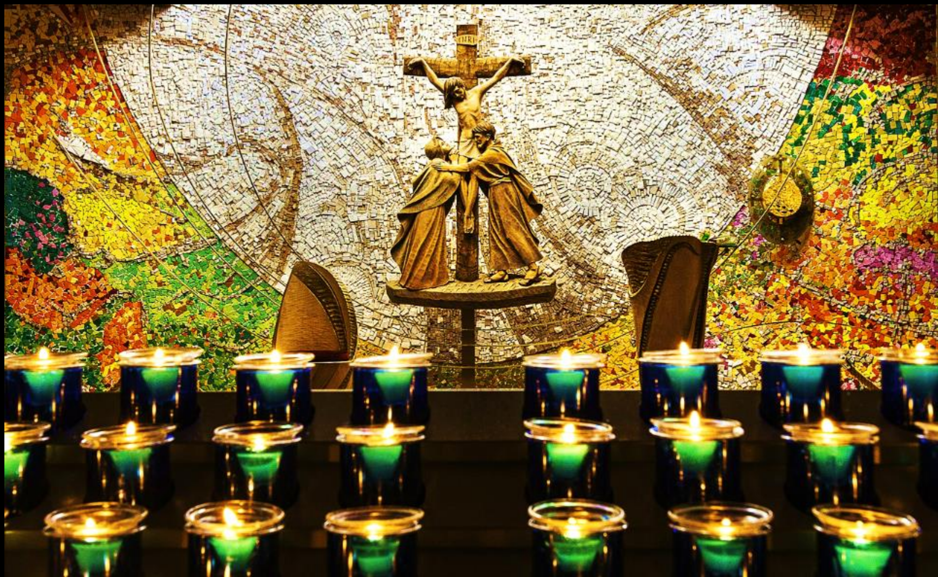
Mosaic in Chapel of Reconciliation -- Knock, County Mayo, Ireland