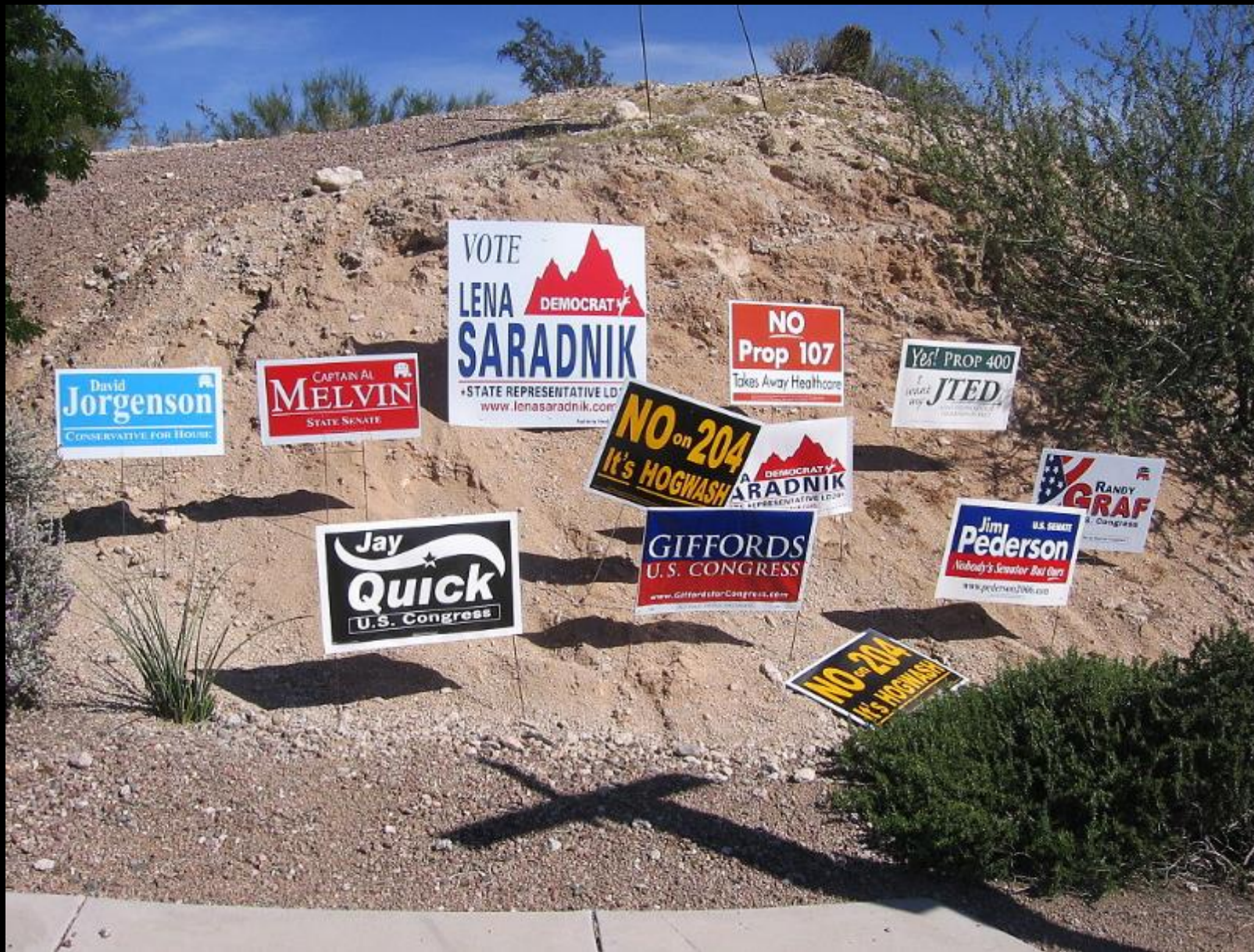
Arizona 8th district campaign signs, 2008