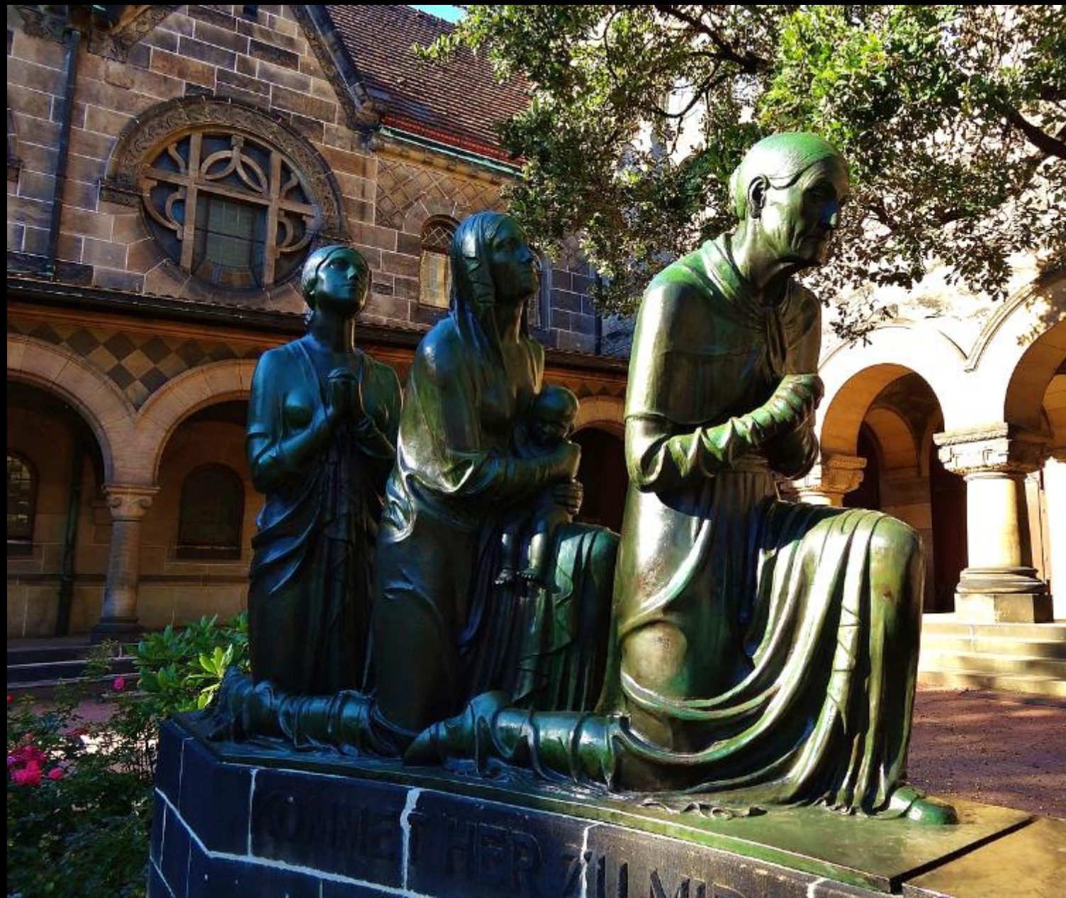
Prayers for Reconciliation (after WWII Bombings) -- Reconciliation Church, Dresden, Germany