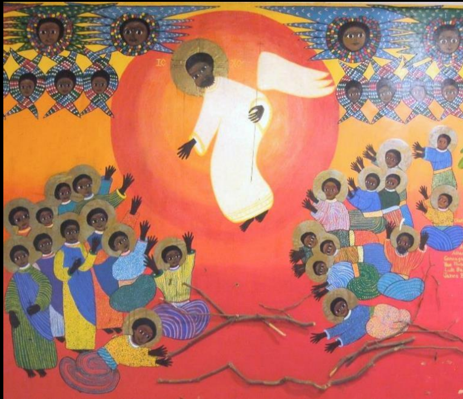
Christ's Ascension -- Emmaus House Martyrs of Uganda, Kamapala, Uganda