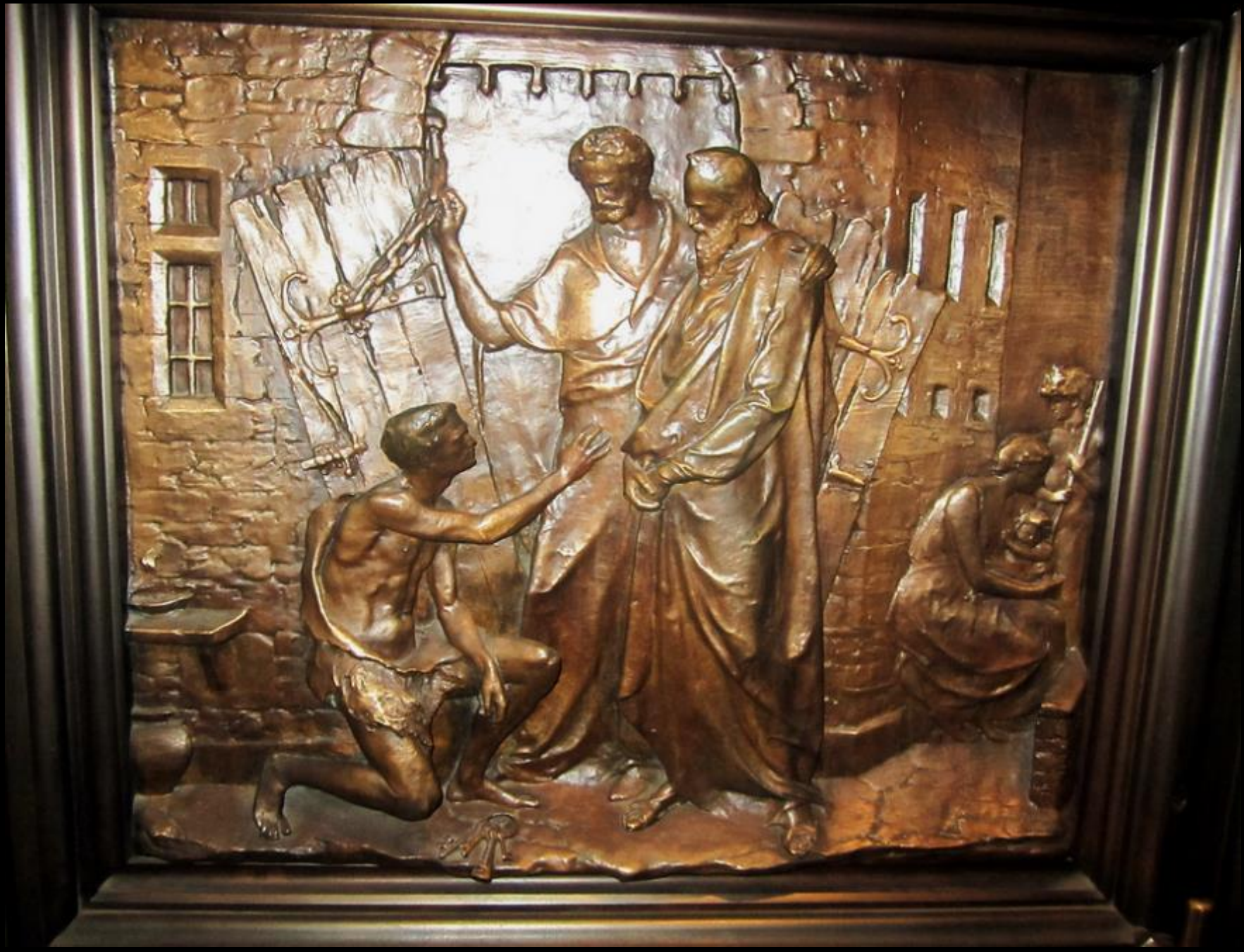
The Jailer, Paul, Silas, and the Jailer's Family -- Bronze doors, Trinity Church, New York, NY