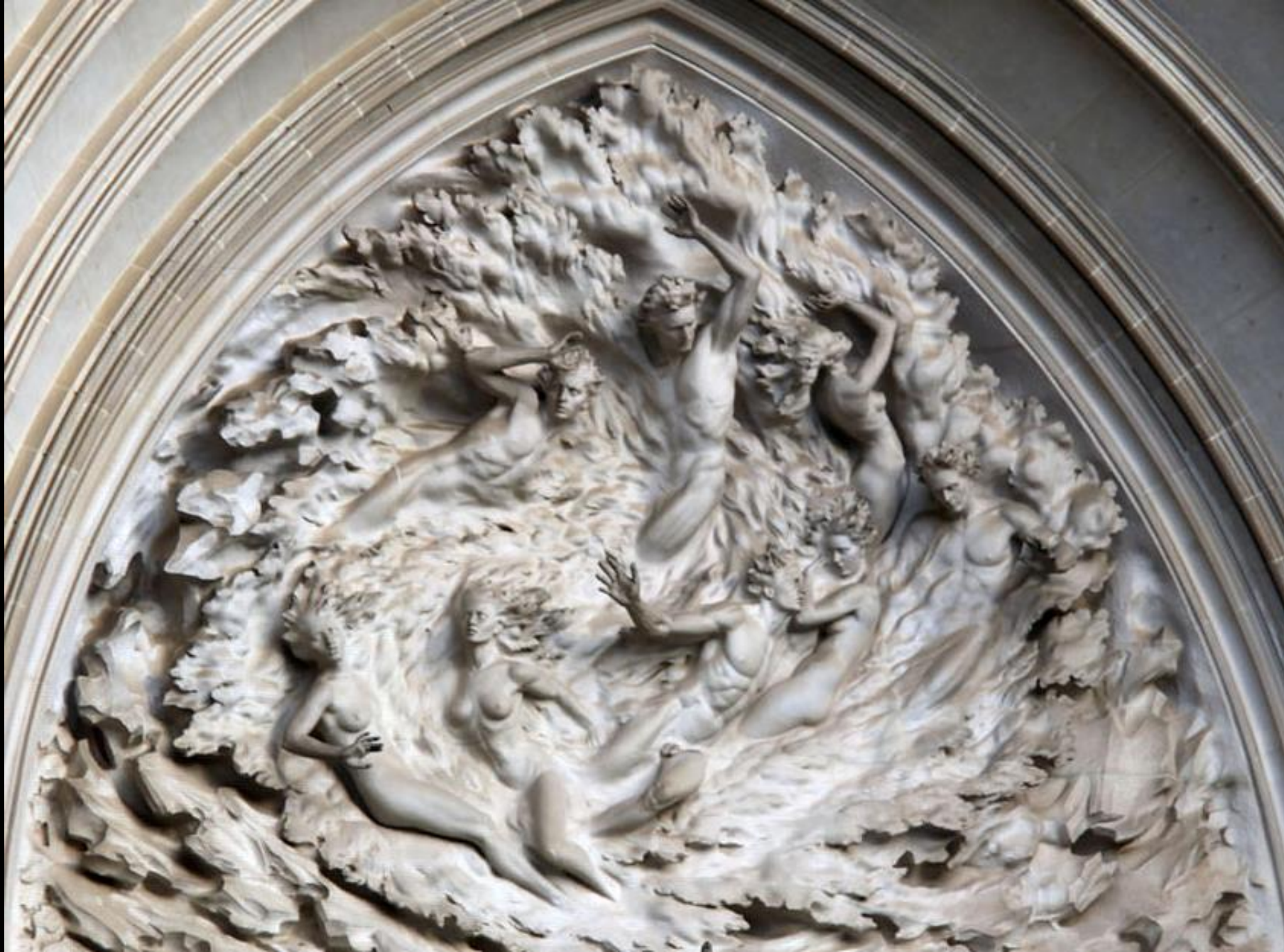
"Out of Nothing" – The Creation of Humankind -- Frederick Hart, Washington National Cathedral, DC