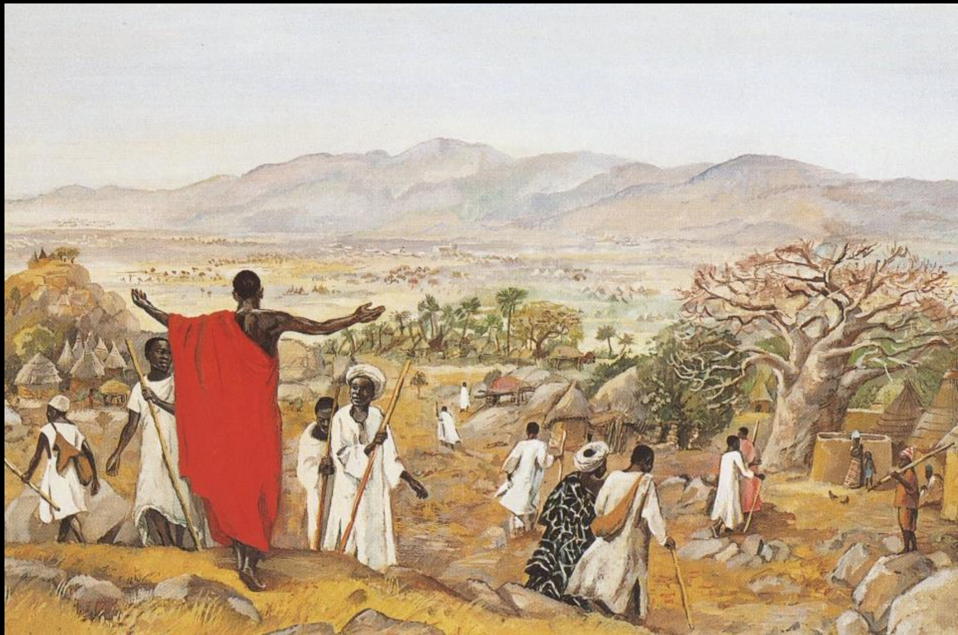
Mission to the World -- JESUS MAFA, Cameroon