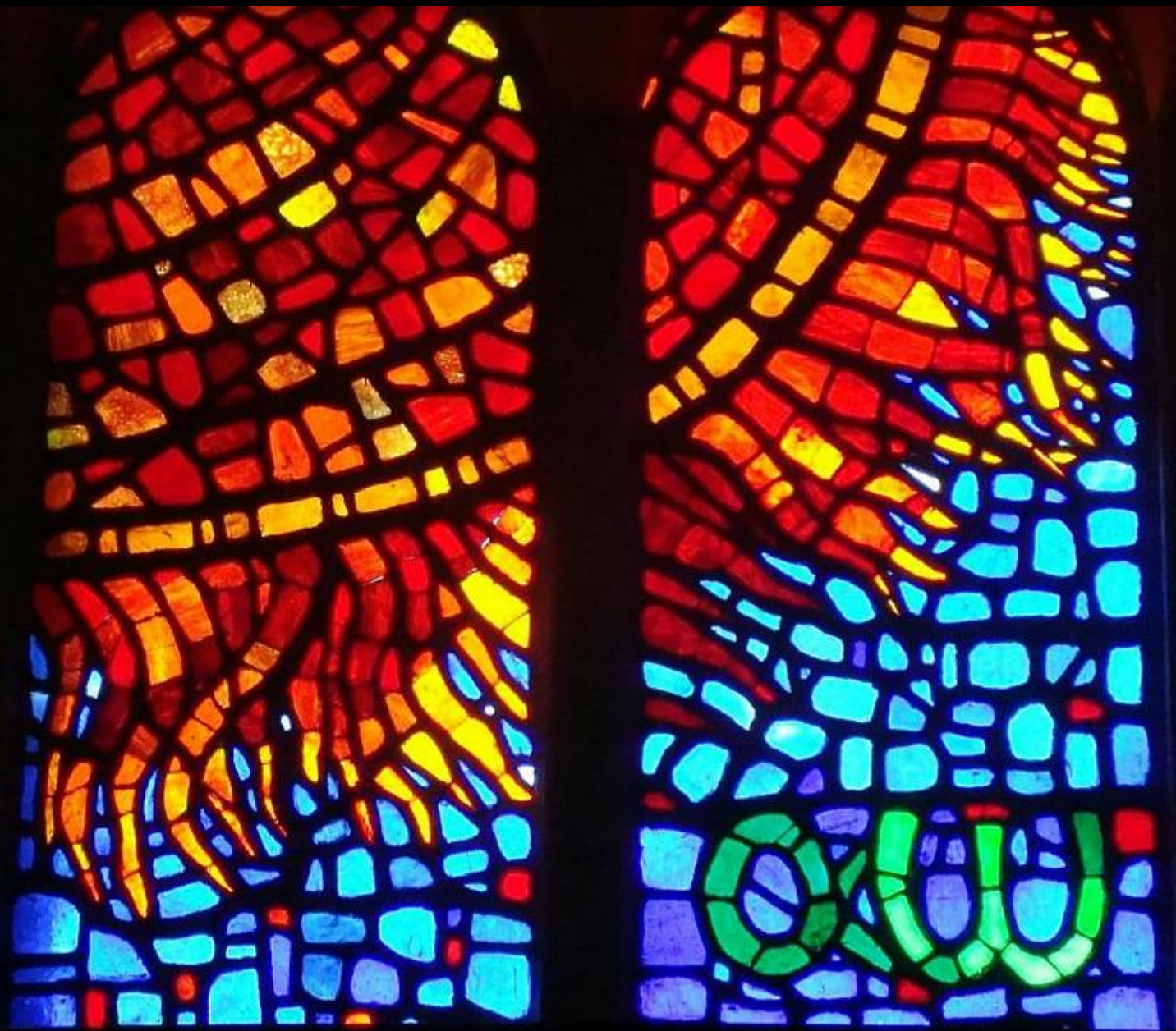
Alpha and Omega -- Saints Kings Church, Mexico City, Mexico