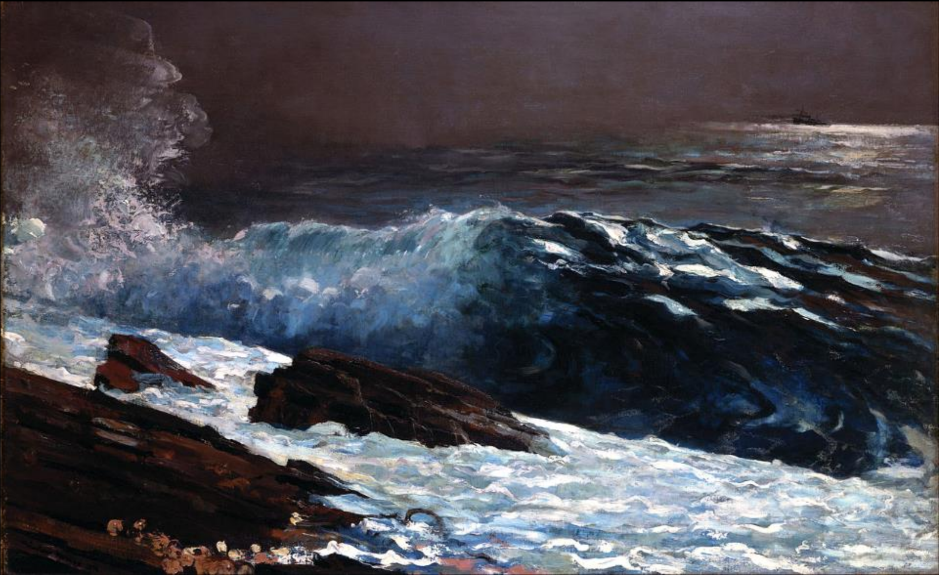
Sunlight Appears on the Coast -- Winslow Homer, Toledo Museum of Art, Toledo, OH