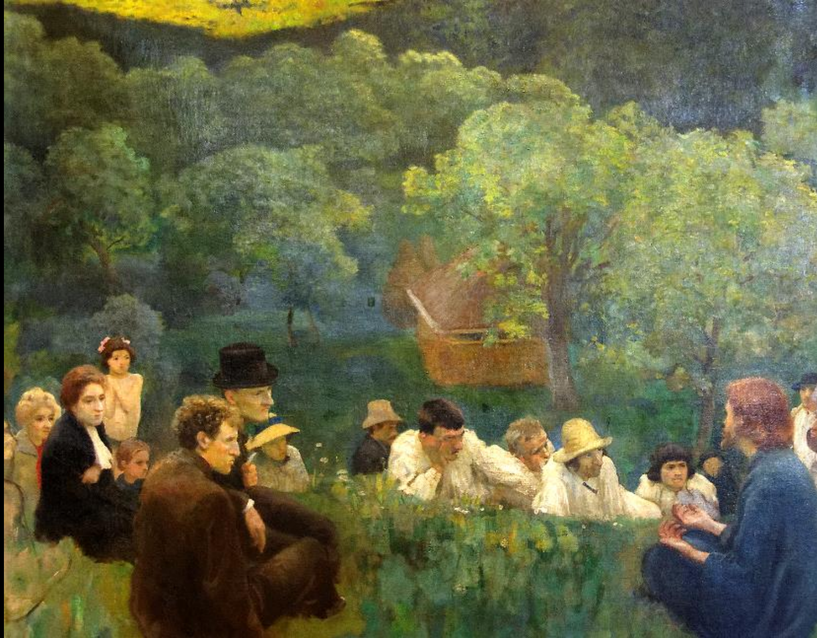
Sermon on the Mount -- Karoly Ferenczy, Hungarian National Gallery, Budapest, Hungary