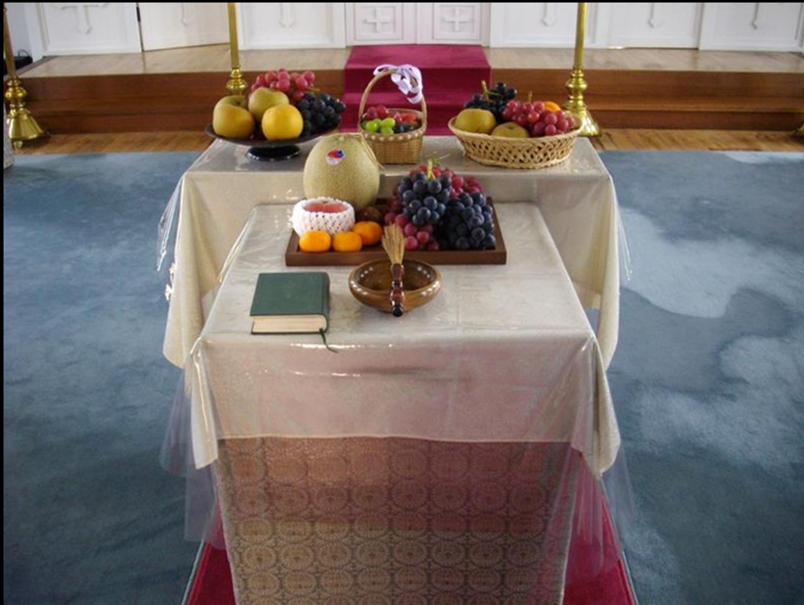
Blessing of the First Fruits -- Holy Resurrection Cathedral, Tokyo, Japan