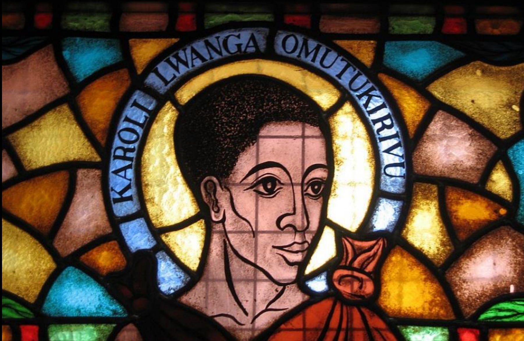
Karl Lwanga -- Basilica of the Ugandan Martyrs, Kampala, Uganda