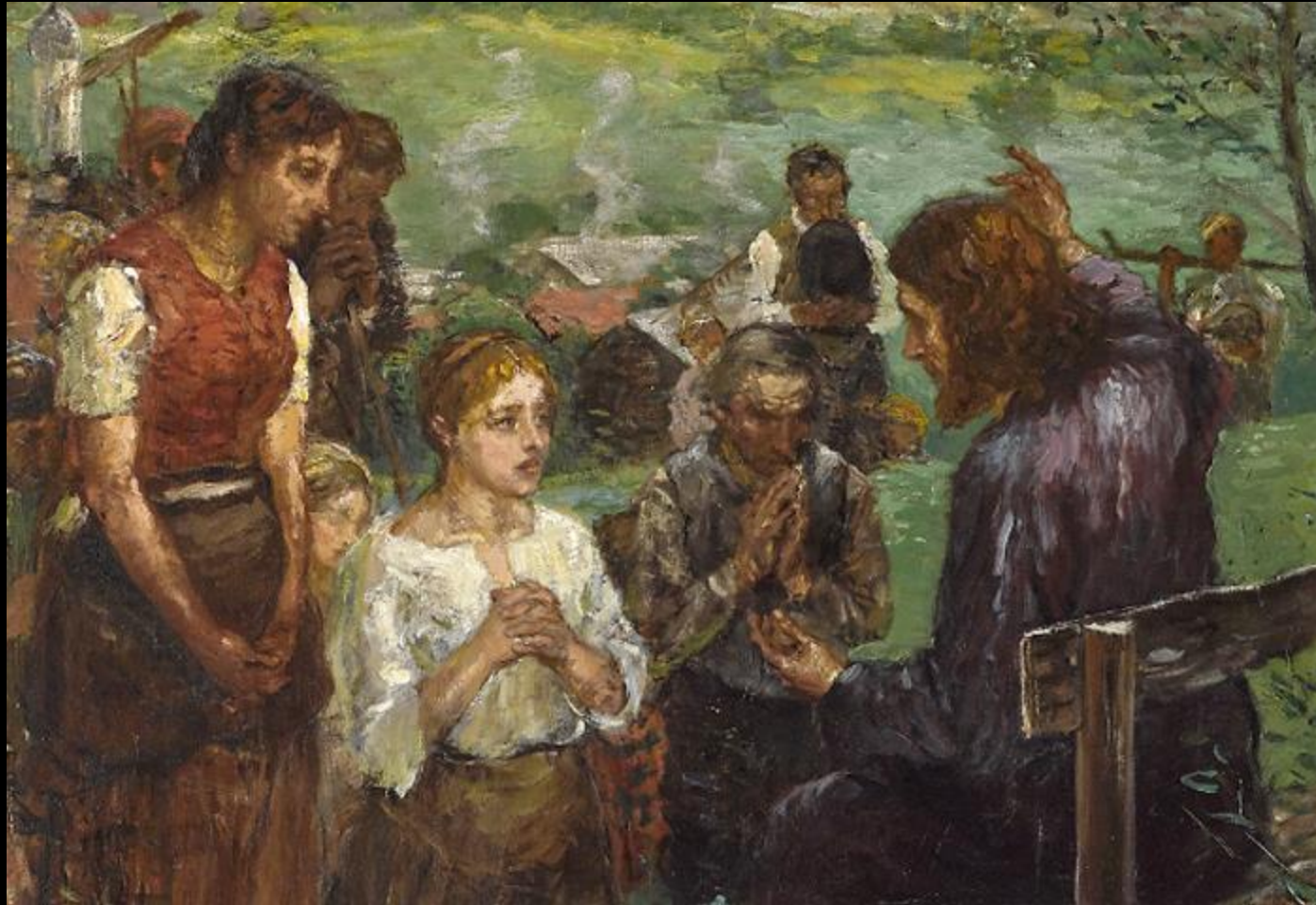
The Sermon -- Fritz von Uhde, Museum of Fine Arts, Budapest, Hungary