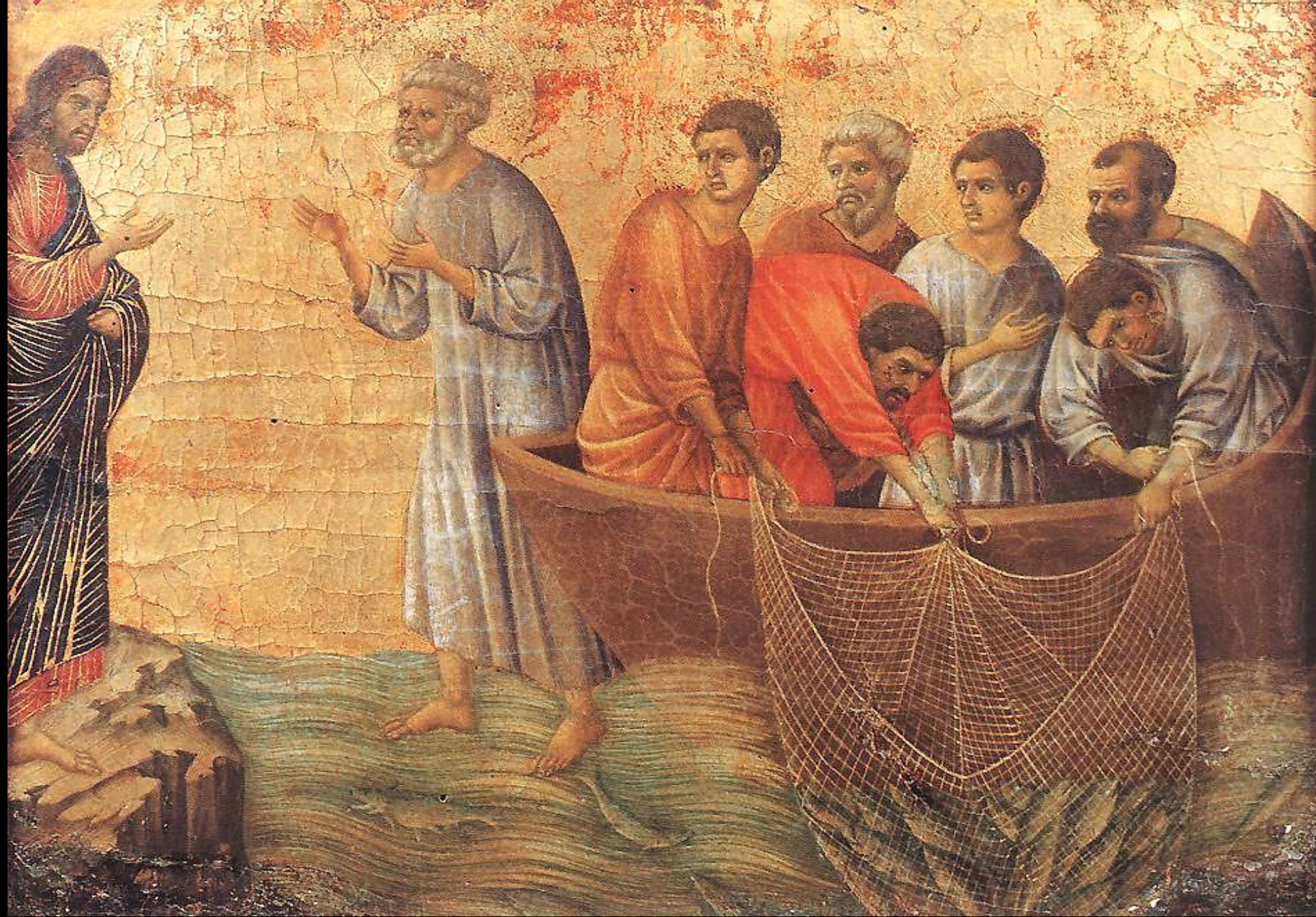
Appearance on Lake Tiberias -- Duccio, Museo dell'Opera del Duomo, Siena, Italy