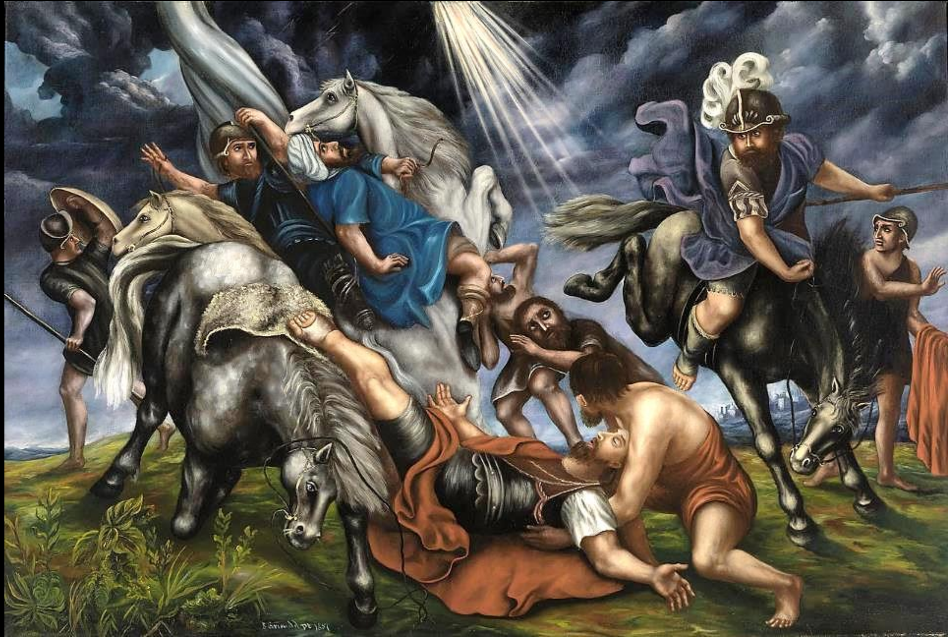
Conversion of Saul -- Simeon Griswold, Smithsonian Museum of American Art, Washington, DC