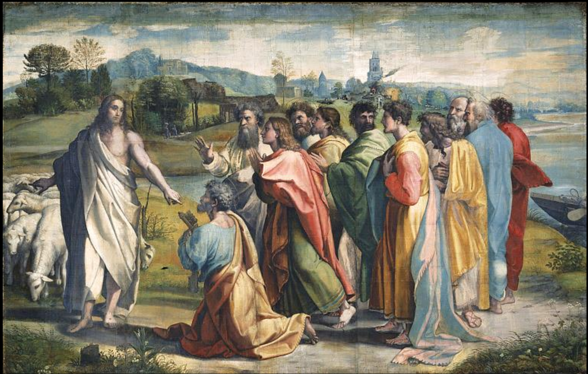
Christ's Charge to Peter to Feed his Sheep -- Raphael, Victoria and Albert Museum, London