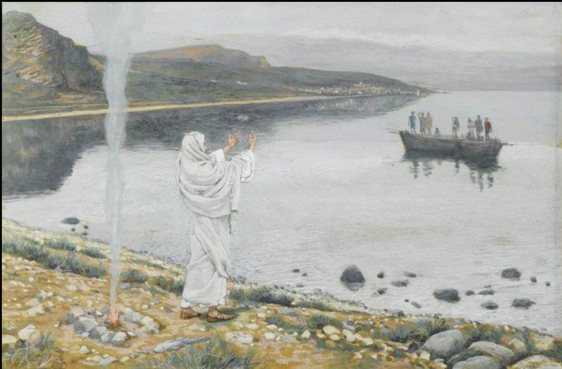
Christ Appears on the Shore of Lake Tiberias -- James Tissot, Brooklyn Museum of Art, New York, NY