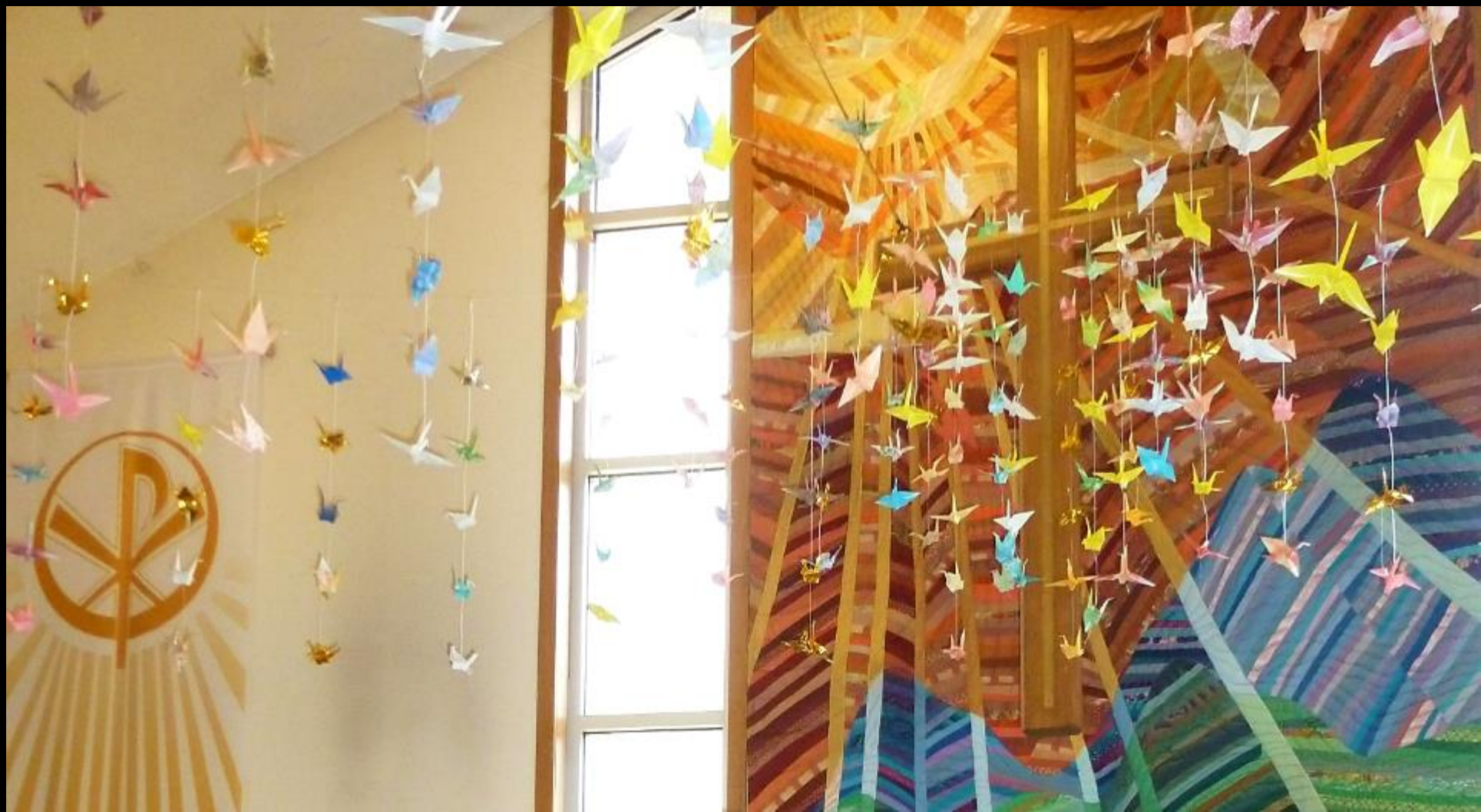
1200 Cranes, Korean Tradition -- King of Kings Lutheran Church, Ann Arbor, MI