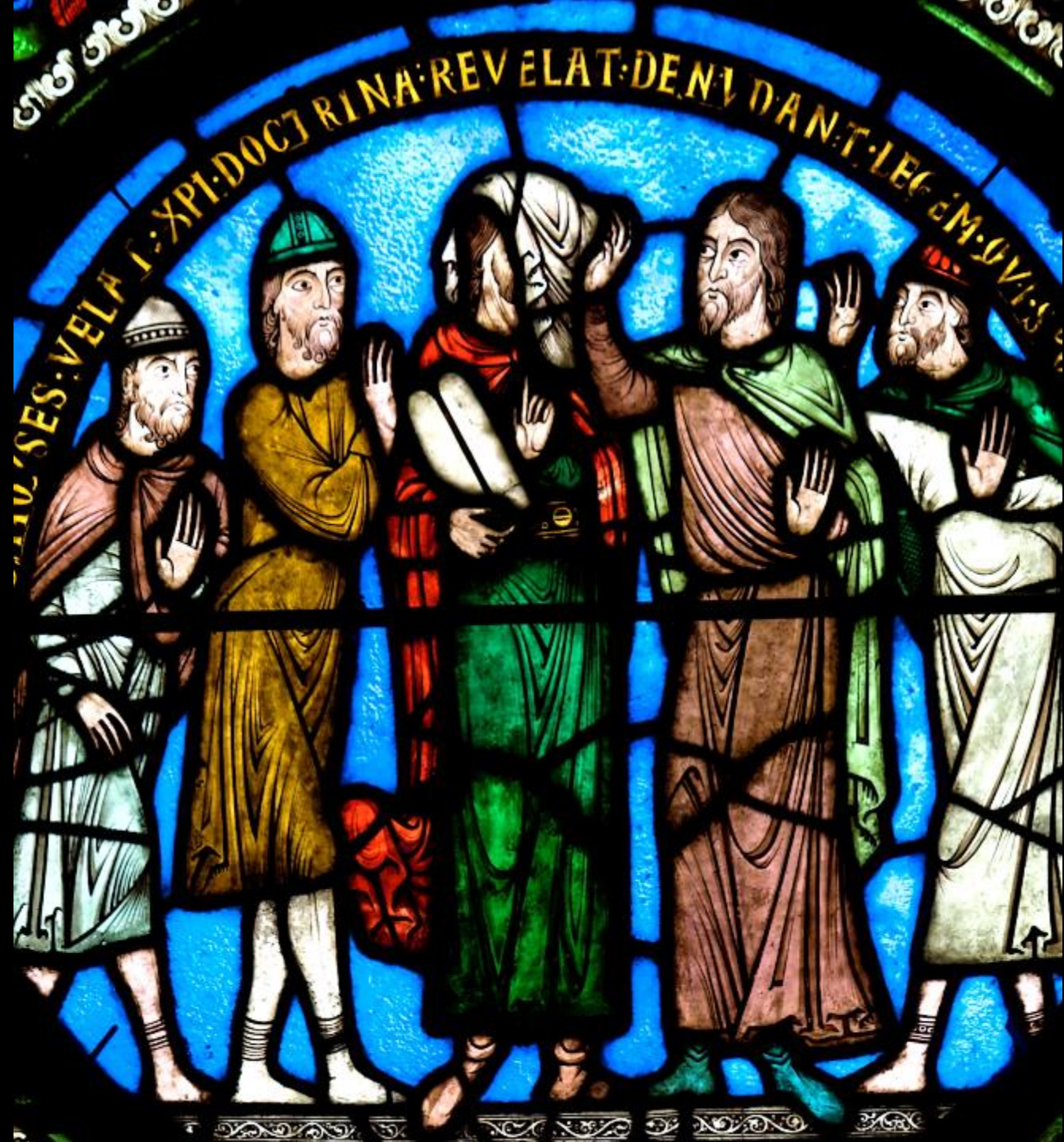
Moses with the Law and the Veil