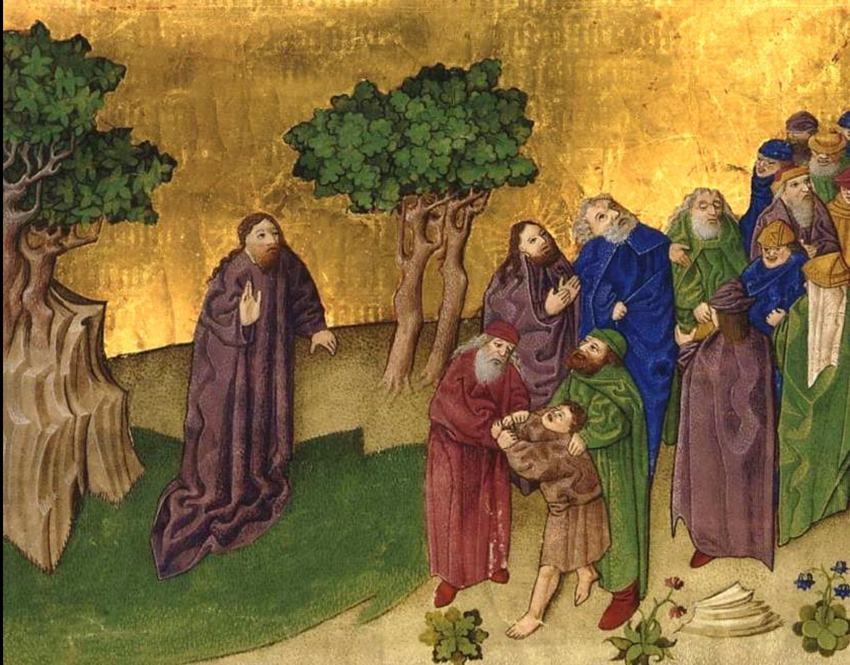
The Healing of the Demon-possessed Boy -- Ottheinrich Bible, Bavarian State Library, Munich, Germany