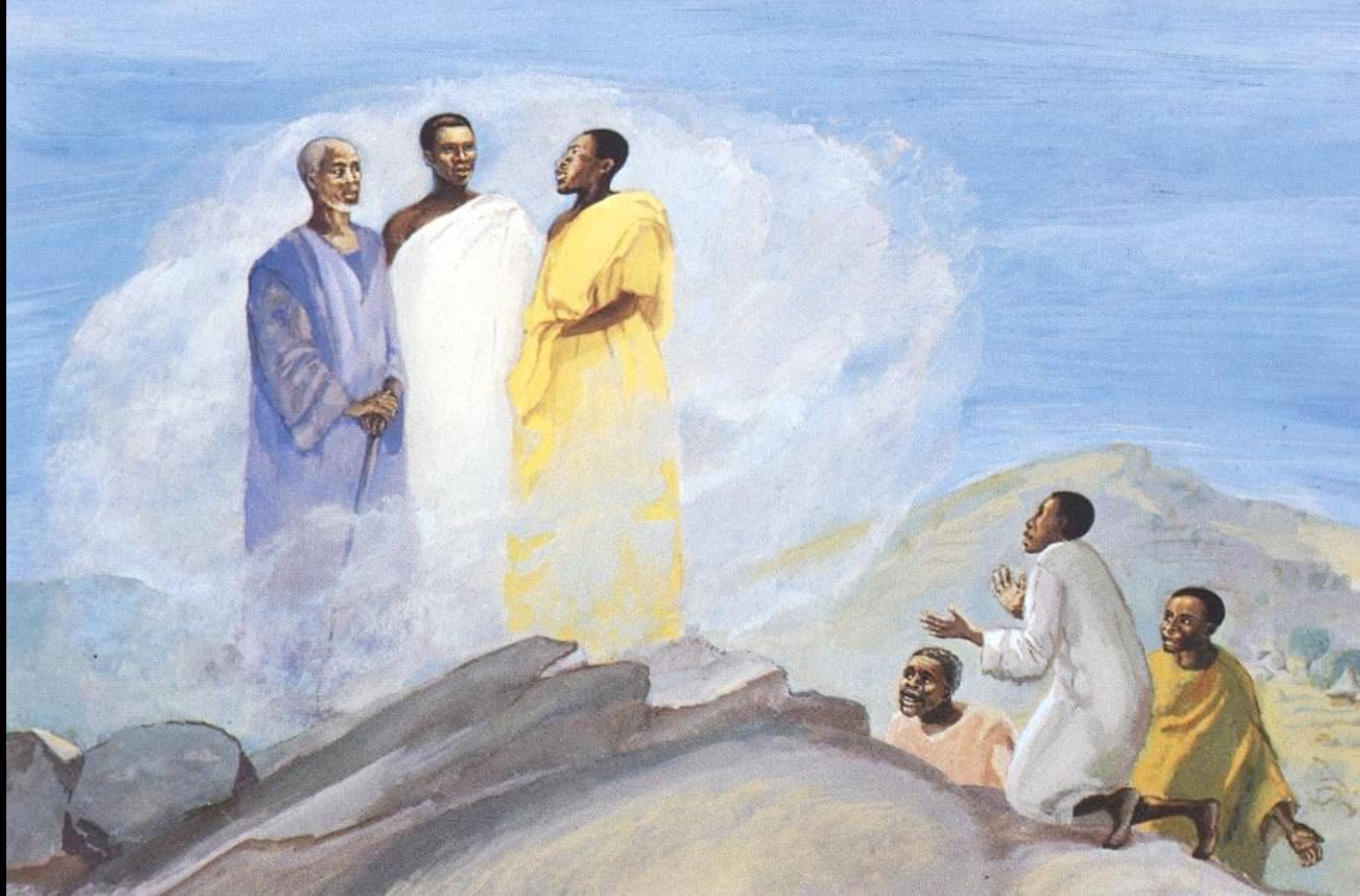
Transfiguration -- JESUS MAFA, Cameroon