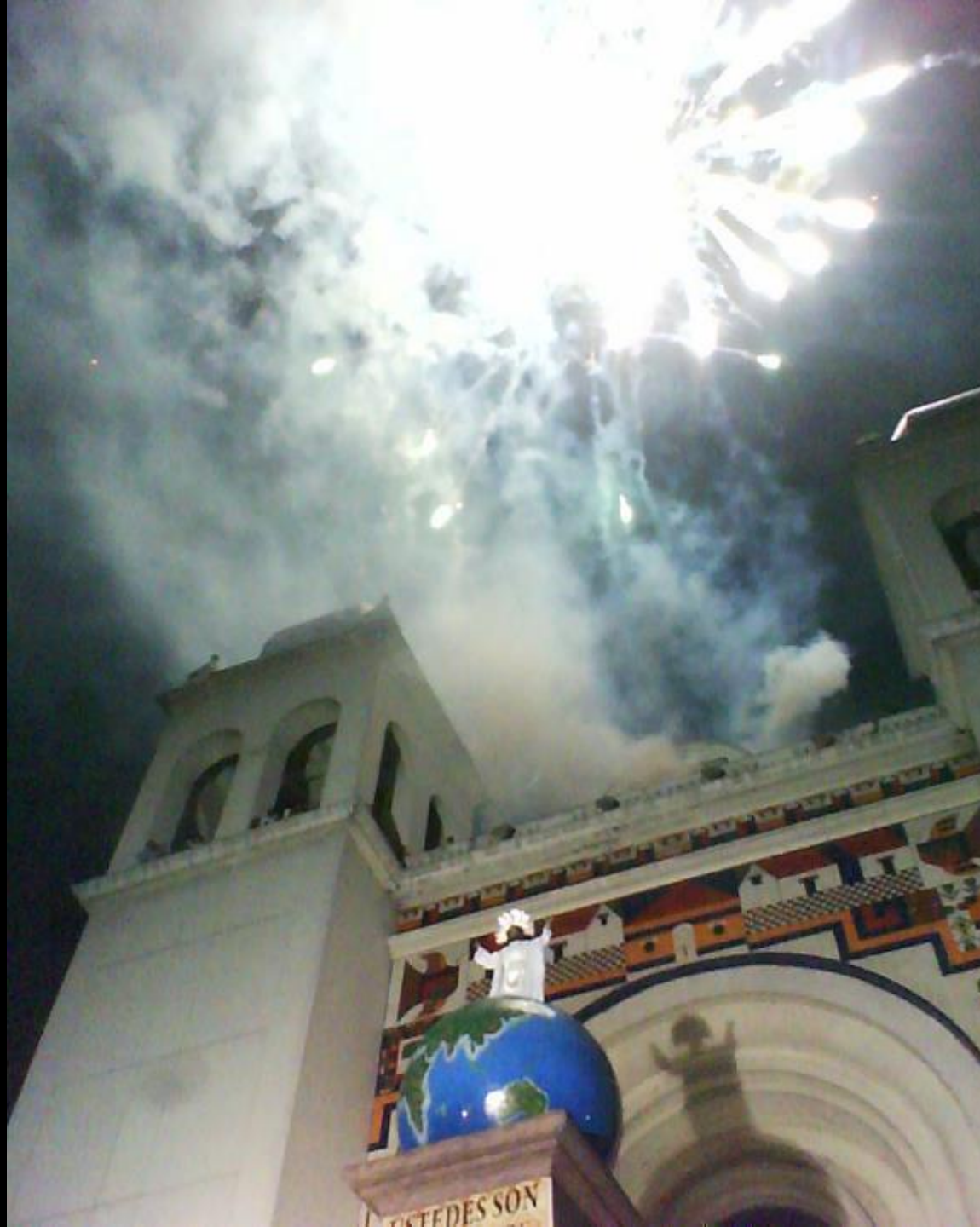
Transfiguration Metropolitan Cathedral San Salvador, El Salvador