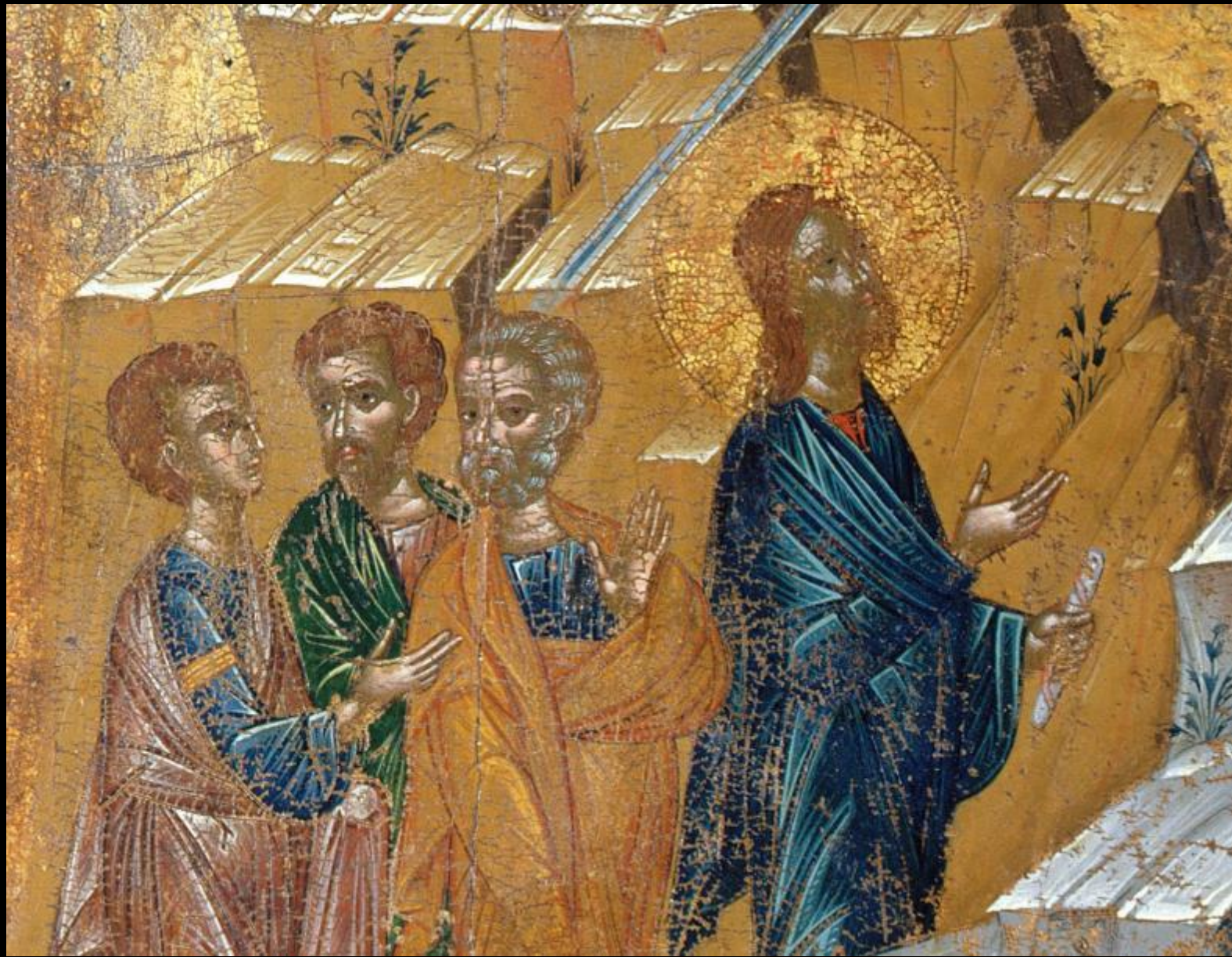
Transfiguration of Christ, detail -- Early 17 th c. Icon, Benaki Museum, Athens, Greece