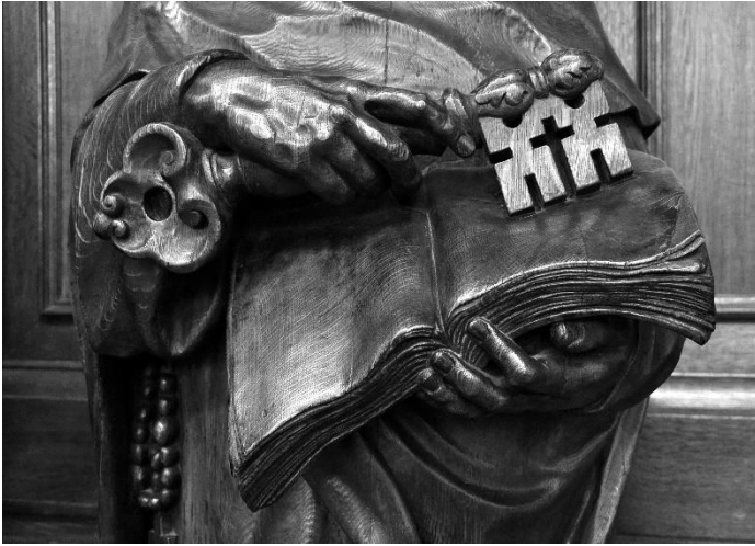
Peter's Hands with Bible and Key, Wood carving, detail, Sint-Pauluskerk, Antwerp, Belgium, 17 th century.