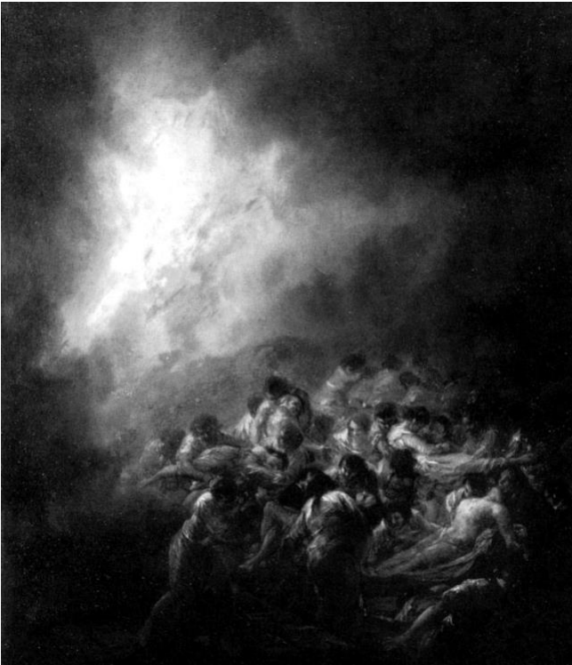
FIRE BY NIGHT, Francisco de Goya, Collection Varez Jose, San Sebastian, Spain, 1793

Luke 12:49-56 "I came to bring fire to the earth, and how I wish it were already kindled! I have a baptism with which to be baptized, and what stress I am under until it is completed! Do you think that I have come to bring peace to the earth? No, I tell you, but rather division! From now on five in one household will be divided, three against two and two against three; they will be divided: father against son and son against father, mother against daughter and daughter against mother, mother-in-law against her daughter-in-law and daughter-in-law against mother-in-law." He also said to the crowds, "When you see a cloud rising in the west, you immediately say, 'It is going to rain'; and so it happens. And when you see the south wind blowing, you say, 'There will be scorching heat'; and it happens. You hypocrites! You know how to interpret the appearance of earth and sky, but why do you not know how to interpret the present time?"