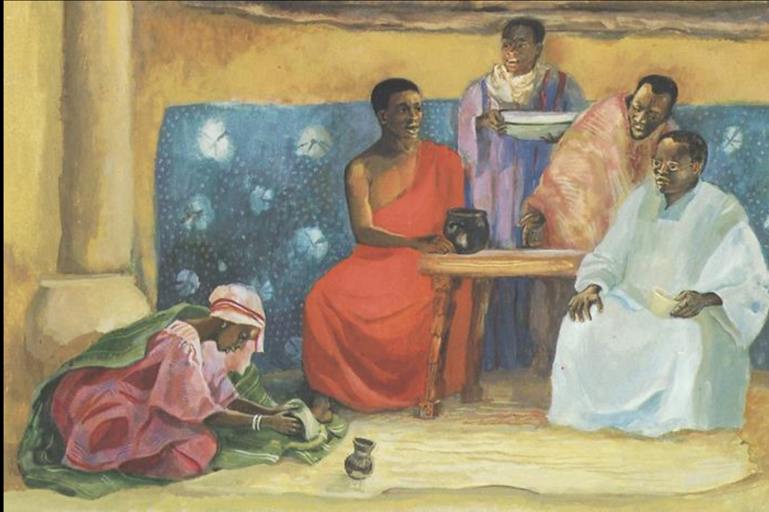
Anointing of Jesus' Feet -- JESUS MAFA, Cameroon