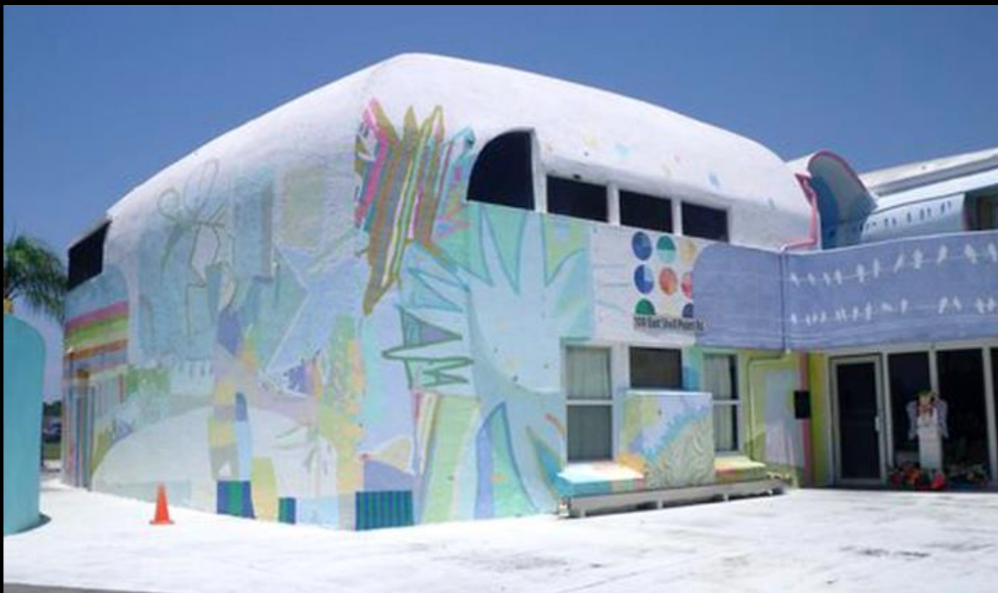
Mary and Martha House -- Domestic Violence Homeless Shelter for Women in Ruskin, FL