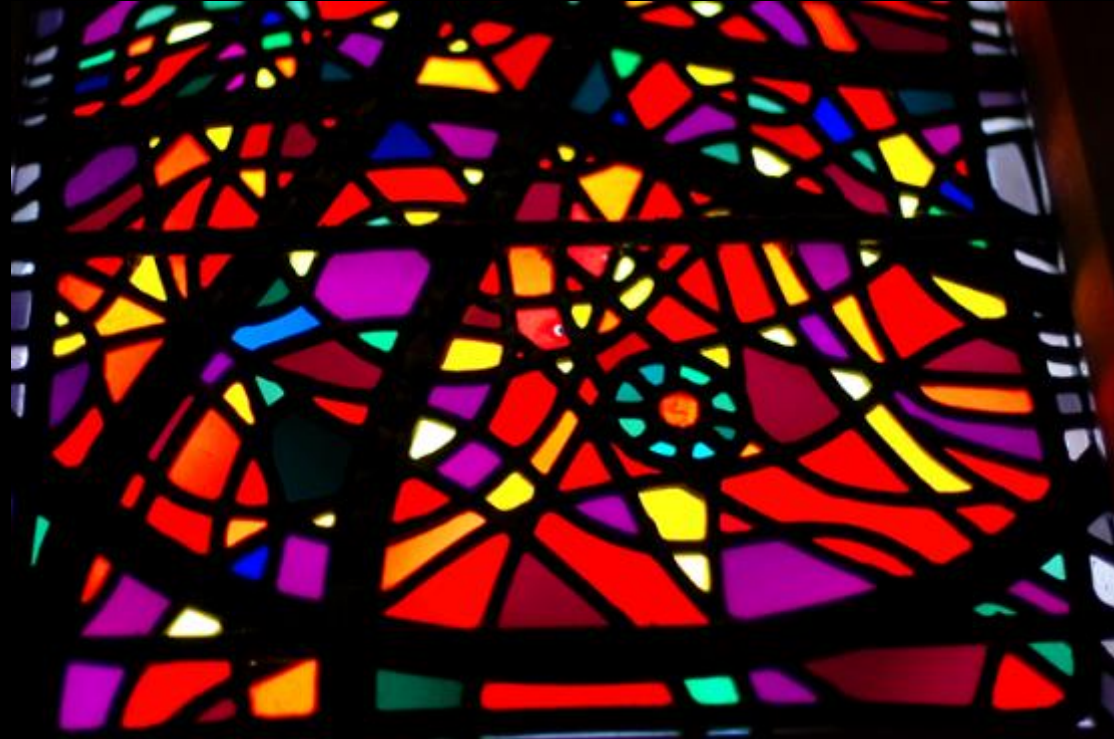
Light and Color -- Washington National Cathedral, Washington, DC