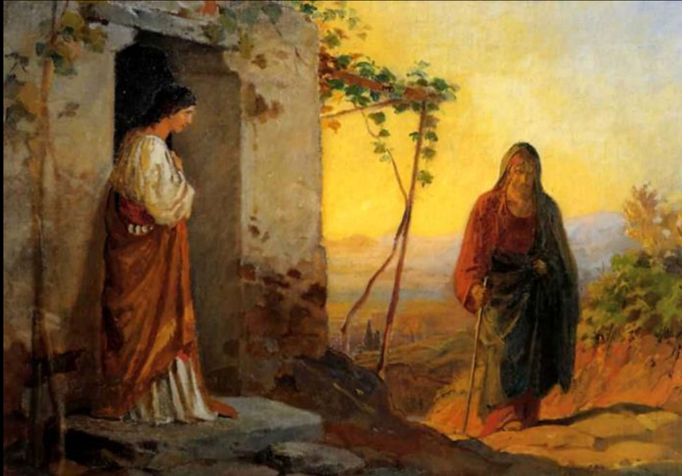
Mary Greets Jesus -- Nikolas Ge