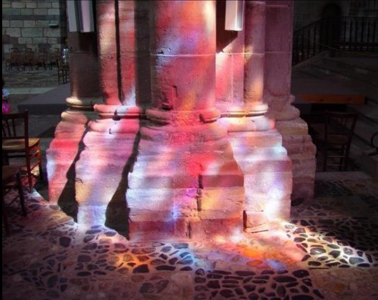
Interior Light -- Saint-Julien, Brioude, France