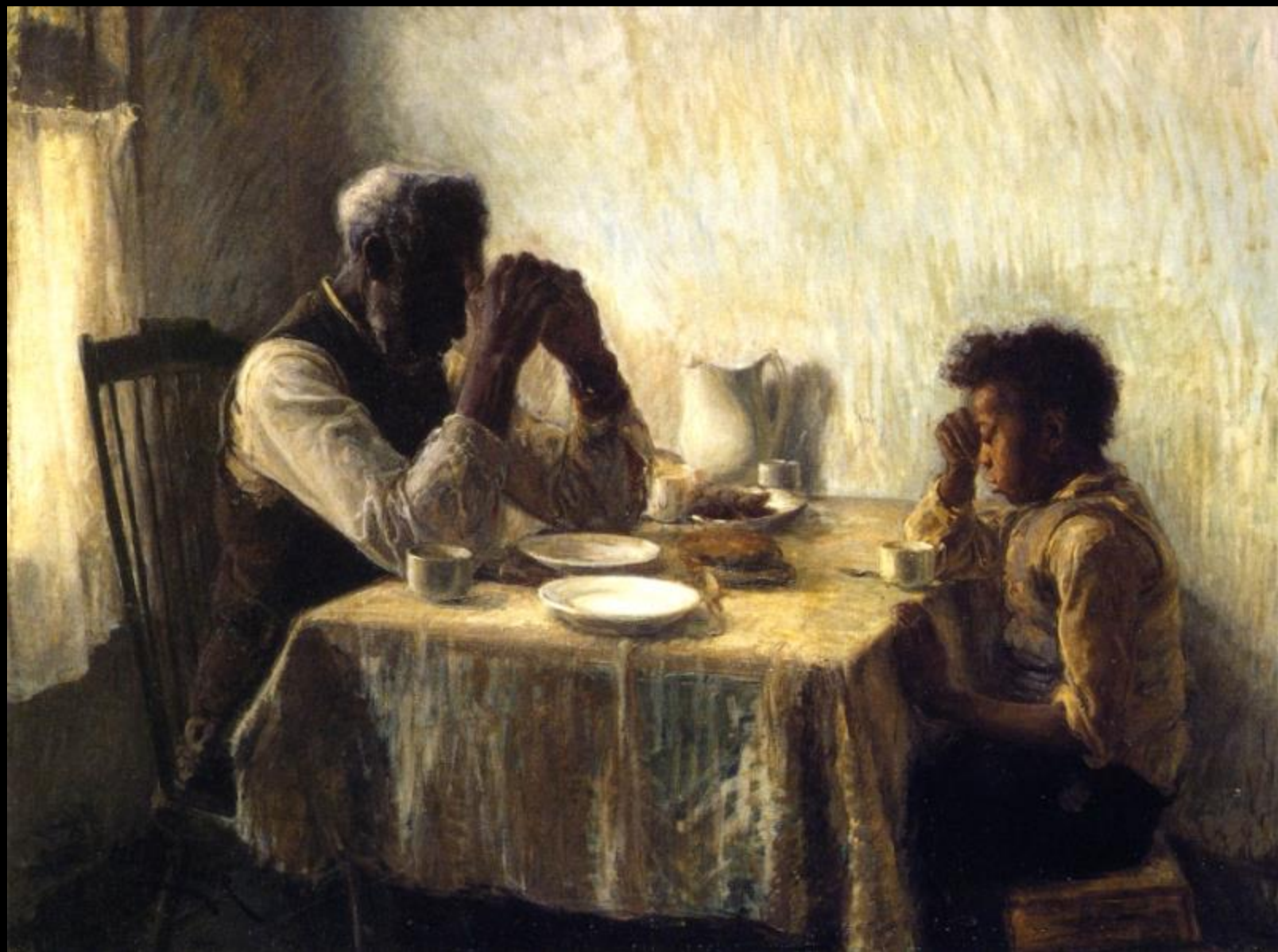
Giving Thanks -- Henry Ossawa Tanner